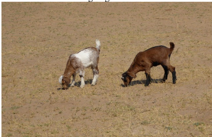
The goats are feeding on what they can find.