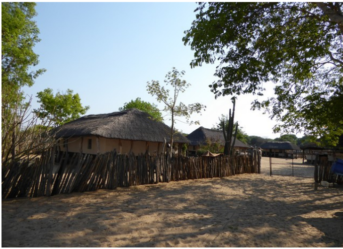
Here we came to the village we were visiting. The driver notified the chief that we had come.