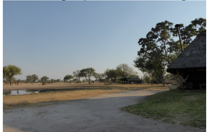
There is a water hole not far from the lodge. It is drilled a hole 60m into the ground, where there is water. A diesel driven pump pumps the water up.