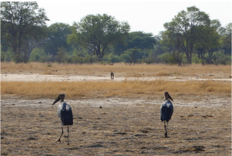
They also went away when we arrived.