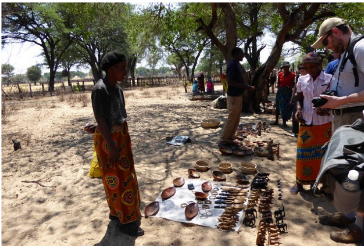
The hoped that we would buy something.