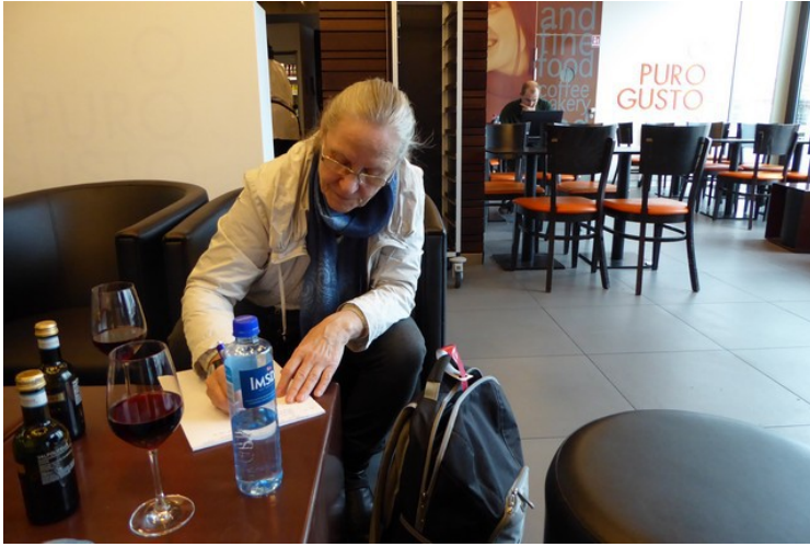
In Frankfurt there was a long waiting time. We were sitting a few hours at this cafe.