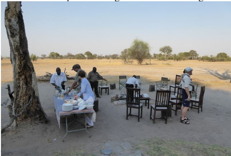
Breakfast was served outside by the fire.