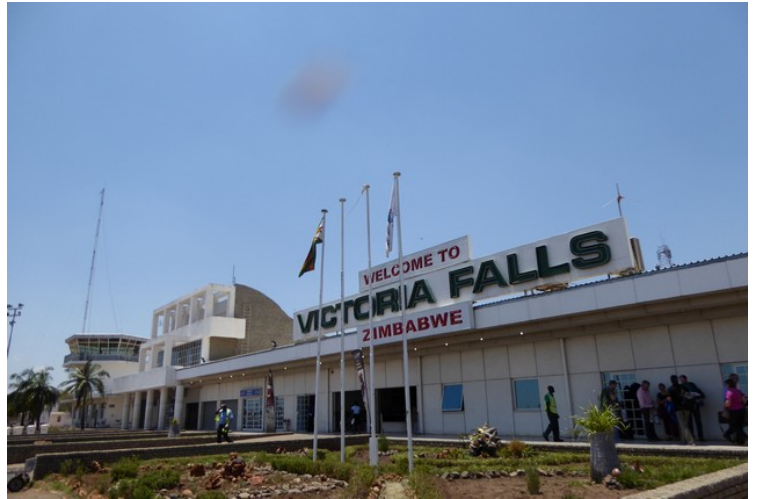
At midday, day 2, we have arrived at the last airport after a flight from Frankfurt at approximately 10 hours during the night + half an hour flight from Johannesburg.