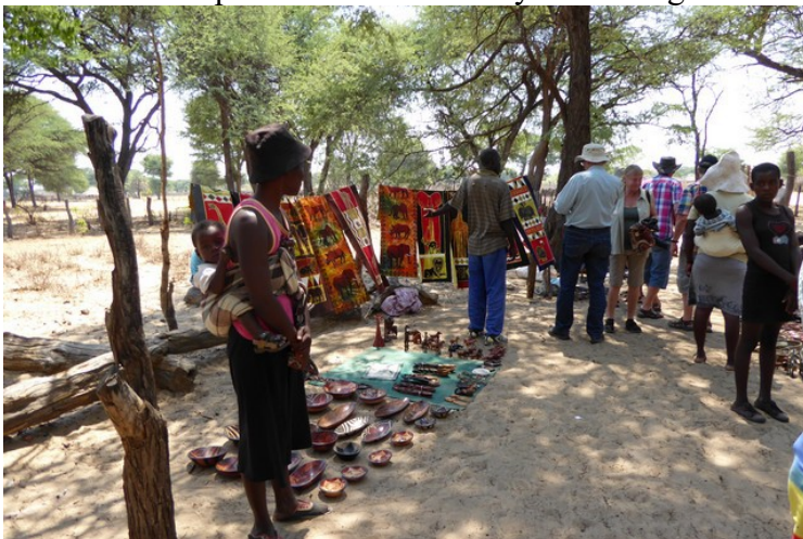
Many of us bought something.