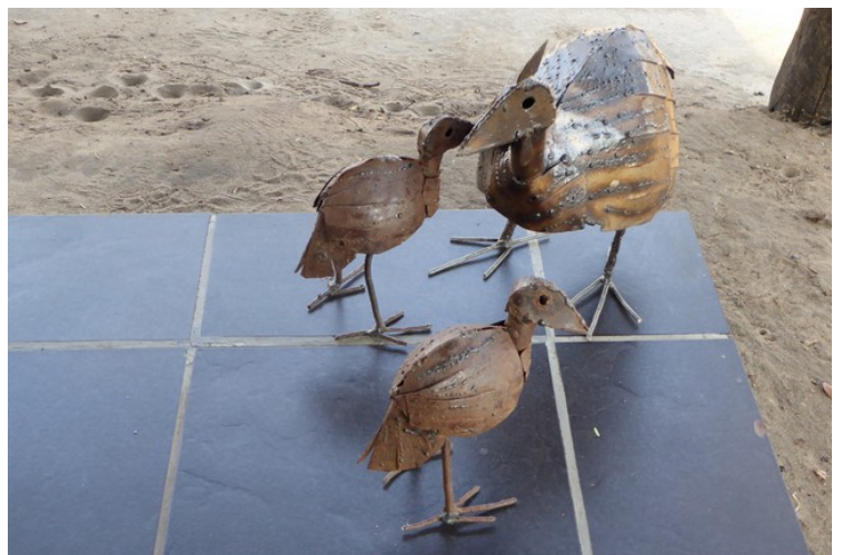
There are metal birds on the corner.