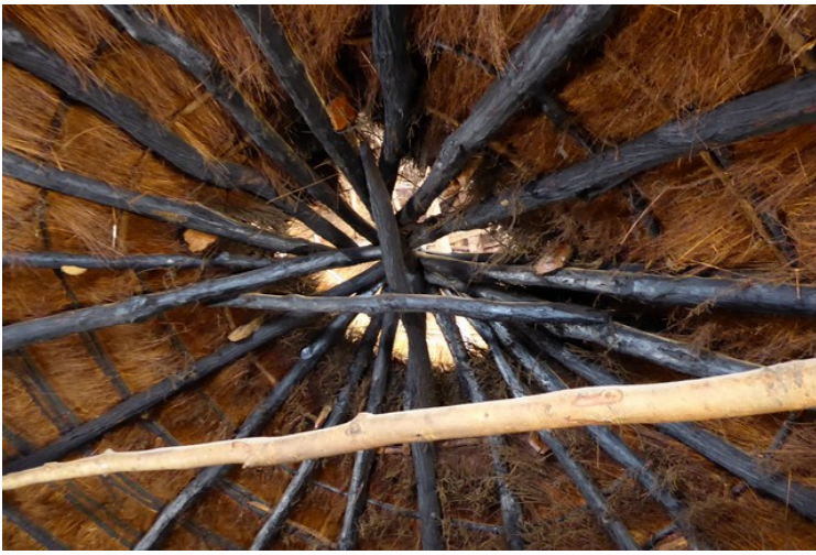
Fumes may go up through the roof.