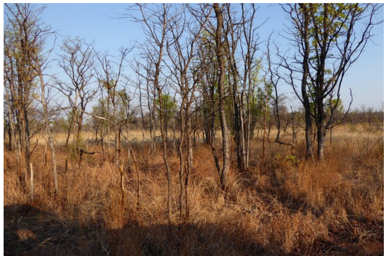
Some of the scenery we were driving through.