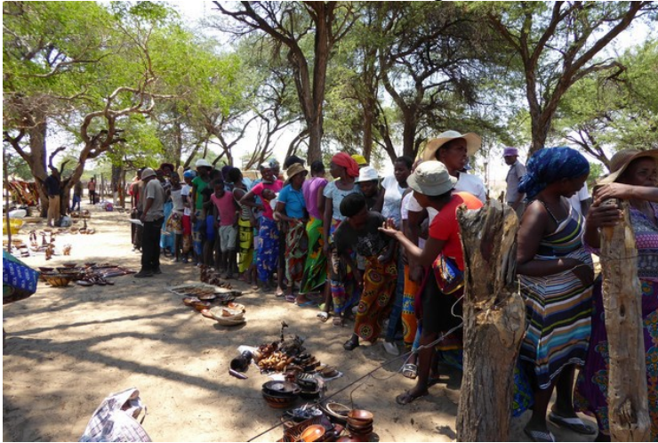
There is a long queue.