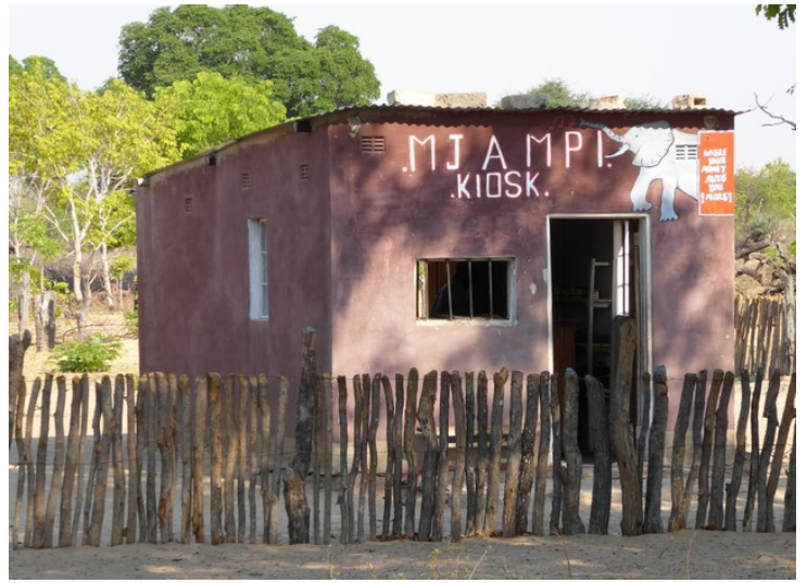
One of the two stores in the village.