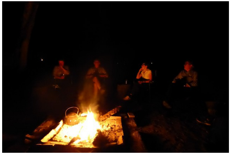
It was dark before we arrived, and after we have been assigned cabins we gathered around the fire.