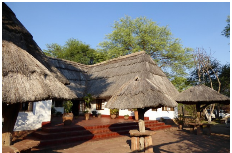
Nice houses. They called the hotel Halfway House because it is halfway between Bulawayo and Victoria Falls.