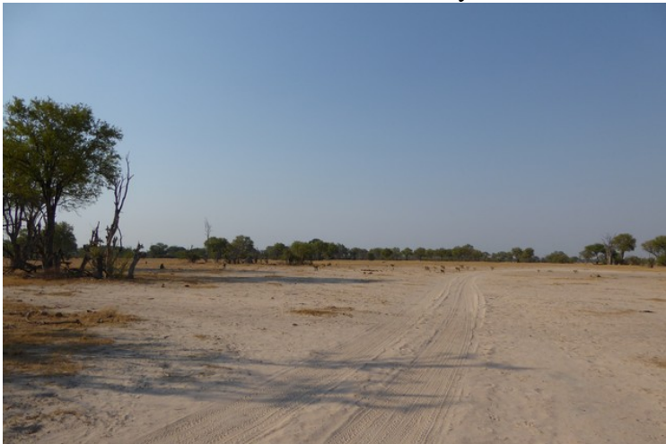
This morning you will visit a school and a settlement.