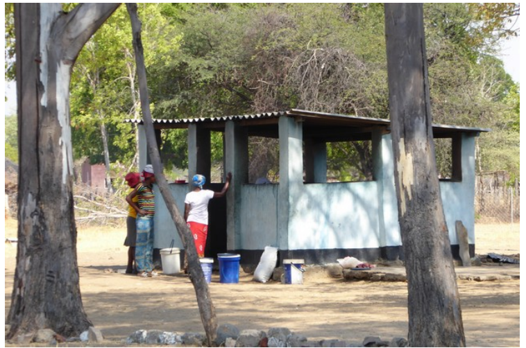
The school kitchen.