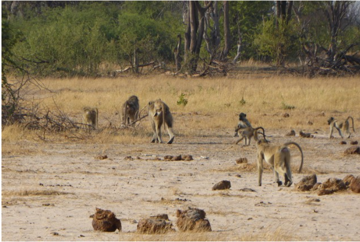
The baboons went away when we arrived.