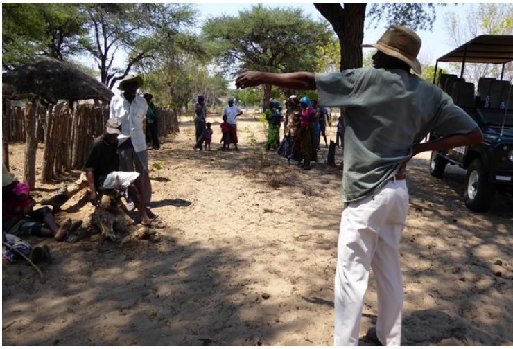
The chef is directing.