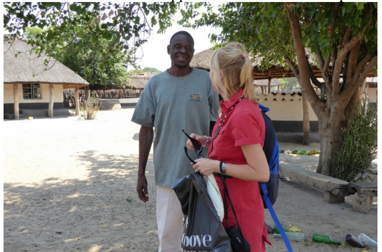
Our guide greets the chief.