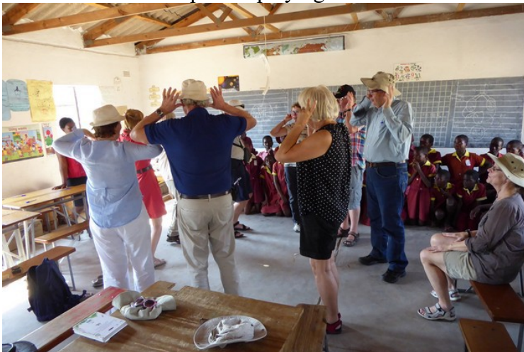
After that they want us to participate.