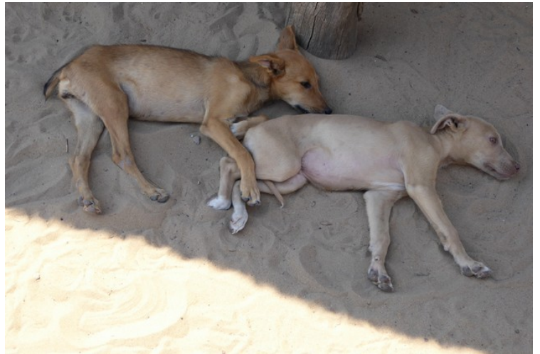
Out again. The dogs are laying in the shade.