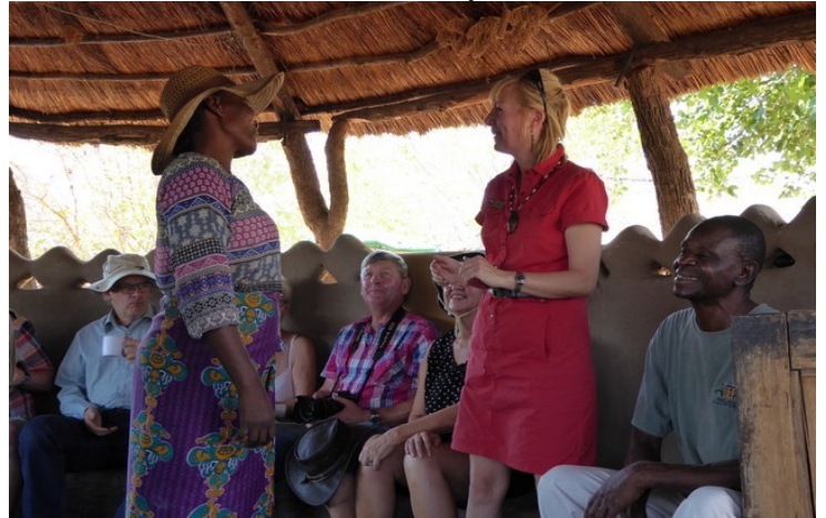
Our guide greets the chief's wife. The chief to the right.