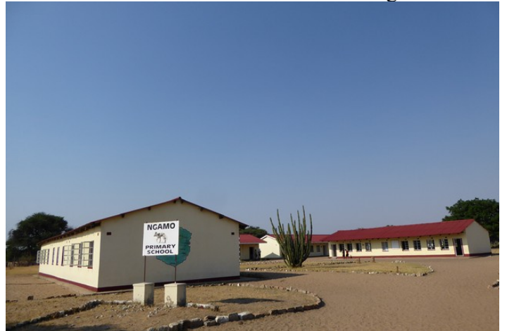
This is the school.