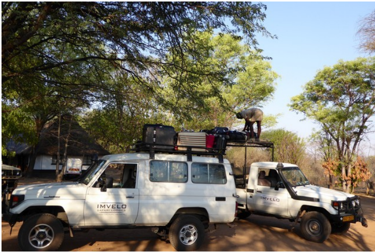
The staff loading suitcases into the jeep and onto the roof.