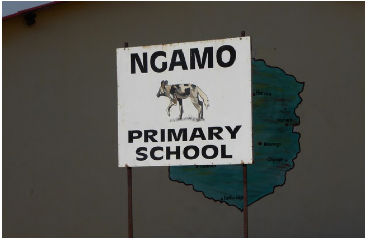
The village is called Ngamo.