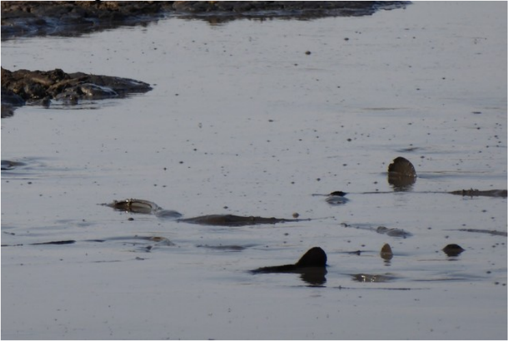
There were also small fishes in the water hole.