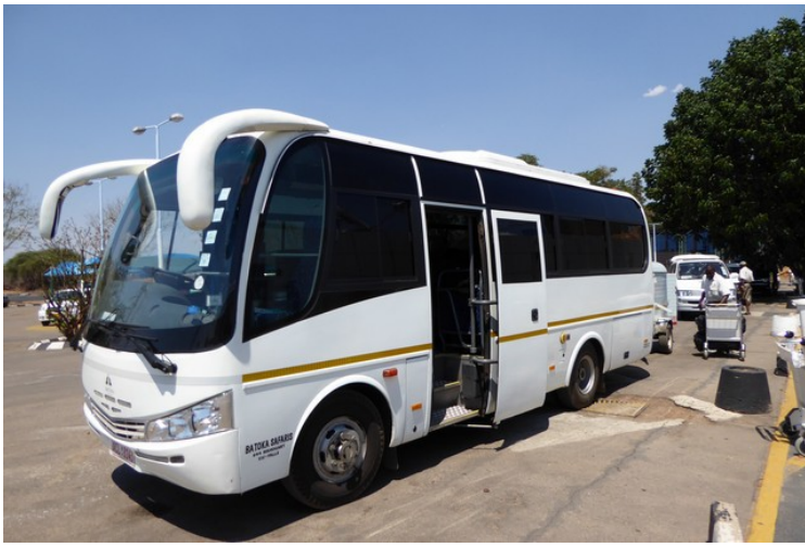
We were picked up by this bus at the airport.