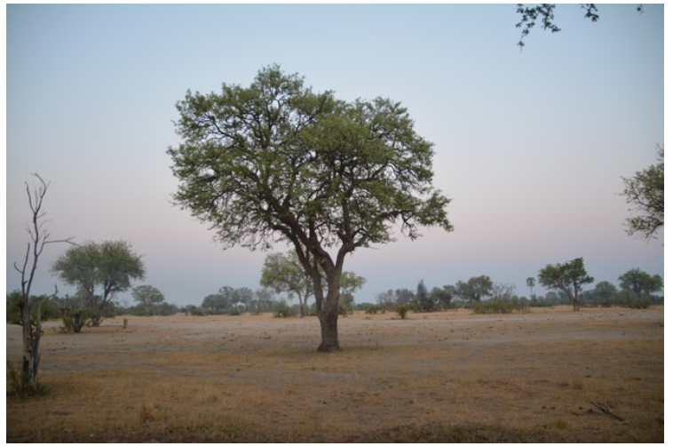
Overlooking the plains in front of the lodge.