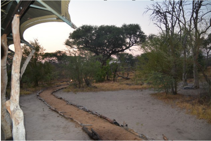
One of the paths leading to and from the lodge.