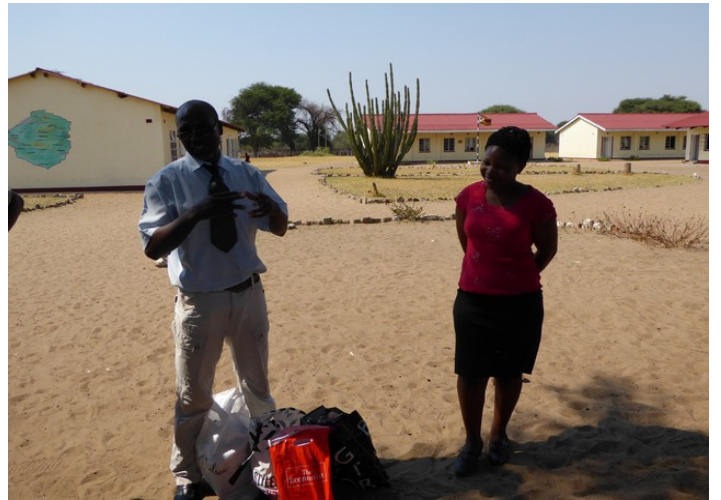
The school manager and the teacher. We have brought with us various school supplies like notebooks and pens.