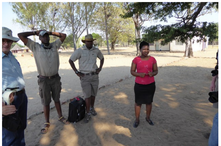
The teacher is also here and she explains how they work there.