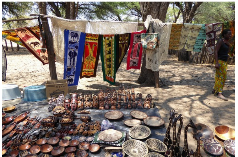
There were massive amounts of craftsmanship.