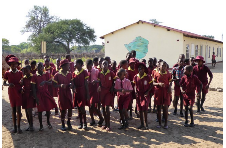
One of the classes have lined up to greet us welcome.