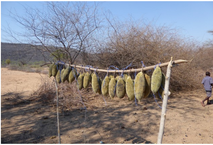
On the road again, we saw these baobab fruits. Our guide asked the bus driver to stop, because she would buy some fruits.