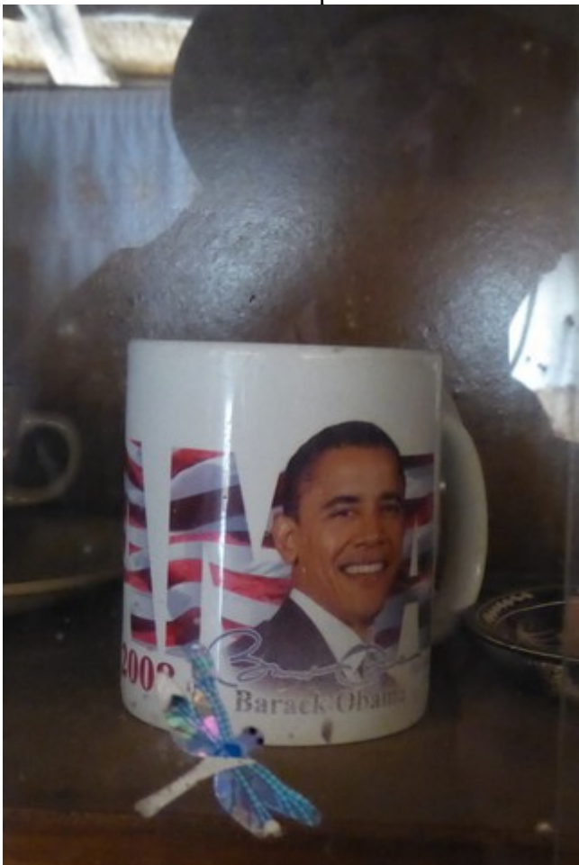
He has a mug with a photo of Barack Obama.