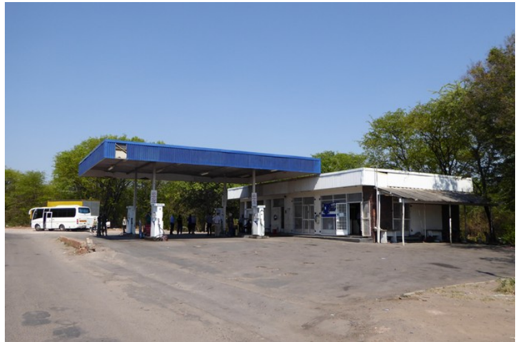
Here is our bus.