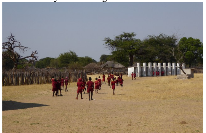
The toilets in the background.