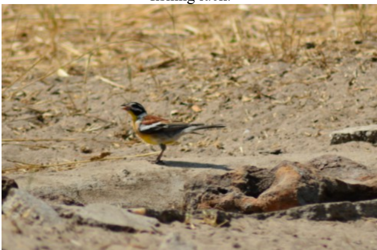
There were small birds there, too.