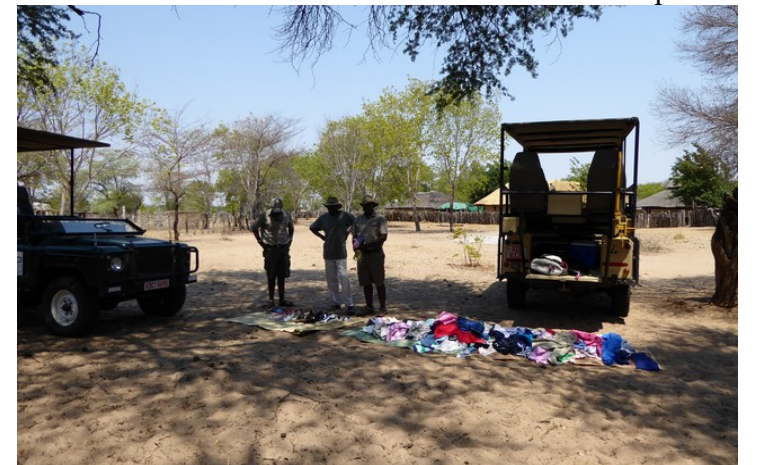
Our group had clothes and shoes with us that were handed out.