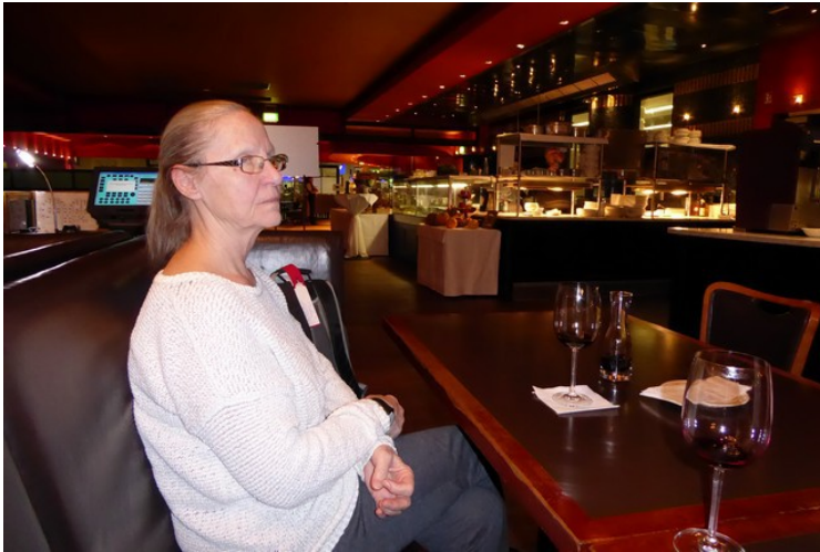
Here we are waiting for the food.