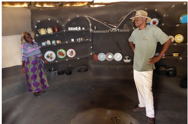
Inside the kitchen. Hearth at the bottom center.