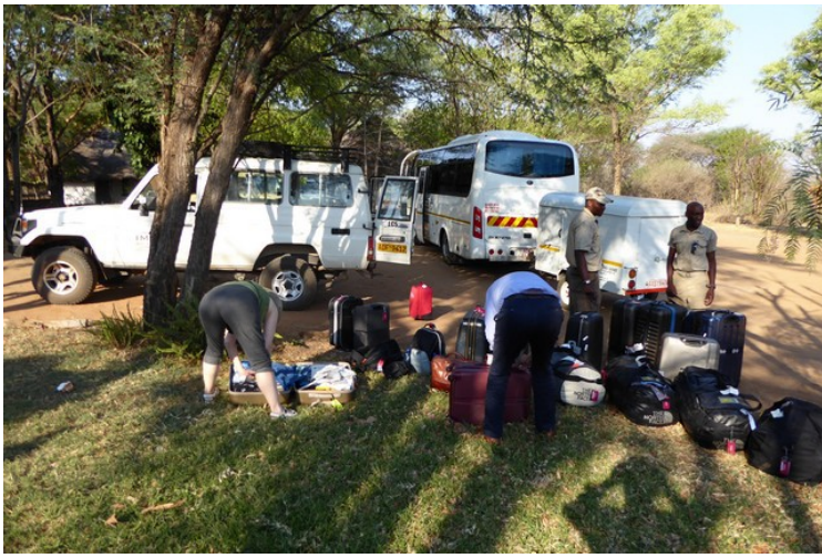
There are many who open the suitcases for changing to more suitable clothing.