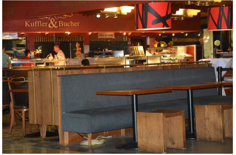
We were hungry after a while and we had a meal at this restaurant.