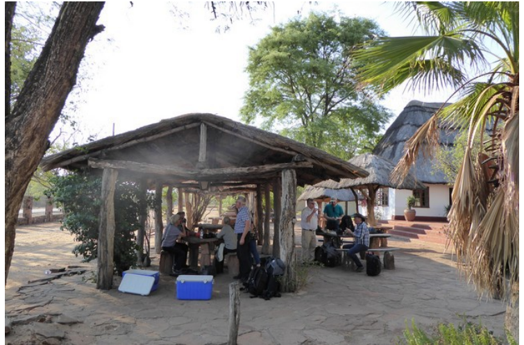
Here we come to the Halfway House where we take a break while the staff loads suitcases across from the bus to a jeep. From here to Bomani Lodge, where we will stay the first few days, there are only sand roads, and it is not accessible for the bus.