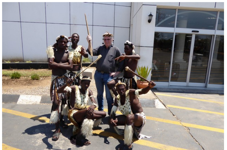
I gave them some money, and then they would take a picture of me in the middle of the group.