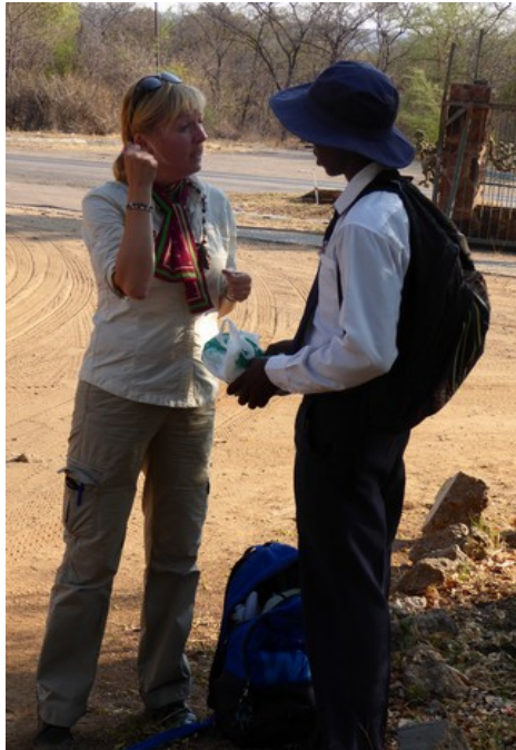
Our guide does the price agreements and pay.