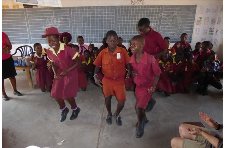
While others are dancing.