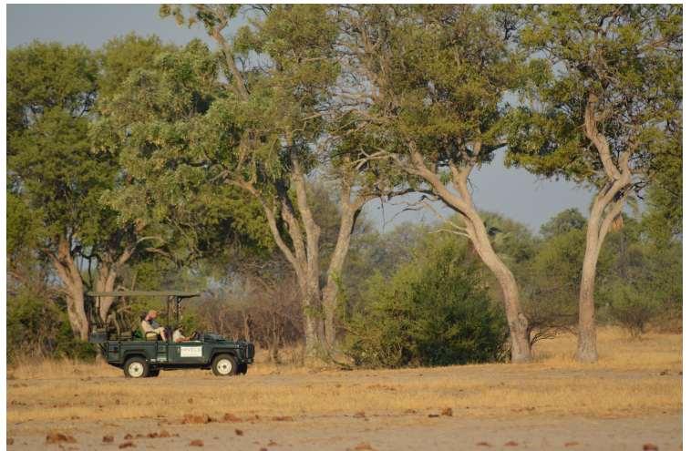
Some are already on the road.