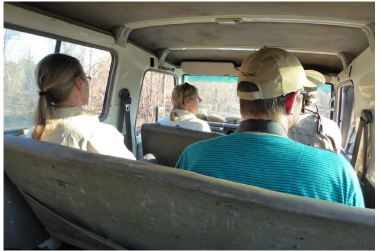
Here we are heading towards Bomani.