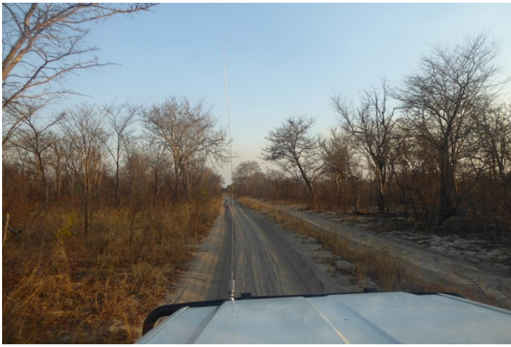
There have been fires in parts of the area that we were driving through. We see many charred tree trunks and vegetation has not grown much yet.