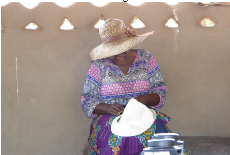
The chief's wife repairs our guide's hat.