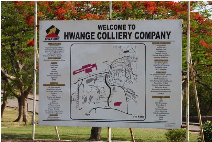
This sign stands at the entrance to Hwange Colliery Company . They operate coal mines just outside Hwange.