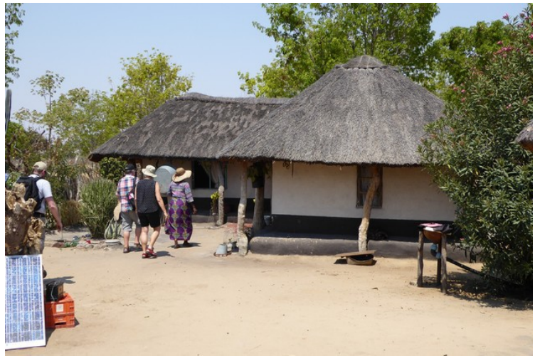
Then we are invited to have a look into the chief's living room.