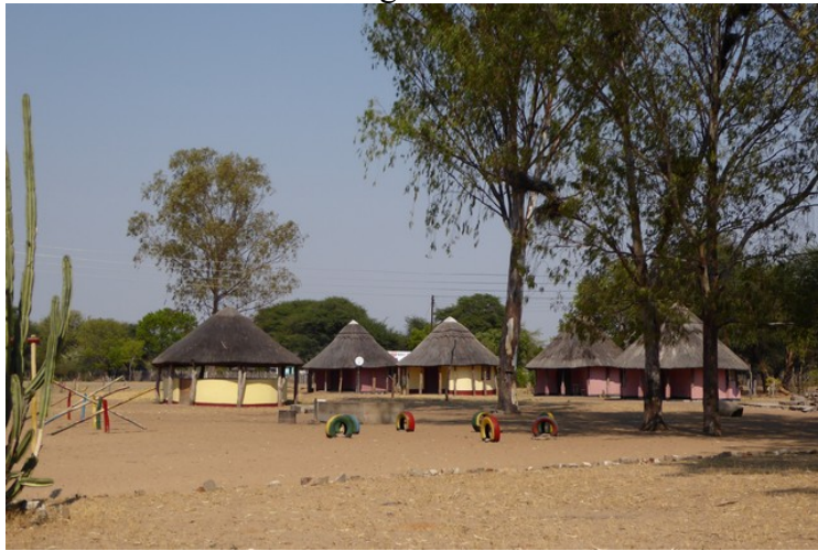
Playing ground with more of the teacher housings.