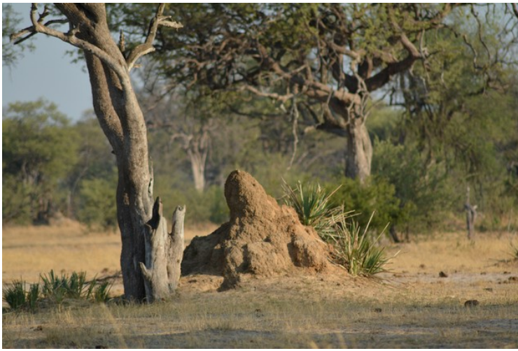
There are a lot of termite colonies in the area.