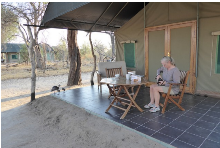
Outside on the terrace the next morning, day 3.