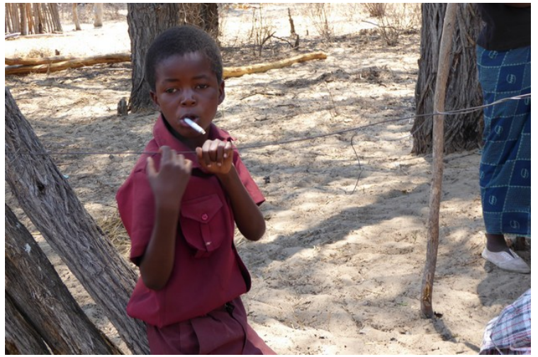
This littler fellow is watching.