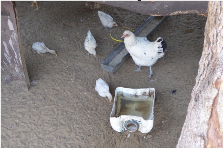
Hen with chickens.