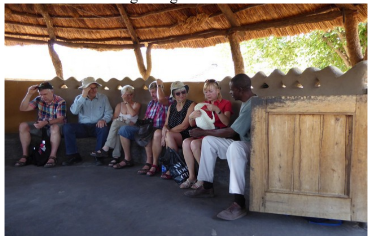
We were invited into the cabin.