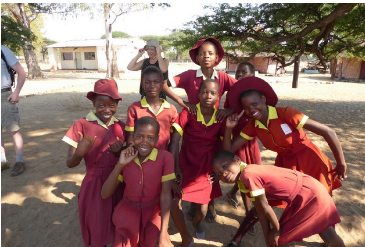
They thought it was fun.