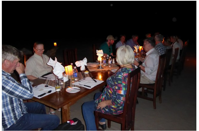
Then there is dinner under the starry sky.