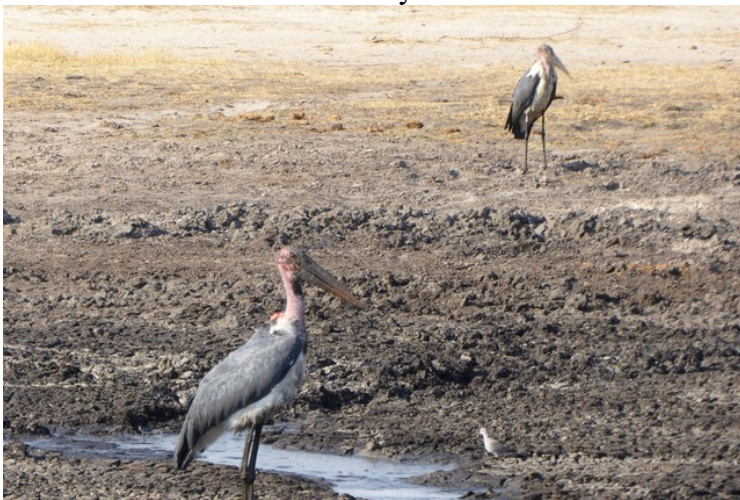
There were storks as well. They probably tried their fishing luck.