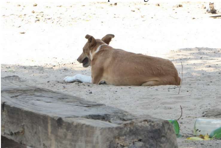
The dog is lying outside on duty.