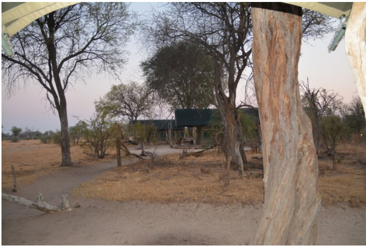
View to the neighboring lodges.