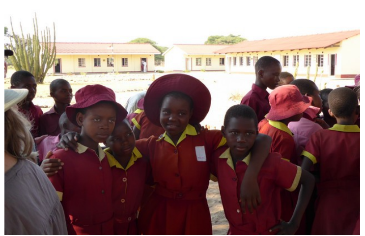
They lined up willingly to be photographed.