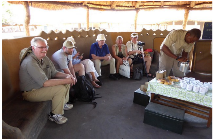
I am ready.