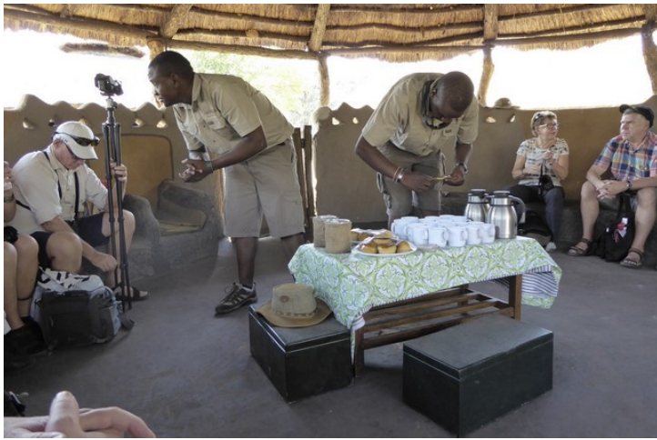
We were served coffee and cakes.