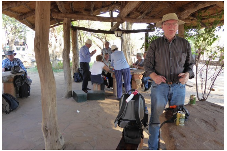
I'm just putting the safari hat on my head.