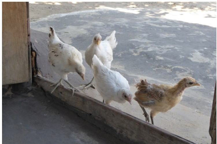
The chicks are ready to eat cake crumbs.