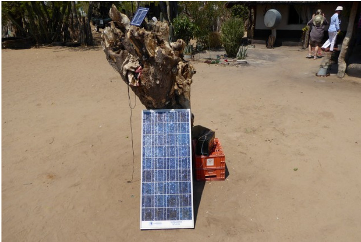
He has solar panels that provide light and that can charge the mobile phone.