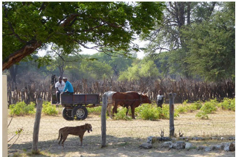
These have ox and cart.