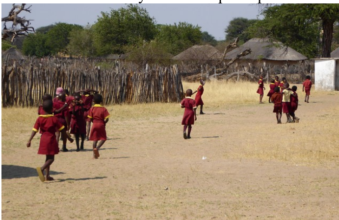
Then we are going out again.