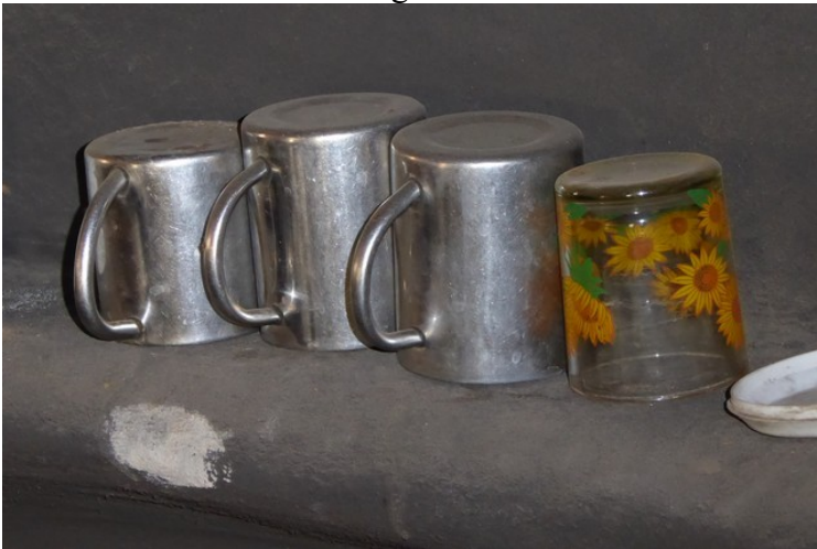
Order in the mugs.