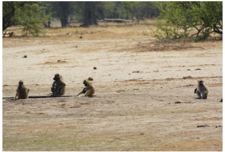
We drove past a water hole. Here was a herd of baboons .