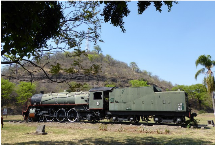
On the way south we had a short stop in Hwange . I guess this is one of the locomotives to the coal company.