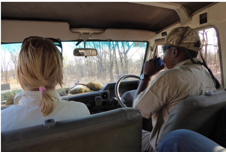
Our guide and the driver who works at Bomani.