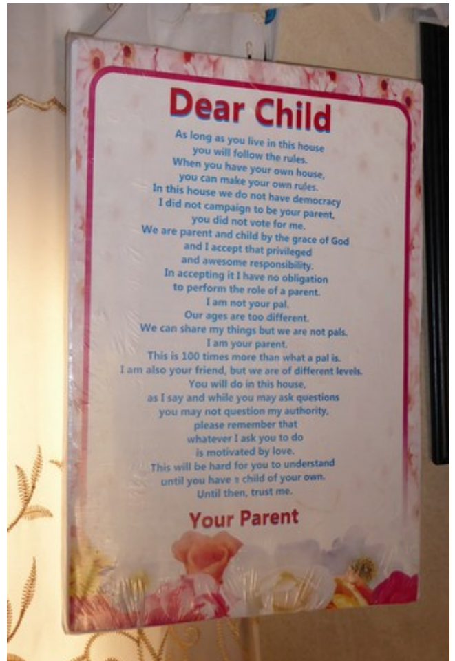
A poster in the living room.