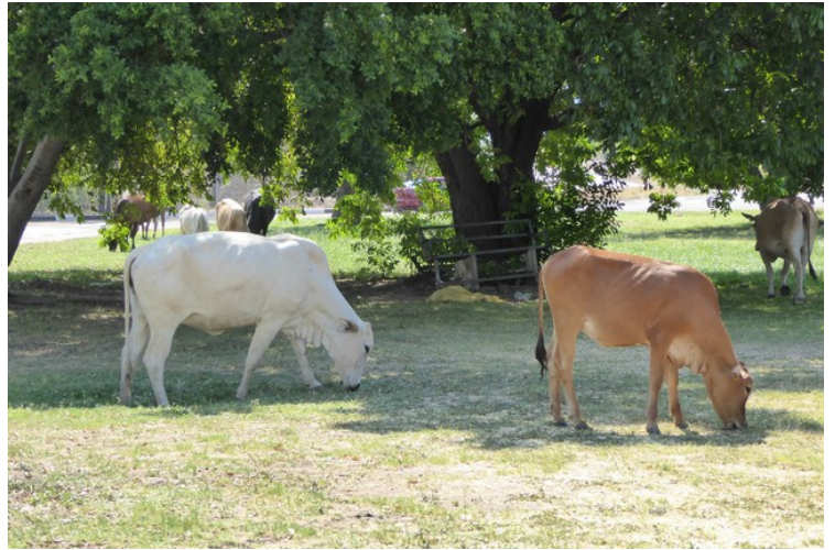
The cows are grazing under the trees.