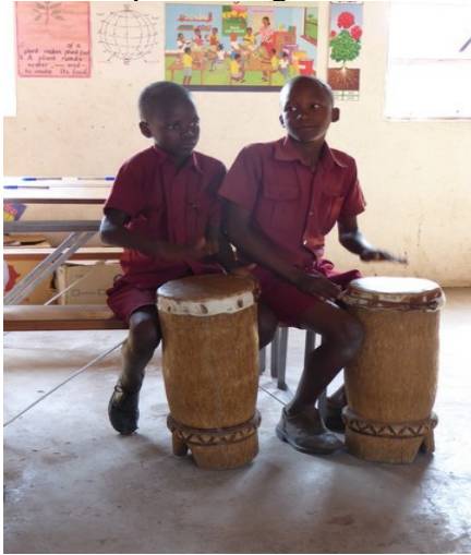
A couple are playing drums.