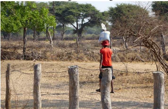
Regular transport method when one has no other means of transport.