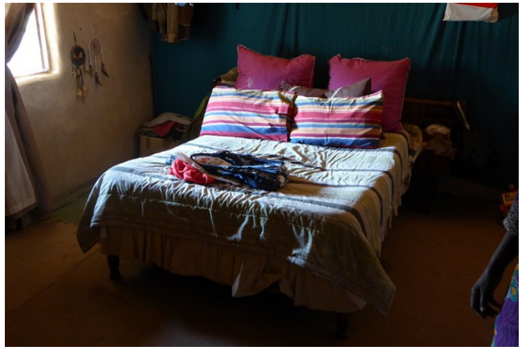
Bed in the bedroom.