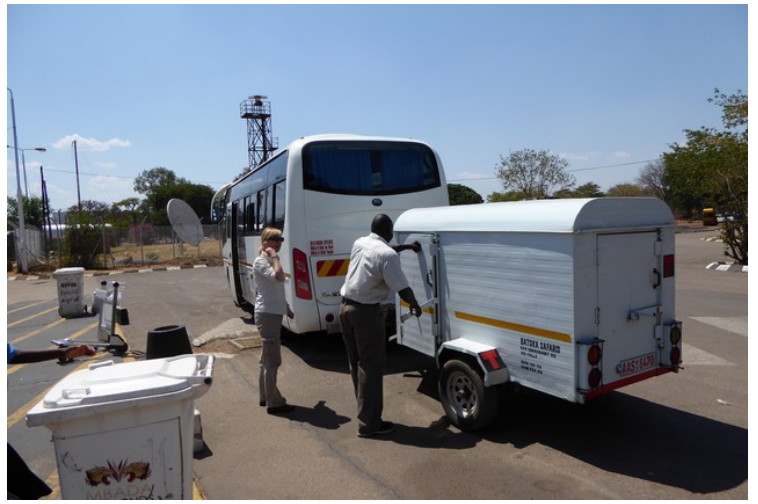
The suitcases were placed in the trailer.