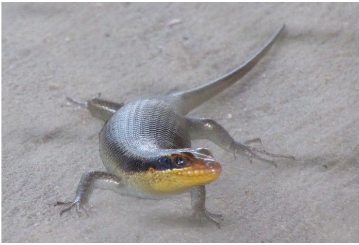
A lizard looking at me.