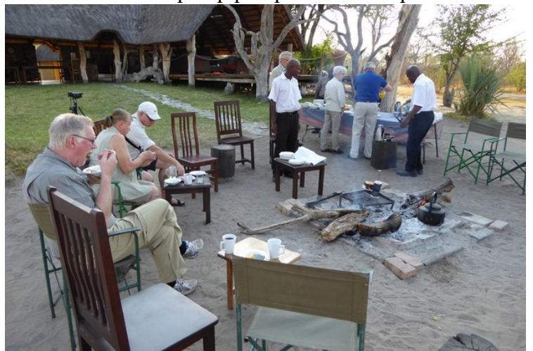
We sat and ate in a circle around the fire.