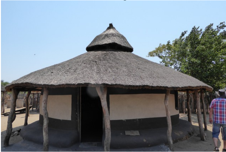
The kitchen seen from outside.