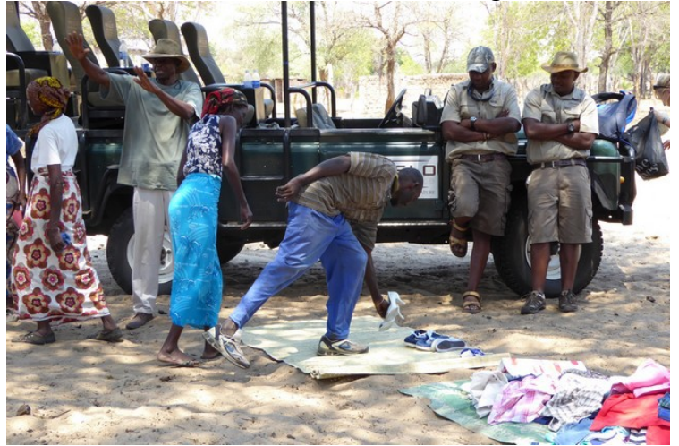
They ma take one thing at a time, but there is so much that most people can go many times.