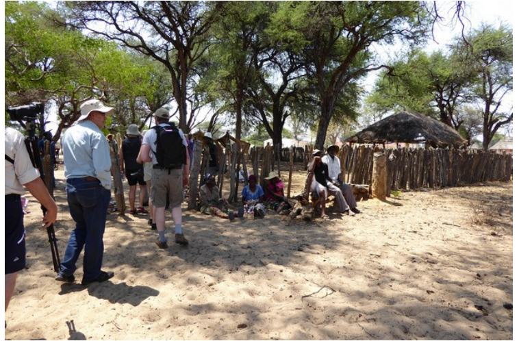
Afterwards a market was held.