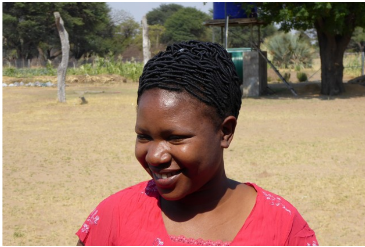
The teacher is telling more about the school.