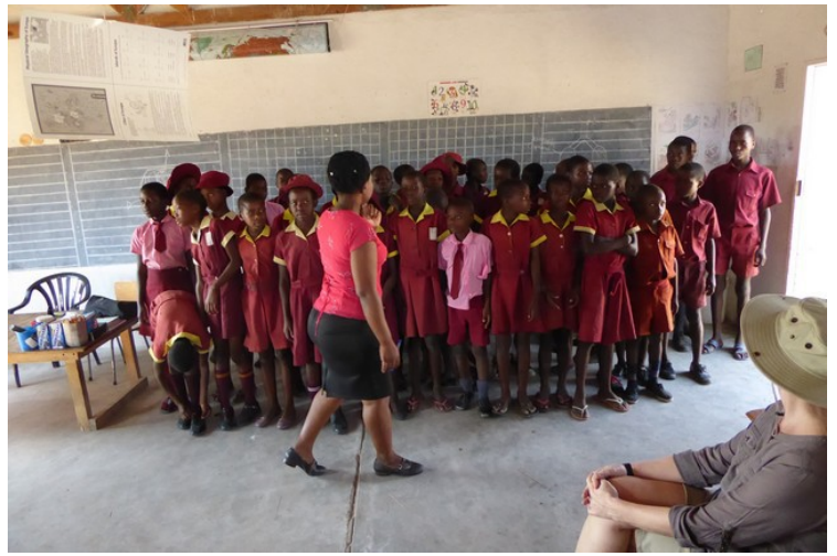
Here they are singing.