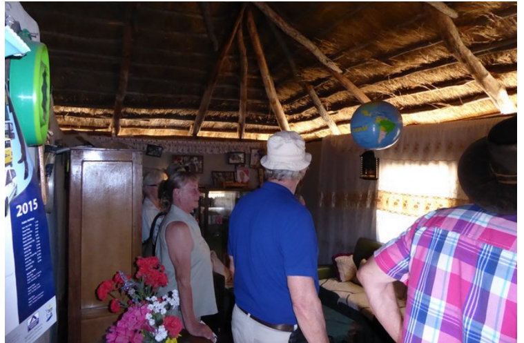
Inside the living room.