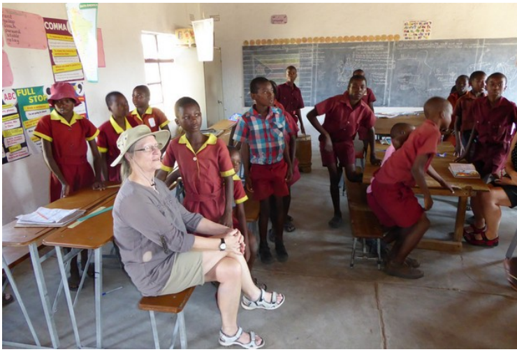
Afterwards we go into the classroom where the kids will be performing for us.