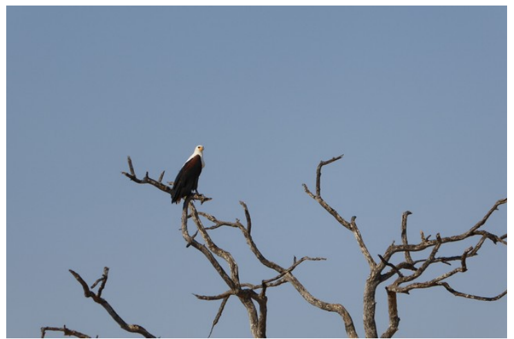
A large bird. A type of eagle.