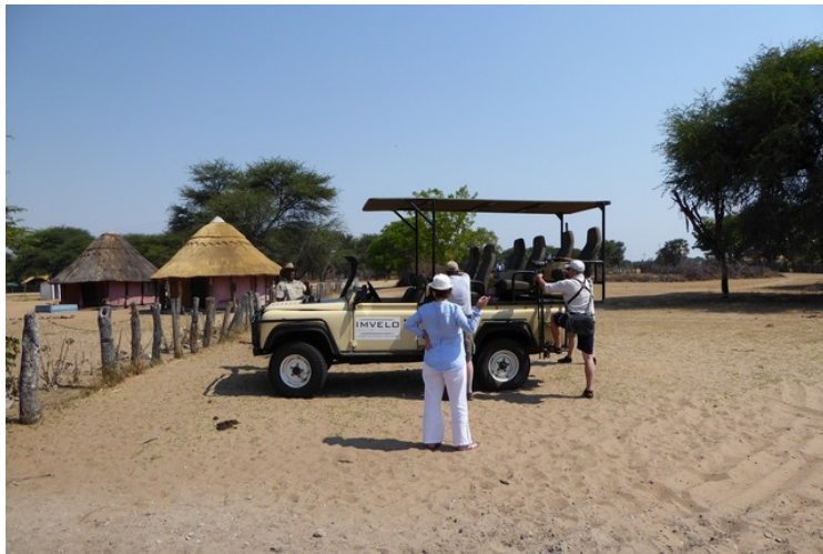
Then we are going to visit the chief.