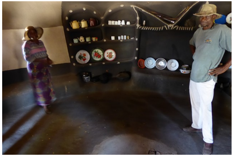
Lady of the house has good order.