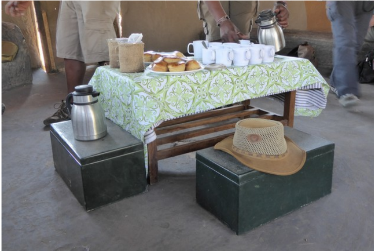
The serving table.