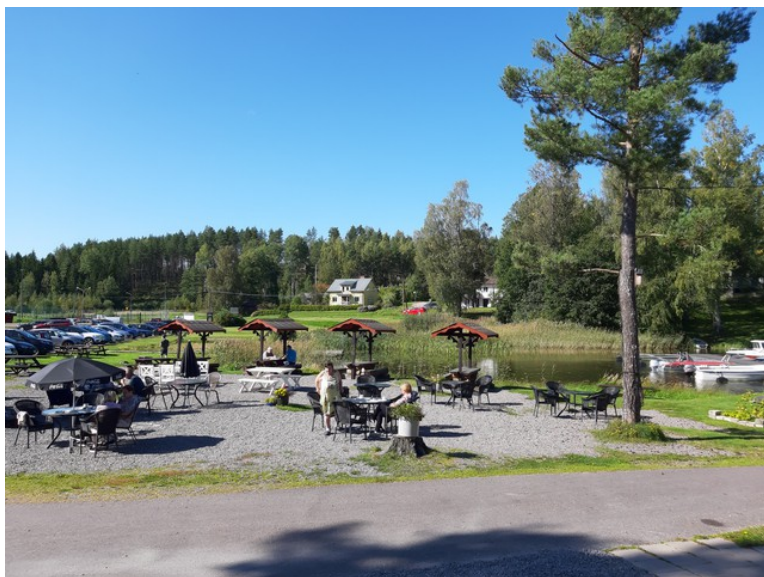
Here we are. People sit outside and eat.