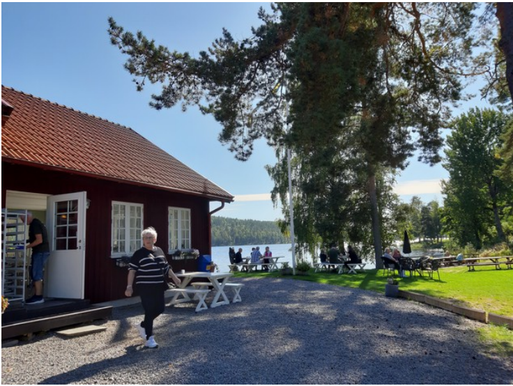
On the way in.