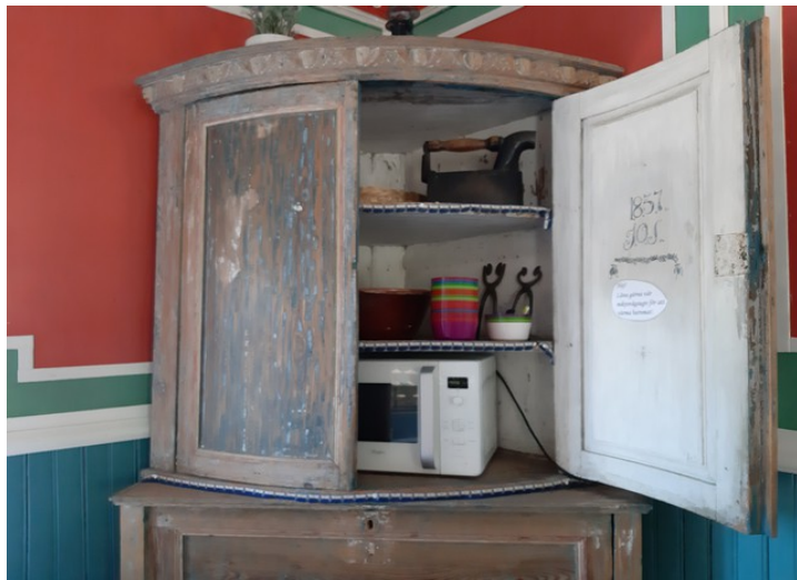
A cabinet from 1857.