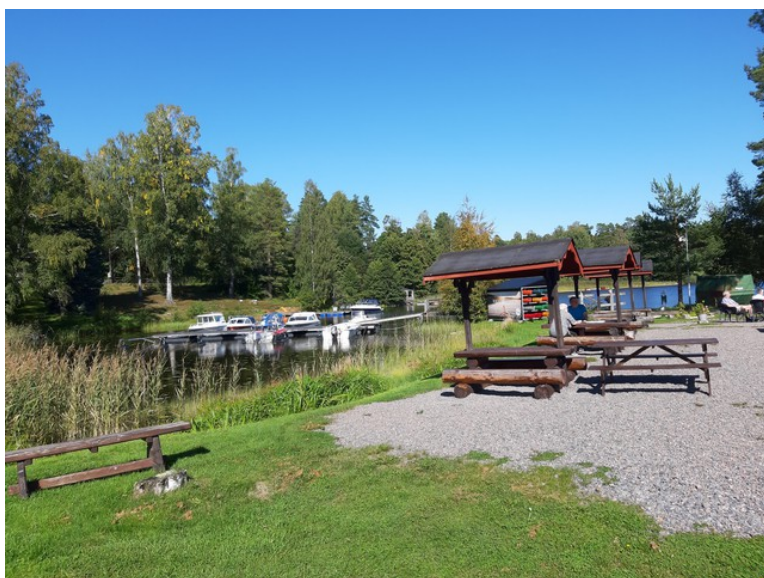
Boats in the cove by the cafe.