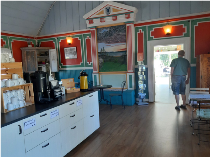
In the middle of the room is a counter with knives, forks, napkins, cups, coffee pot, salt, pepper, etc.