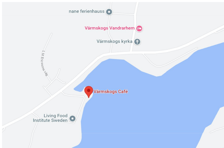
The cafe is located by Lake VärmeIn.