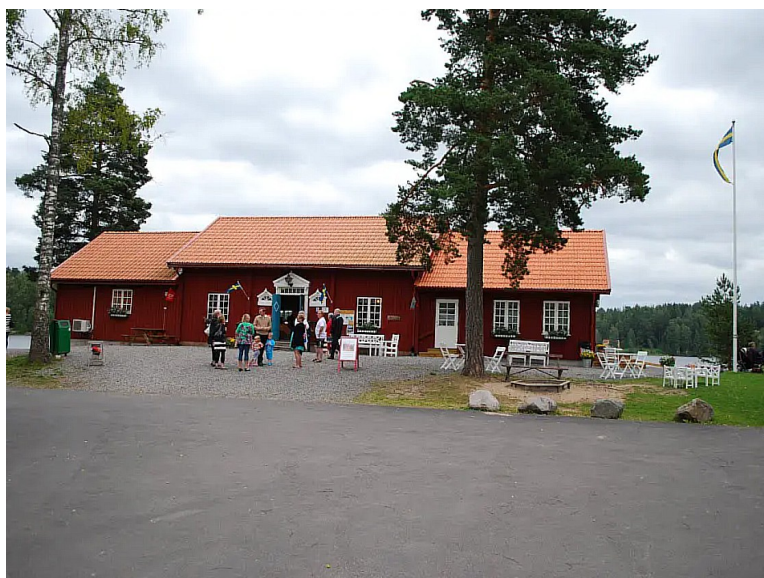
The cafe seen from the parking lot.