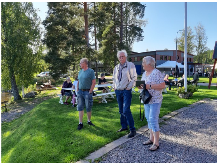
Here we stand and admire the view.