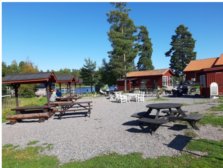
There are many benches and tables outside.