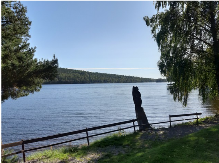
View beyond Värmeln.