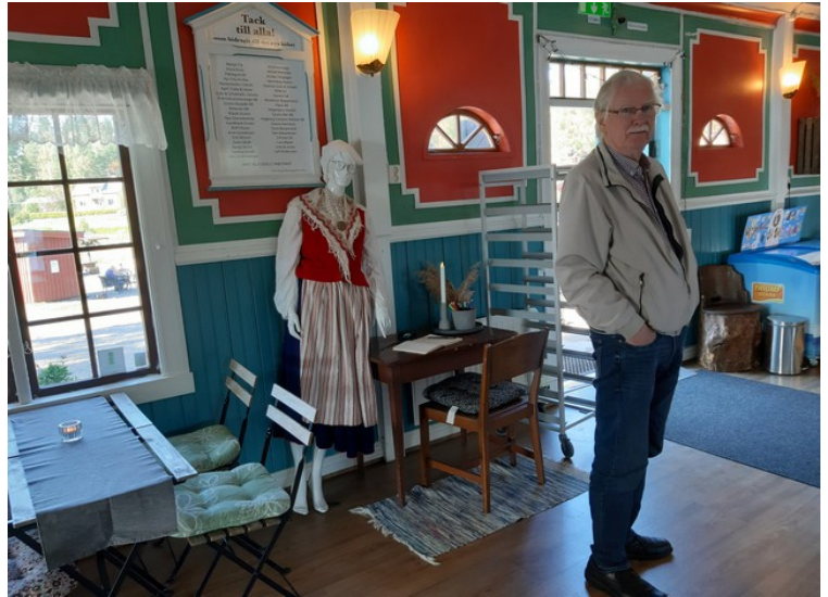
I look around.