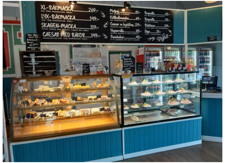
Inside, the food is ready in the counter.