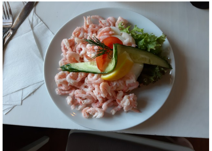
The shrimp sandwich.