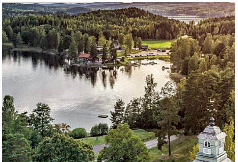
An aerial view of the cafe area. We see the tower of Värmskog church in the foreground.