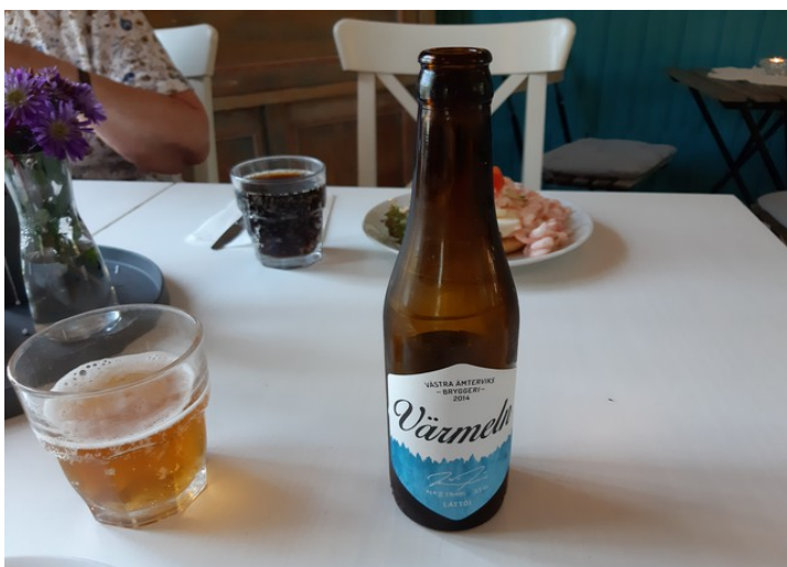
Värmeln light beer.