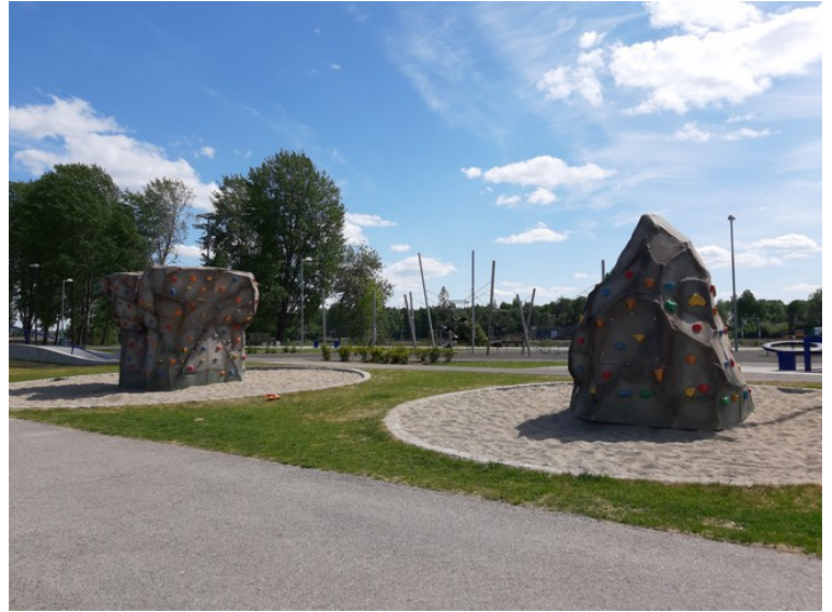
This is at Tufteparken in Kongsvinger .