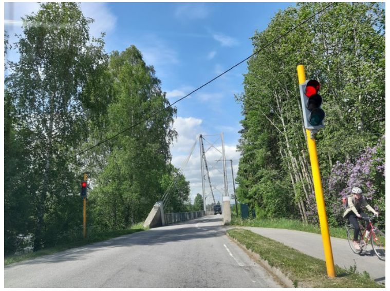
Here we are about to drive across the bridge at Brandval .