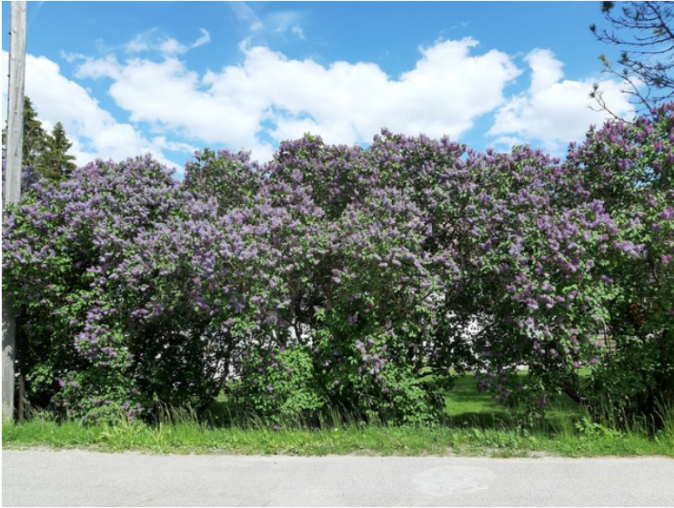
Flowering syringas .