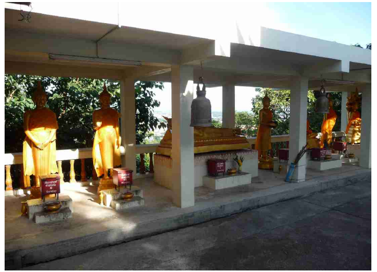
Here are also 7 small Buddha statues, one for each weekday, just like those on Big Buddha Hill.