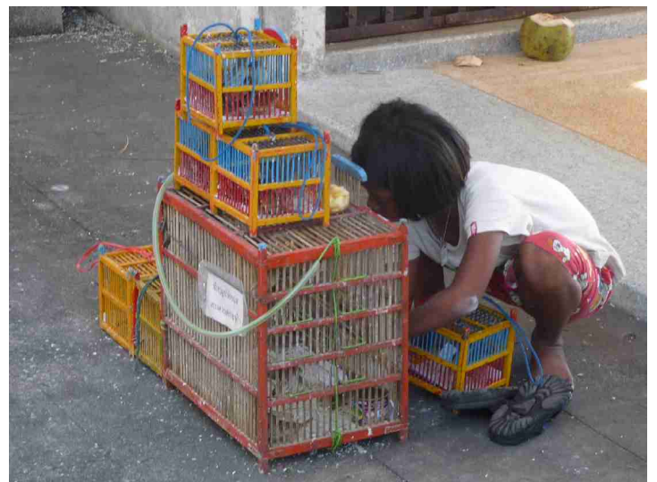
At the entrance is sold small birds in cages. It is common to buy these and let them loose in front of the Buddha statues.