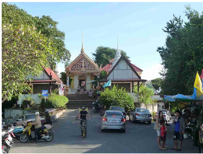
At the other end of the hill there is a small temple area.