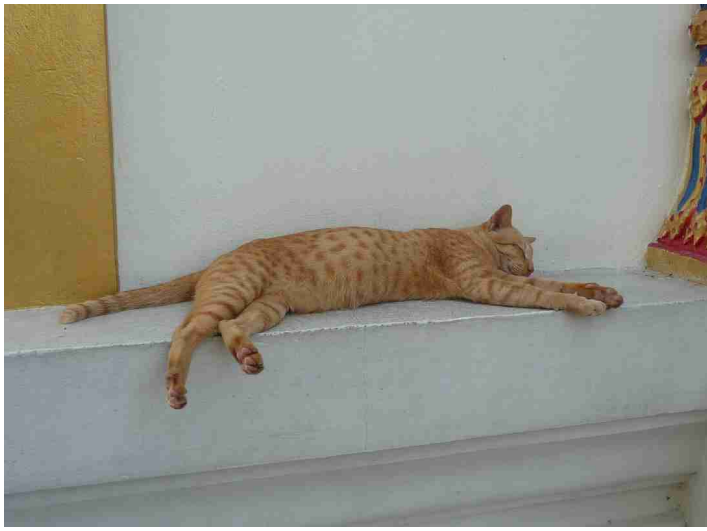
That do also the cats.