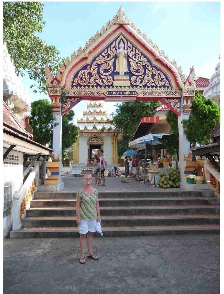
Outside the entrance of the temple area.