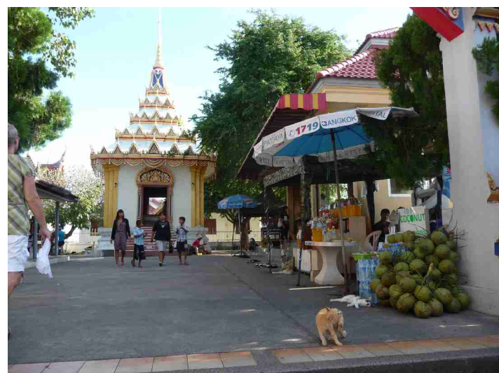
It is also possible to buy all kinds of Buddha souvenirs and of course incense sticks, which are used during the worship of Buddha.