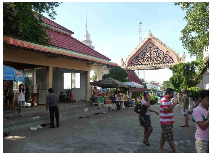
Way out of the area again.