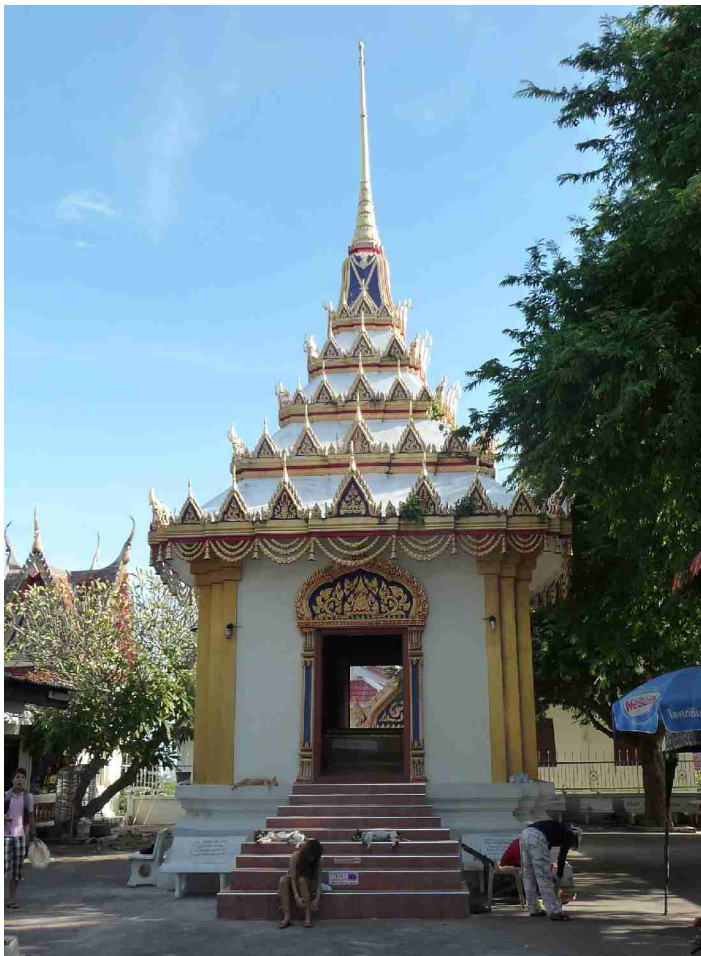
A small temple.