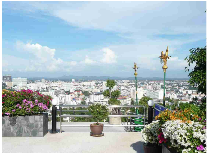
Another view of Pattaya.