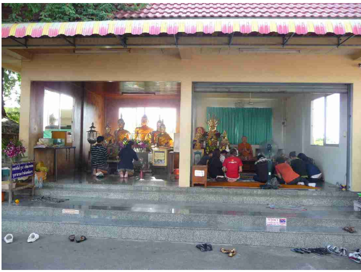
Her are more Buddha statues being worshiped.