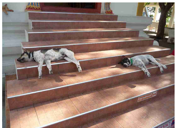
The dogs are relaxing in the shadow and don't care much.