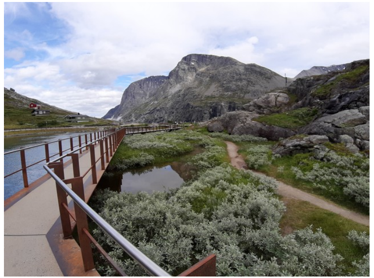
Walkways have been made to a viewing platform.