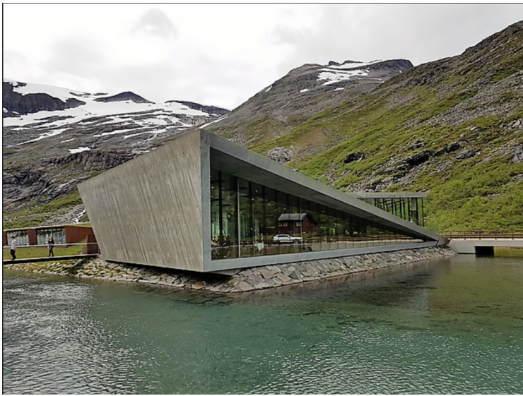
From the walkway, the visitor center looks like this.