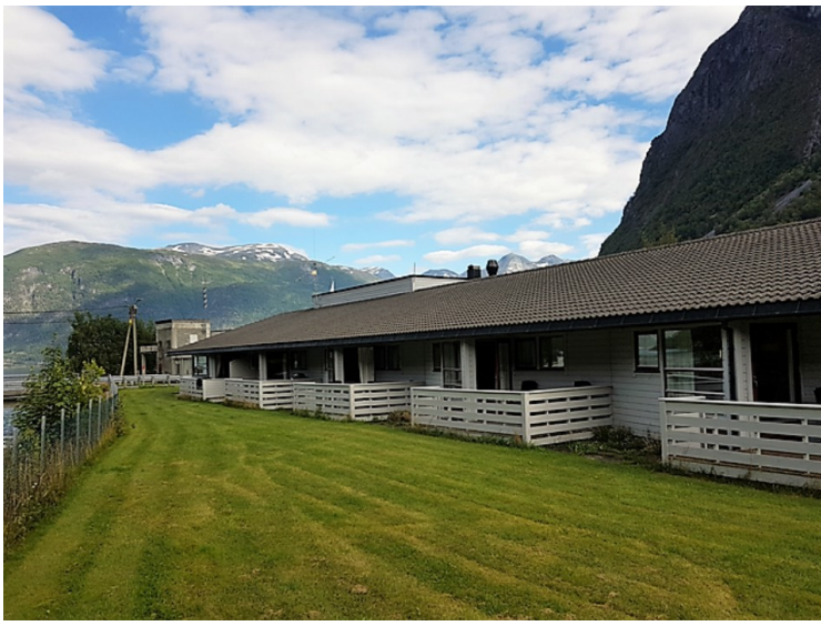
The apartments are in a row.