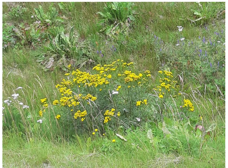
To make the wait go by, many pictures were taken of the nature around us.