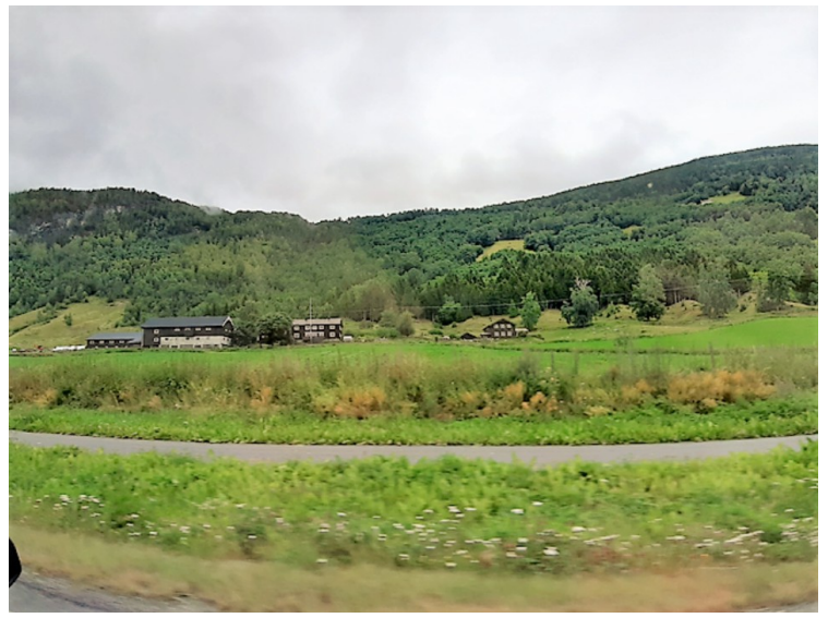
At Sjoa .