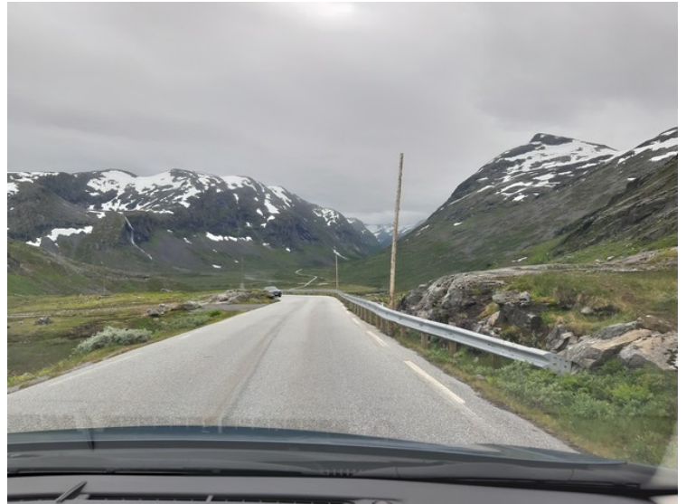
Here it goes down again, towards Valldal.