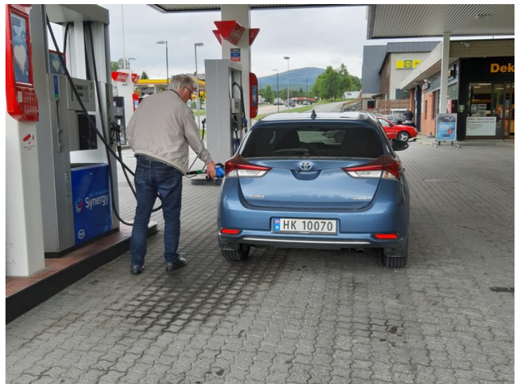
We refueled at Dombås .