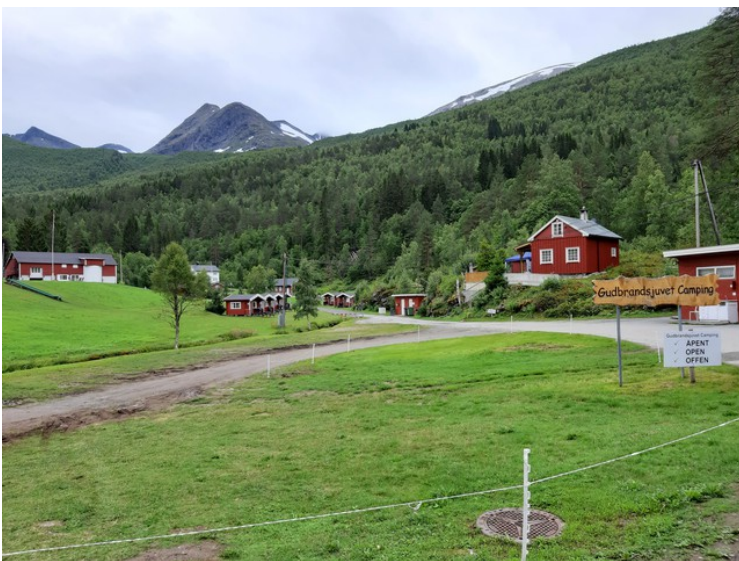
This is Gudbrandsjuvet Camping . It's on Alstadsæter .