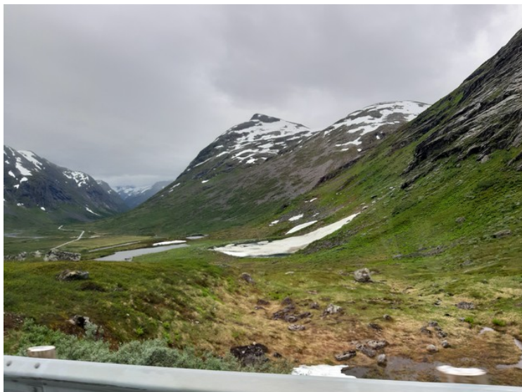
The valley here is called Slettvikane.