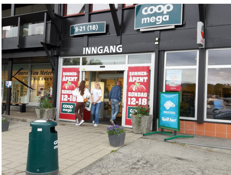
The entrance to the shopping center at Dombås. We had to stock up a little.