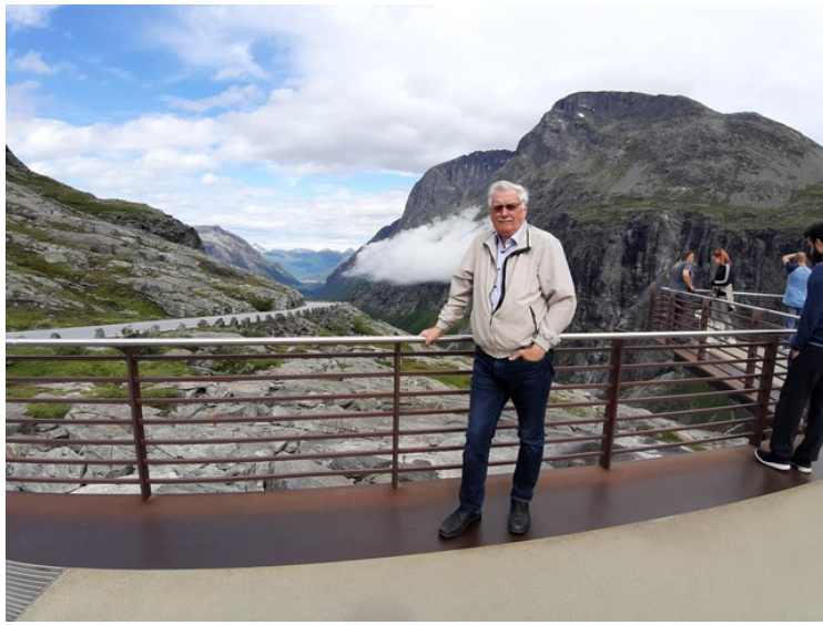
Til slutt et par bilder av oss på plattformen før vi kjører videre.