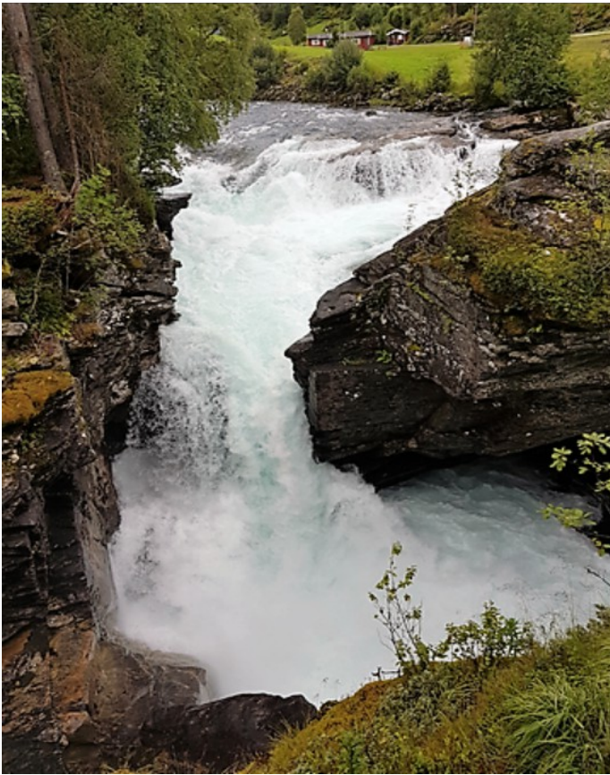
The upper waterfall.