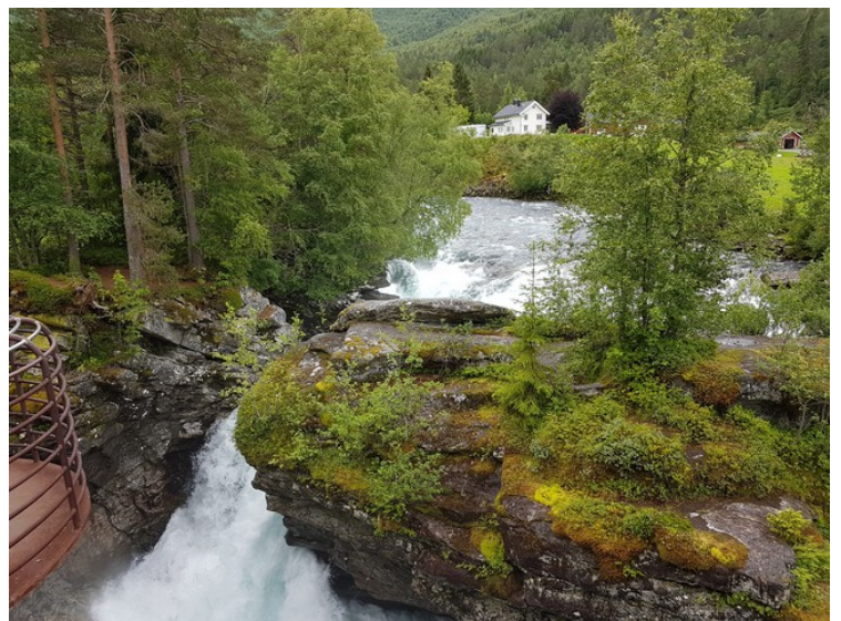
Valldøla has cut a gorge and forms a couple of waterfalls. Here there is more water in the river than up on the mountain.