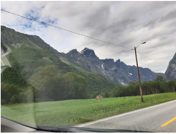
Trolltindene to the left.

Towards Romsdalen they form a steep mountain wall, Trollveggen . It is a thousand meters high and is Europe's highest vertical rock wall, and one of Norway's most dramatic rock formations.