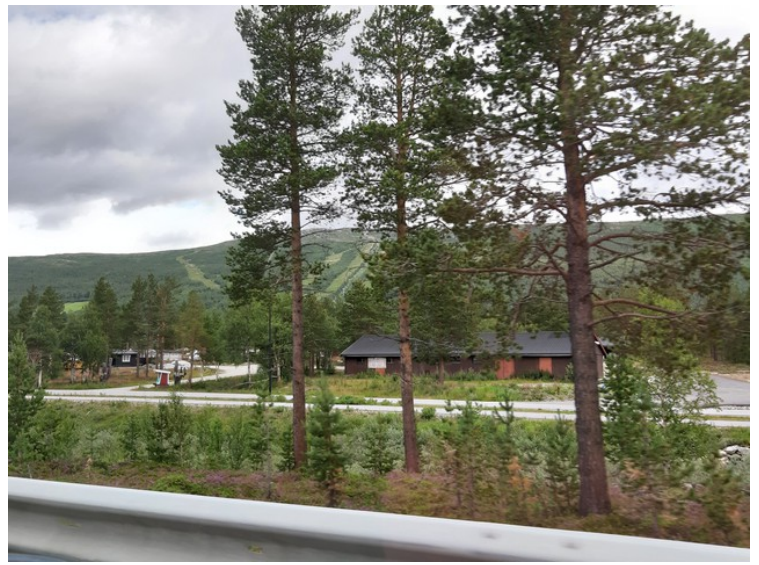
We see the routes to the many ski slopes on the mountain side. There are 11 slopes and 6 ski lifts.