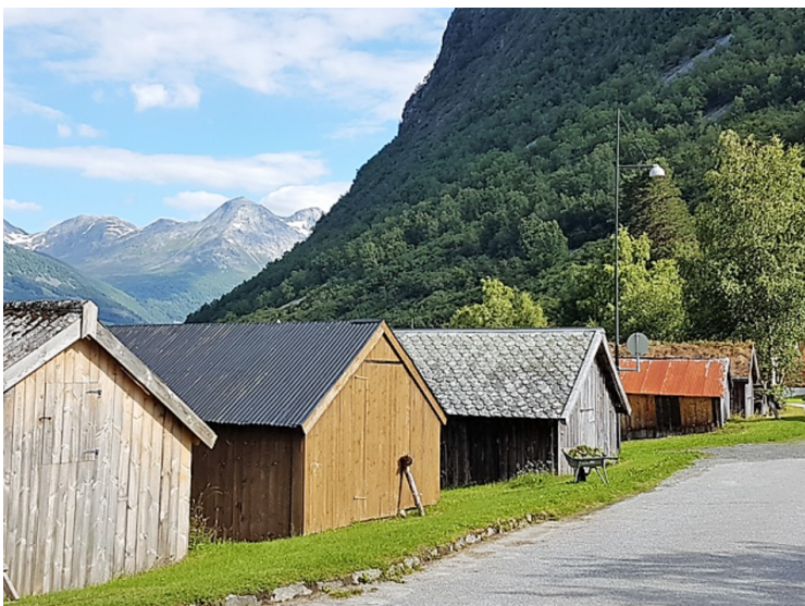
Boathouses by the fjord.

Down by the fjord there was a grindstone . Next to the grindstone was a poem, Slipesteinen , by Jakob Sande .