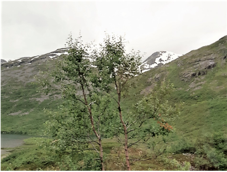
The birches are small so high up.