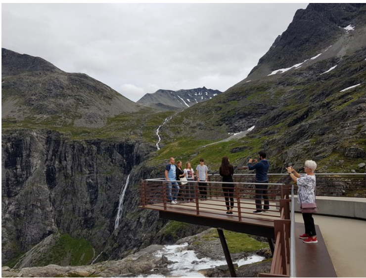
The viewing platform is popular. The waterfall we see in the background is called Trollfossen . It has a higher drop than Stigfossen , but less water flow, so it is not as impressive as Stigfossen.