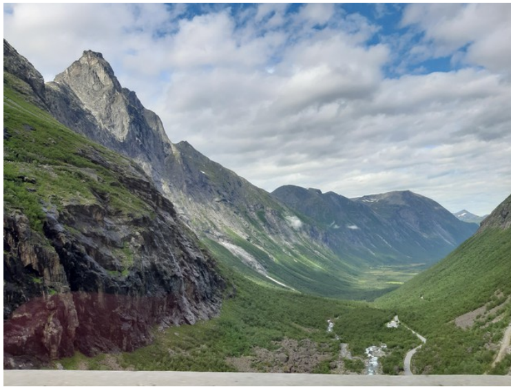
On the way up we get a good view of the valley.