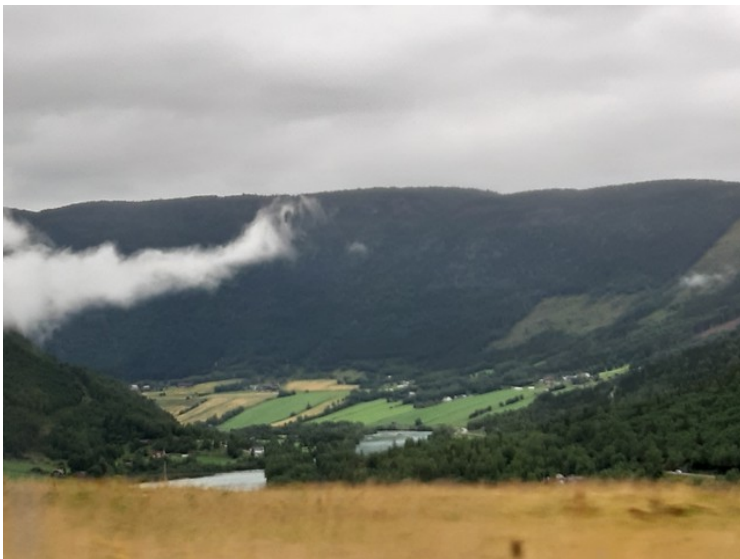
Just before Kvam .