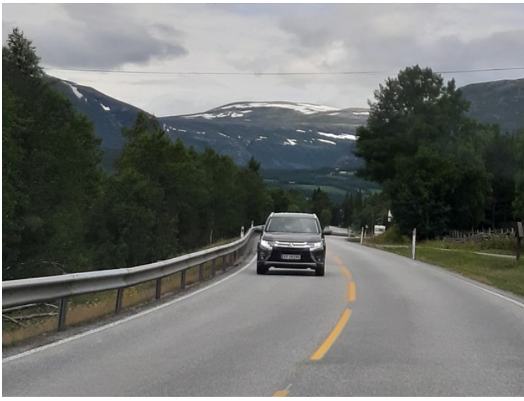
Here we can see some of the peaks in Reinheimen Nasjonalpark .