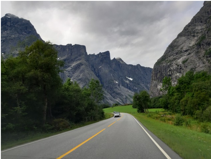
Trollveggen on the left side.