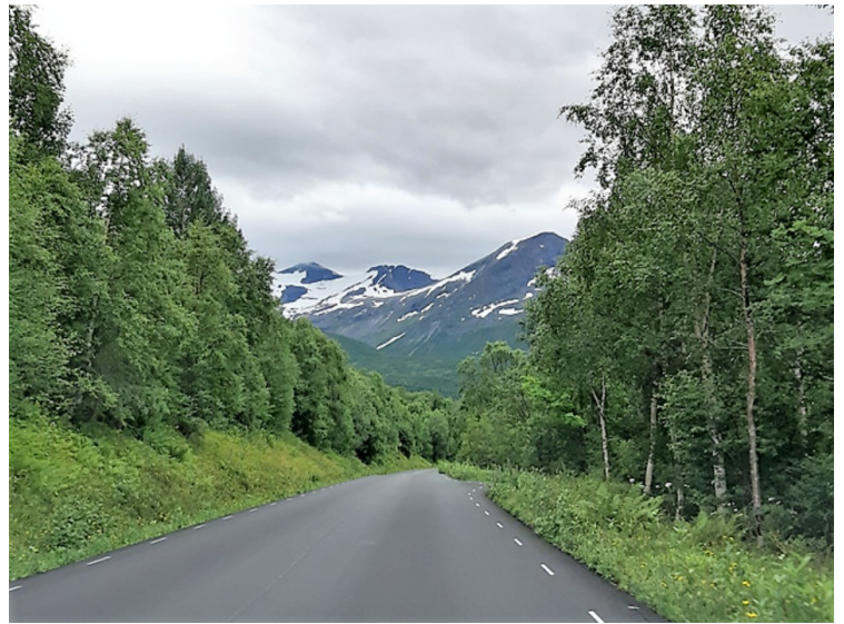
Soon down by populated areas.