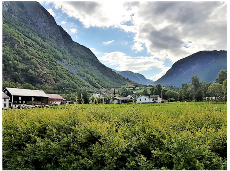
View towards Norddalen.