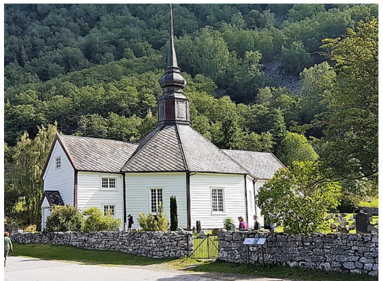
Norddal Church .