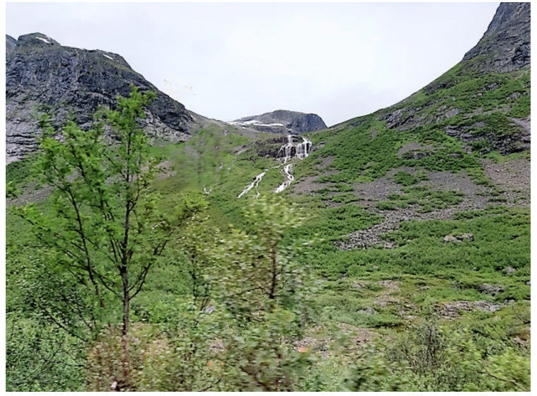
Here we have come to Meiadal, and we look up towards Meiadalskoppen.