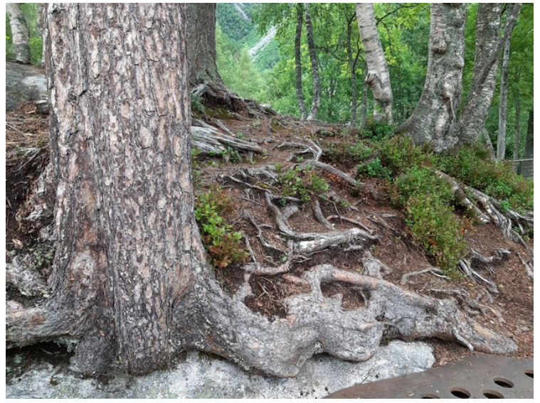
These trees were at the lookout platform. Here we see the roots of the trees quite well.