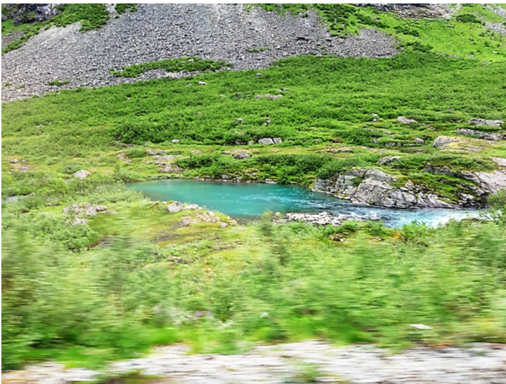
Valldøla flows in the valley bottom.