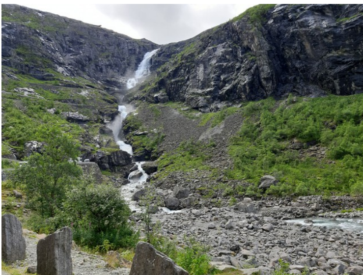
We stopped at a view point and took a picture of the waterfall from there. It is part of the river Istra which flows down towards Rauma.