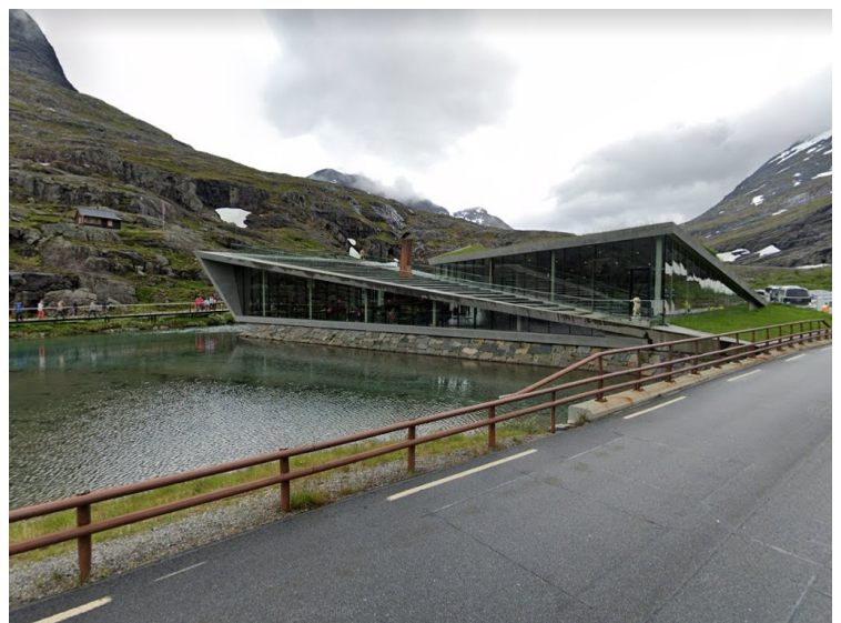
A visitor center has been built on top of the steepest part. Trollstigen with Ørnevegen is one of de nasjonale turistveger .

Fjordnorway Visitnorthwest Nasjonaleturistveger Visitnorway Wikipedia