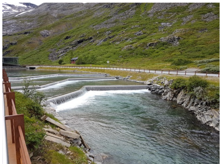
The ponds seen towards the visitor center.

Historically, Trollstigen is an old mountain pass between Valldal in Indre Sunnmøre and Åndalsnes at the bottom of Romsdalen. An important reason for the connection over Stega Mountain was a large annual market on the farm Devold in Romsdalen. But it was only after the road opened in 1936 that Trollstigen became a tourist magnet.