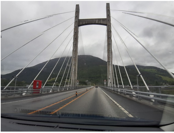
Just after the tunnel a bridge crosses Gudbrandsdalslågen.