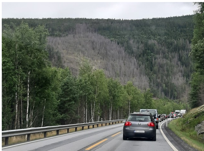
A road up to Gammella.