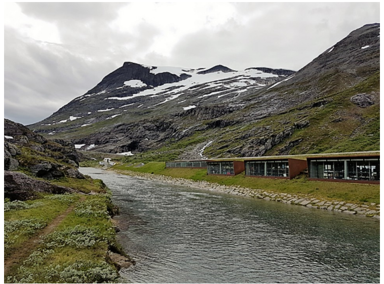
The view further up.