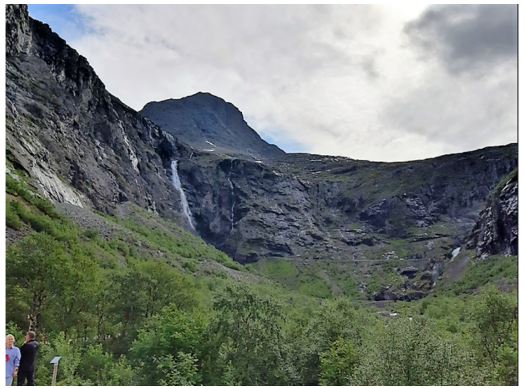
Here we see the first glimpse of Stigfossen . It has a total drop of 239 meters.