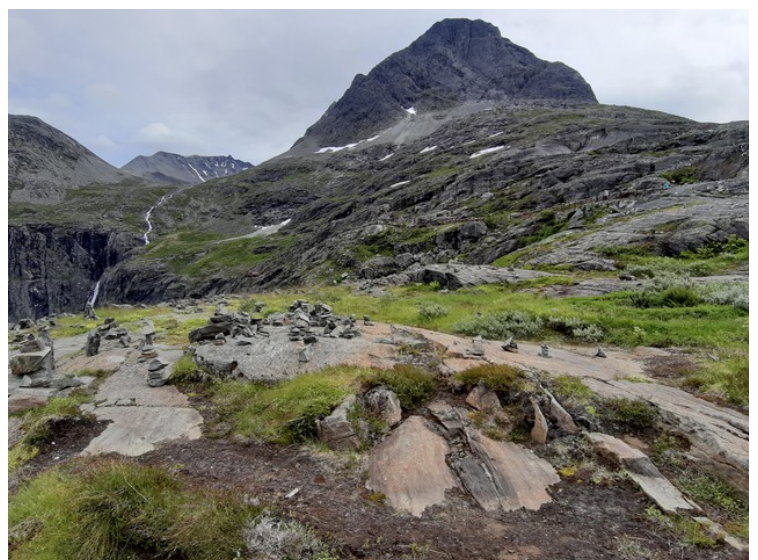
Here are some who have had fun laying stones on each other.