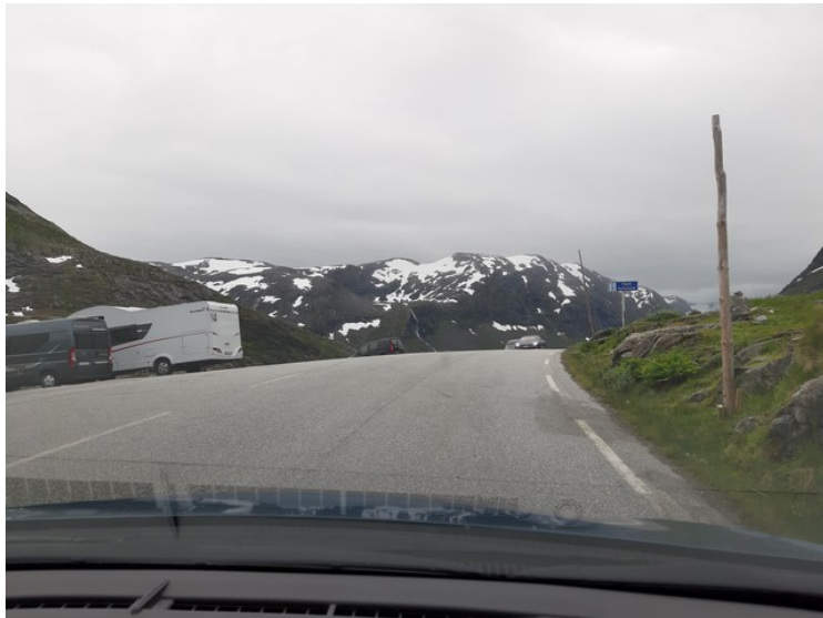
Then we are on our way to the highest point on the road.