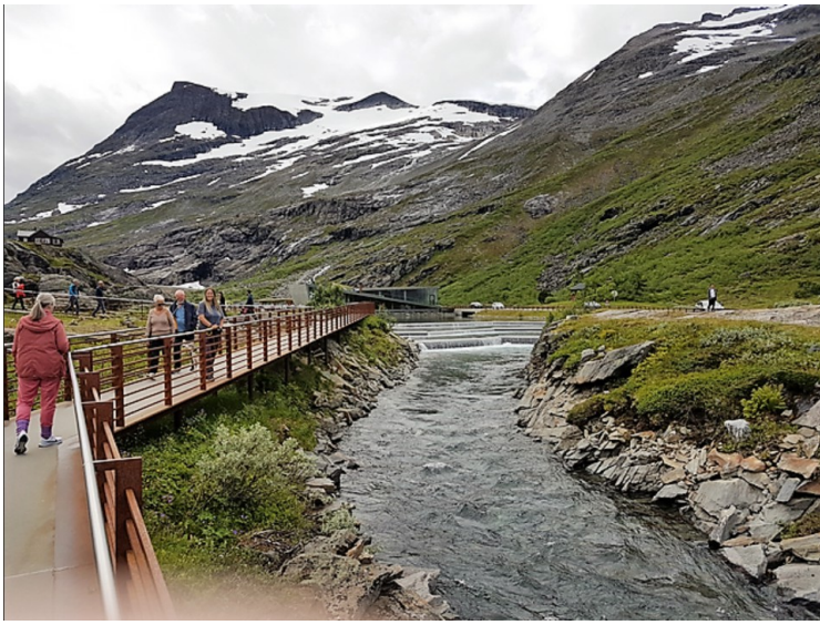
The river before it flows out into the waterfall.