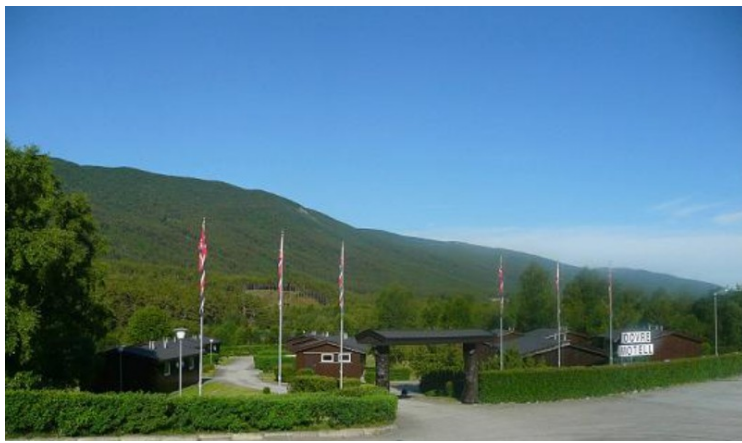
We had booked at Dovre Motell . We had to check in at the gas station and get the keys handed out. This is the entrance to the cabin area.