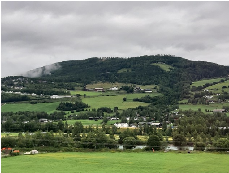
Vinstra and Sødorp .