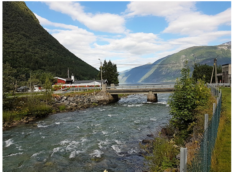
We had booked accommodation in Norddal . The hotel is called Norway Holyday Apartments - Norddalstunet . In this corona time, it was self-service here. We had received the room number and code for the key box by email.