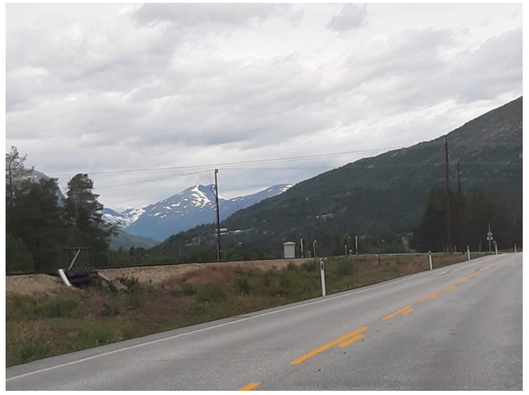
There are big snowdrifts even though it is August. I guess it's Døntinden we see in the distance.