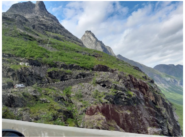
Then it goes further upwards.