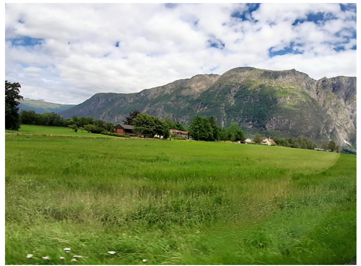
Isterdalen is quite flat at the bottom with a lot of agriculture.