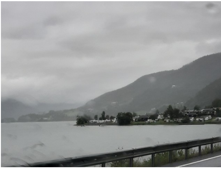
This is at Mageli Camping which is located at Losna, just before we came to Fåvang. Losna is an extension in Gudbrandsdalslågen and is considered as a lake.