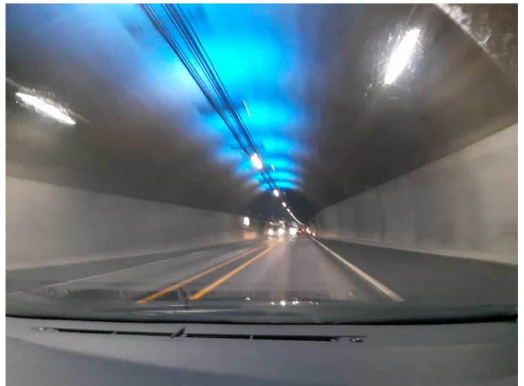
Teigkamptunnelen just before Kvam.