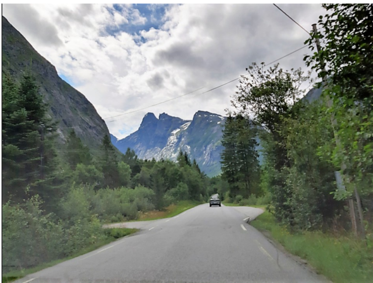
Further up, the valley narrows.