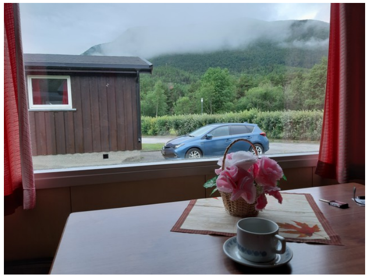
The view from inside the cabin and out towards the car.