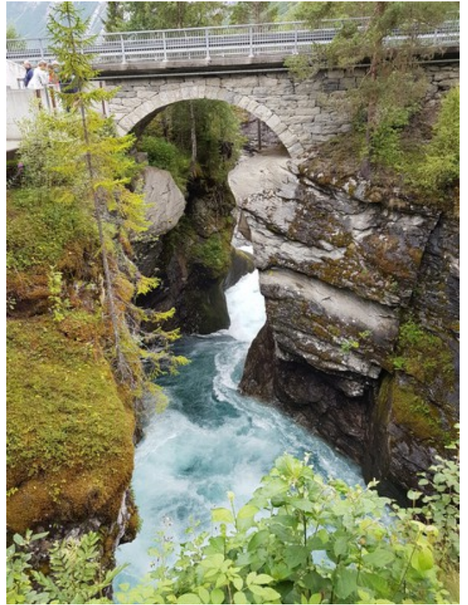
The lower waterfall.