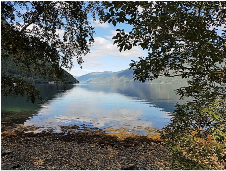
View over Norddalsfjorden.