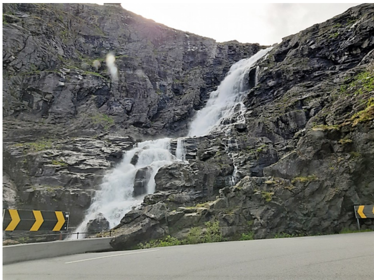
Good view to the waterfall.