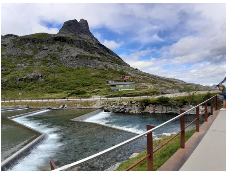
The Ister river is dammed in terraces before it flows out into the waterfall.