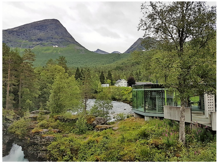
View up the valley. The cafe on the right.