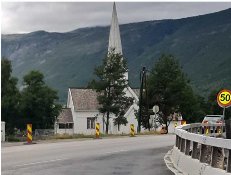
Sel kirke from 1742.