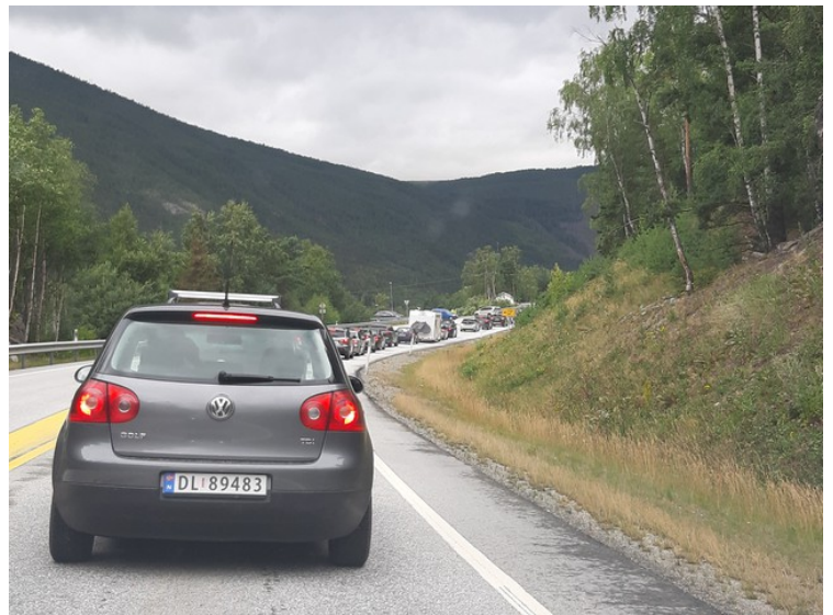
Just after Nord-Sel we had a long stop. There were four cars involved in a traffic accident and the queue was long. There was a waiting time of about an hour.