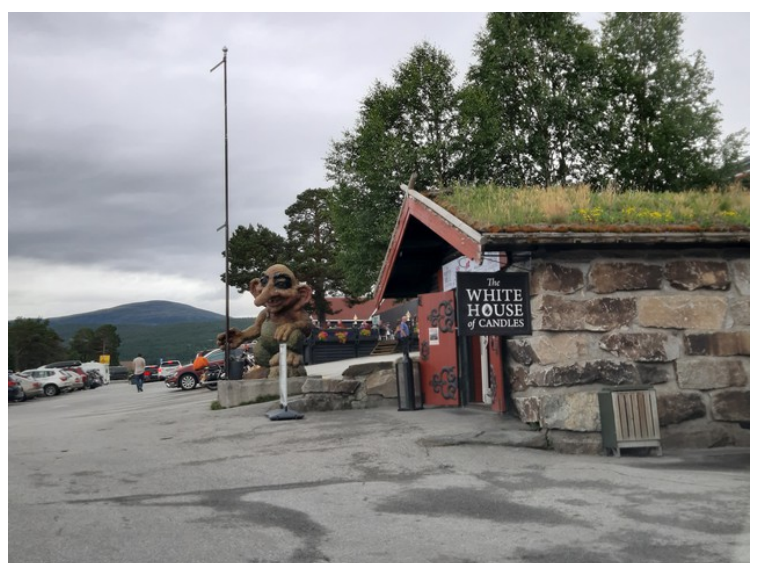
Right next to the shopping center the White House of Candles is located.