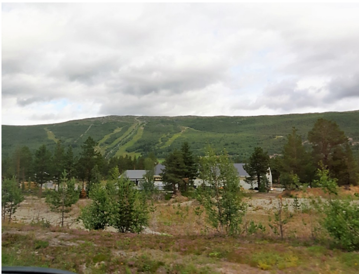
Some pictures from Bjorli . It is popular with tourists all year round.