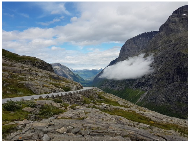
The view down towards Isterdalen.