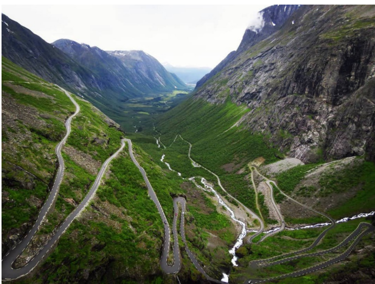
Here we see most of the steepest part of the road.