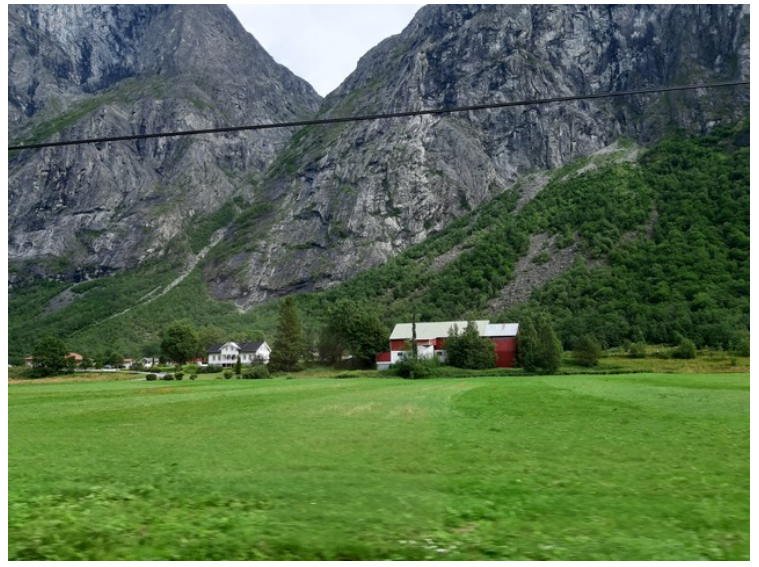
This is also at Marstein.

Towards Romsdalen they form a steep mountain wall, Trollveggen . It is a thousand meters high and is Europe's highest vertical rock wall, and one of Norway's most dramatic rock formations.