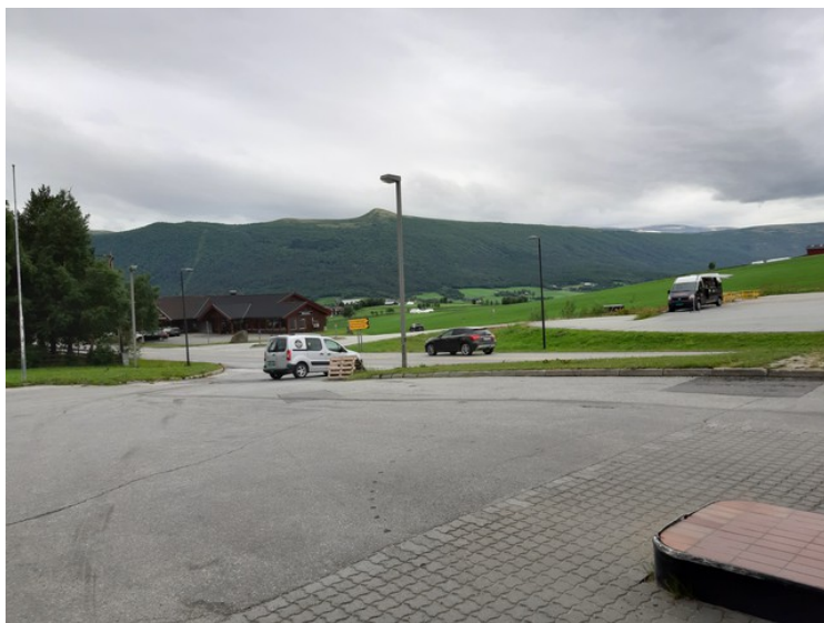
The day after, on August 6, we drove on.