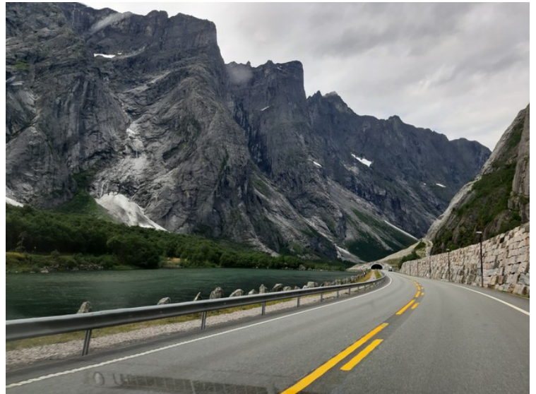
Here we are approaching Fantebrauta tunnel .