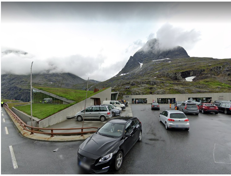
There were many cars in the parking lot.