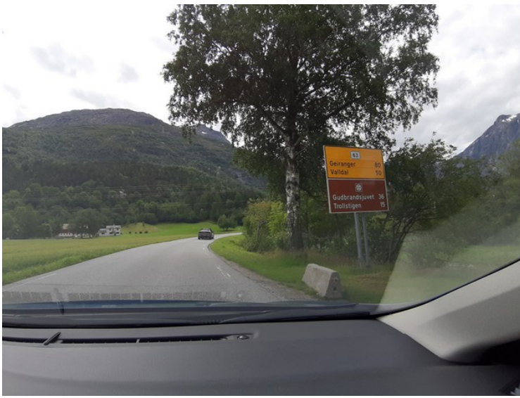
The sign shows that we are on the right track.