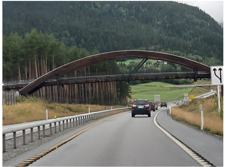
Just past Vinstra.