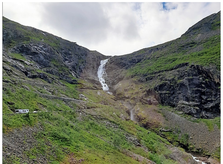
The road upwards crosses Istra a bit up the hill. Here we can glimpse the bridge that crosses the waterfall. The road has 11 hairpin turns and each turn has a name, most often after the foreman who was responsible for this part of the road.