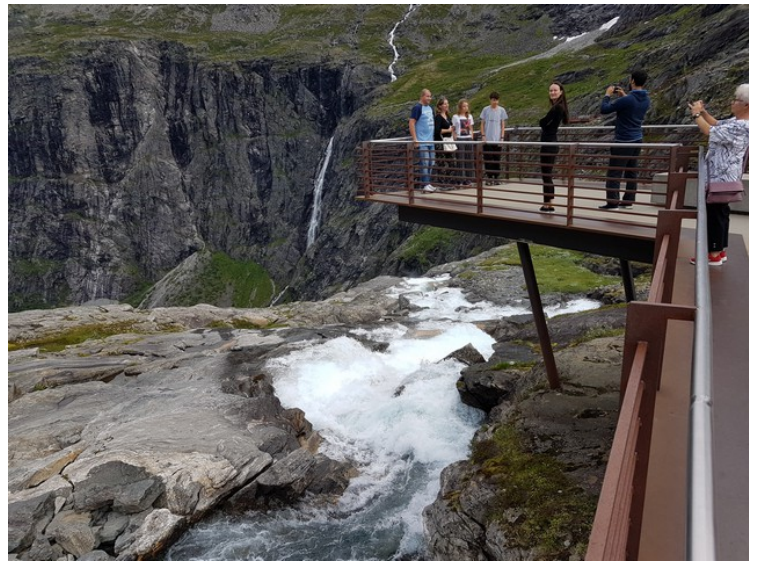
Here it flows over the edge.