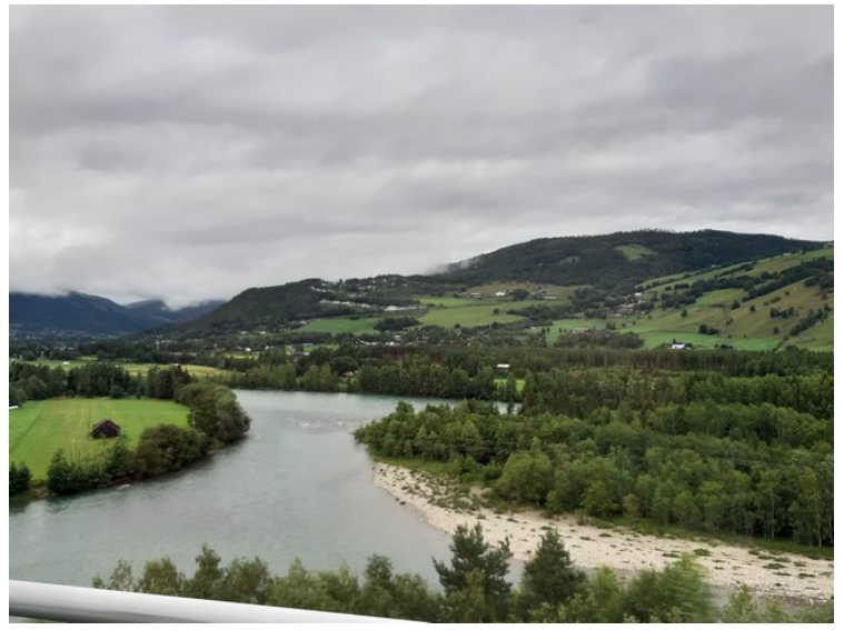
Just before Vinstra .