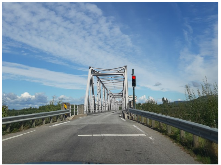
This is the bridge over the Glomma at Arneberg.