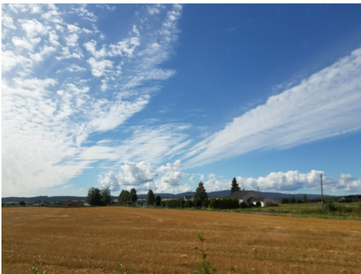
The grain was harvested in many places in the district.