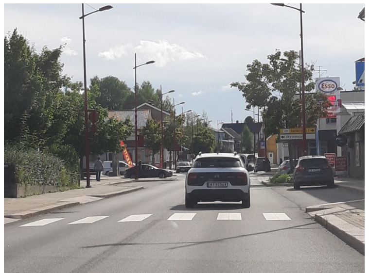
Through the center of Kirkenær.