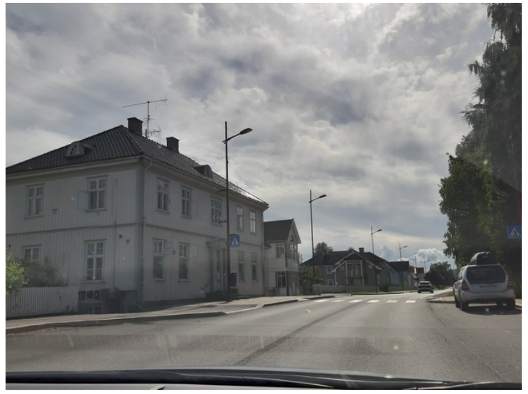
Out of Kirkenær.