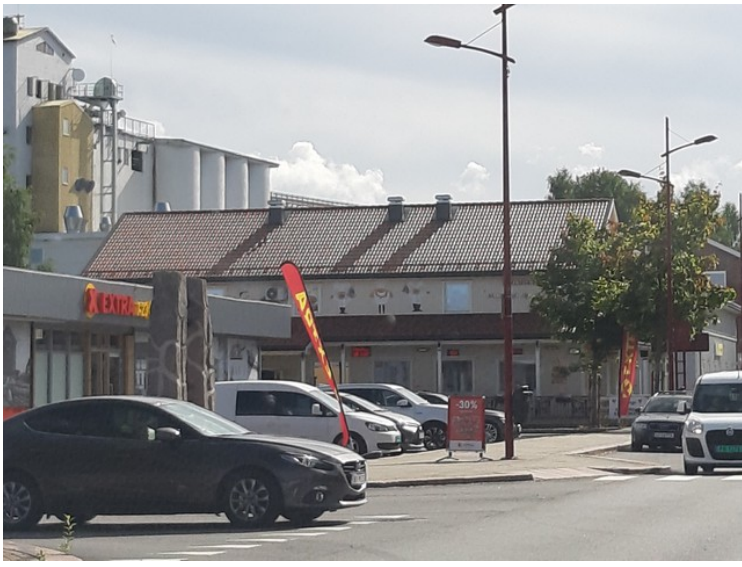
In Kirkenær. Coop Xtra and the grain silo on the left.