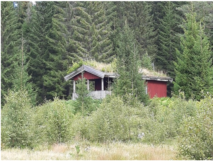
Vakkersætra is located by Holmsjøen.