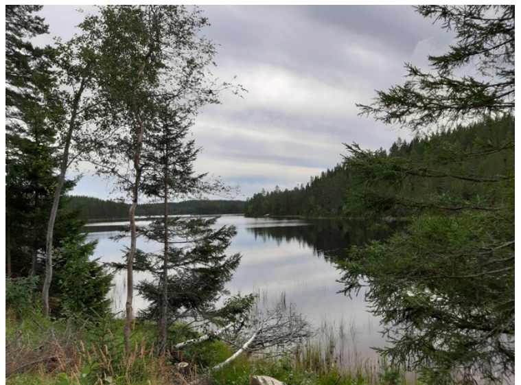
We drove on, almost to Hukusjøen, to Rusvekk. There we drove a gravel road up to Holmsjøen.