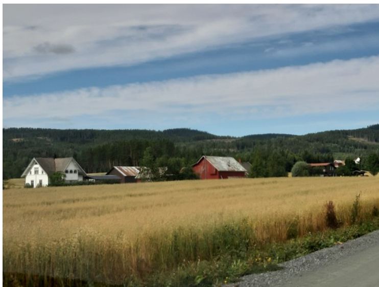
This is at Risberget