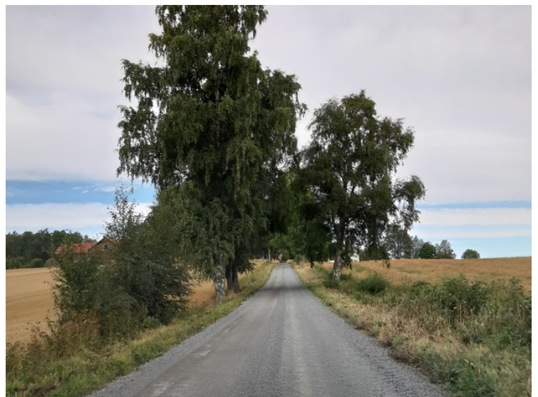
This is right before we get to Risberget.