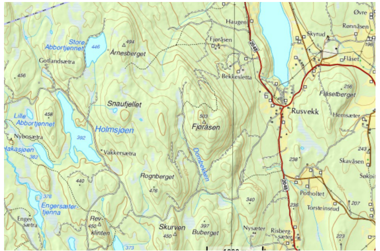
Holmsjøen and Vakkersætra are shown here.