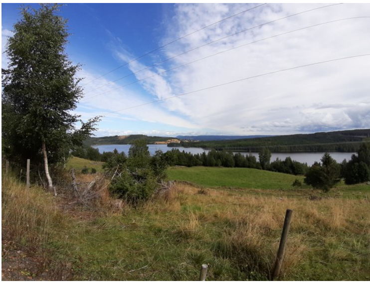
After we had been at Holmsjøen, we drove down again and further north on the west side of Hukusjøen.