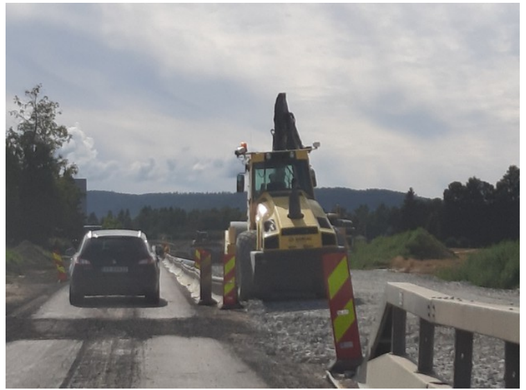
Just south of Kirkenær there was road work, so we had to wait a bit to get the green light.