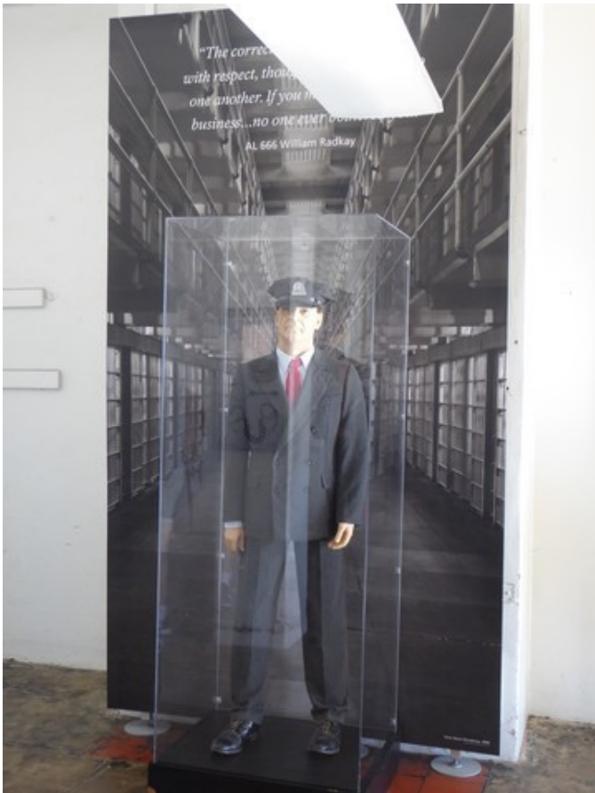
Typically guard uniform.