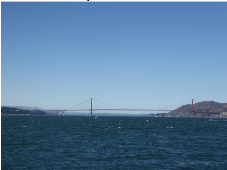
Golden Gate Bridge.