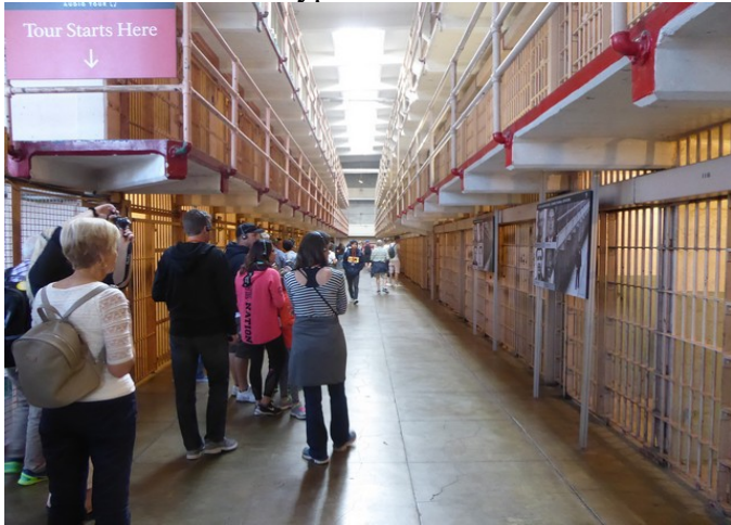
There were several passages like this. Link.