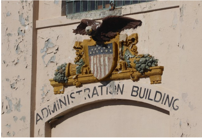
Sign over the entrance door.