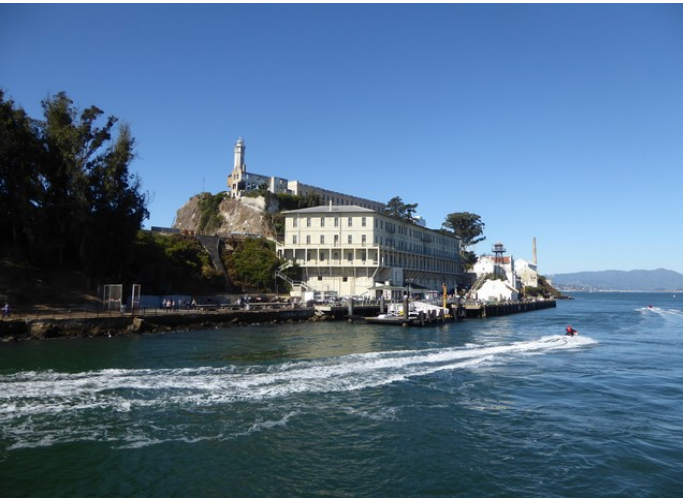
On the way back to San Francisco.