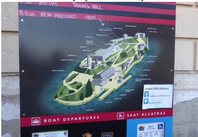
Map and boat schedules.