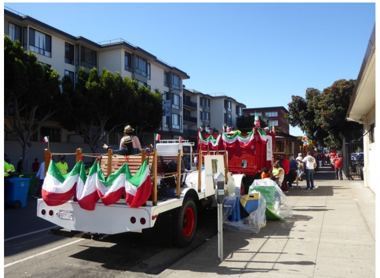
Back in San Francisco, the parade is on.