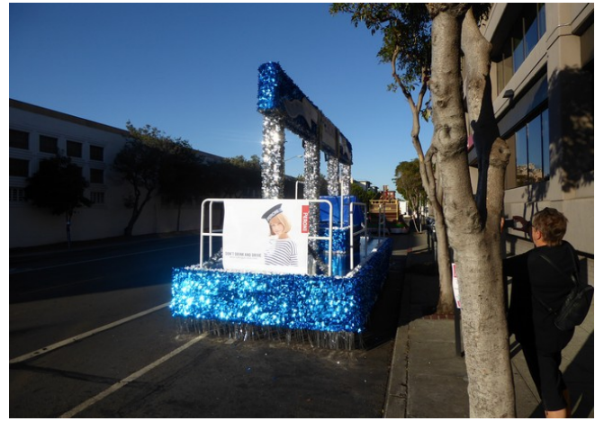
On the way we passed many who made ready for the parade later in the day.