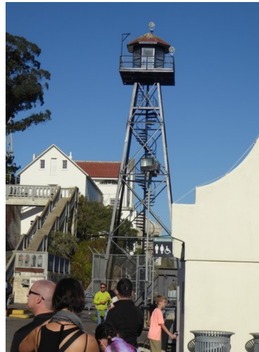
Watchtower in the harbor.