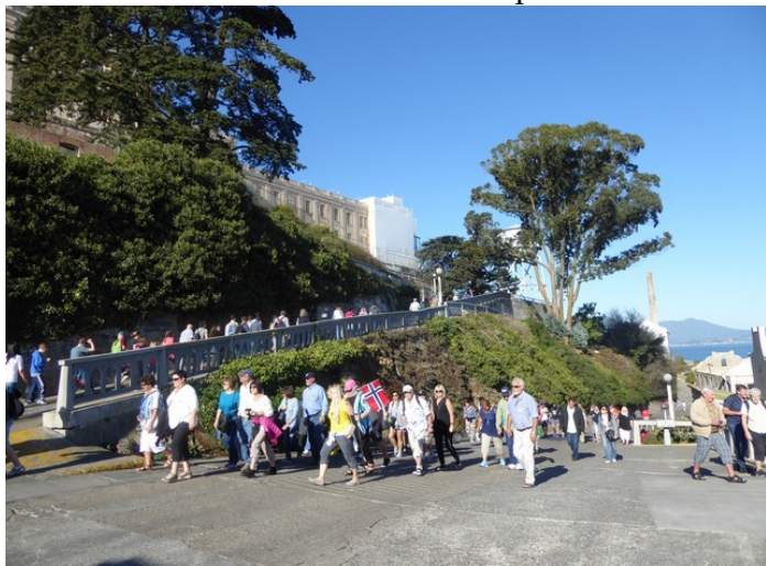
On the way up towards the prison.