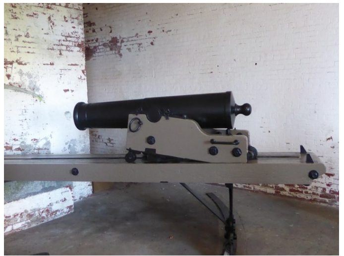
From 1866 the military on the island should defend San Francisco, and 111 major and minor guns were placed around the island.