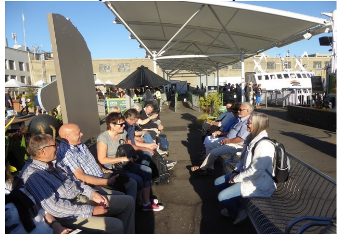
Here we are sitting and waiting to be allowed to go aboard the boat. It runs from Pier 33 .