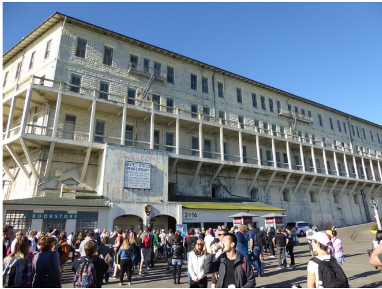
The military began using the island in 1859. This is building 64 . There were barracks for officers with families. They were built in 1905. The fort was abandoned in 1933.