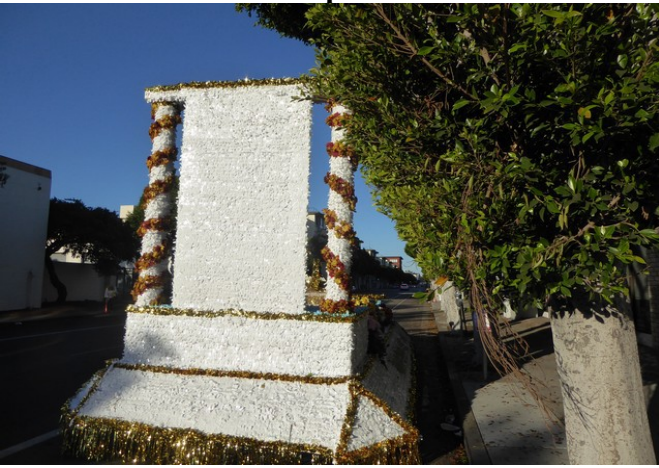
Sunday, October 9th, we were with a tour to Alcatraz . We walked down to the harbor where the boat went from.