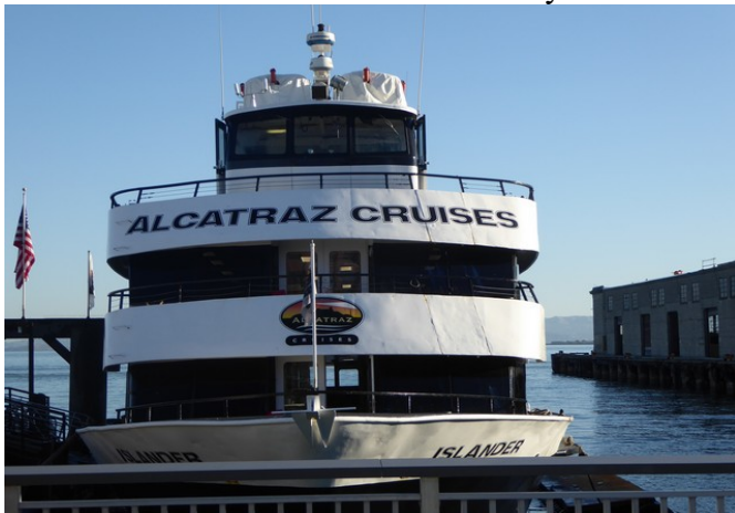
Here is one of the boats.