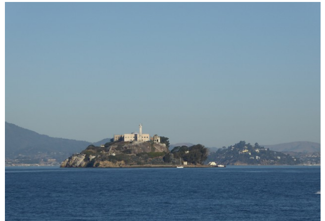
Alcatraz , the famous prison island, in sight.