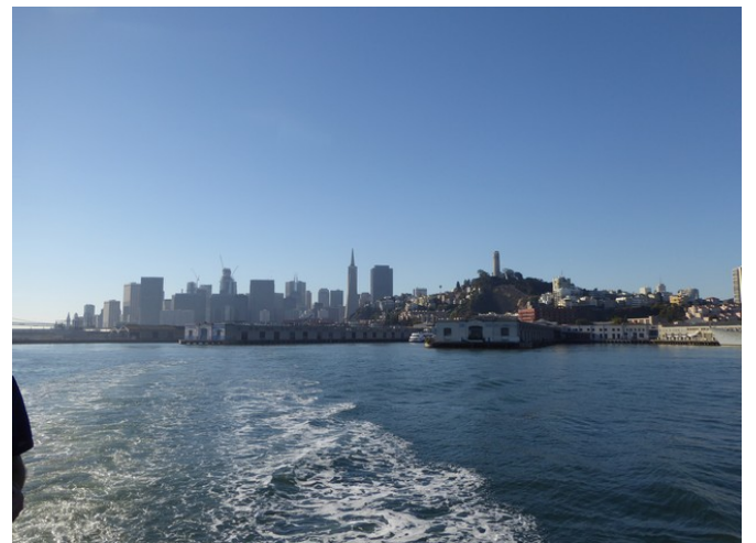
Looking back toward San Francisco.