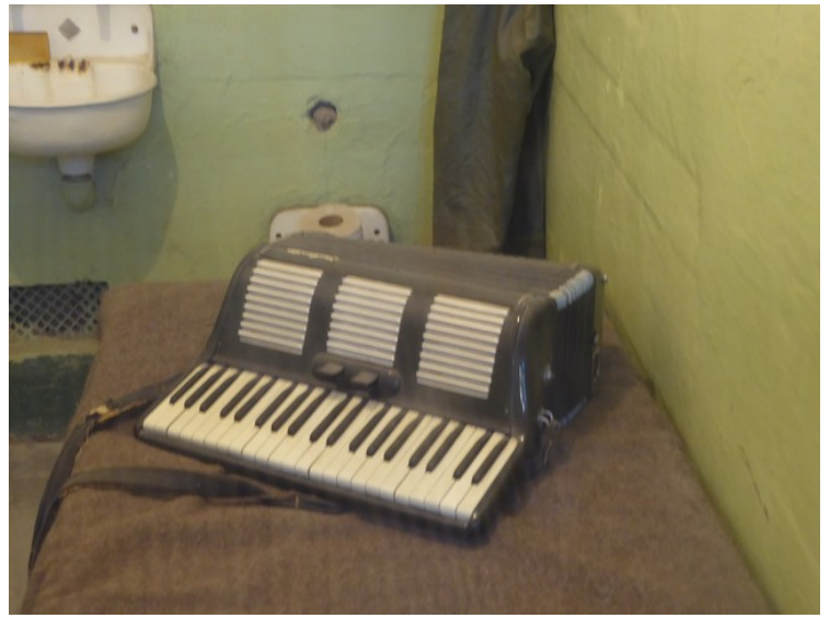
One of the prisoners had an accordion.