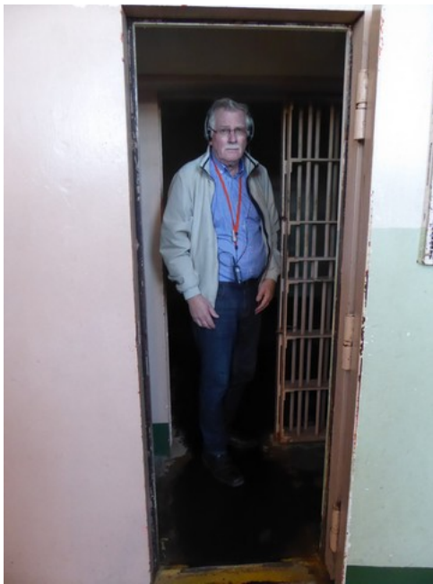
I had to try a cell. I quickly went out again.