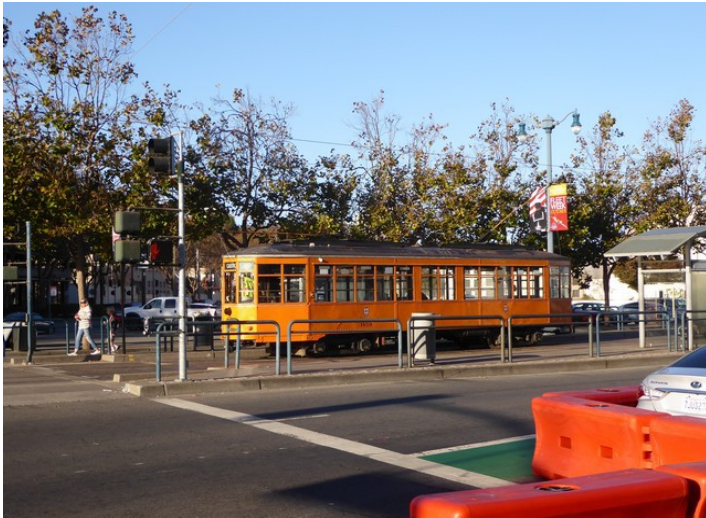
One of the trams in the city.