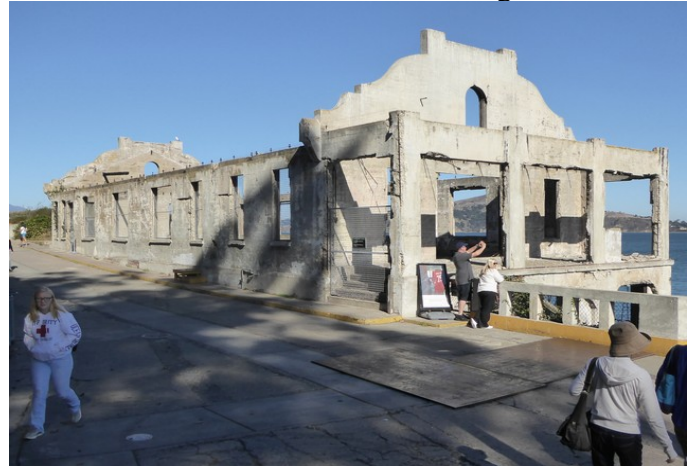
This was once an officer club.