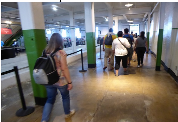
In line to get the audio guide.