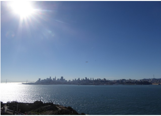
View to the town.