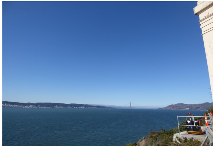
View to Golden Gate Bridge.