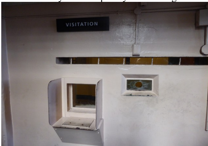
Here it was possible to visit.