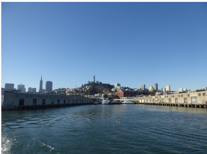
From the harbor.