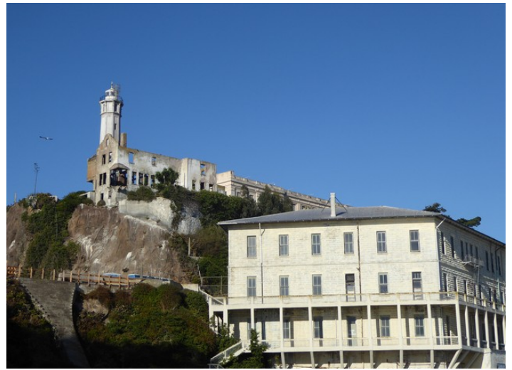
Then we docked at Alcatraz. The Lighthouse at the top was finished in 1909. It was a lighthouse here before too. It was built in 1854 and it was the first that was built on the west coast.