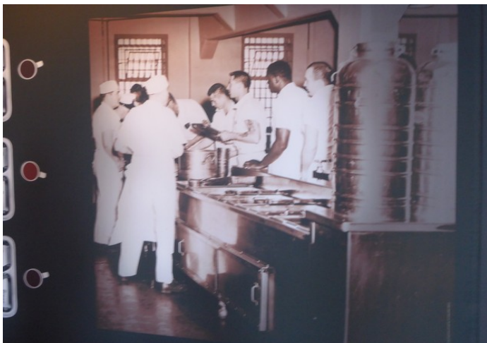
Old picture from the kitchen.