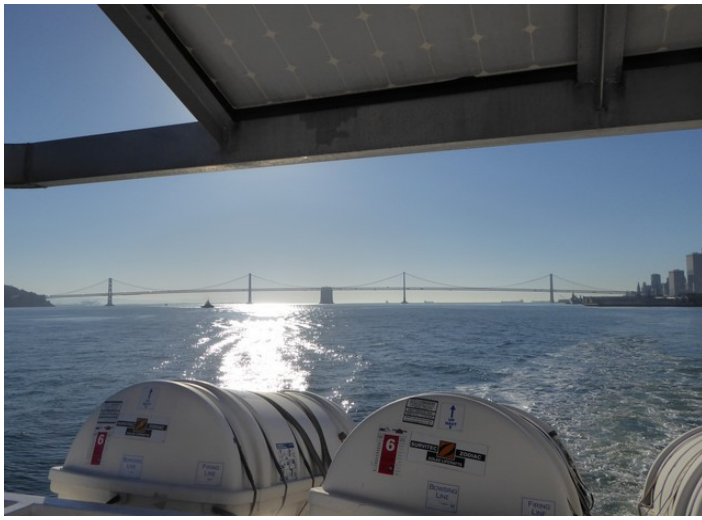
This is the bridge, San Francisco - Oakland Bay Bridge , which goes over San Francisco Bay .