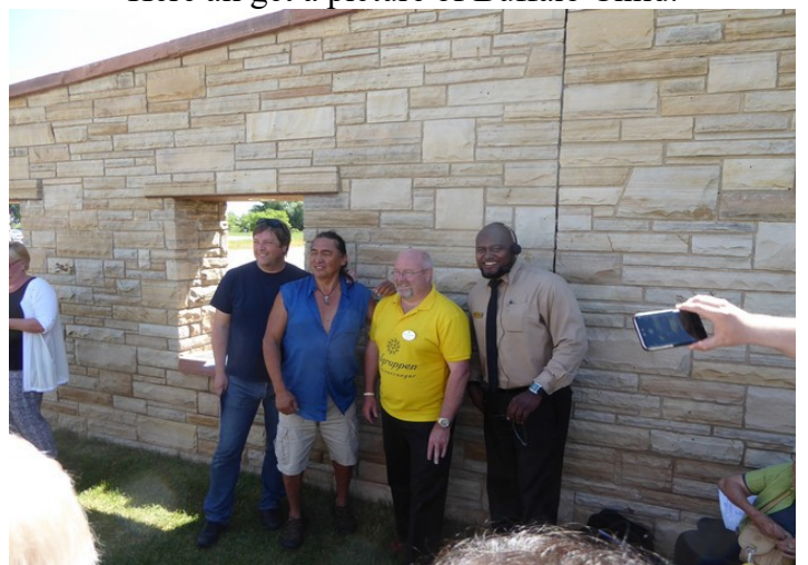
Here we got the photos eventually.