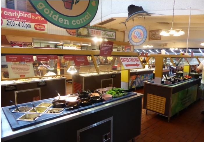
We had lunch in Rock Springs in a restaurant called Golden Corral . It is a nationwide chain. There was lunch buffet here.