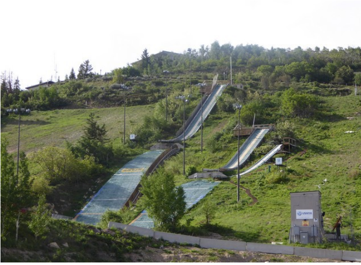
Day 10, June 8, the trip went from Salt Lake City to Cheyenne. Here we come to the ski jumps where the Winter Olympics were held in 2002. These are the smallest jumps.