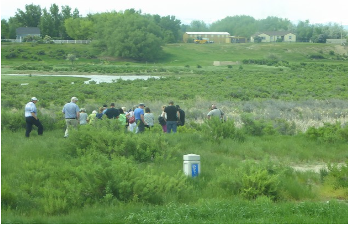
On the road further east, we had a toilet break. Here Buffalo Child found out that it was OK to perform a ceremony here, where everyone has the chance to ask questions. To participate, you have to give tobacco to Buffalo. He also had with him a ceremonial pipe .