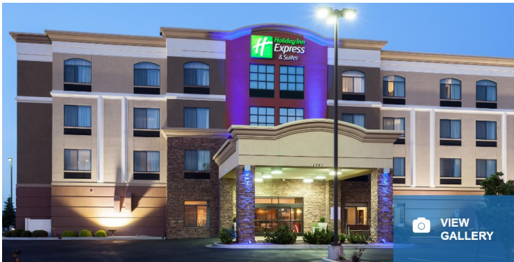
This time we stayed in Cheyenne in hotel called Holiday Inn .