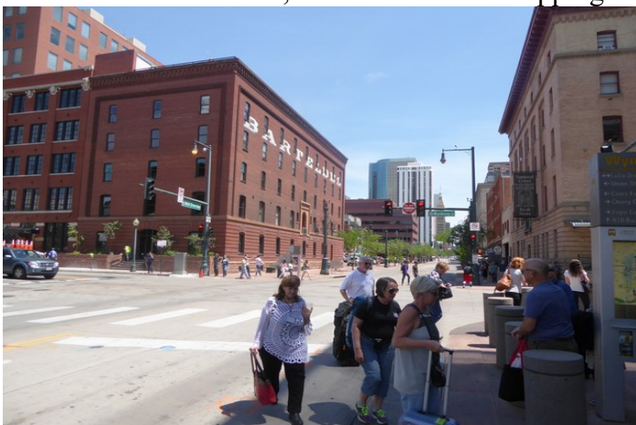
Then it is just before the bus arrives.