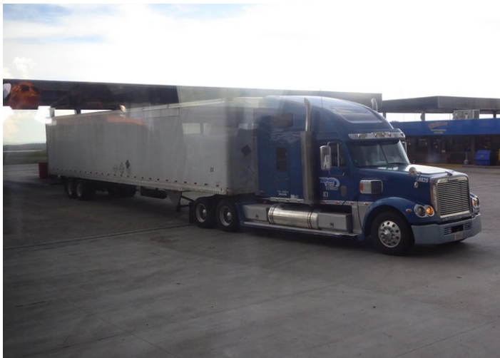
This is a normal trailer.