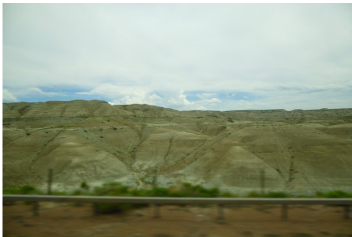
Further eastwards the countryside look like this.