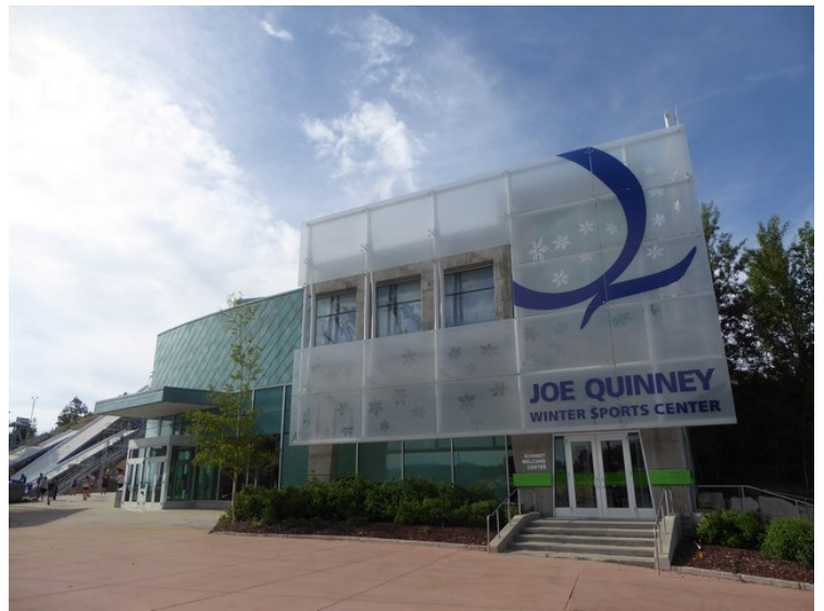
This is a shop and a museum. Alf Engen ski museum is located here.