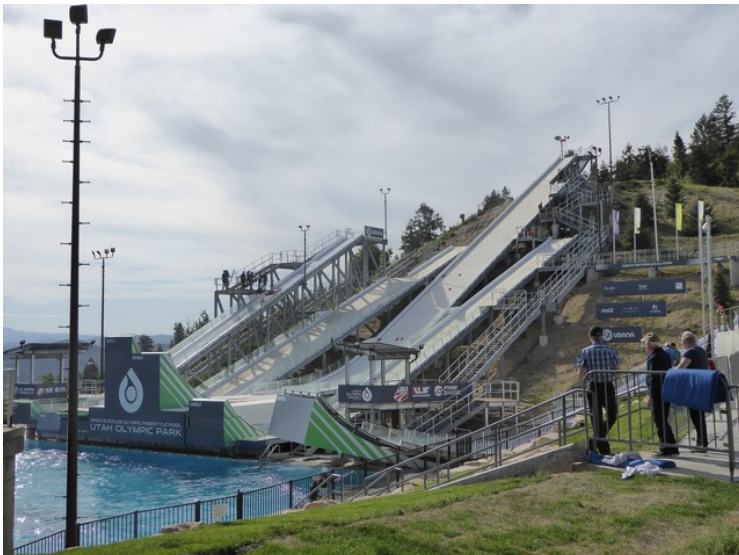
Freestyle hills. They were used as training hills when we were there.