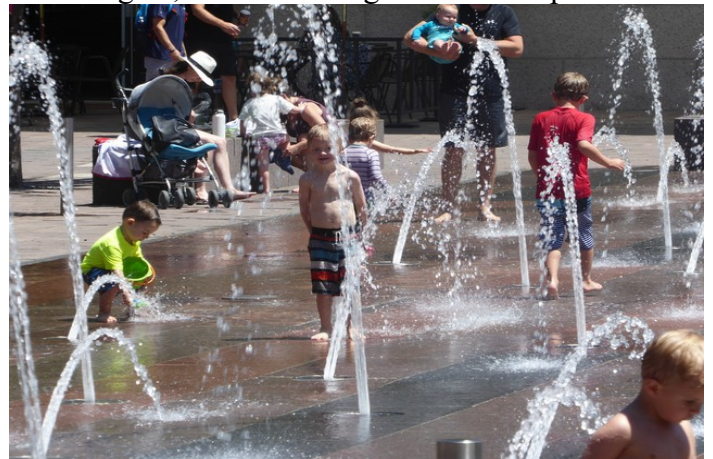
We ate some lunch and watched the kids playing in the fountains.