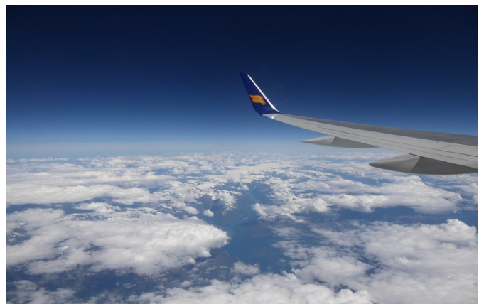
Then on the plain back to Gardermoen via Reykjavik.