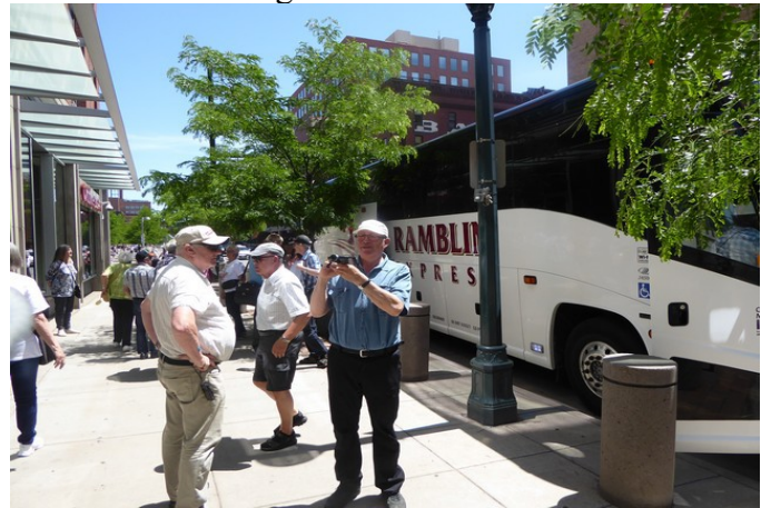
Day 11, June 9, it return day. Here we come to Denver again, before heading out to the airport.