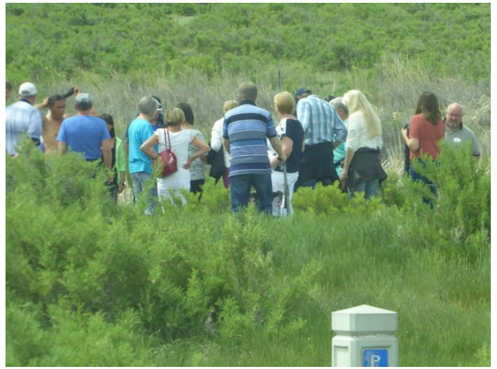
Those who would be part of this had to sit in a circle. They were not allowed to have watches, cell phones or camera with them, and they had to sit quietly during the ceremony.