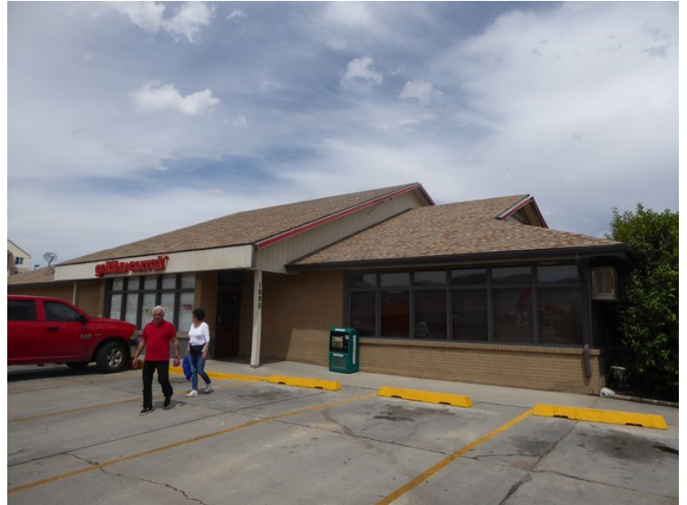
This is outside the restaurant.