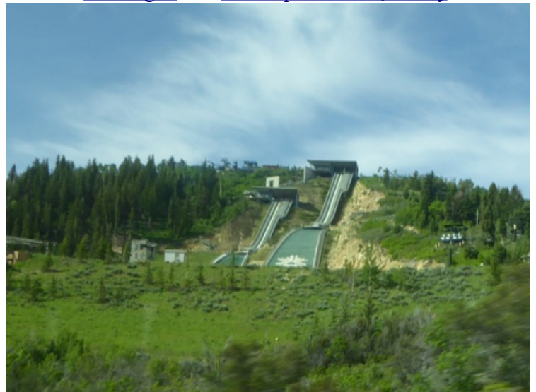
These are the two main hills.