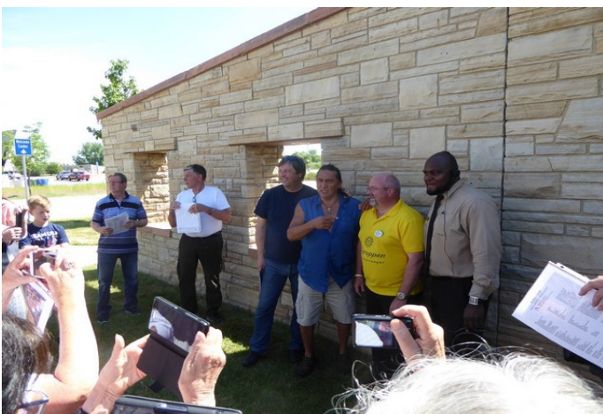
He had promised during the whole trip that everyone would get a provisional Indian name.