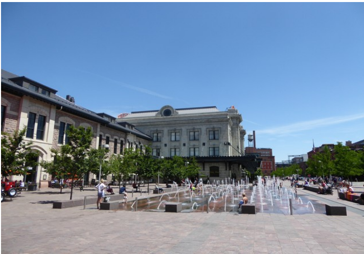
Those who wanted to, could do the last shopping.