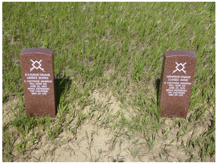
There are also markings on the places where Indians fell. There were 128 Indians who fell in the battle.

Moreover, a horse memorial. There were 39 dead cavalry horses.