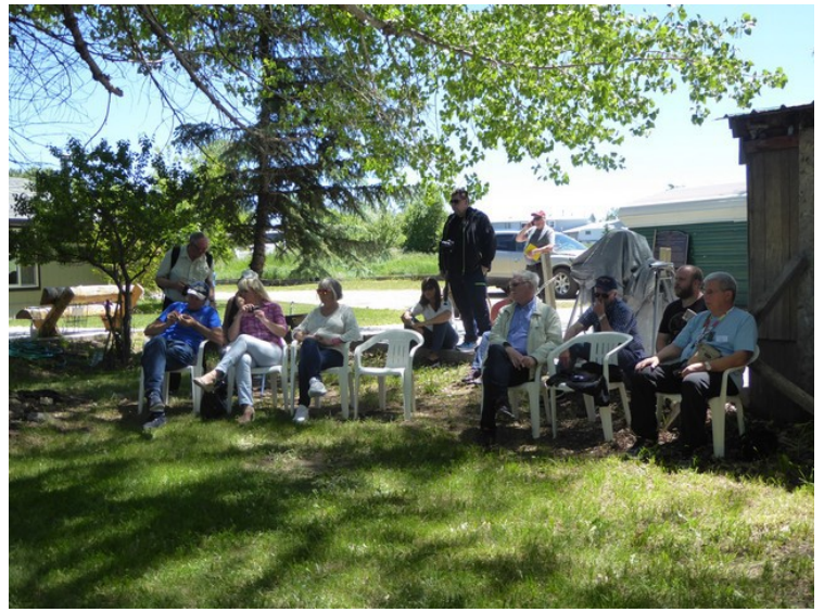
We sit in a circle.