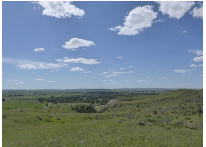
Views from this height.