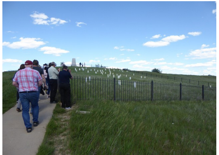
Here are many white markings.