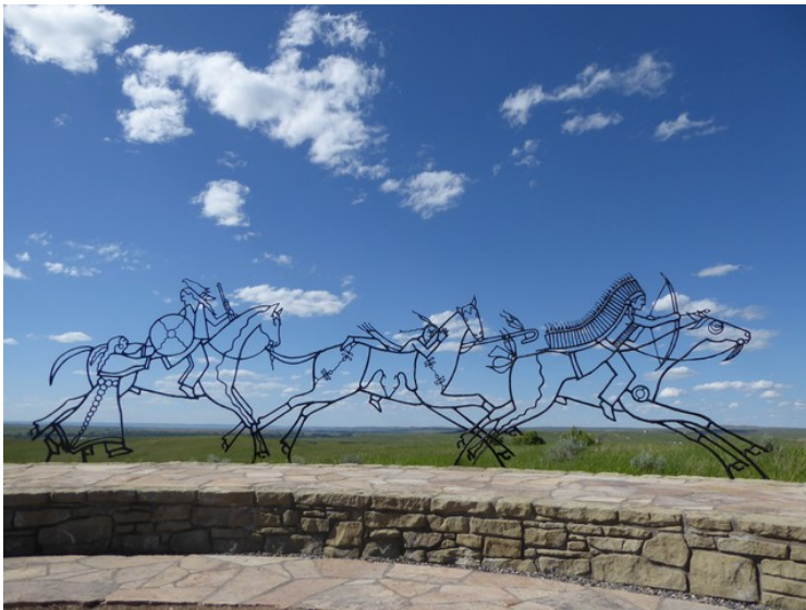
These figures stand on a monument to the Indians who fought for their country and their way of life.

Moreover, a horse memorial. There were 39 dead cavalry horses.