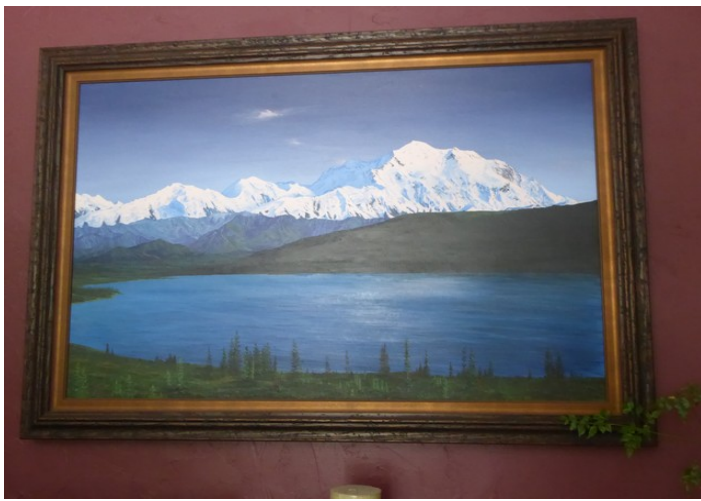
She has painted many pictures of the mountains.