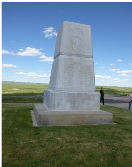
U.S. Army Memorial on Last Stand Hill.