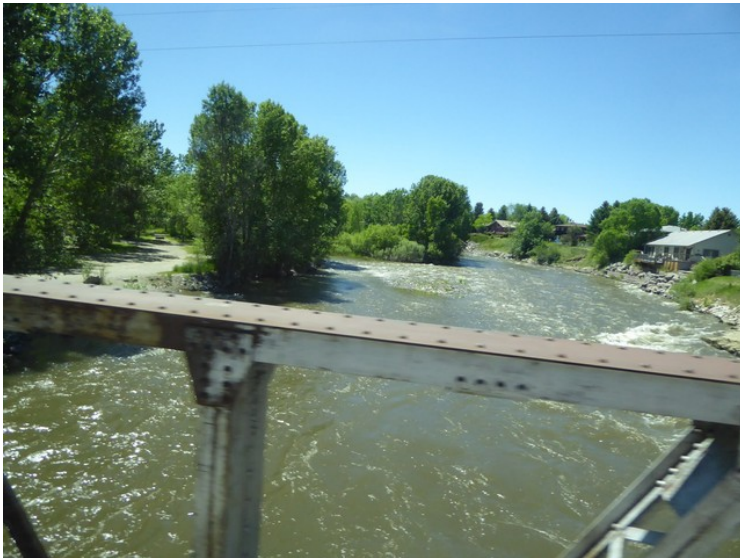
When the dance was finished, it was time for lunch. Here we go over the Yellowstone River.