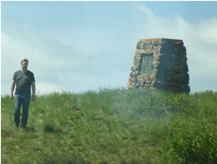
Day 5, June 3, we were going to places where there have been battles between whites and Indians. This is a memorial for fallen white soldiers.