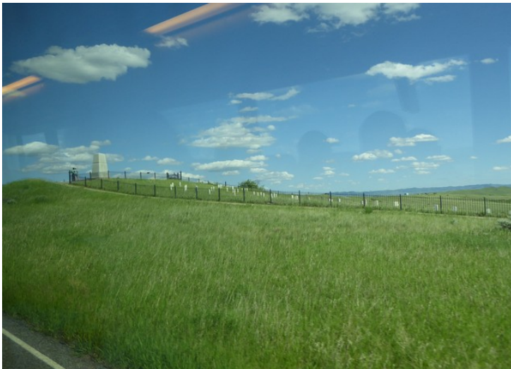
Here we come to the main battlefield.