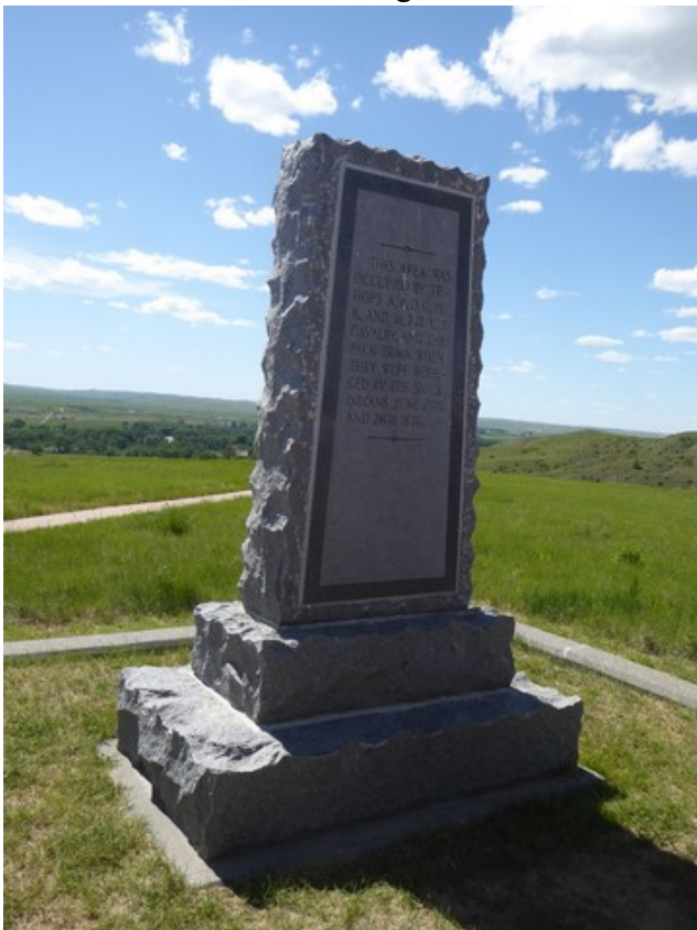
After lunch we drove a short distance up to the site of the Battle of Little Bighorn, Reno-Bentzen Battlefield. A memorial.