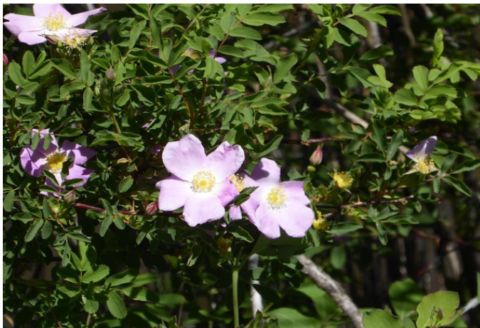
Wild flowers along the road.