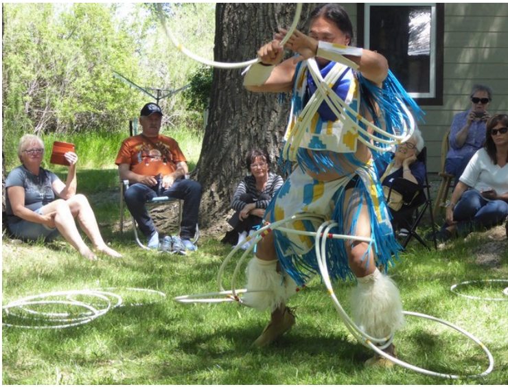
There are many hoops to keep track of.