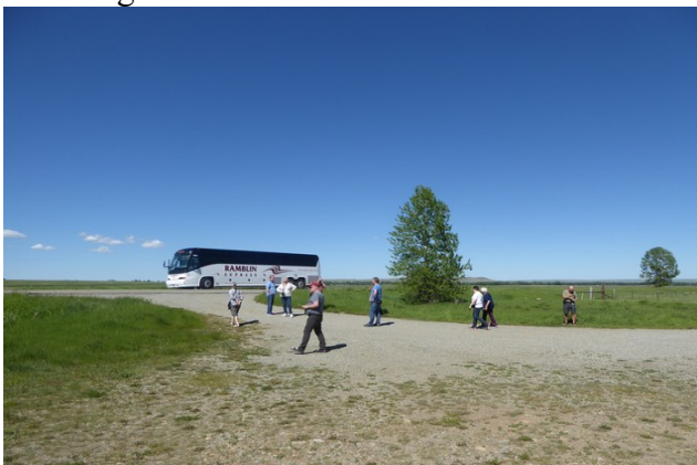
Then we leave.