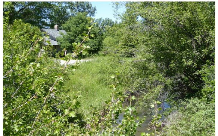
A stream runs right by the house.