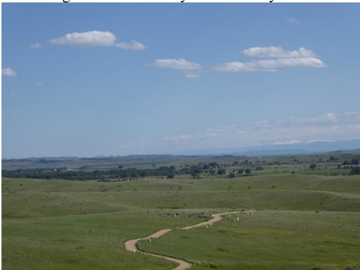
Nice view with a sad story. Many white markings along the trail.