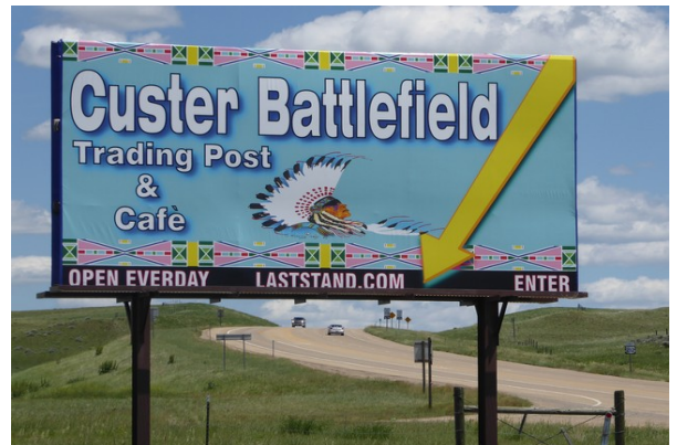
The name of the restaurant: Custer Battlefield Trading Post & Cafe.