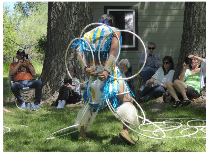
Here he started dancing.