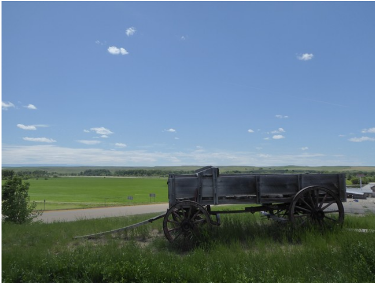
An old wagon.