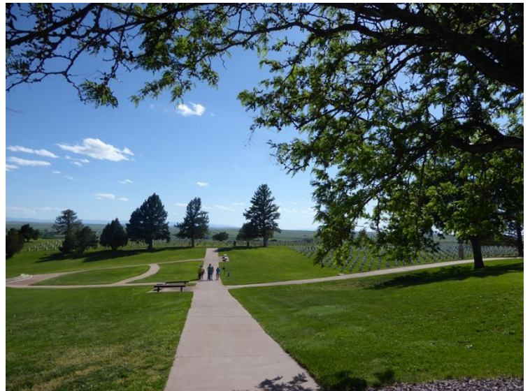
A little further away, in the same area there is a cemetery, Custer National Cemetery .