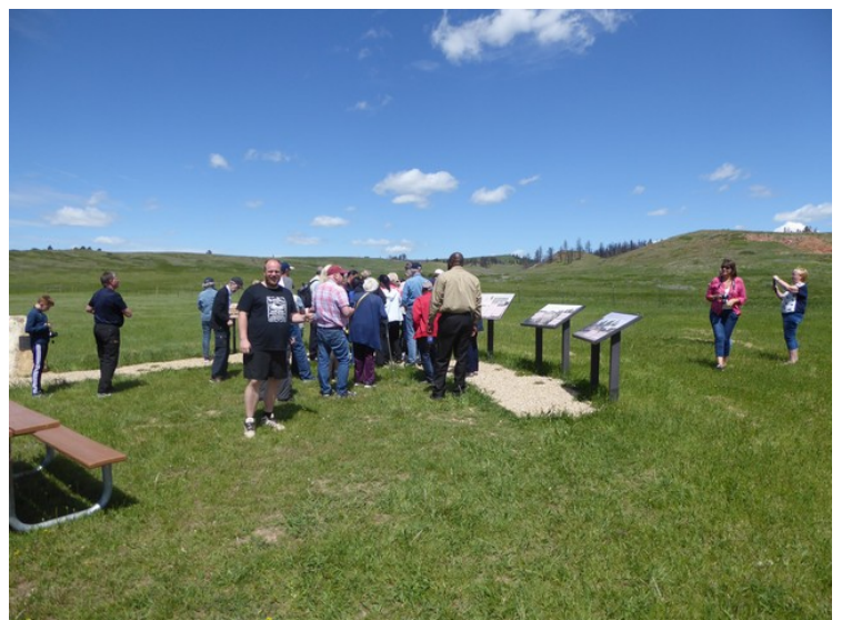
There is put up a series of information posters that tell about the battle.