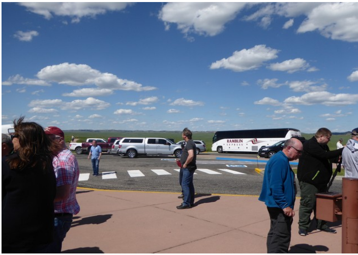
We first drove over to the Reno-Benteen Battlefield.