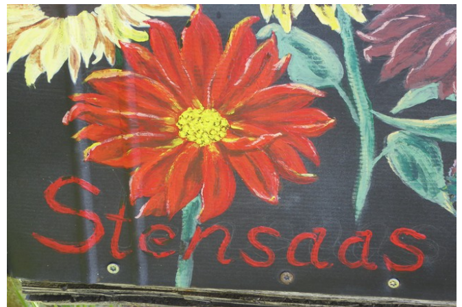
She has painted her mailbox.