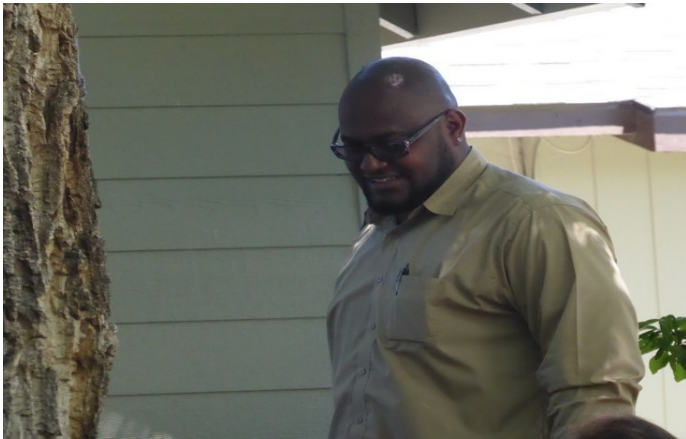
The busdriver was standing in the shade.