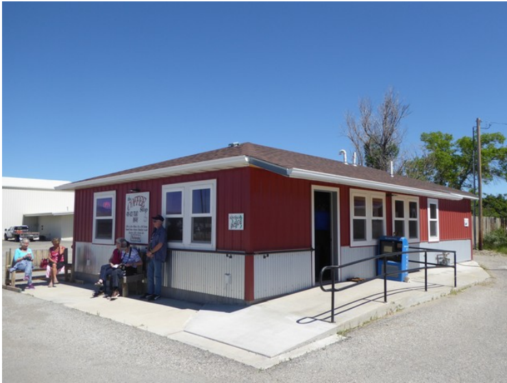
In Big Timber we stopped first to try the best « White Chocolad Caramel Coffee » in the district.

We should, according to plan, been on two reservations this day to learn about the living conditions in the reservations, but Buffalo had not managed to arrange it. Then Tore Strømøy took over on the fly and arranged a trip to Big Timber . Here we are approaching.