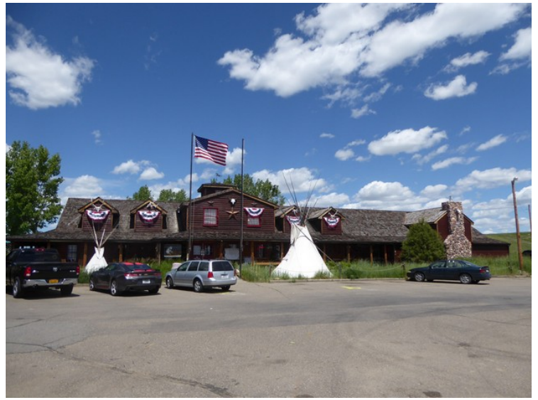
Then it was time for lunch. We drove back to Little Bighorn.