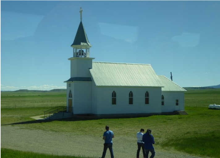
It is completely deserted here. No buildings nearby.