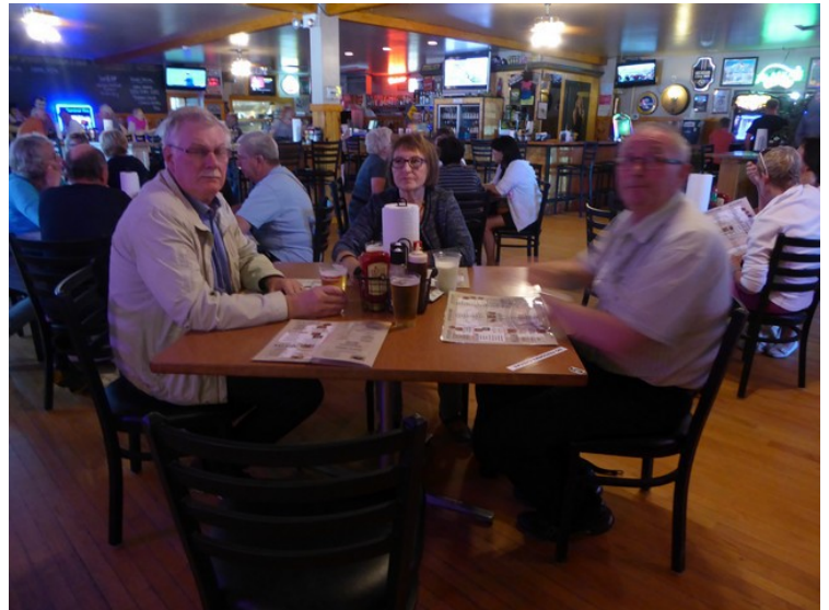
Here the luncheon is consumed.