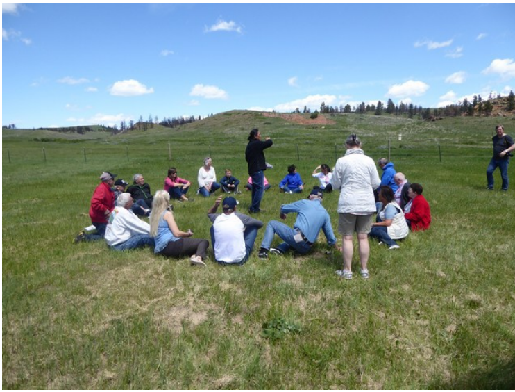
Buffalo Child performed a ceremony that we all were in on.