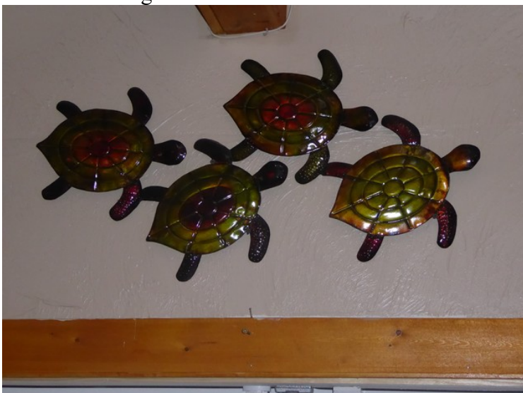
The restaurant is named Thirsty Turtle , therefore turtles on the wall.