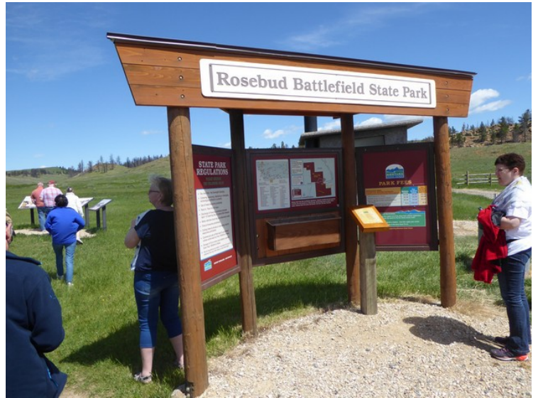
Right beyond is Rosebud Battlefield . This battle was only a few days before the Battle of Little Bighorn, on 17 June 1876.