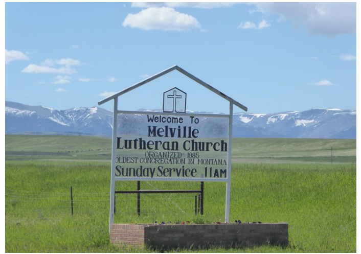
We drive to this church.