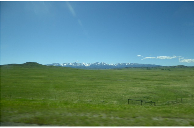
After lunch we drove towards Melville . We look over to the Crazy Mountains. In the area here, many Norwegians settled.