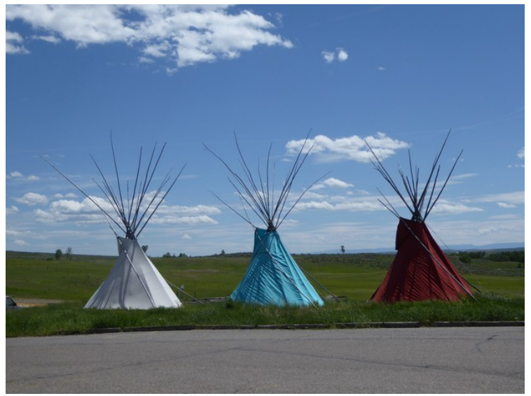
More tipis outside.