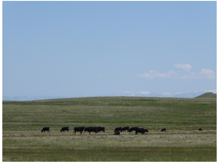
Farther away, cows are grazing.