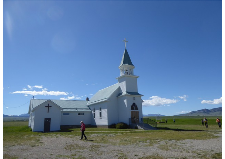
The church was built in 1914.