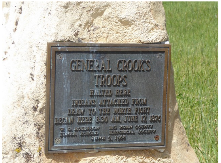
A stone with inscriptions. The white army was lead by general George Crook and the Indian army by Crazy Horse .