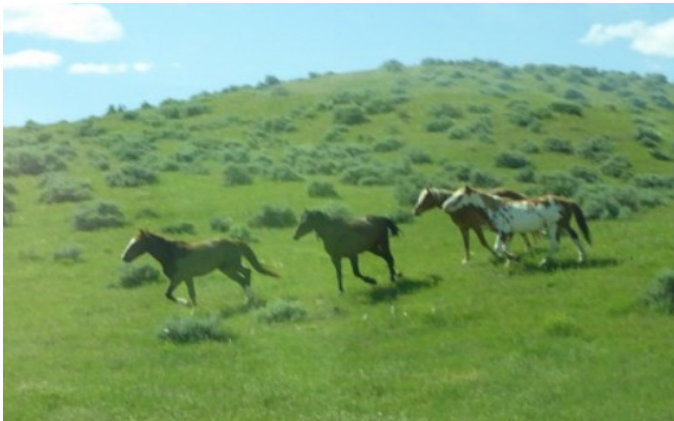
On the way back to the Custer Battlefield, we see these horses.