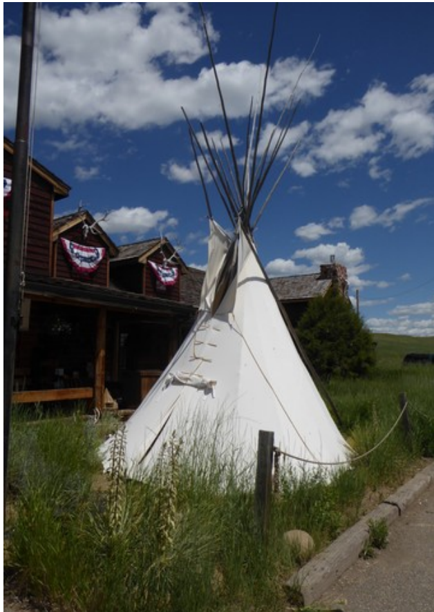
A tipi outside the restaurant.