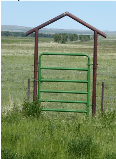
A gate in the fence around the church.