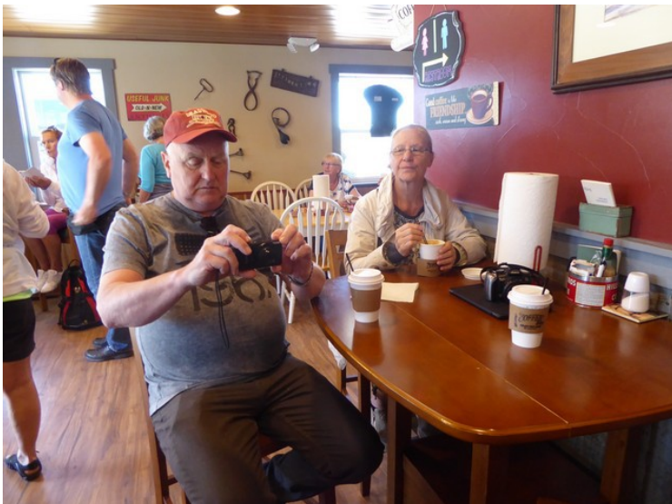
Here we try the coffee.