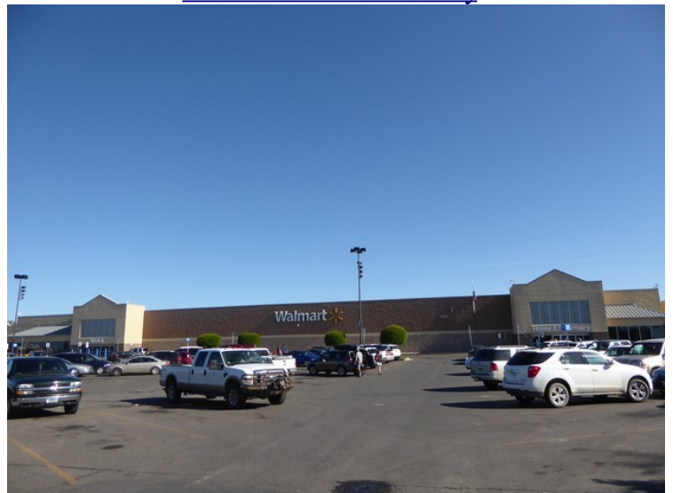
The next day, day 6, the 4 th of July, Buffalo Child needed to buy batteries. Here we are on Walmart .