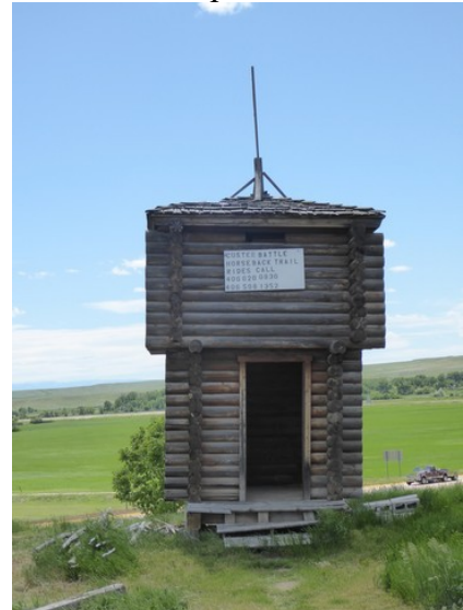
A log house.