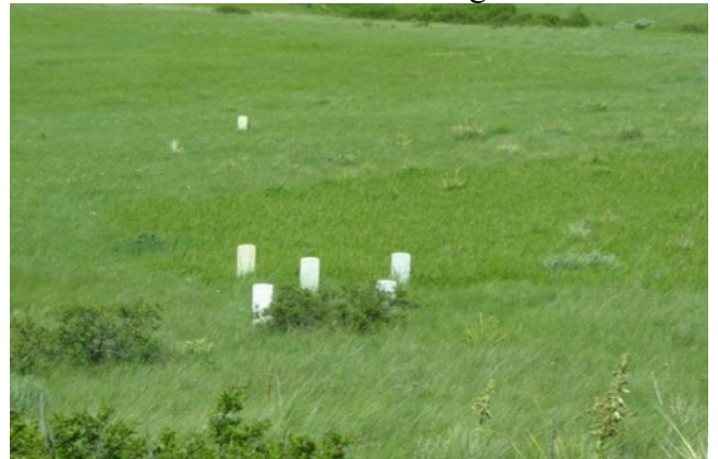
The white marks are marks where the white soldiers fell. There were 268 who fell here.