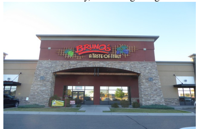
In the evening we had dinner at Bruno's .