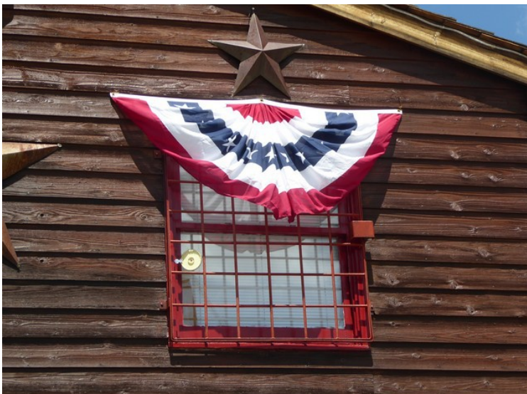
Decorations outside the walls of the restaurant.