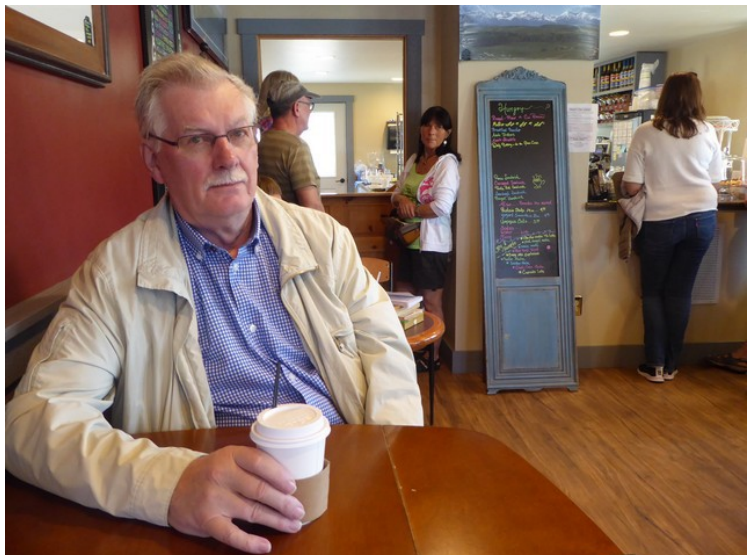
It was pretty good.