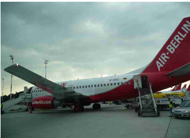
The plane we travelled with. It took about 11 hours from Berlin to Bangkok.

It is planned to shut down the airport in connection with the merge of all the airports into Berlin-Brandenburg International Airport.