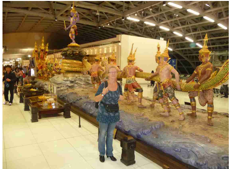
Decorations in the corridors.