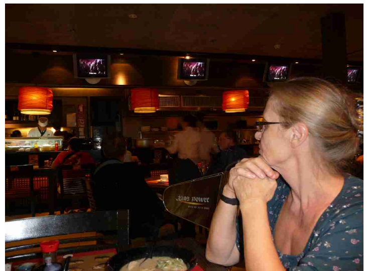
Waiting for the food.