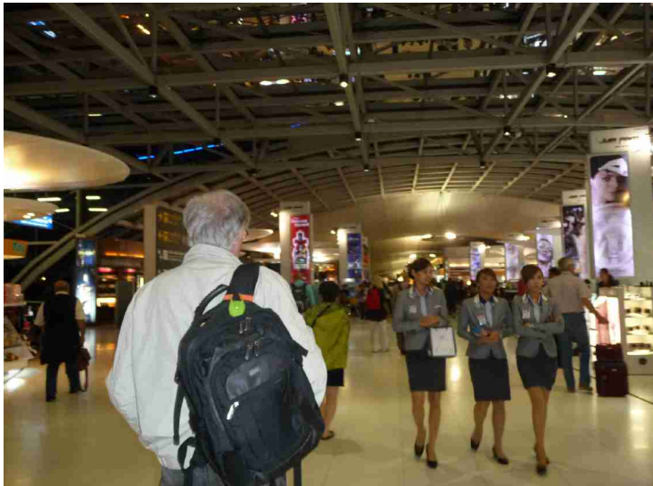
At the airport in Bangkok

When going back to Norway, after staying there for about half a year, we chose to go with Thai Airways, which went directly from Bangkok to Oslo.