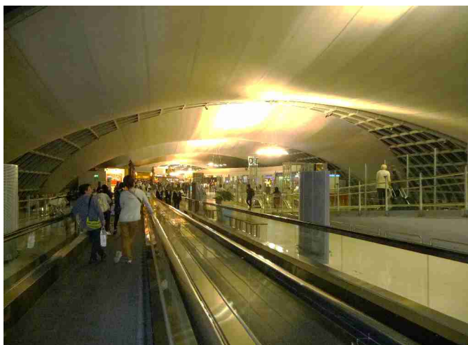
Rolling pavements exist at most airports.