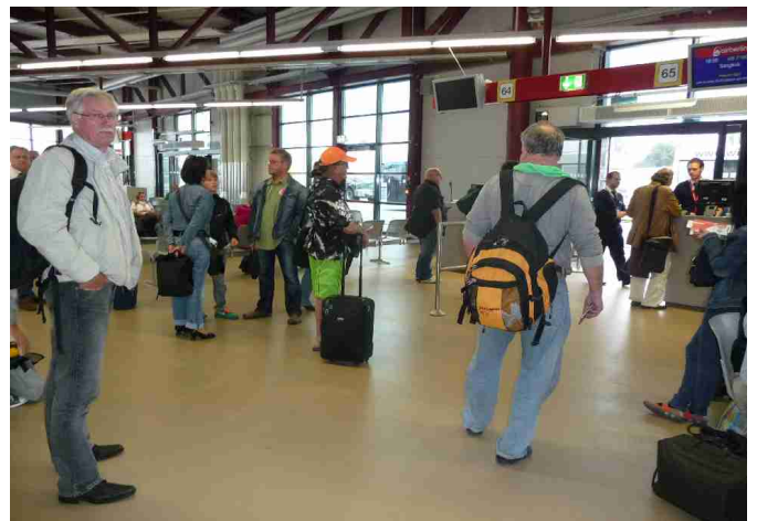
Here we have arrived in Bangkok and are going to get the luggage.