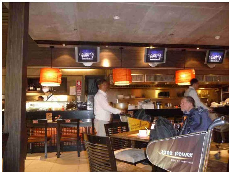
The restaurant where we were eating.