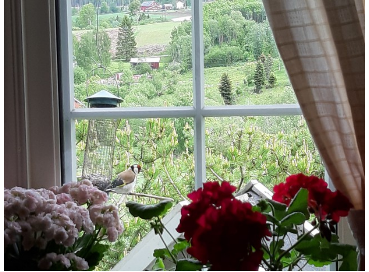
Outside the kitchen window we saw a goldfinch eating seeds.