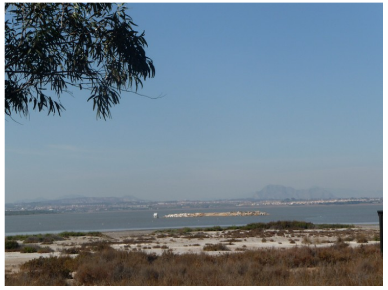
When we were there, the birds were out on a small island in the lake. They who would look at them needed binoculars.