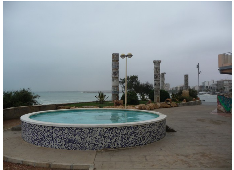
Just before arriving to the center of the town, we come by a headland where there stand some pillars.