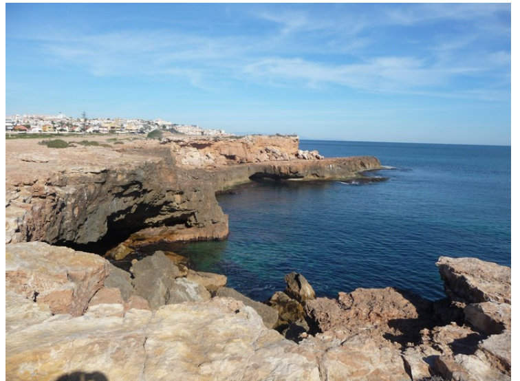
There are steep cliffs on this stretch.