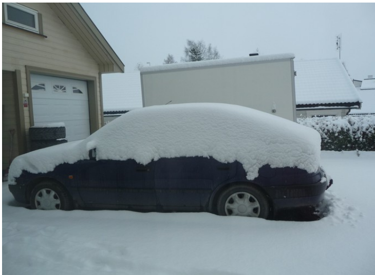
We got snow, and then it was time to go.