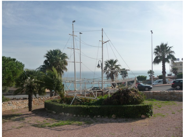
Here is the «ship» again.