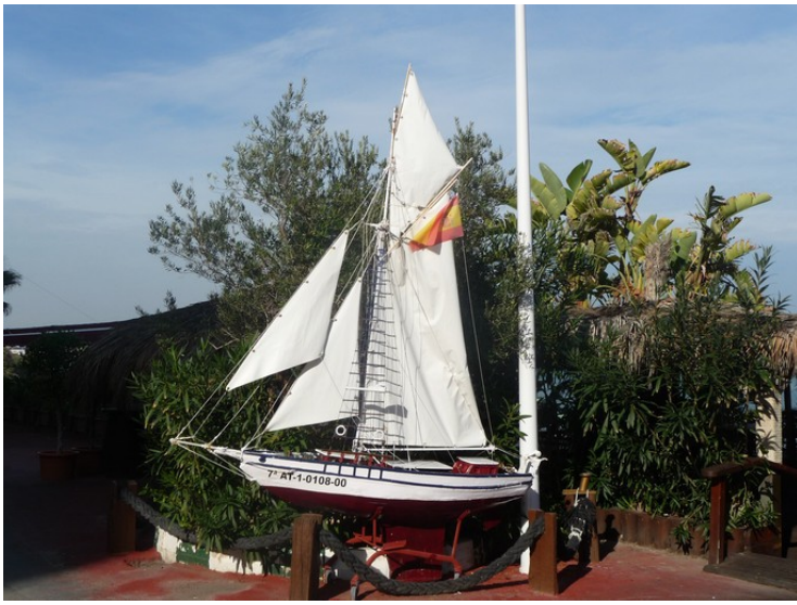
Another ship with full sails outside a restaurant.