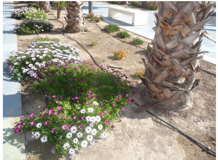
Flowers at the square.