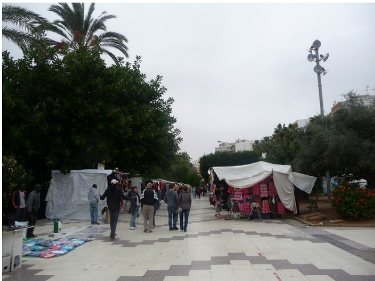
There is set up stalls on both sides of the passage.