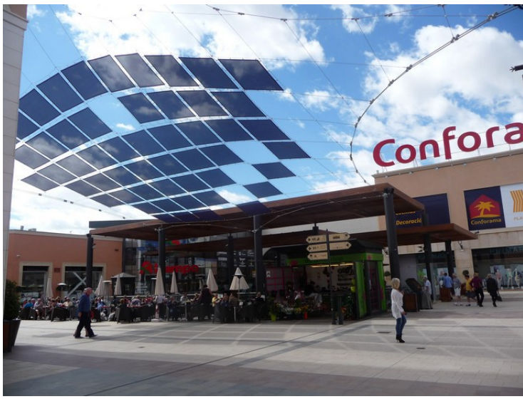
Many streets and shops in the center.