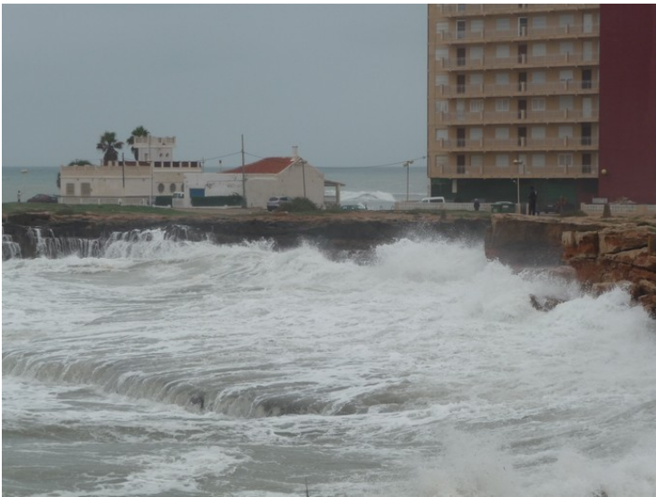
Here the waves are breaking into foam.