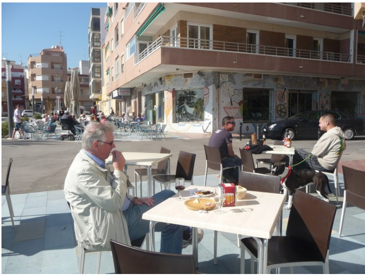
We had some lunch at a restaurant here.