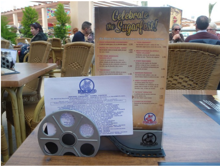
The restaurant is called Hollywood. Then it is in order to have a film cassette as menu holder.