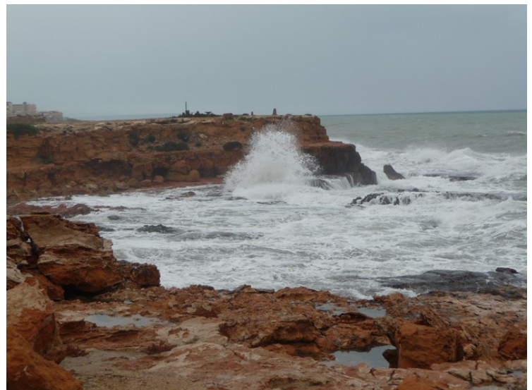
One of the first days we were here, we went for a walk along the beach. Right below where we live there are only rocks. The wind was quite strong that day, and spray high.