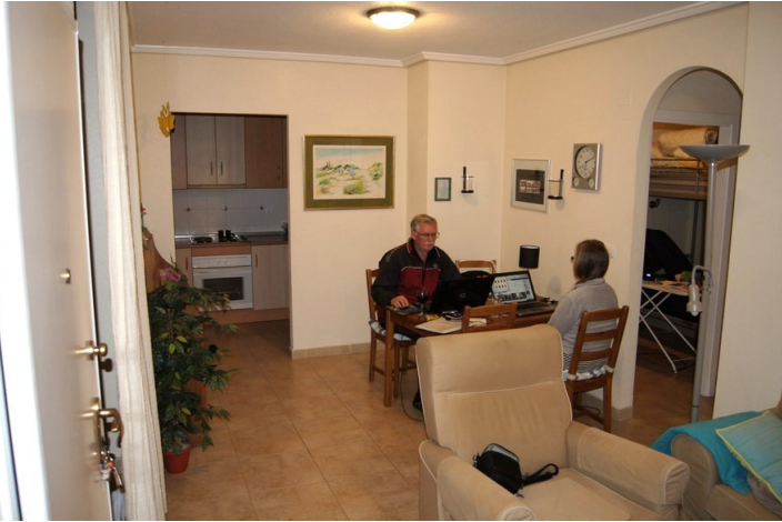
Here we are again. We have quite a long office hours every day.