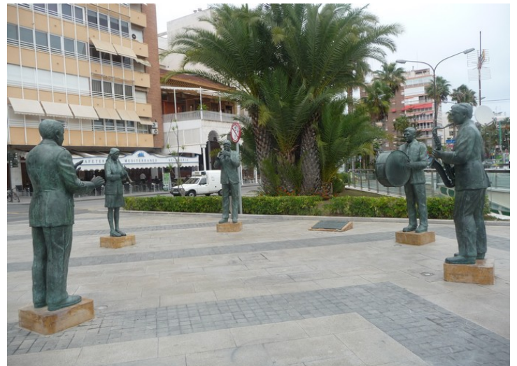
Here we are at a place called Paseo Vista Alegre. These statues, "Homenaje a los Músicos", is set up to honor local musicians.