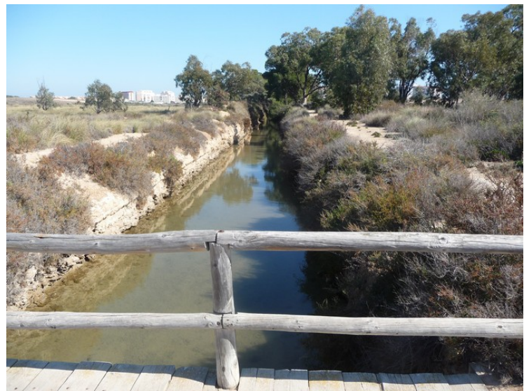
The canal runs through La Mata in the background and out into the Mediterranean.