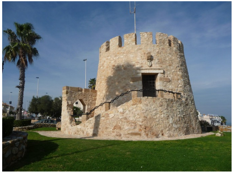
Right beyond lies the old watch tower, Torre del Moro , which has given he name to Torrevieja.