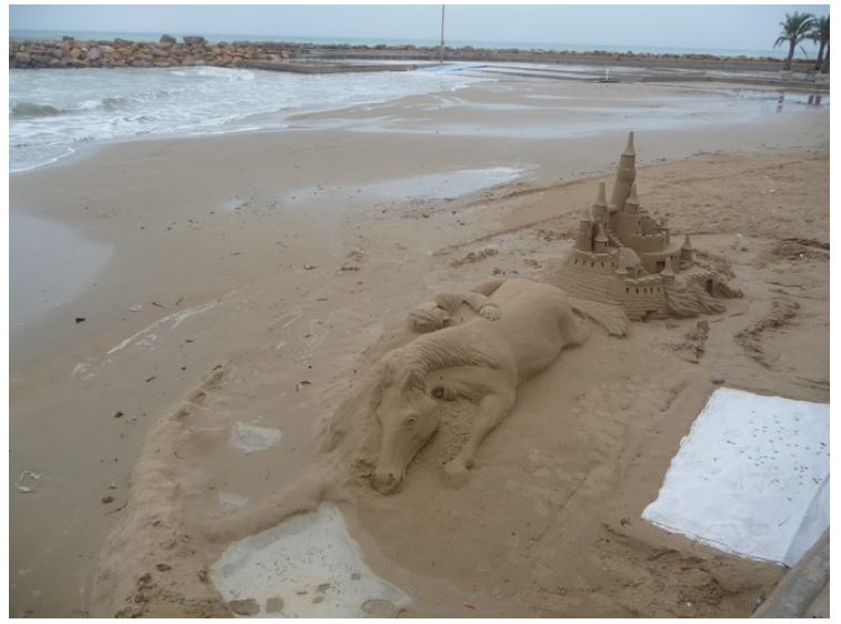
Building of sand figures and sand castles is popular.