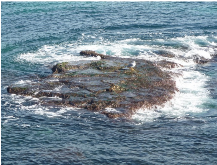
A seagull taking a rest on a rock.