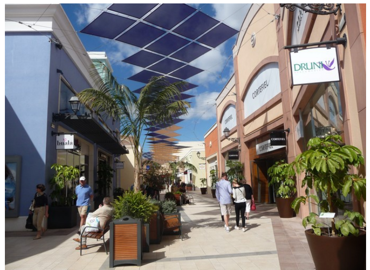
South of Torrevieja was in 2012 opened a major trading center named Zenia Boulevard.