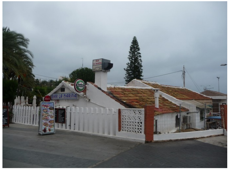
An idyllic restaurant, Bar la Marina , in the harbor. It is the oldest bar in Torrevieja. It is also on Facebook: Link .