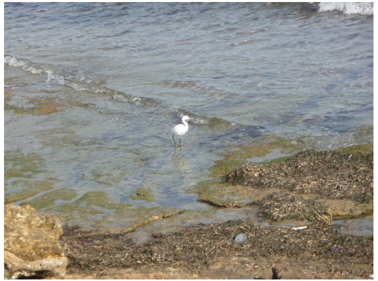
A great egret is hunting for food.