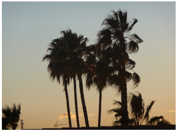
From the terrace, we see these palms.