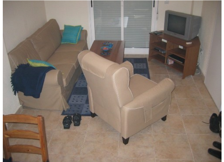
The living room.