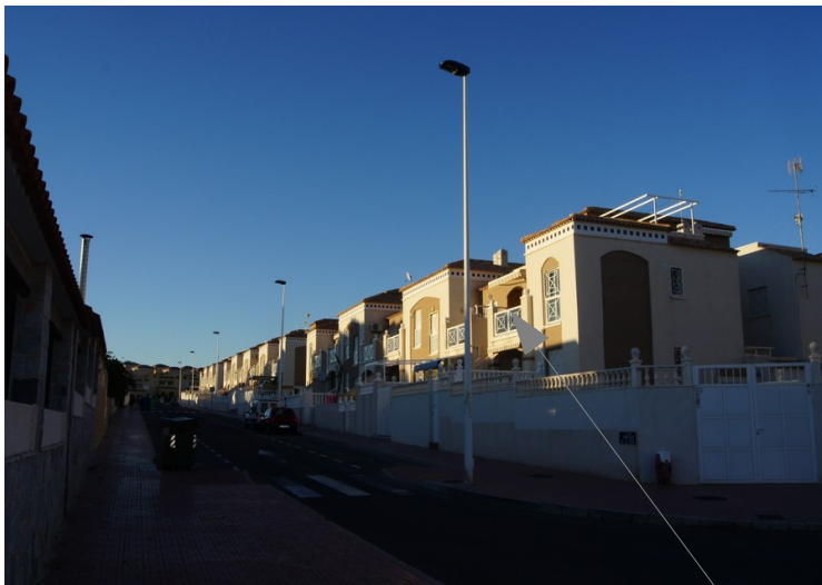
The view up the street. The apartment is here.