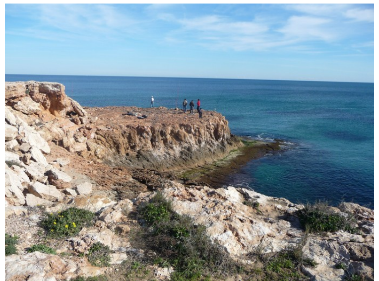
En group of men who are fishing.

We look north to the headland where the old tower is located.