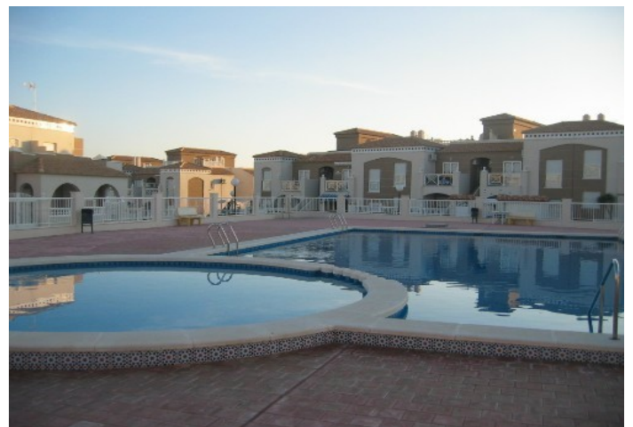
On site there is also a communal pool.