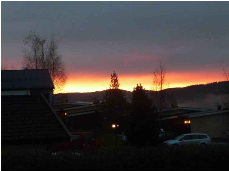
This is the morning mood on Gran before we travel.

This winter we had booked an apartment in Torrevieja in the Alicante region. We had bought tickets on the 29 th of October, but we both got the flu with cough, so we delayed going to the 4 th November. Then we were fairly healthy again. We took a taxi to Gardermoen.