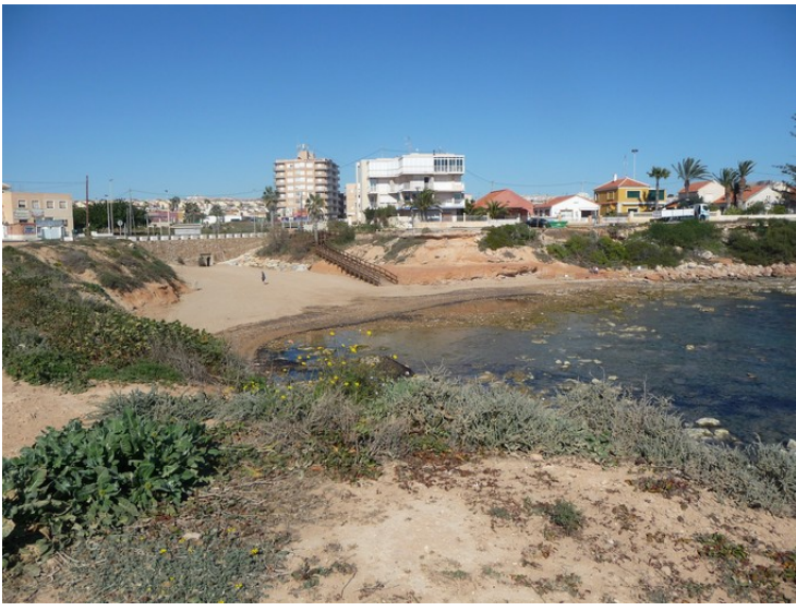
This bay is located right below where we are staying.