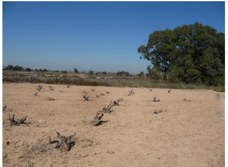
Too early yet. The vines have not begun to sprout.