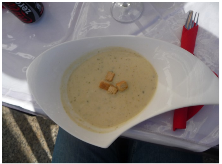
Kjell had a creamy spinach soup which was also very good.