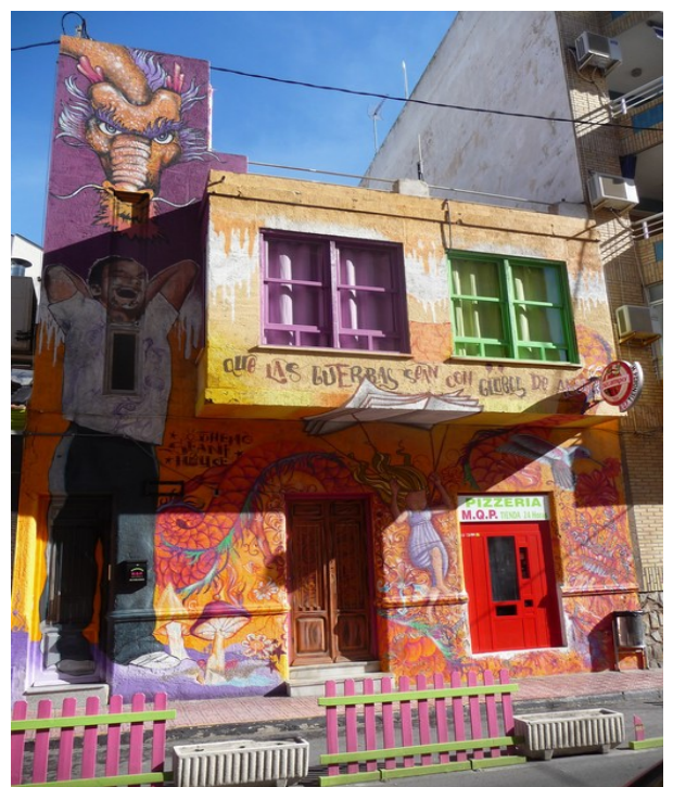
A colorful house downtown.