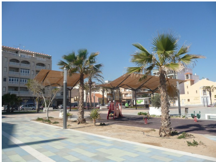
A large open square. It's called the Embarcadero Plaza de la Sal.