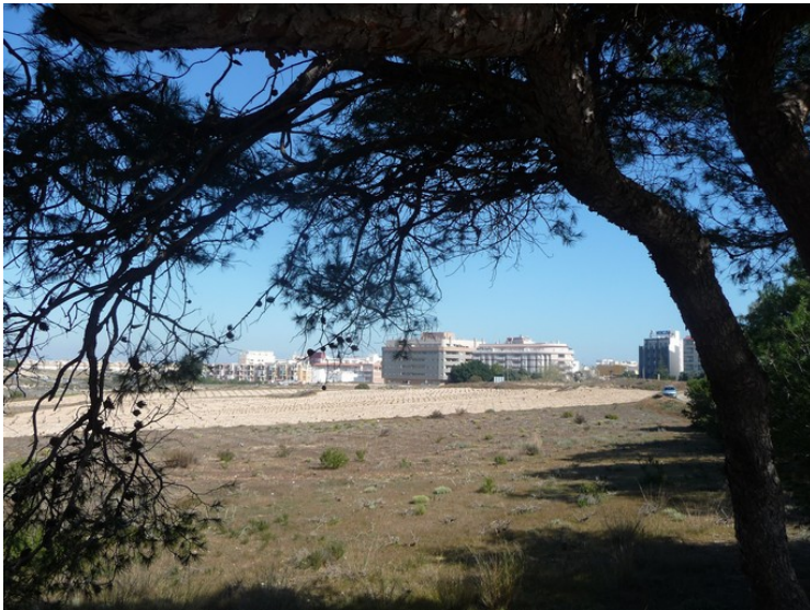
Looking towards La Mata.