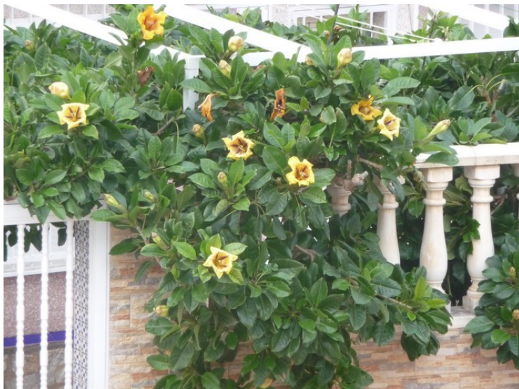
A flower bush across the street.