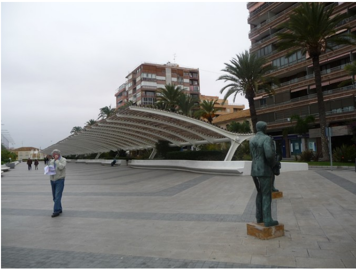
Still on the Paseo Vista Alegre. Kjell is checking the map as usual.