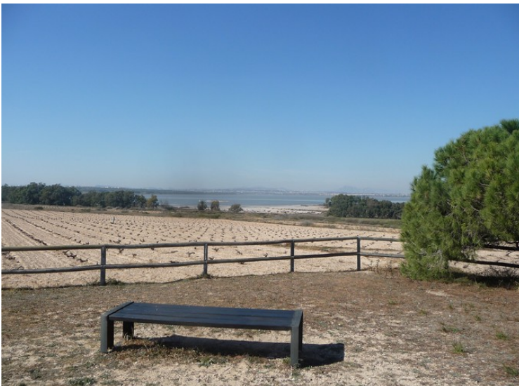
We can see the sea in the background behind the vine yards.