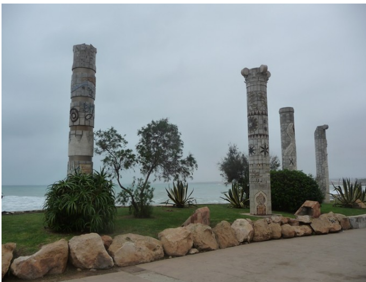
The pillars are dedicated to the Mediterranean culture.