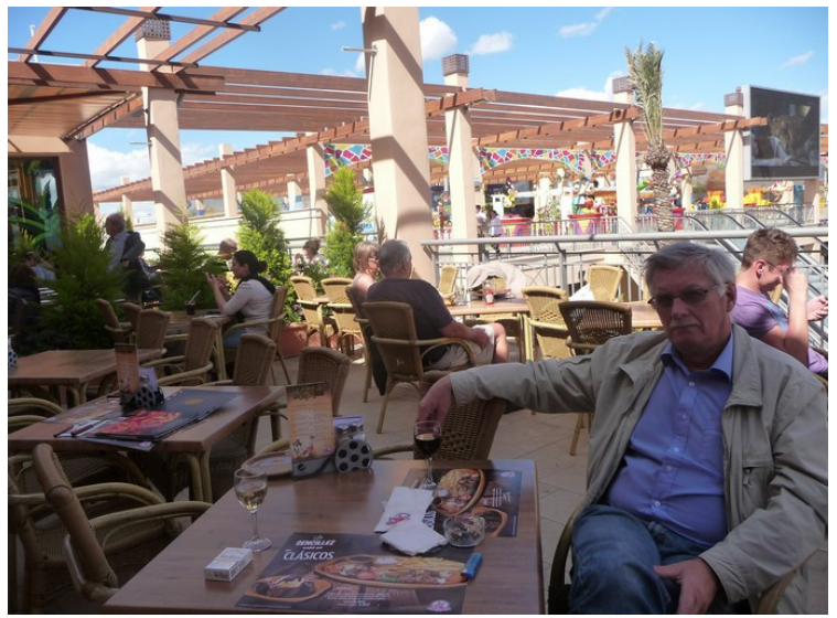
Here we have lunch at one of the restaurants.