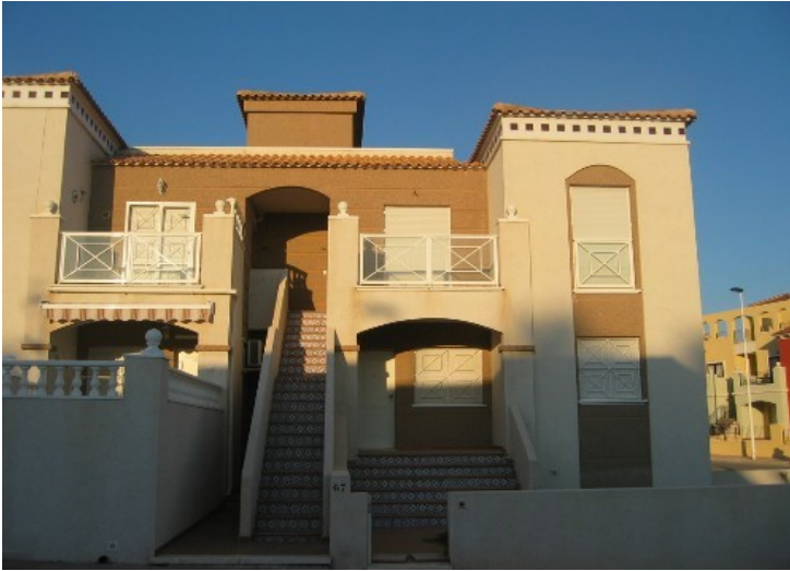
The apartment is on the 2. floor.

In 1929, the city was completely destroyed by an earthquake, but the salt production facilities were quickly rebuilt and reopened. In 1931, the city got a financial endowment of King Alfonso XIII. In this period the city developed as a result of increased production of flax, hemp and cotton.