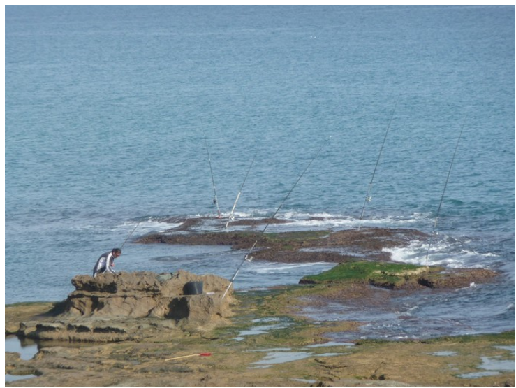
Out on a headland there is a guy who has put up a lot of fishing rods. It is popular to fish here.