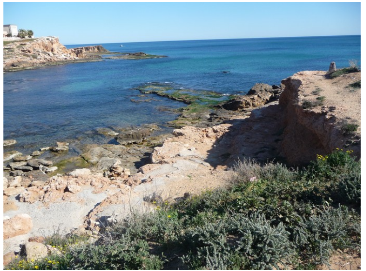
Farther out in the same bay.