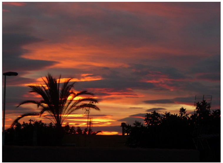
Then some pictures of the sunset, taken from the terrace.