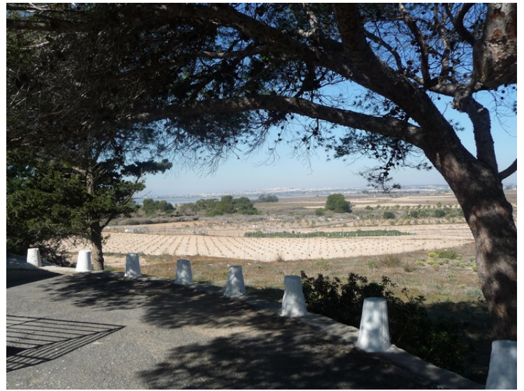
On the plains towards the sea, there are many vines.