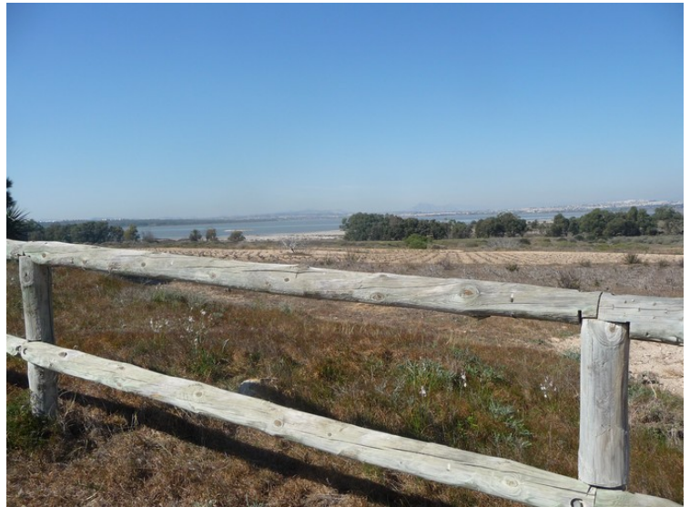
To the lake.