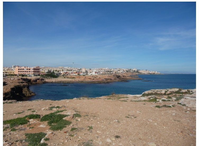
View towards the northern part of Torrevieja.