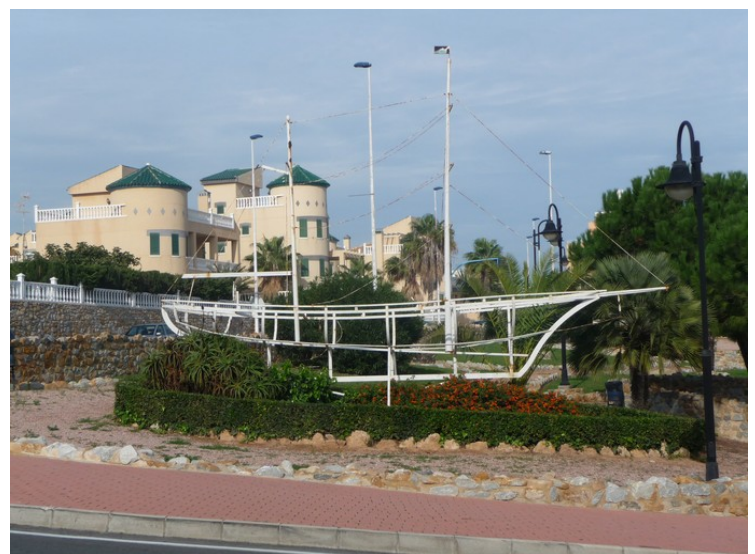
One day we went north from where we live. We went past this "ship" in a small park.