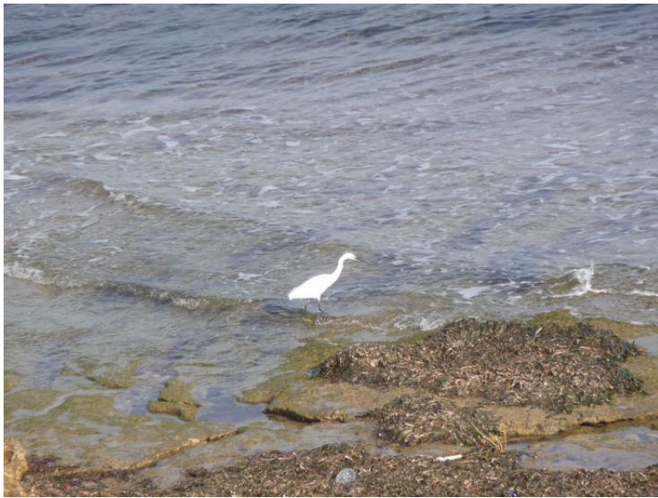
Here it finds something.