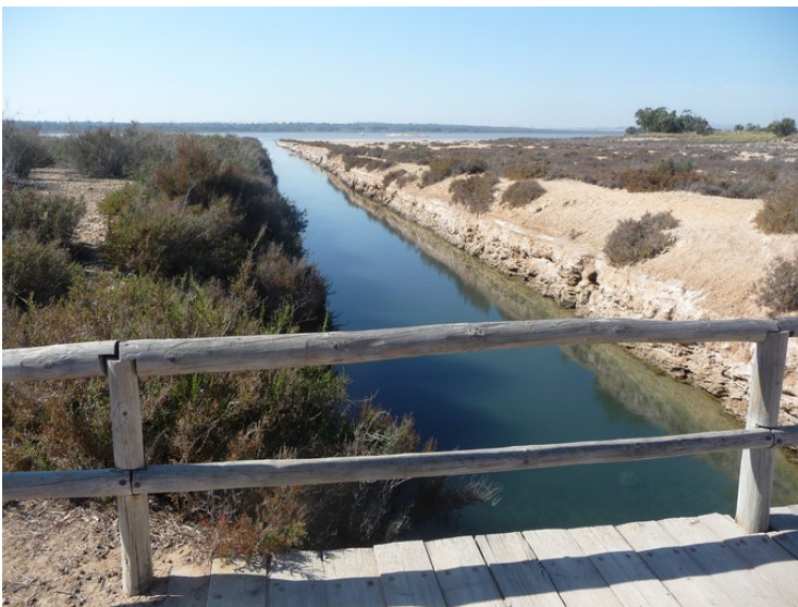
The canal that runs from the salt sea to La Mata. The salt lake in the background