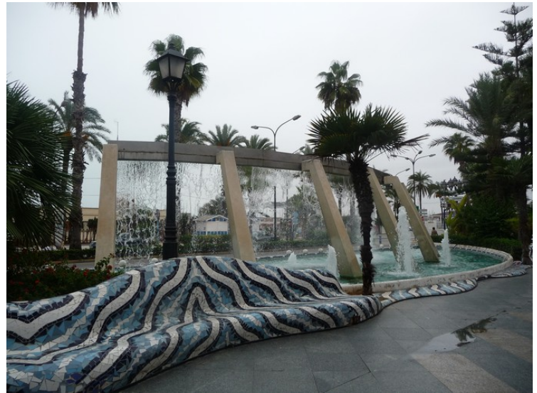
Here we can see the fountain better. It is shaped as a water curtain.