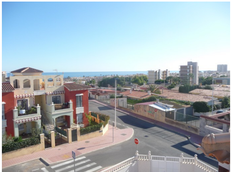
On the roof terrace. Kjell has found cigar, crossword, a beer can and cap. It can get pretty hot in the sun, even in the winter.