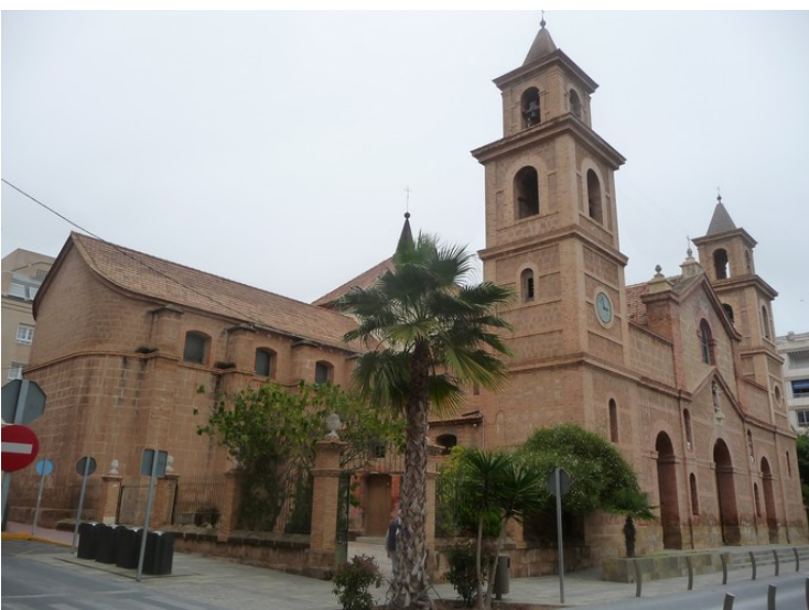
A cathedral, La Inmaculada Concepción , in the town center. It was commenced in 1880.