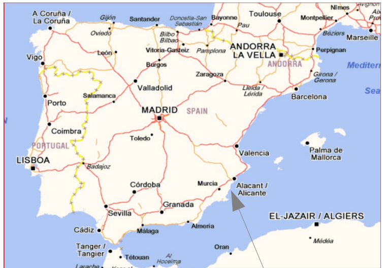
Torrevieja lies here.