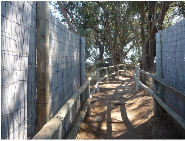
A path leading out to a house where one can spot birds in the lake. The path is shielded on both sides so that the birds shall not be frightened.