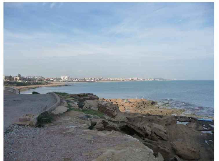
Here we look north along La Mata beach at La Mata . The beach is said to be the longest beach in Spain, and it is over 2 km long.

It was in La Mata that the salt extraction from the salt lakes began in the 1300s.