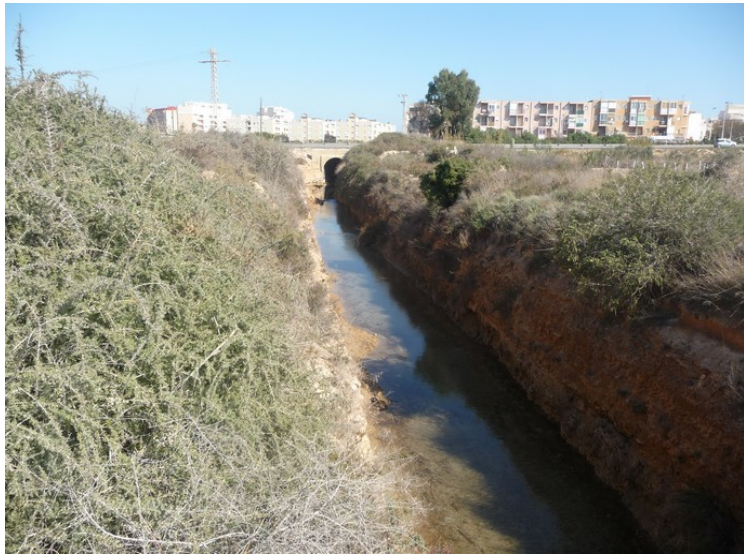
The canal runs under the highway, through La Mata and into the Mediterranean Sea.