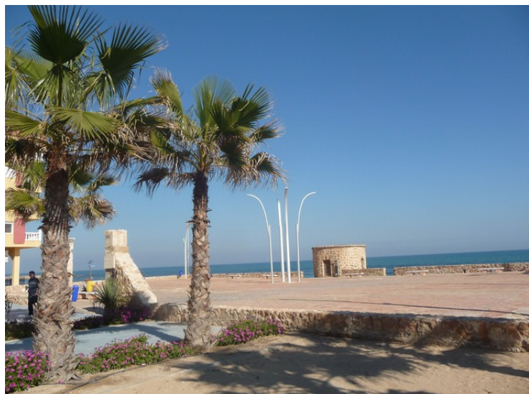
A last photo from the square.