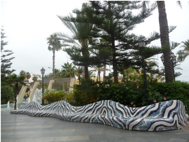
A fountain with benches around.