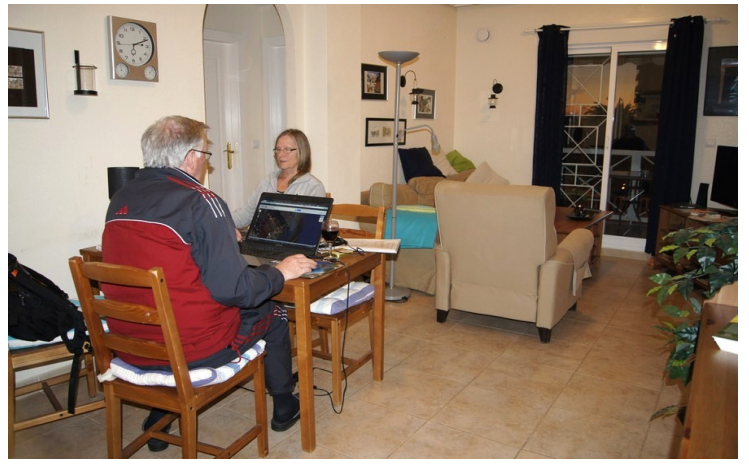
Here we are at the office.