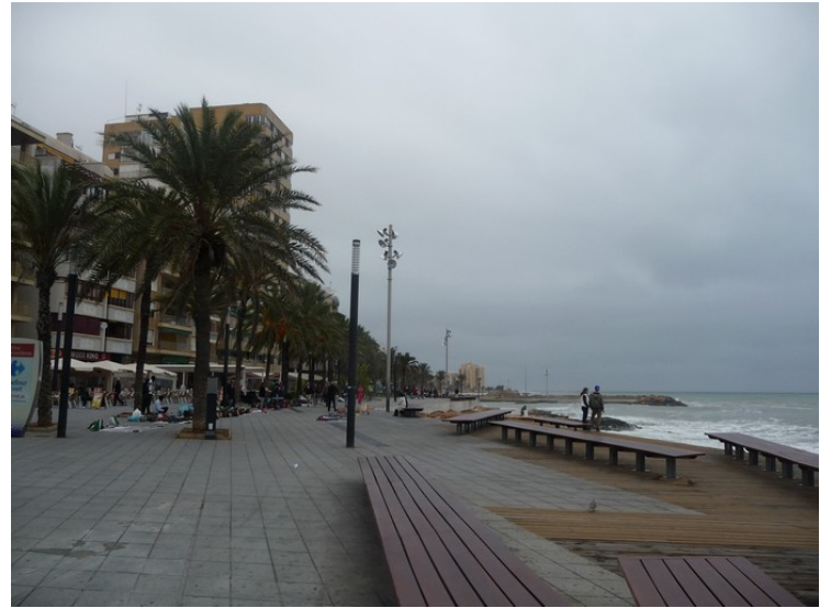
This stretch of the beach promenade is called Paseo de la Libertad.