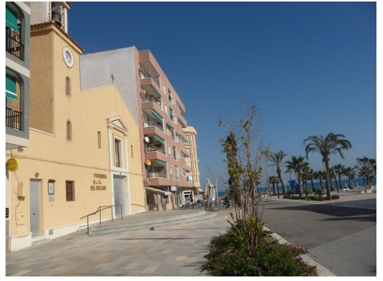
Here we have reached La Mata.