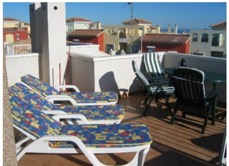
The roof terrace.