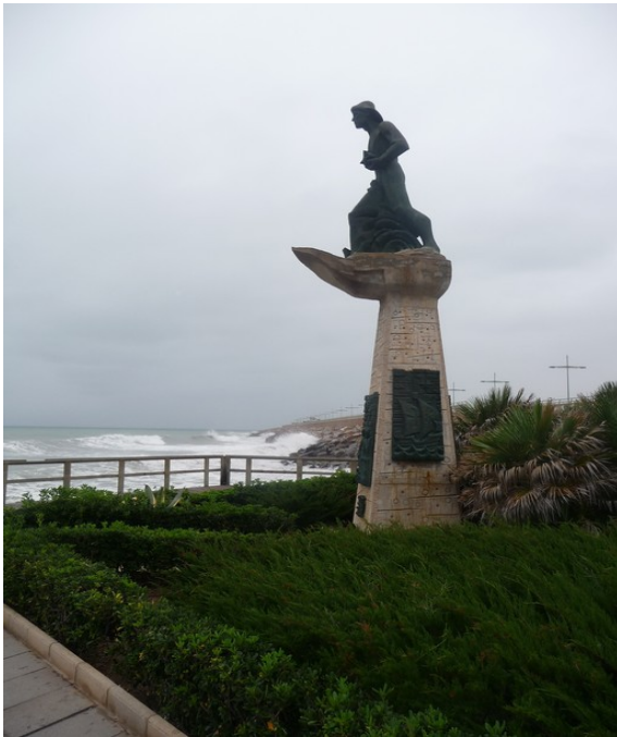
The statue " Hombre del Mar ", a monument dedicated to the seafarers.