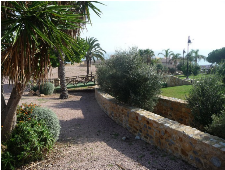
There is a small park around the tower.