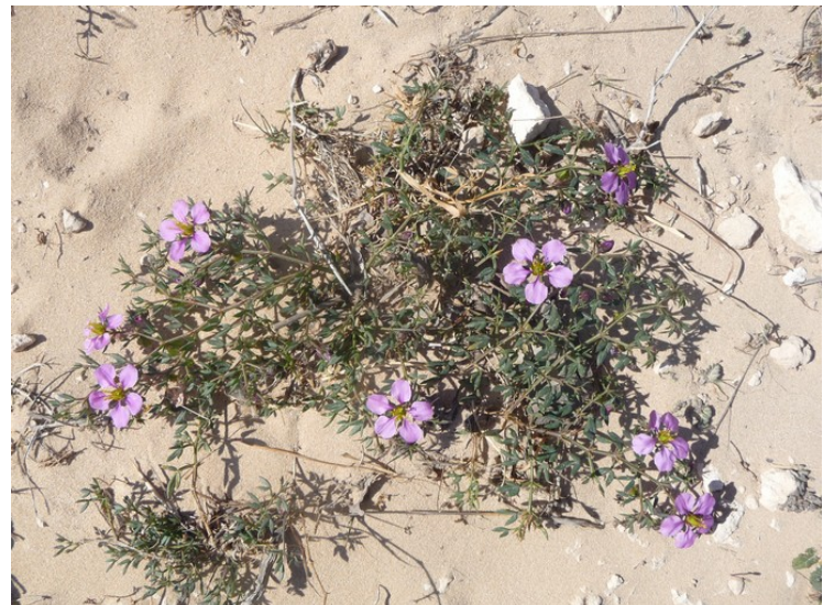
Flowers in the sand along the path.