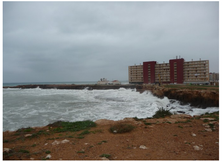
A couple of pictures along the coast.