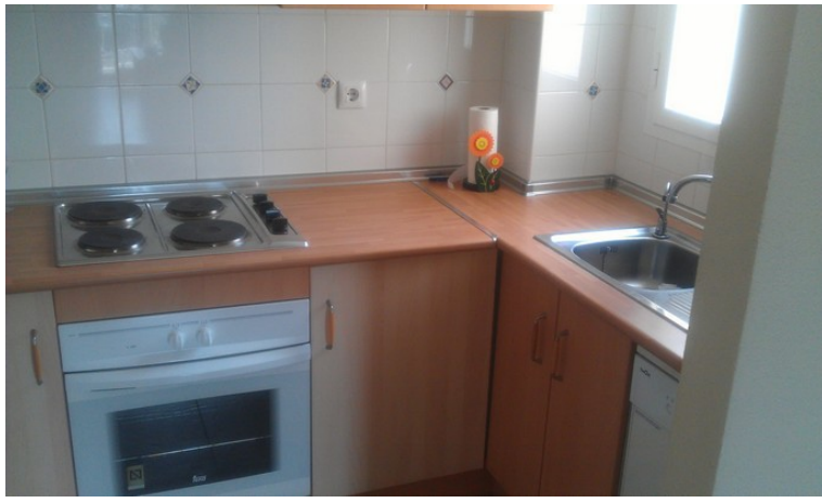
The kitchen. There are all the needed equipment.