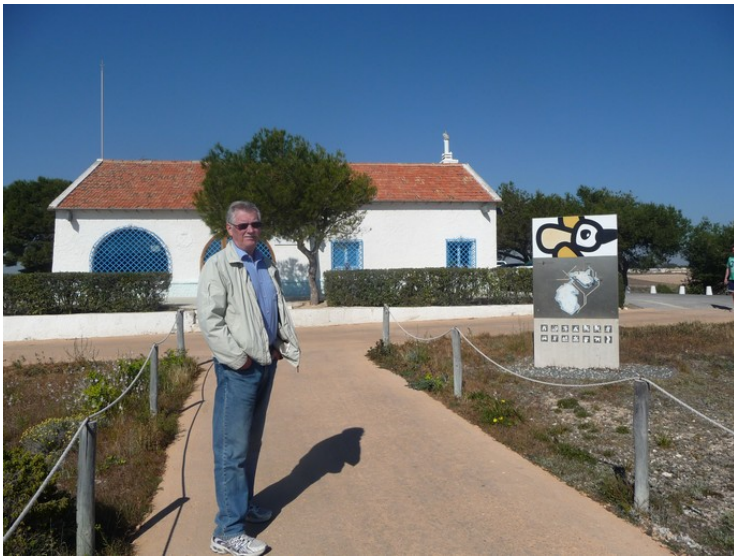
Here we are at the entrance to the park at the northernmost salt lakes of La Mata. Information in the background. The park is named Parque Natural de La Mata y Torrevieja .