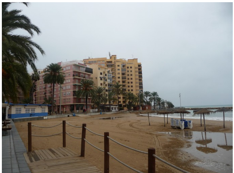
Looking back to the headland, Punto del Salaret.