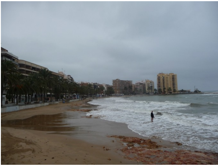
One of the beaches in the town center, Playa del Cura.