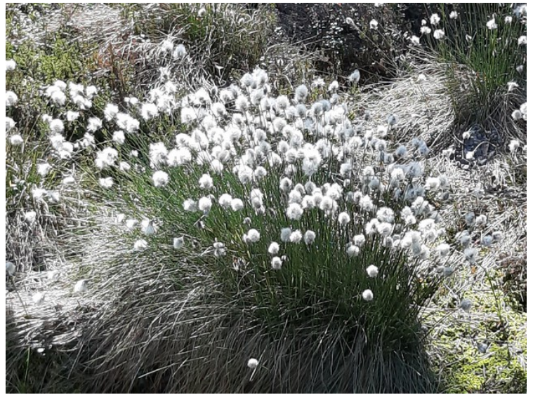
Here is growing cottongrass .