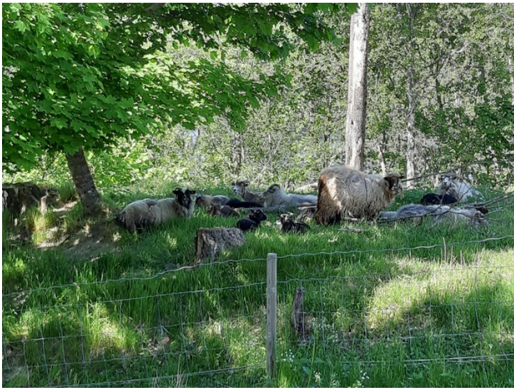
Sheep grazing near the lake.