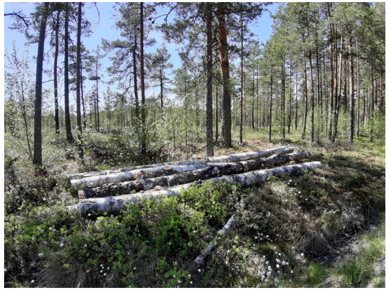
Here we are at Tysjømyra.