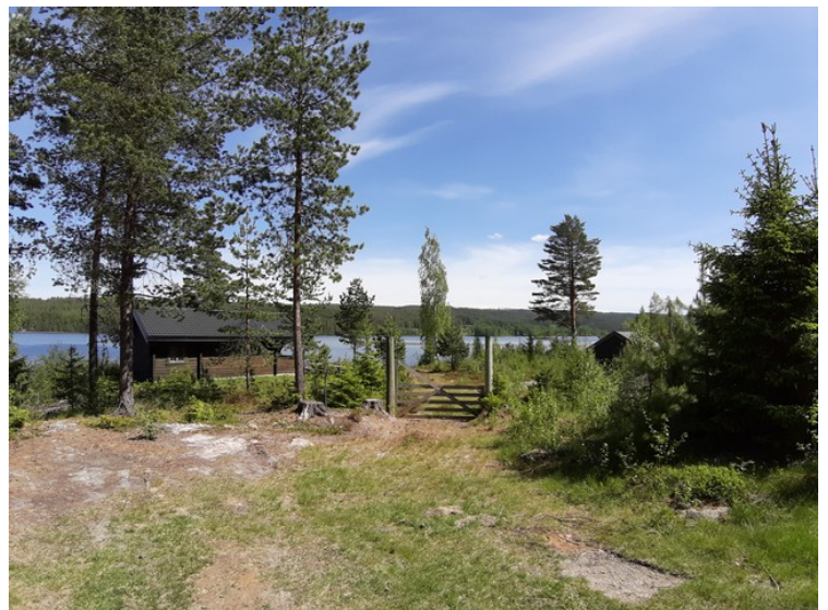
This is Frysjøen .

It is possible to fish perch , pike , roach , ruffe , burbot and crayfish in the fall. There are also some trouts . There are some cabins around the lake and permanent settlement at the south end of the lake. The use of a motor boat is prohibited. In 2010, the use of electric motors was permitted. The water from the lake flows down into Frysjøåa to Tysjøen where some of the water is pumped up and used for drinking water. The water continues in the Tjuraåa down to Gardsjøen and out into Glomma.