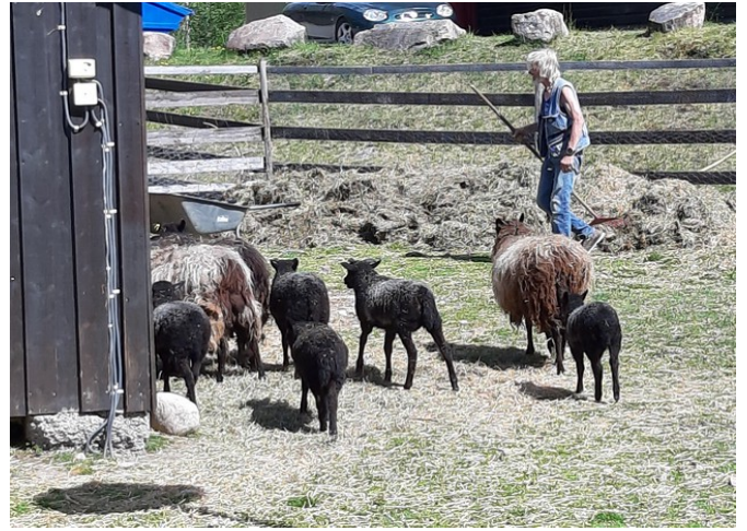
Wild sheep or old Norwegian sheep