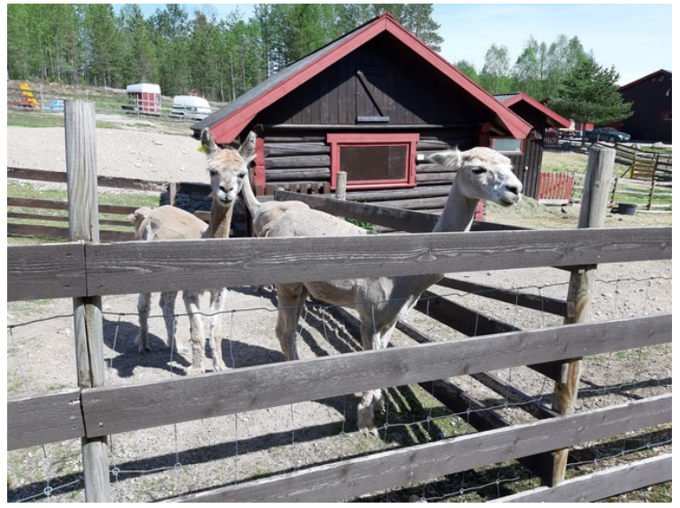
Then follows some pictures of llamas at Finskogen Kro og Motell