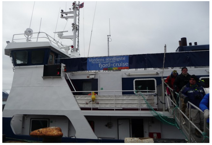
Here we go ashore.