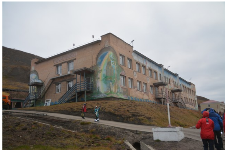
Right beyond is the school located.