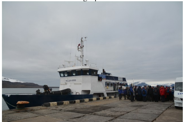
All are here.