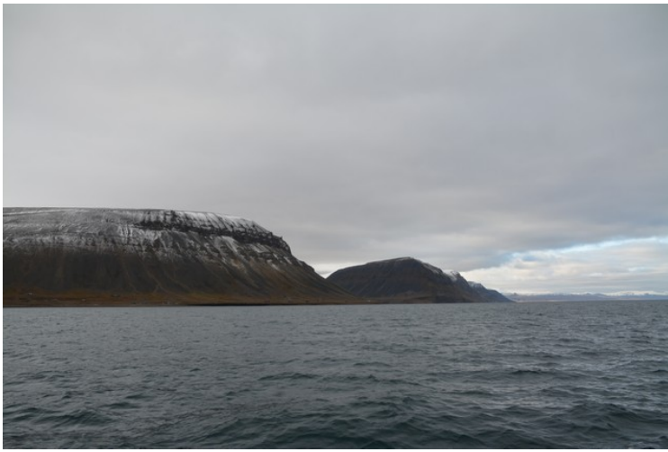
Here we are past the airport, looking south Isfjorden .