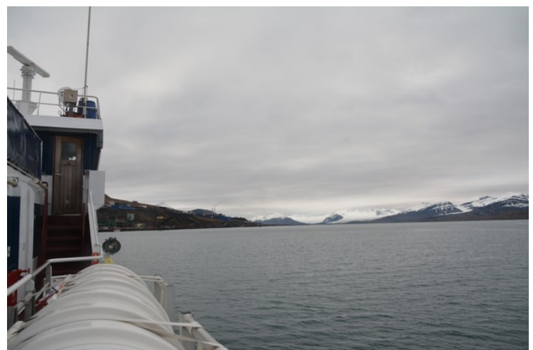
Views further into Grøn fjorden .