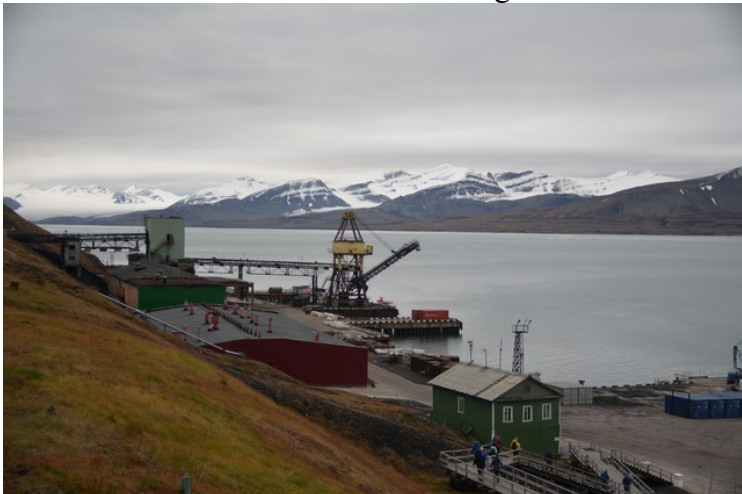
Quayside. The nearest house is the port office.