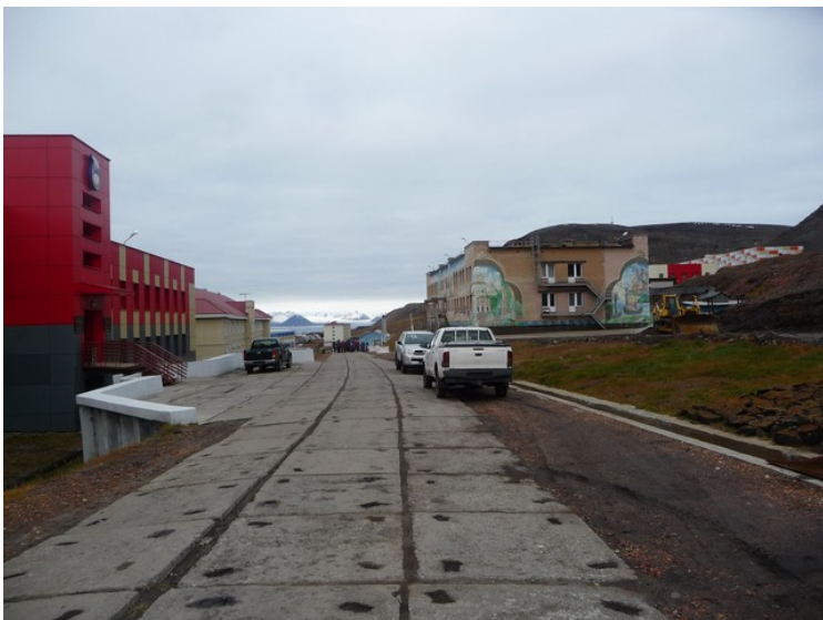
The main street.