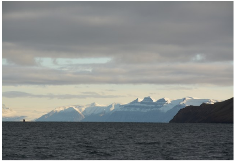
Views north. Then follows some mountain pictures.