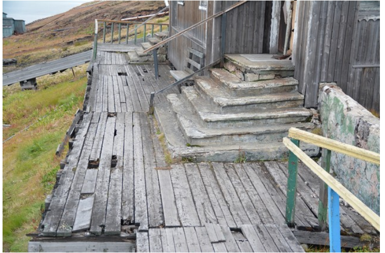
Nature gradually takes over.