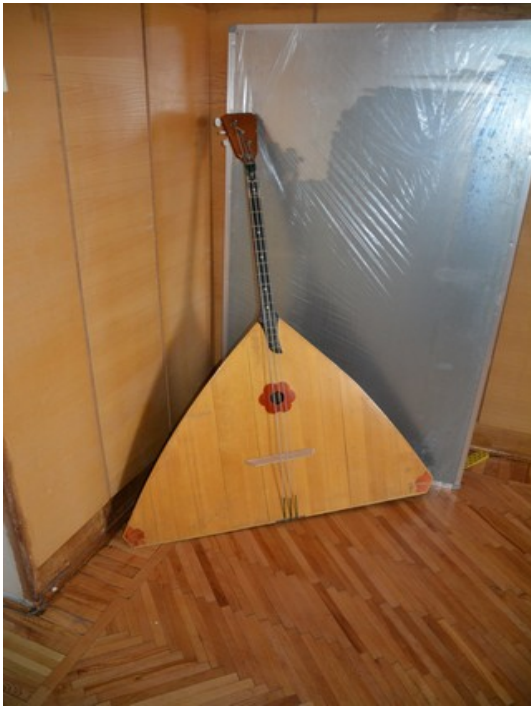
We were inside the post office in the hotel. I just had to have a picture of this balalaika.