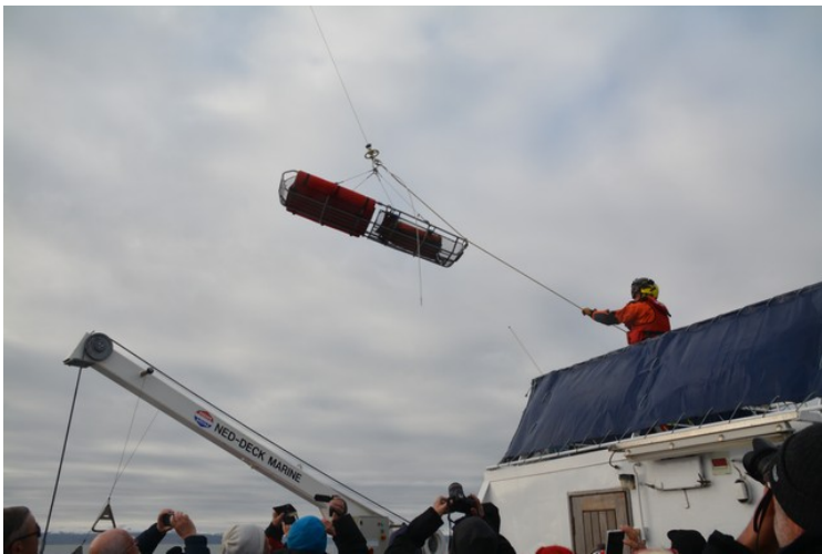
Here comes the stretcher.