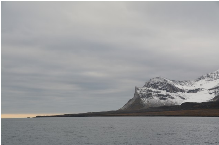
Here we are arriving to Ymerbukta where Esmarkbreen is situated.