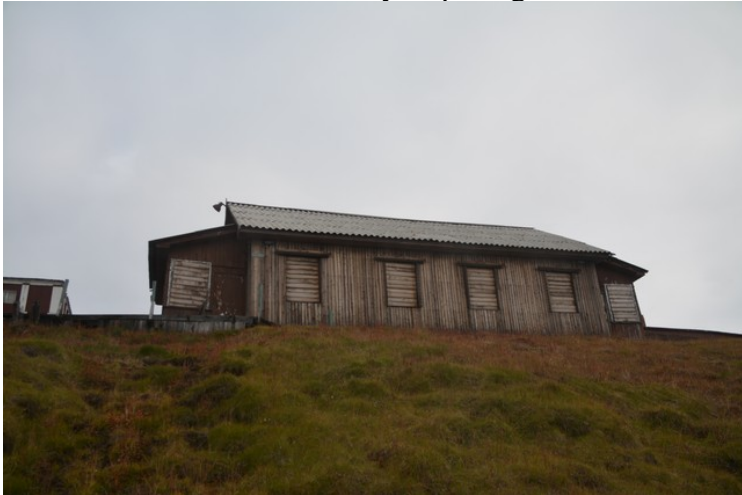
This house is not in use.