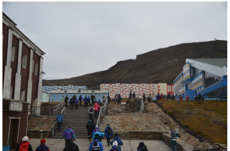
Almost up to the first stop.