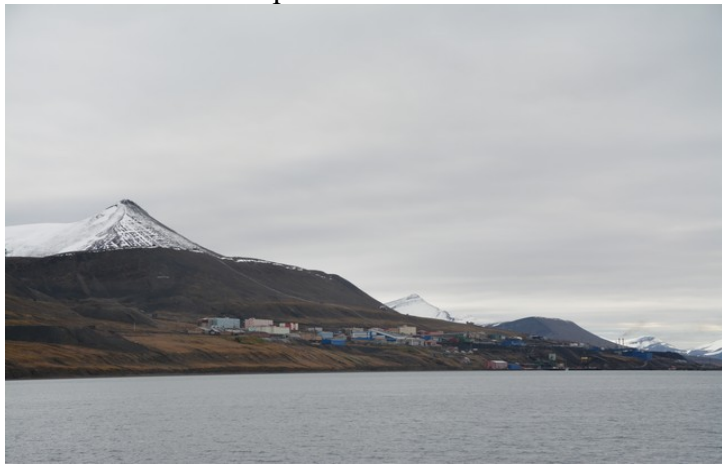
The buildings in Barentsburg.