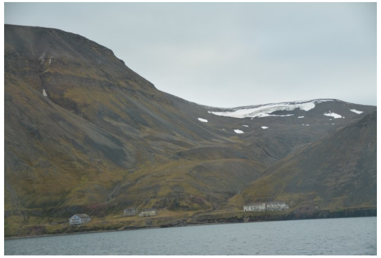
The houses in Grumant . After the war it was up to 1,200 people who worked here. The activity stopped in 1962.