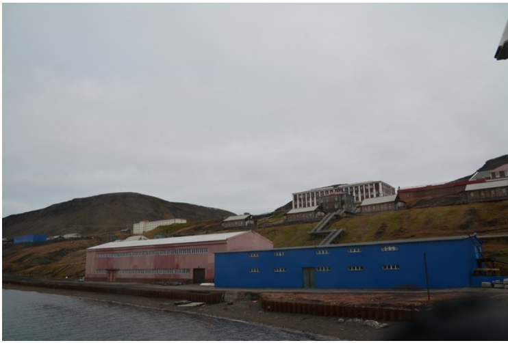
Stock sheds at the pier.