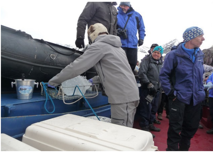
The ice is secured.