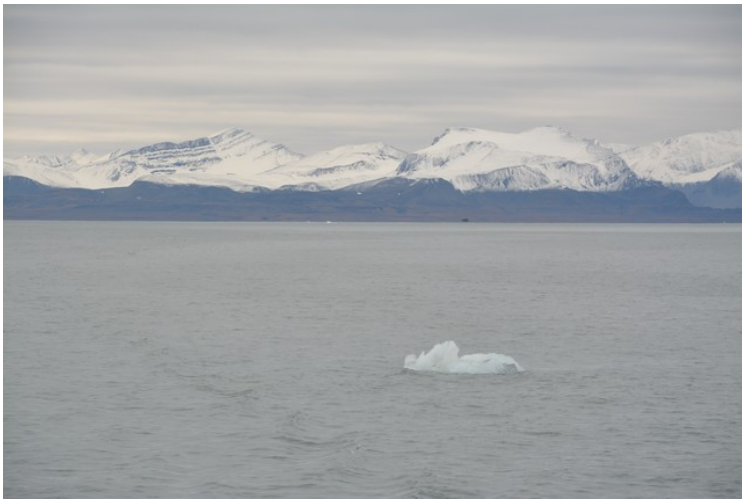
Pieces from the glacier are drifting past.