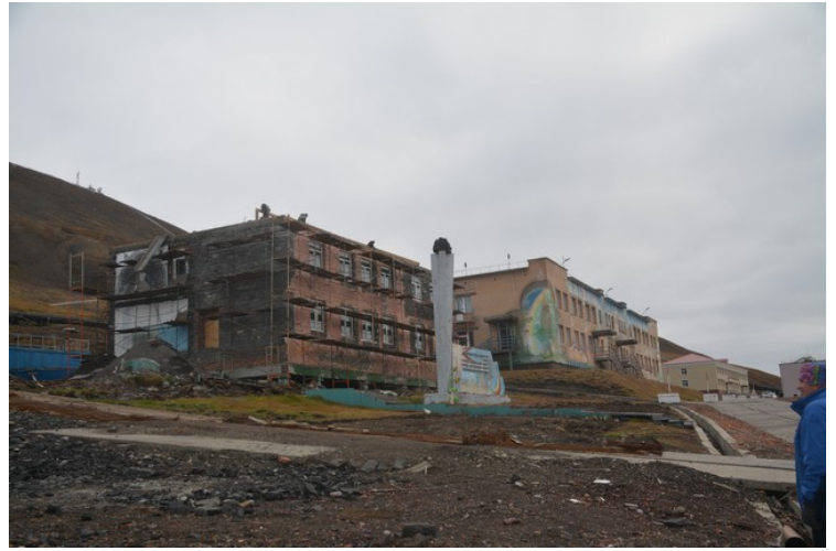
The views up the main street in Barentsburg. The house to the left, which is being renovated is the Pomor museum . The statue we see is a monument for the mining industry.