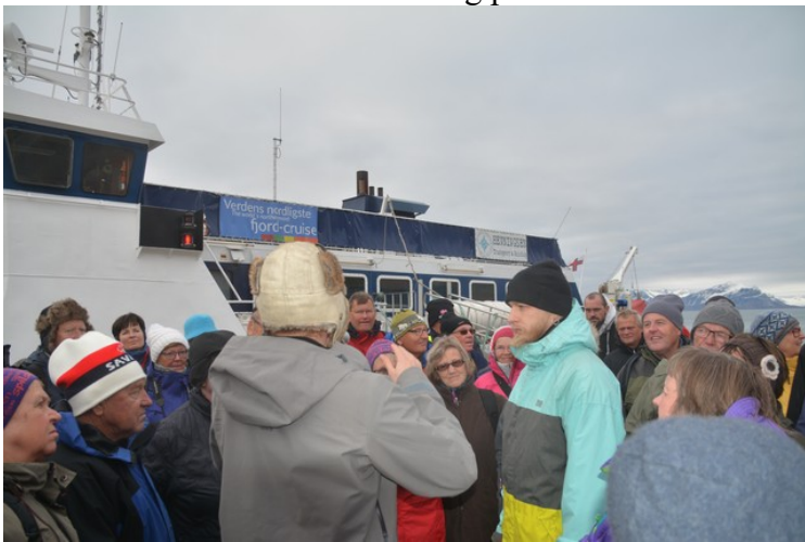
The guide is collecting the group for some information.