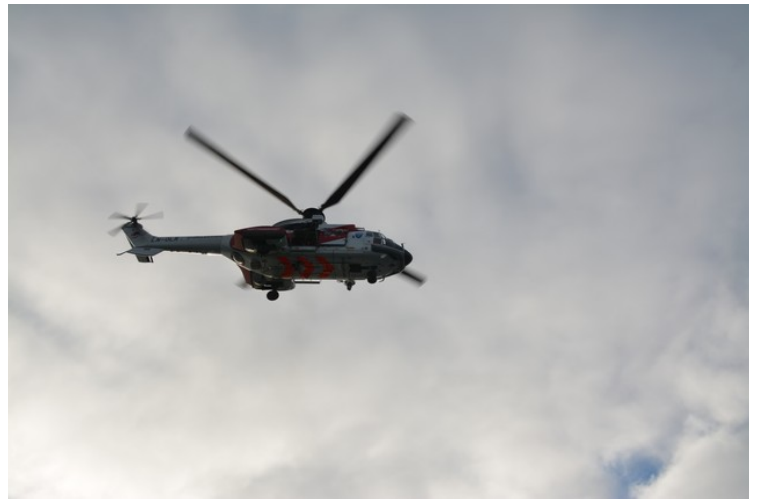
Rescue exercise (training).