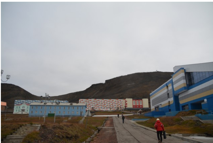
The road further up.