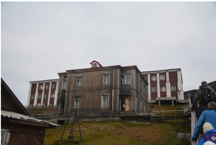
Not in use.