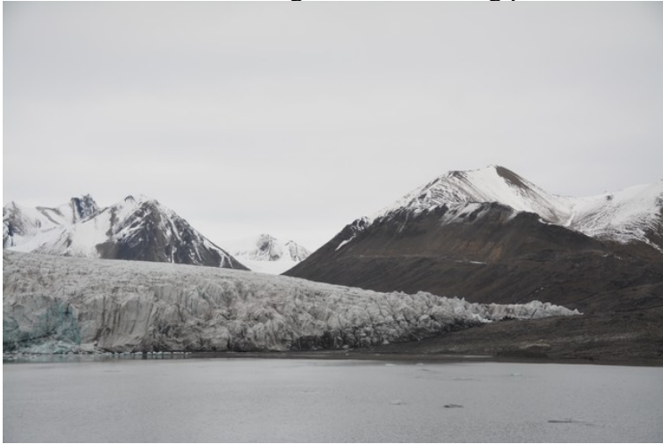
The edge of the glacier.