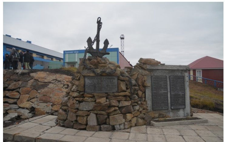
A memorial for the crew of MS Hercules who went down on the way to Murmansk.