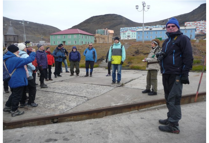
She is taking a picture of me.