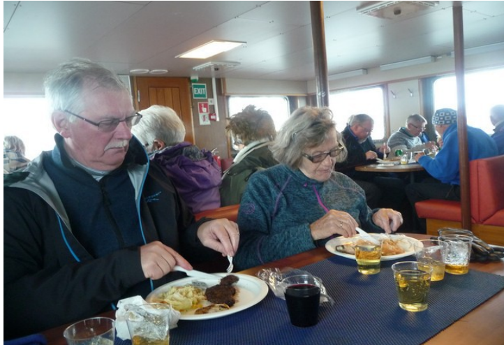
Lunch. Options: «spareribs», whale beef, salmon, salad, pasta and rice.