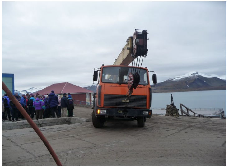
A few vehicles drove past when we stood there.