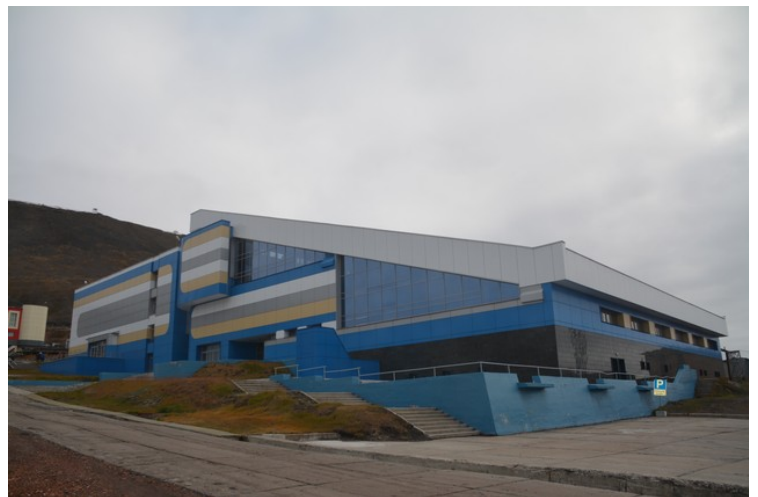
This is a sports and cultural center. Was created in 1963.

In the 1600s and 1700s Grønfyorden was widely used as anchoring and hunting ground for whaling, and in the second half of the period also by Russian pomor hunting teams. Barentsburg was founded by the Russian Tsar Empire in 1916. In 1920 the plant was sold to a Dutch company, which gave the settlement the name Barentsburg. The Dutch invested much in the plant, but in 1926 business stopped up for lack of funds. In 1932 Barentsburg was acquired by the Soviet company Arktikugol , which yet today runs the place.