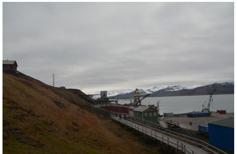
The rest are walking upstairs. Here we look down to the pier.