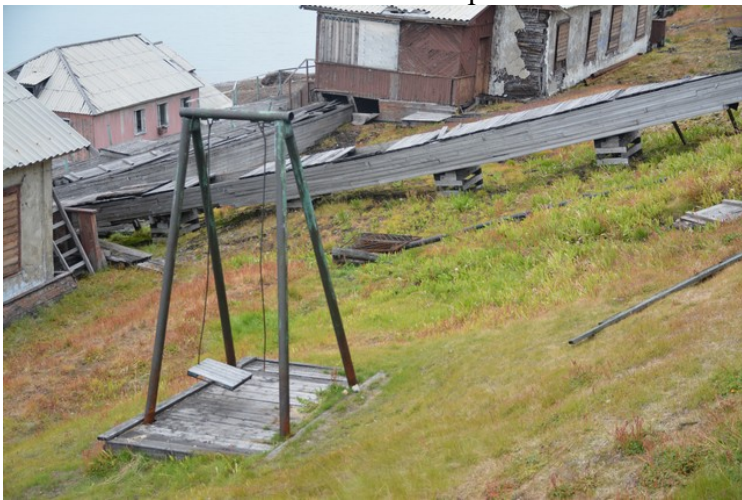
It does not seem that this is being used either.