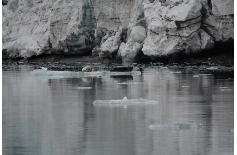
It could be that seals are lying on a floe.