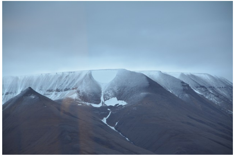
We can see the champagne glass from our hotel room.