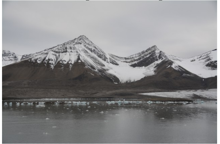
On the other side of the glacier there are many small floes floating around. Then follows some glacier pictures.