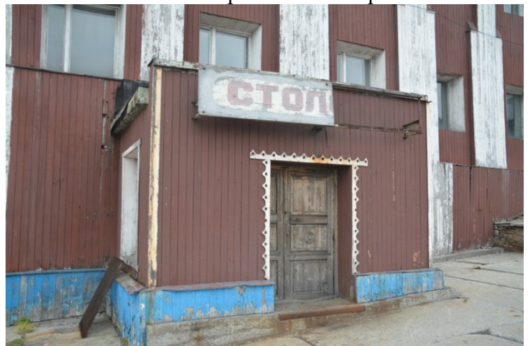
Here used to be a cafeteria. It is closed now.