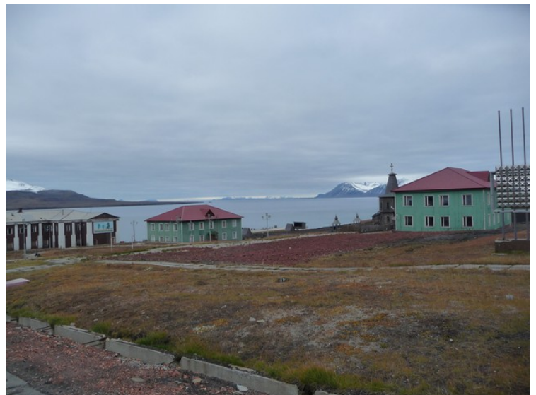
Views north in Isfjorden.