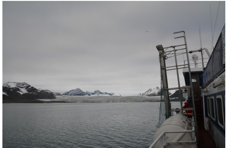
Here we see the glacier.