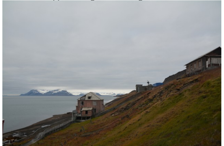
Views north in direction of Esmarkbreen.