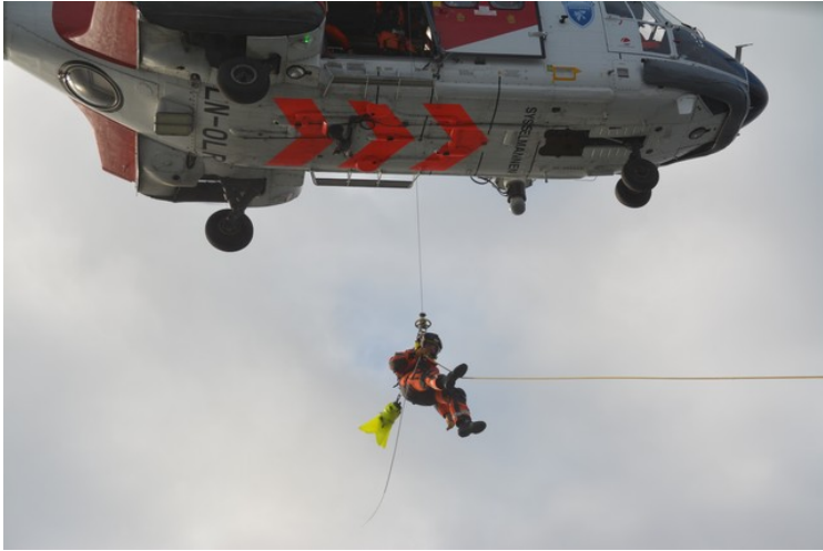
Crew are lowered to the boat.