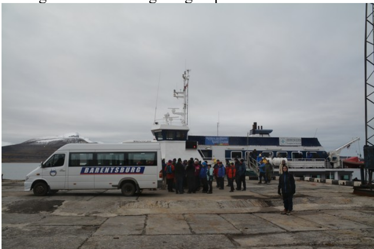
Those with walking difficulties or do not want to go all the stairs up to the settlement, can take this bus.