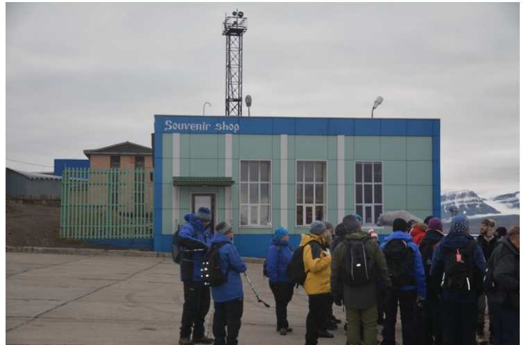
More information from the guide.