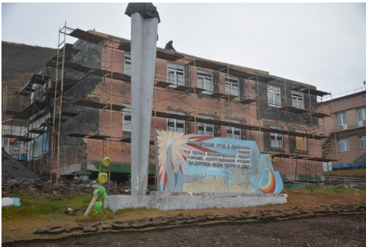
The Pomor museum and the mining monument.