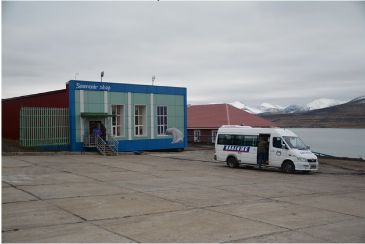
The souvenir shop.