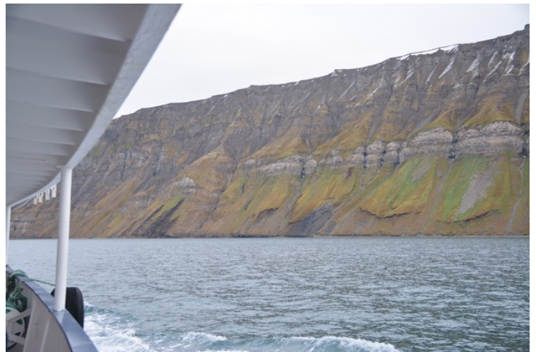
Some mountain pictures on the trip back to Longyearbyen.