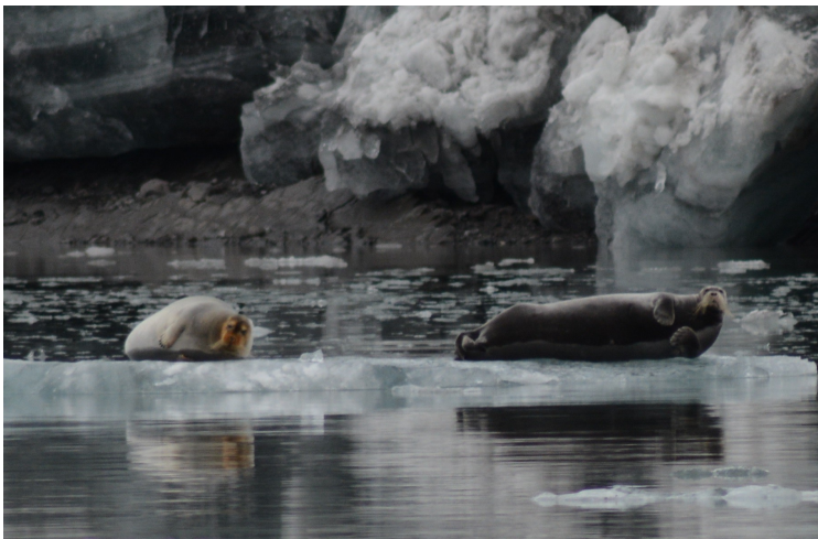
Here we can see the seals.