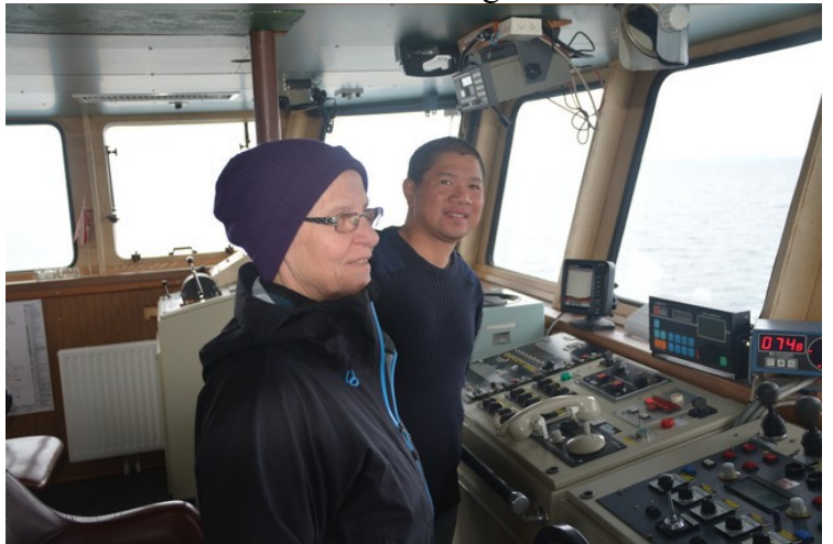
Visiting the captain.