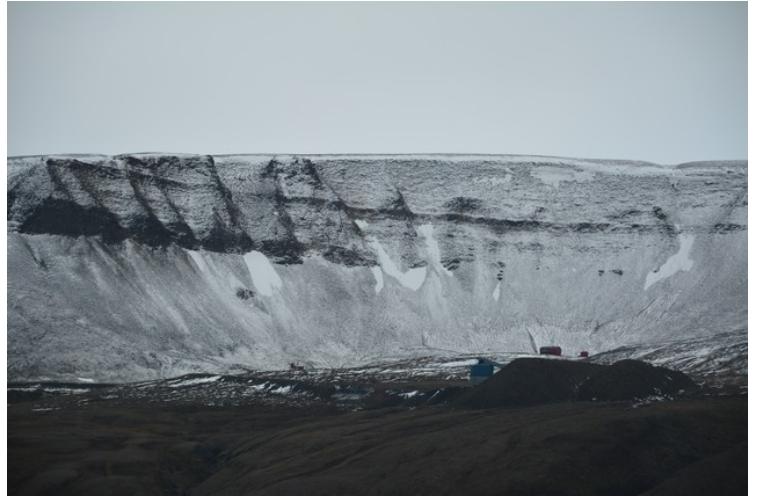
Back to Hotellneset.