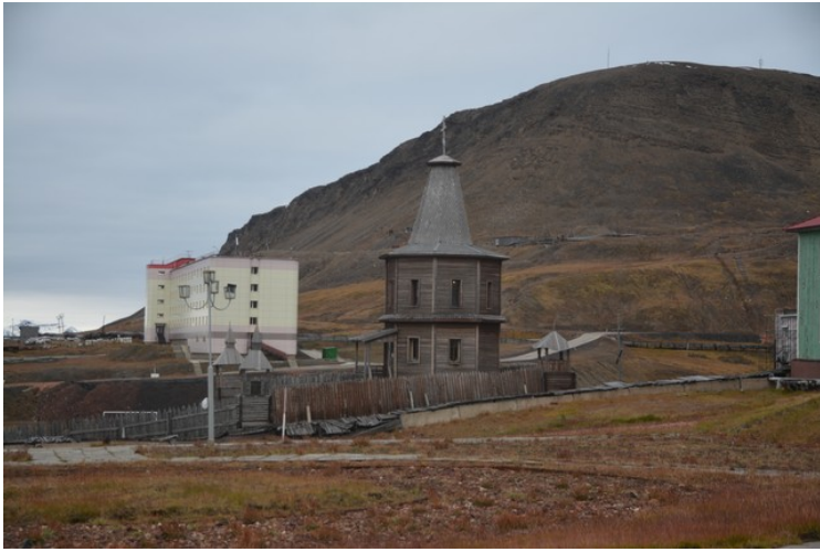
The church was built in 1996 to commemorate the 141 people who was killed when a Russian plain crashed into Tempelfjellet.

mostly over 1,000 residents in Barentsburg. Today there are in excess of 400. 90% are Ukrainians and the rest are Russians.