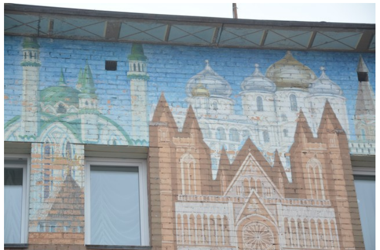
The building is decorated outside with paintings of typical Russian architecture.