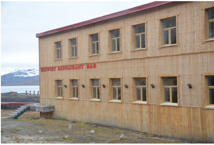
This is the restaurant for the miners.