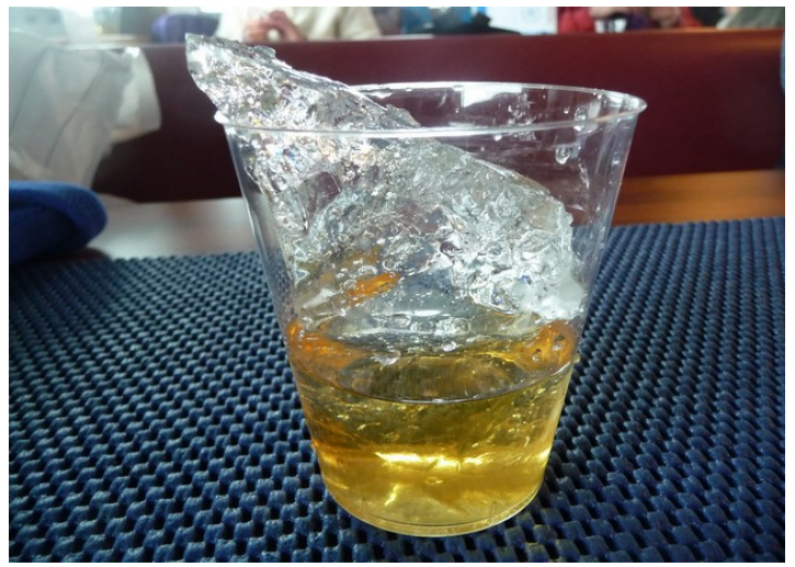
Whisky on the rocks.