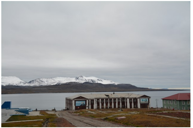
The old cafeteria that are not in use anymore.