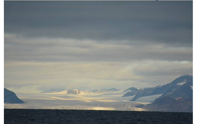
Think this is Borebukta with Borebreen.