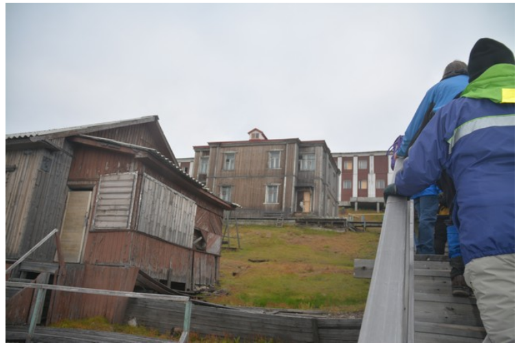
We are approaching the buildings that are in use.