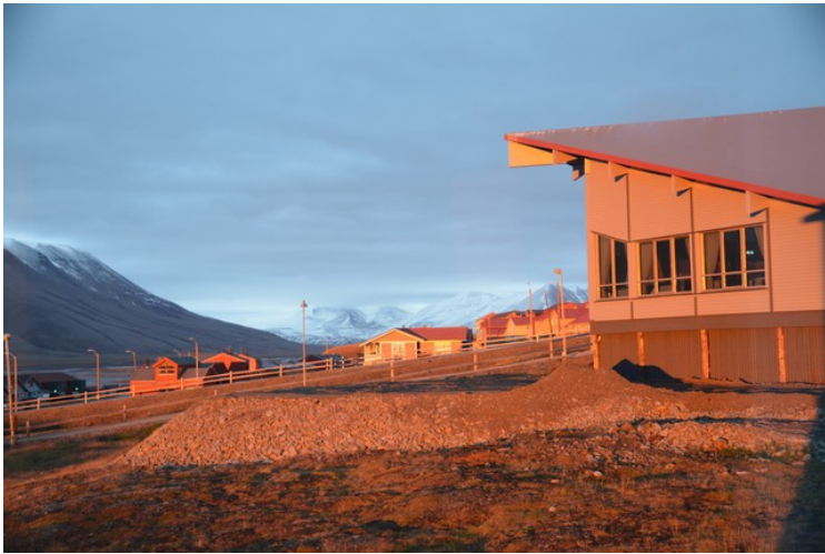
Back at the hotel. The sun has come back after having been gone almost all day.