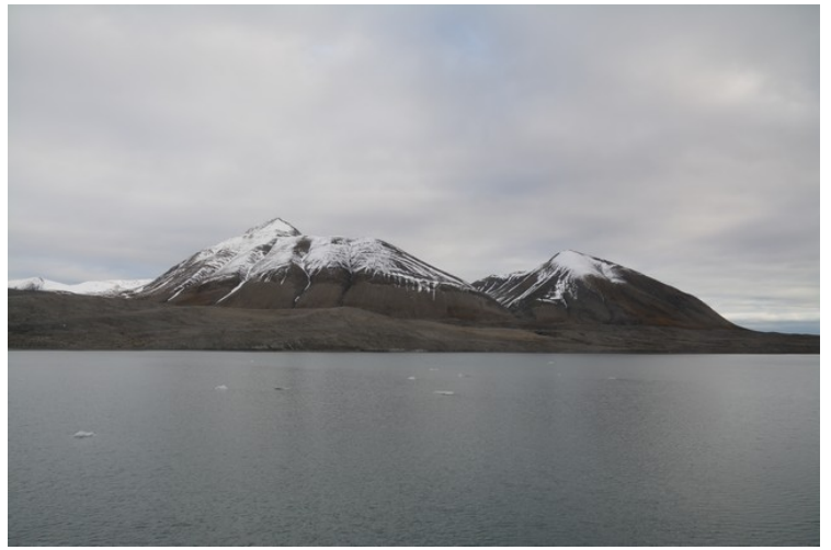
On the side of the glacier there is a large moraine.