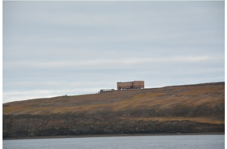
The first building we come to in Barentsburg . It is the site of Barentsburg Heliport at Heerodden .