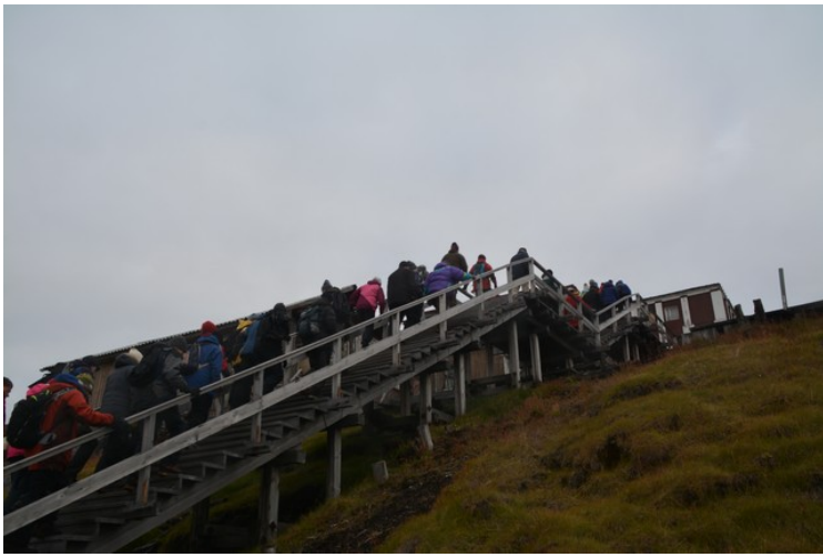
There are many steps to go.