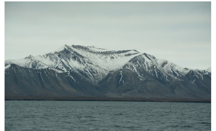
When the exercise was finished, we were right next to Esmarkbreen.