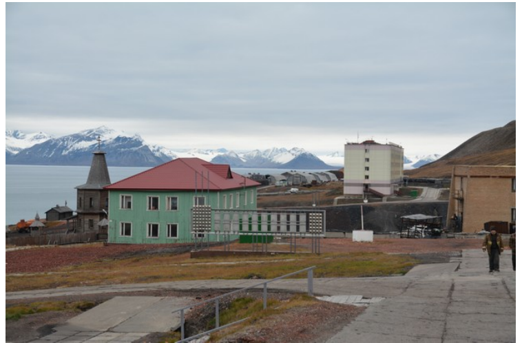
Here we are on our way back to the boat.