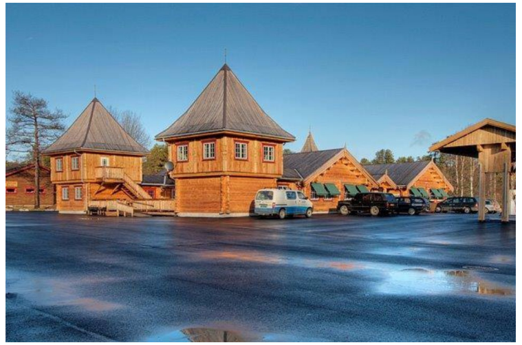
This is Finnskogen Kro og Motell in Svullrya.