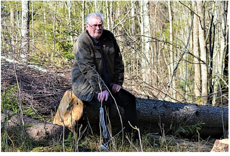
There are felled trees here this winter, but all the timber has not been driven away yet.