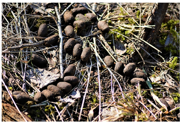
There was also a lot of feces after deer a little further up.