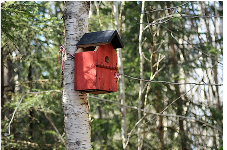
Up in the woods there is a bird box with a partially damaged roof.