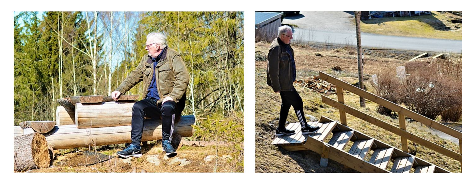
Up here, tables and benches have been made.