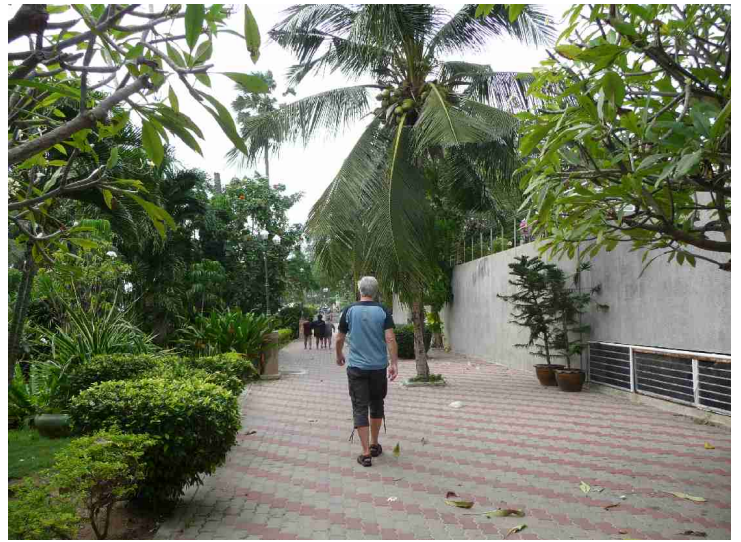
Kjell on the beach walkway.