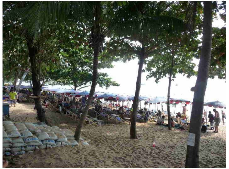
And so does also the beach.