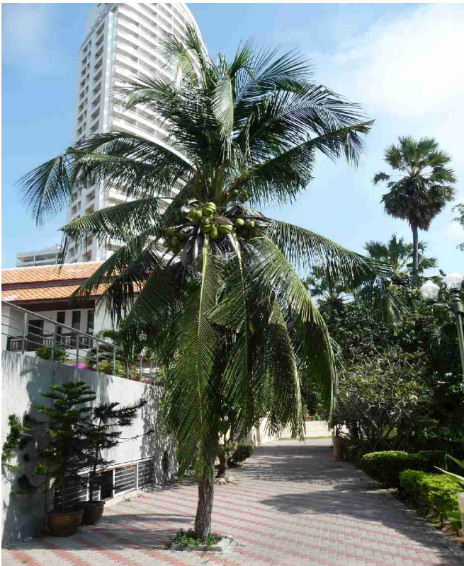
A small coco palm.