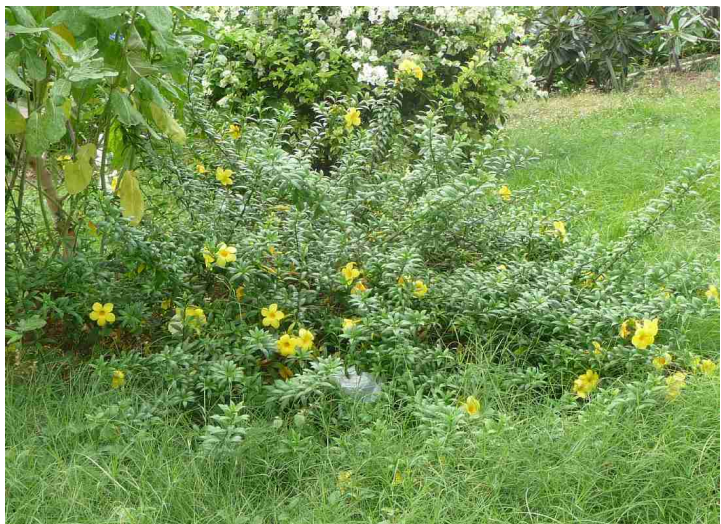
Below follows some pictures of the flowering along the beach promenade.