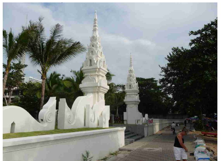
This entrance we thought was especially nice.