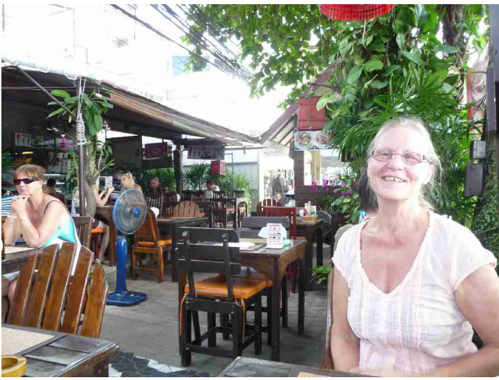
Here we are having a refreshment.