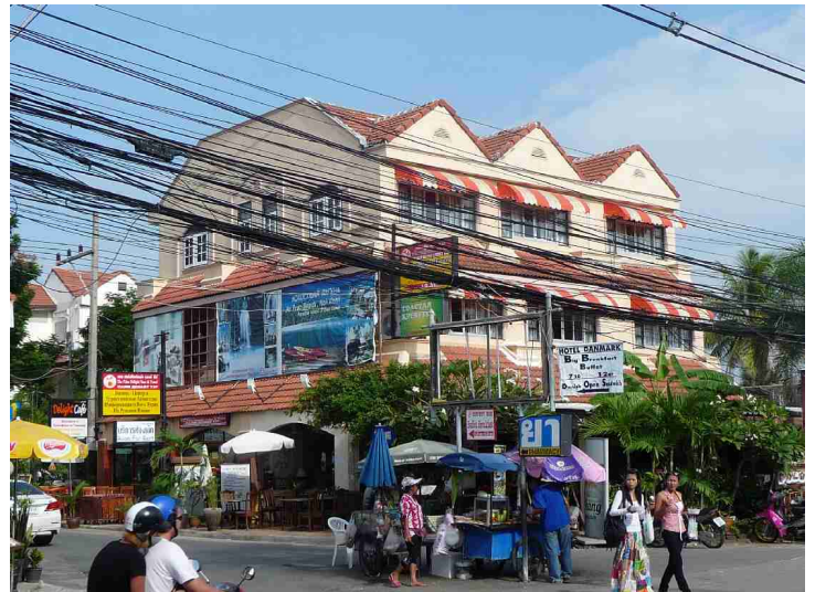
A sign showing to Hotel Danmark.