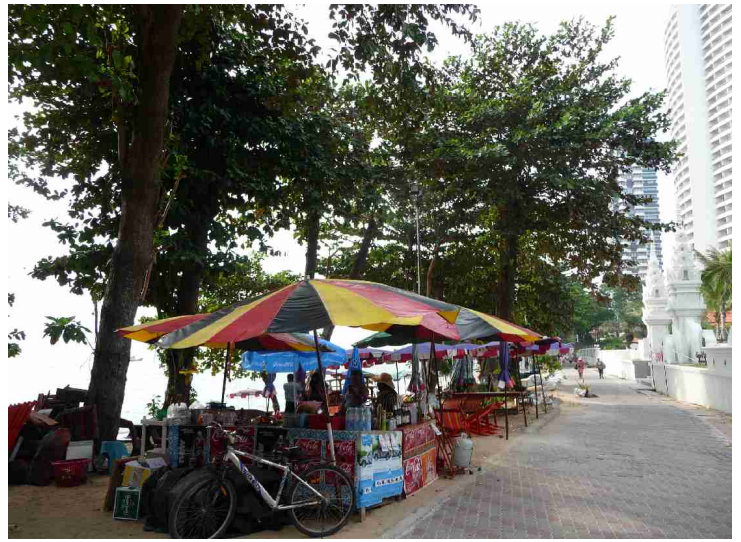
More sales booths.