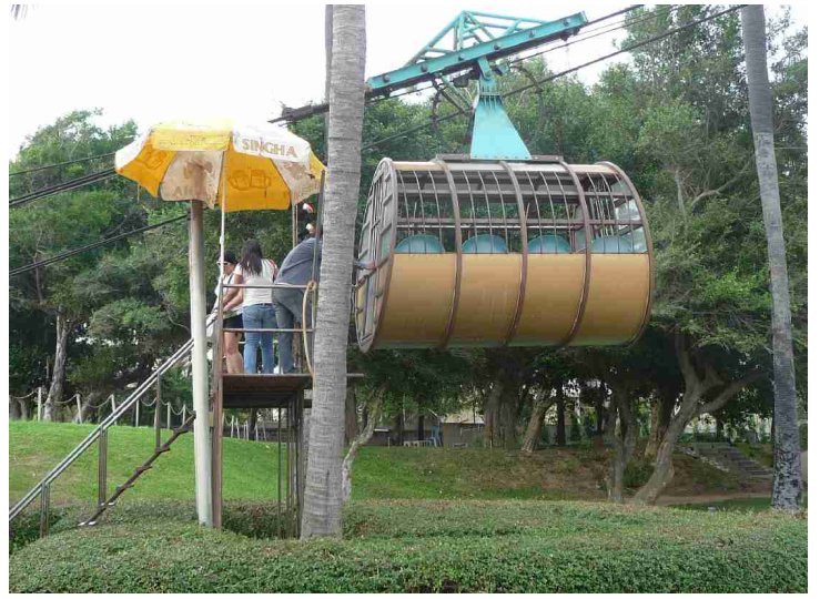
Here one of the carriages has come down again and is ready to take on board passengers.