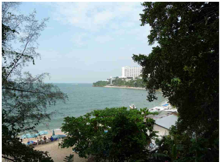
North of New Nordic are more beaches.