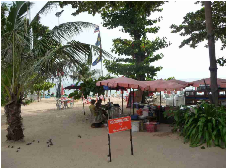
There are various booths along the beach promenade.