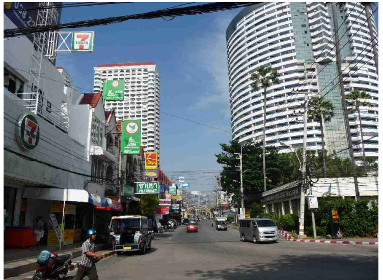
Here we have reached the centre of Jomtien. It is just as densely built-up area here as in Pattaya and the traffic is just as heavy.