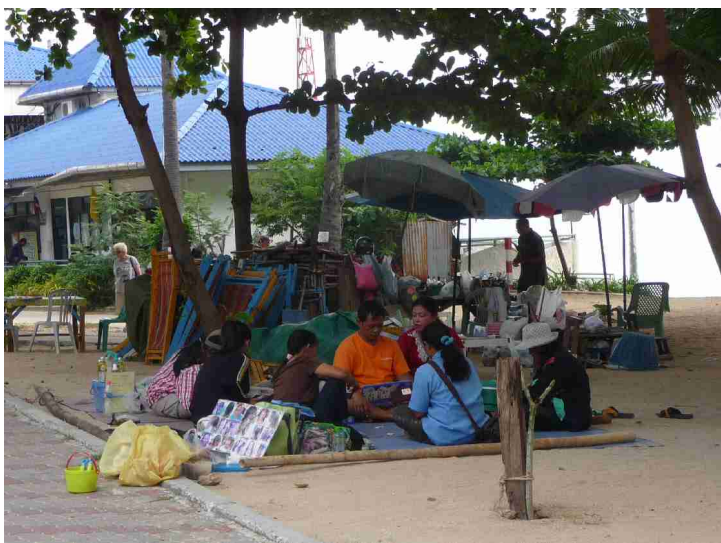
Here is a bunch sitting and playing some sort of card game.