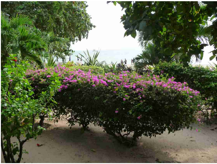
There are nice plantings.