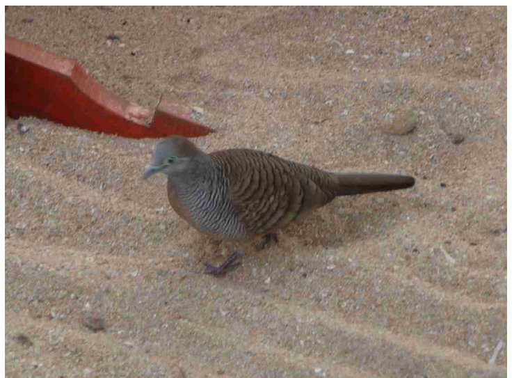
A young pigeon bird.