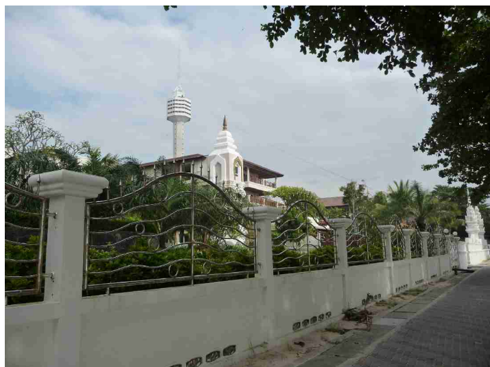
There are some nice hotels along the beach.