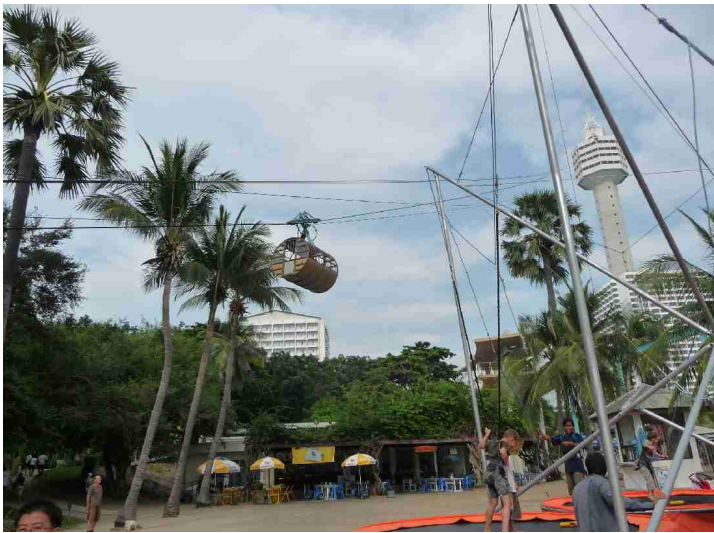
In here is a big amusement park.