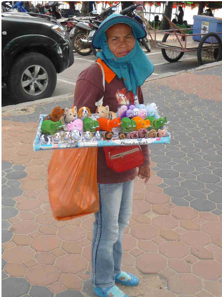
She is selling puppies with nodding heads.