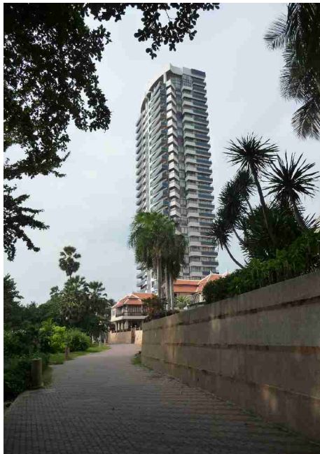
Here is a big apartment hotel.