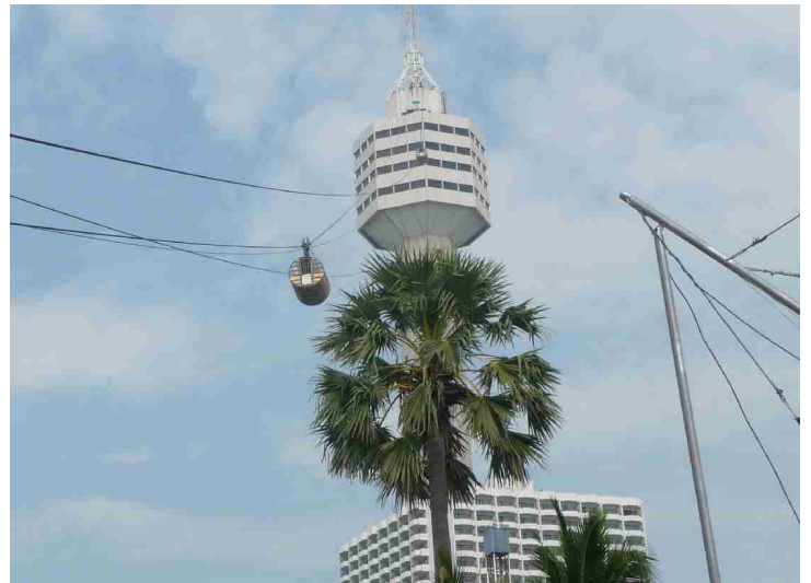
A high hotel with a restaurant at the top. There is also an aerial cable-way.