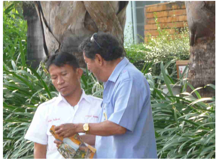
Later we took a taxi back to the hotel, but the taxi driver took a wrong turn. He was far into Pattaya. Here he is asking for the right direction.