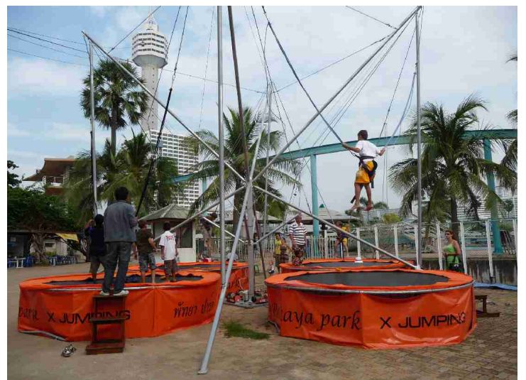
Some of the amusement park.