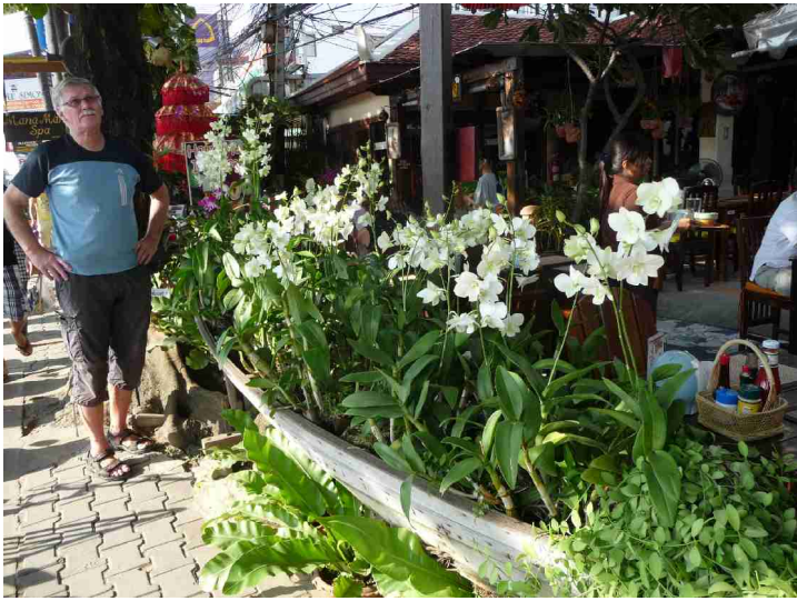
Along the street there was canoe planted with a lot of orchids.