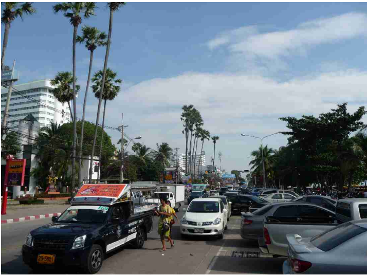
The built-up area continues for many kilometers.