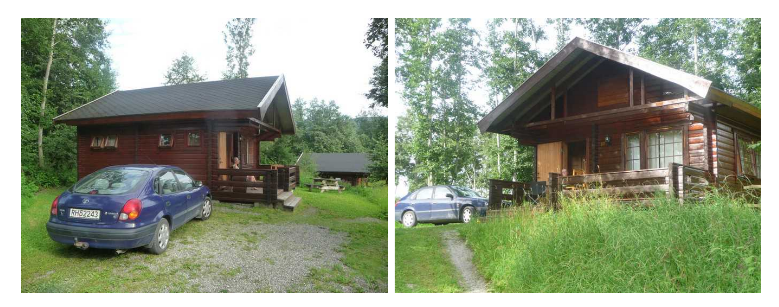
Here is the car parked outside the cottage.