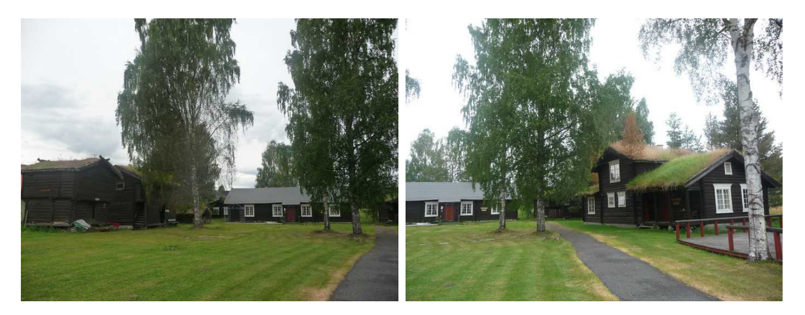
Kaffekvernstua to the right.