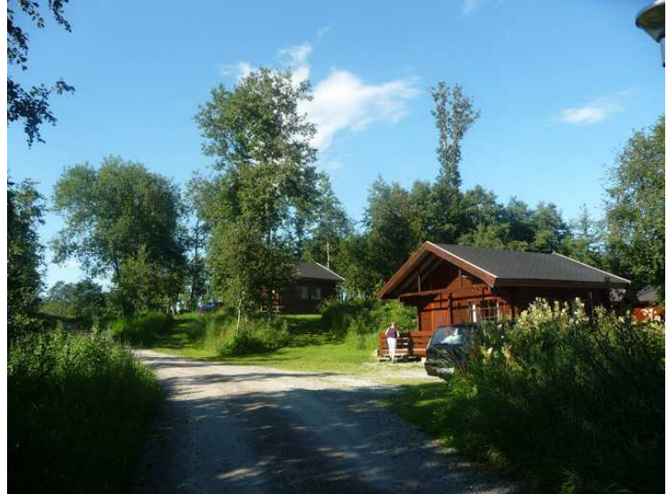
Our cabin is located on the top.