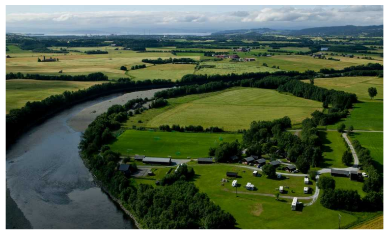
On Stiklestad we had ordered cabin at <u>Stiklestad Camping</u>. This is an aerial photo of the site, taken from the website of the campsite.