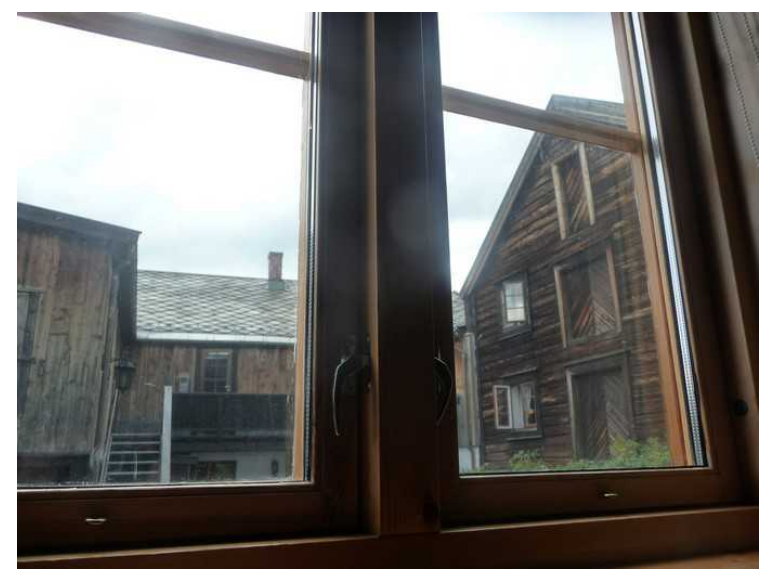
View from our room at Vertshuset Røros.

We had expected to eat dinner at the hotel, but the restaurant was fully booked. So we went down to <u>Røros</u> <u>Hotel</u>. They had a decent buffet.