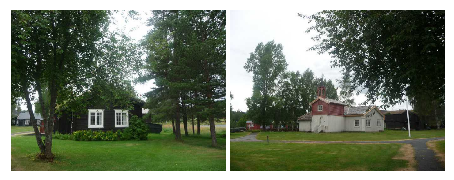
This is Barfrøstua from about year 1600.