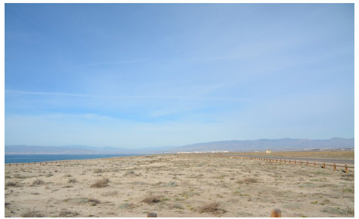
Next stop is in the national park Cabo de Gata . Link Link . Mediterranean to the left and we get a glimpse of the village of Cabo de Gata.