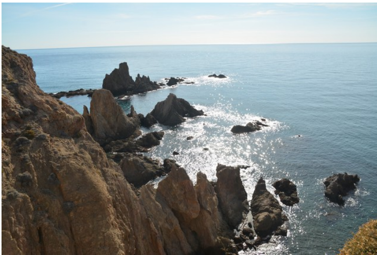
Below the lighthouse there are some sharp rocks.