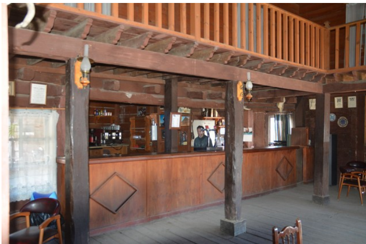
The bar in the hotel.