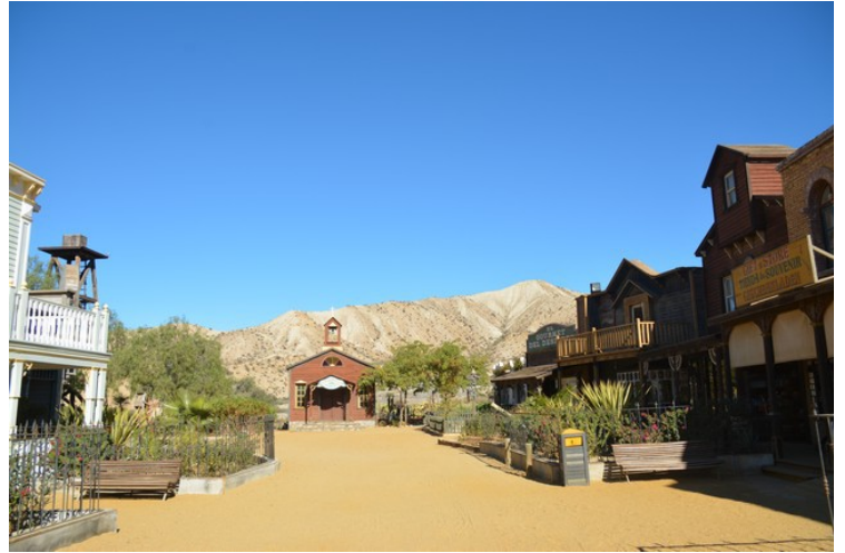
The we were on our way out again.