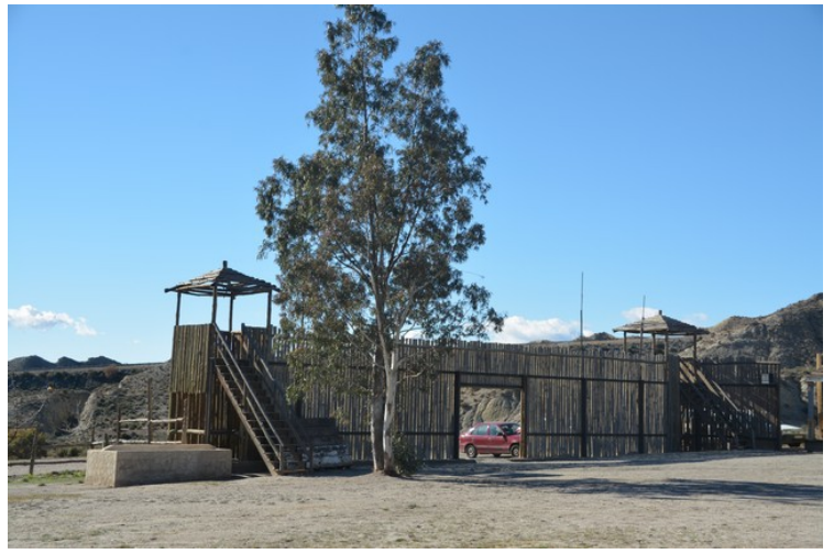
Inside the wall.