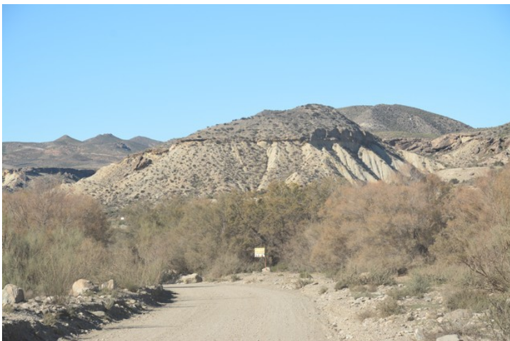
Here we are heading to Fort Bravo , another film set.