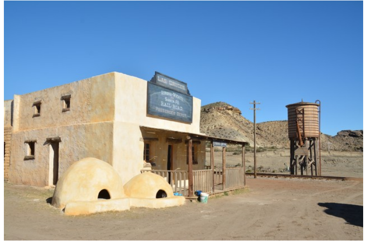
The railway station, tracks and a water tower.