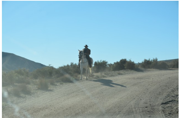
On our way back we met this rider.