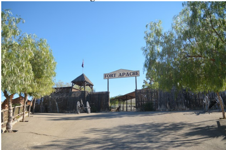
We went in here.