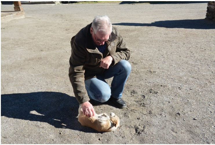
Here he lies on his backs to be scratched on the belly.