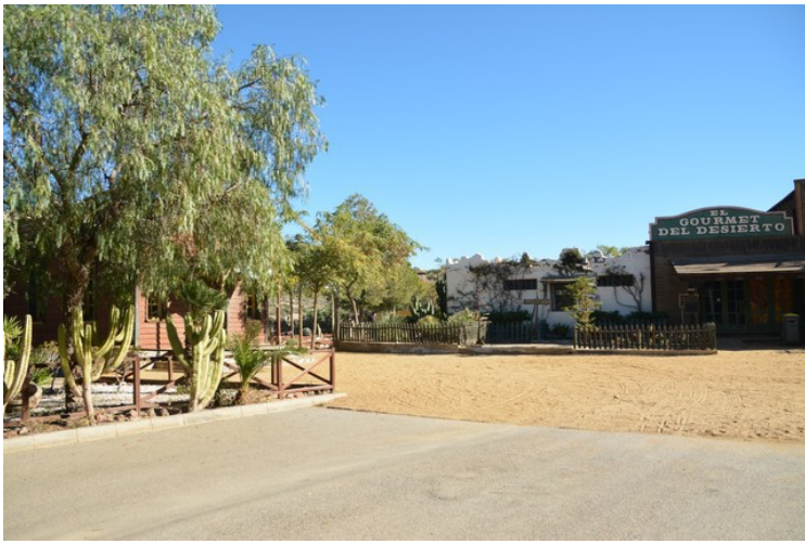
Entering the town.