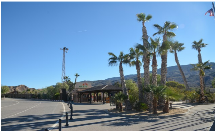
The next stop was at Oasys or Mini Hollywood. This is also a theme park where it has been recorded many movies. Link . This is from the parking and the ticket office.