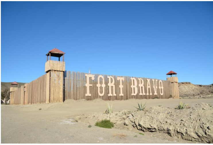
Here is the fort.