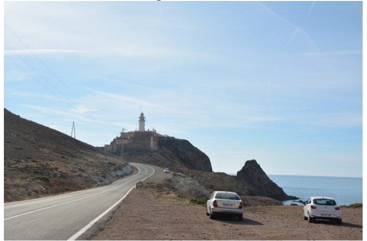
Så kommer vi til fyret, Faro de Cabo de Gata .