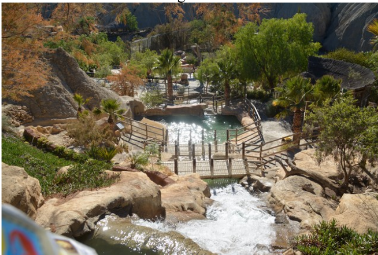
Here is a waterfalls.