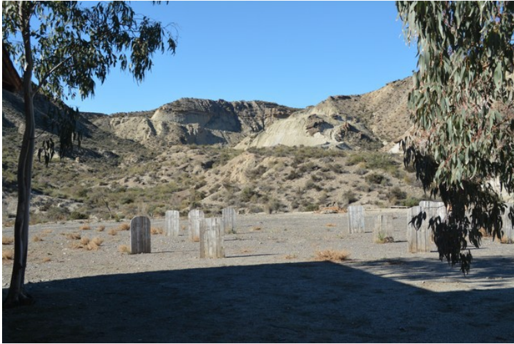
The cemetery behind the church.