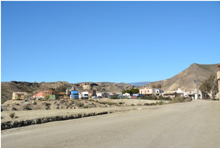
Further up lies the town.