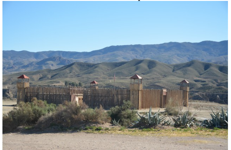
Looking back to the fort.