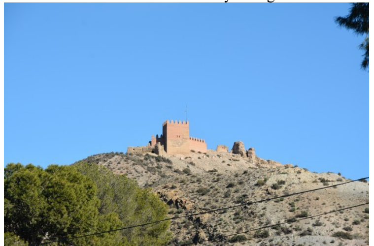
Above the town there is an Arabic fort that was built in the 1100s.