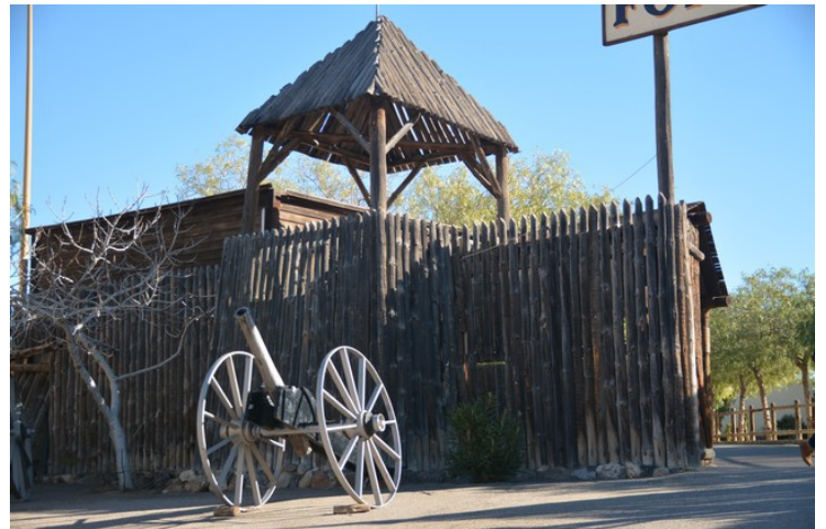
A canon for protection.