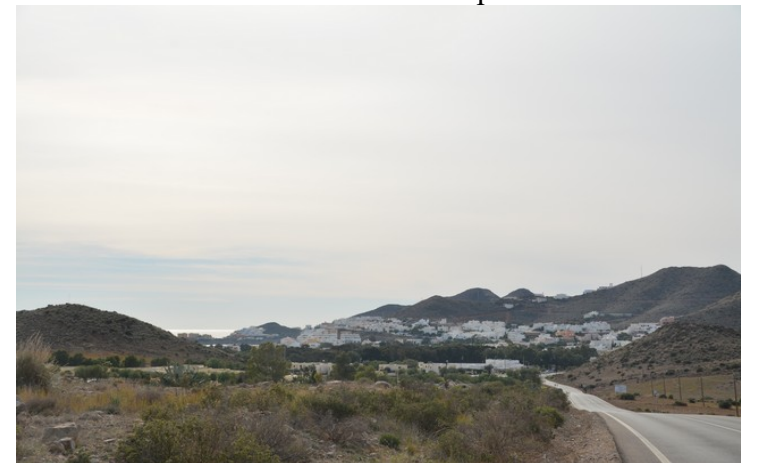
The last stop was in San José , a traditional fishing village and lately a tourist resort.