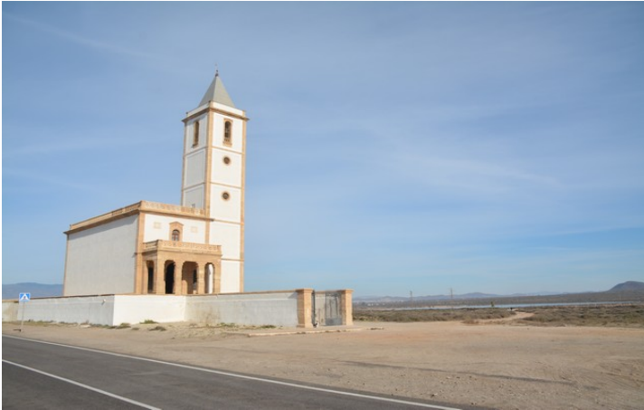
Almadraba-kirken sør for Cabo de Gata. Til høyre skimter vi saltsjøene .