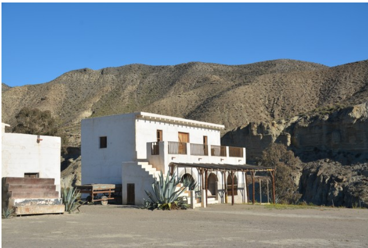
Nice residential building.