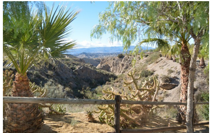
On the other side of the bridge we can look down the ravine.