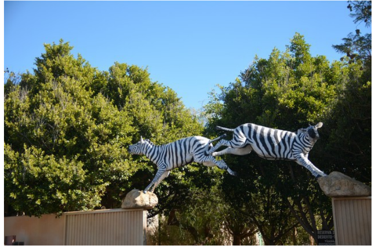
Further up is a zoo.