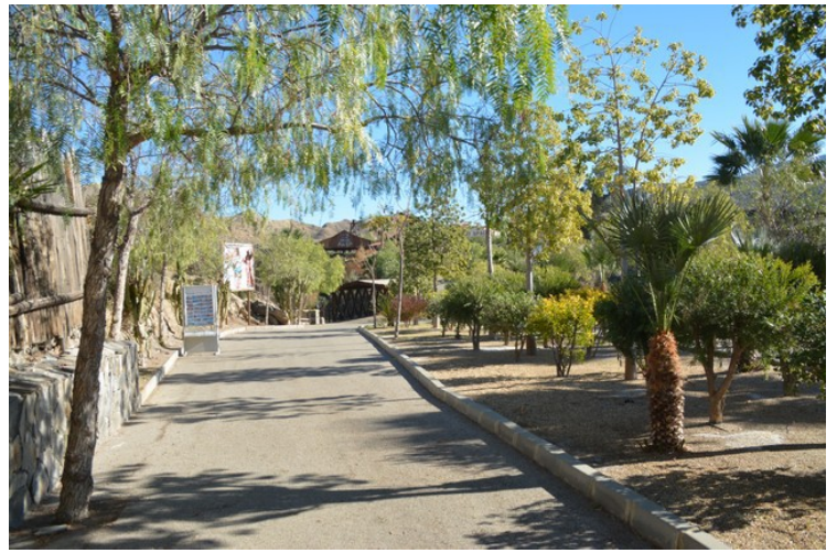
Further into the park.