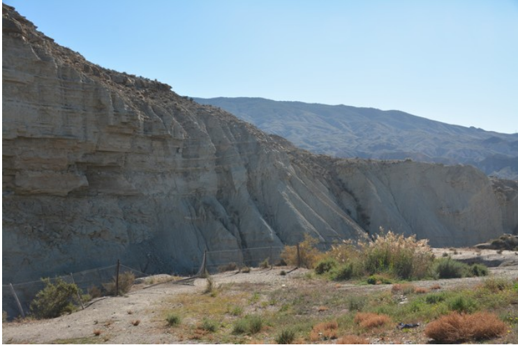
The town is situated by a ravine. Here we see down.