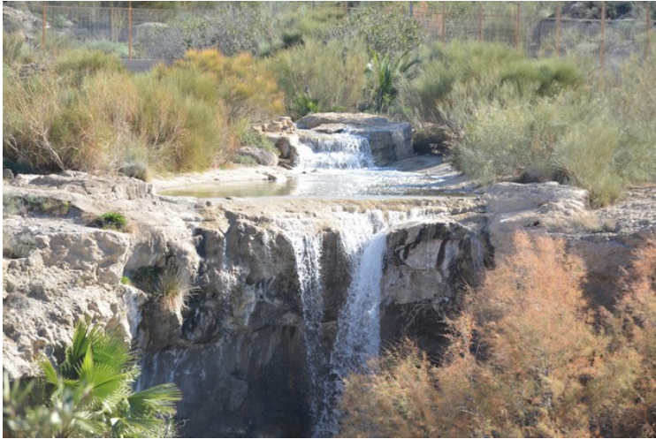
A real waterfall further up in the valley.