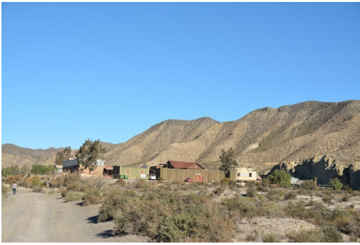
Here we see the town too.