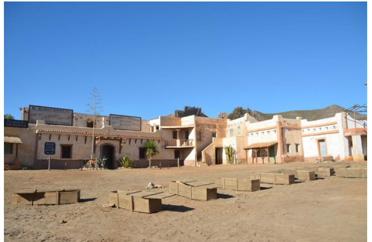
Many coffins are ready.