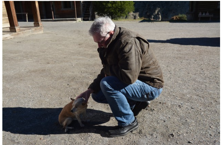
We had to scratch a little dog who would greet us.