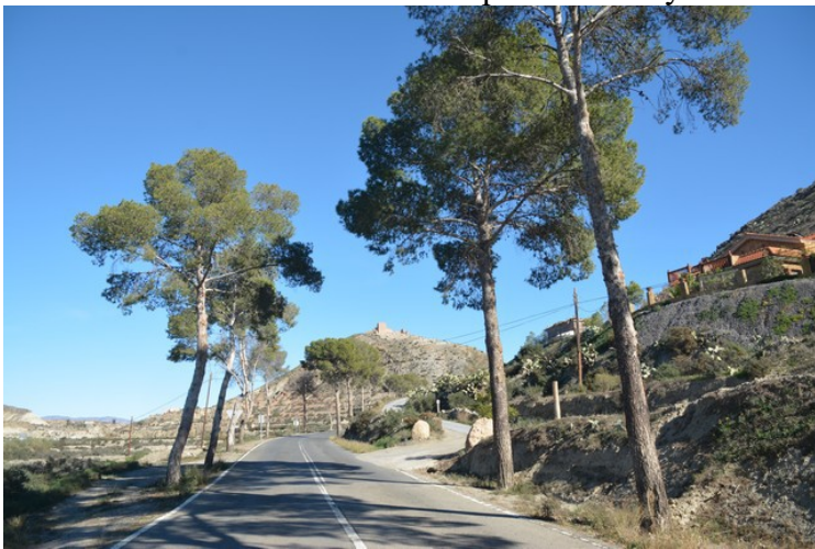
This is just before arriving to Tabernas .