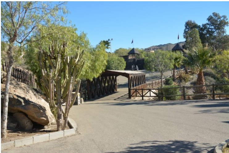
A bridge across a ravine.