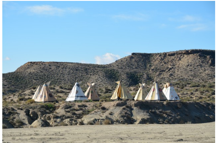
Here are also tipis.