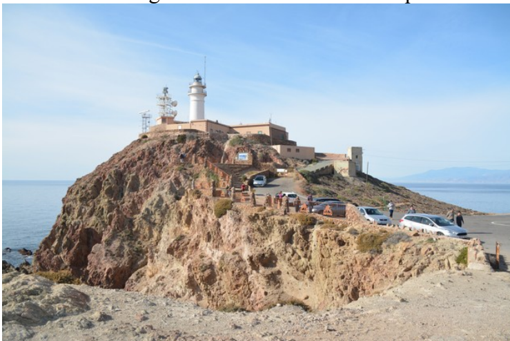
The lighthouse again.