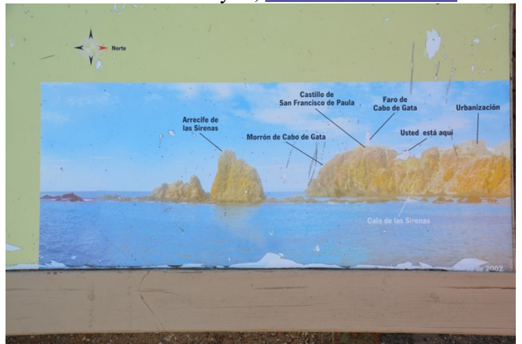
Name of the different places.