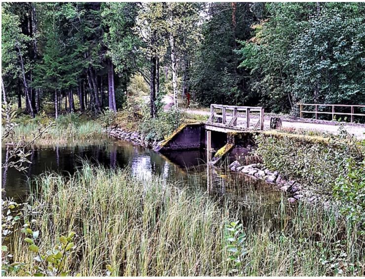
This is the dam. It was closed. In addition, there is an overflow under the road where the water is drained through a large plastic pipe.