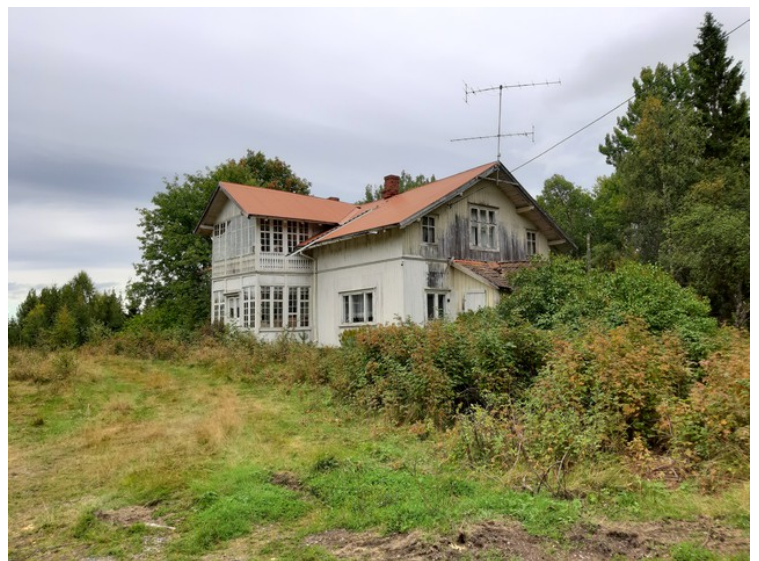
House in Vestre Græsberget. It was built in 1912 and replaced the old one. The outbuildings are gone.