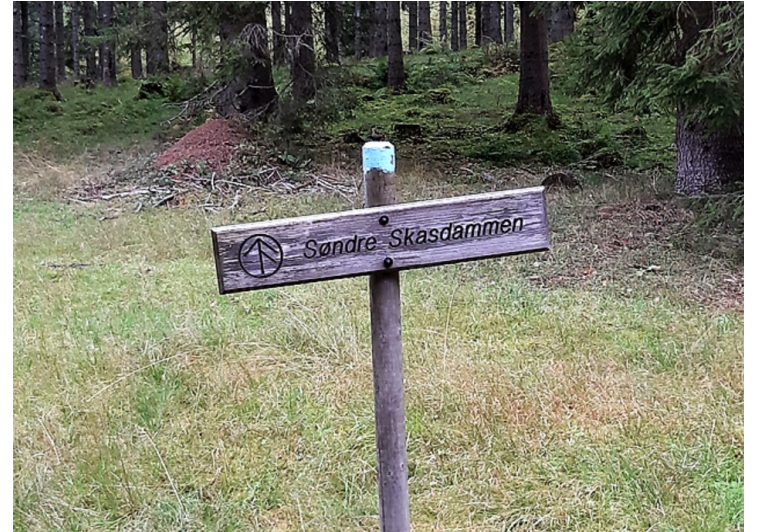
Søndre Skasdammen was built in the end of the 1800's. Here, only the old main house still stands. There are traces of several other buildings in the surrounding area.