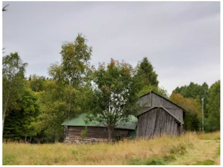
This barn building in Østre Græsberget will soon collapse.