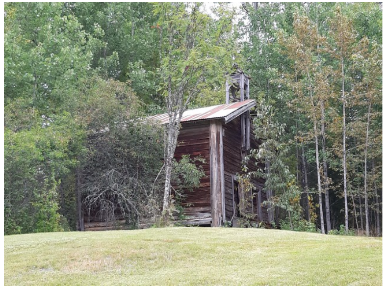
A granary in Vestre Græsberget.