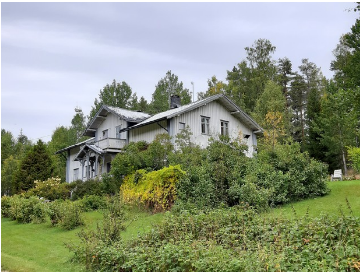
A large house in Østre Græsberget. It is a house from the early 19th century, but it was changed in the 20th century and there was panels mounted on the outside.