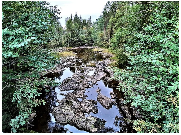
This is below the dam.