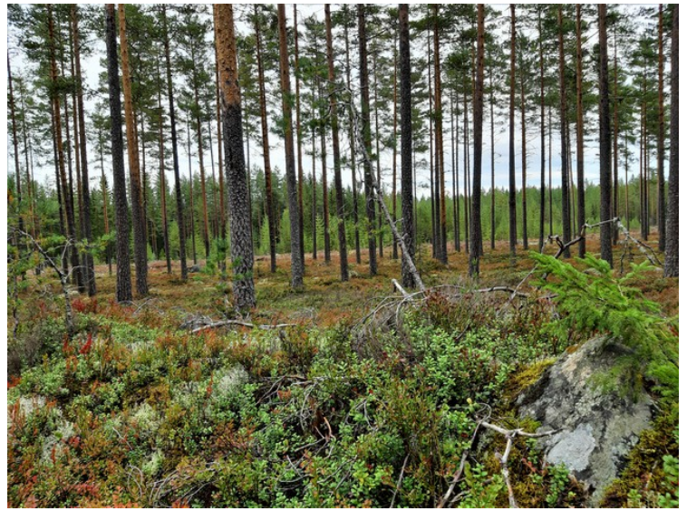
Further north there was a large and fine pine forest.