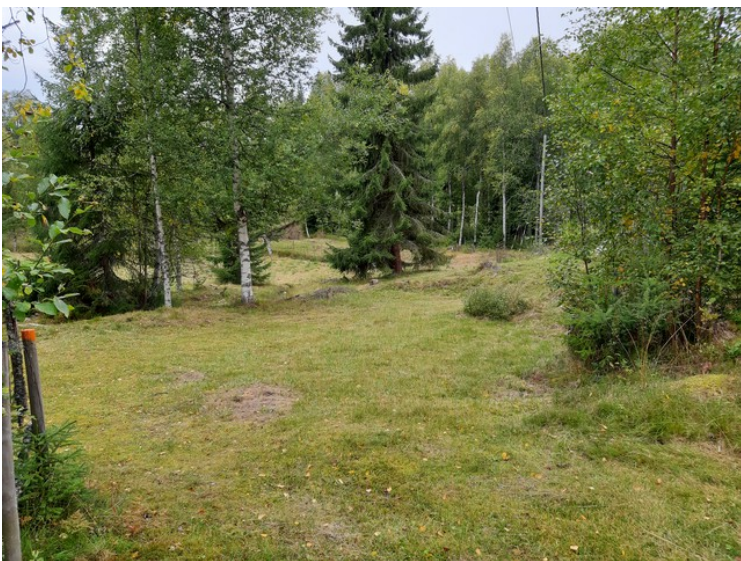
A field in Vestre Græsberget.