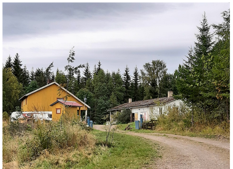
These houses are located in the same area. They looked like they were in use.