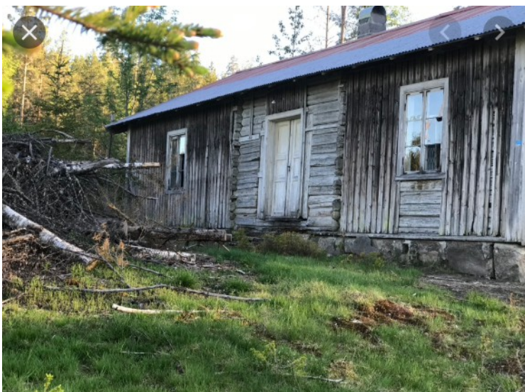
On the other side of the road, a little further north, is Nordre Skasdammen. It is also from the 19th century. Only the old main house is left here. There are plans for restoration.