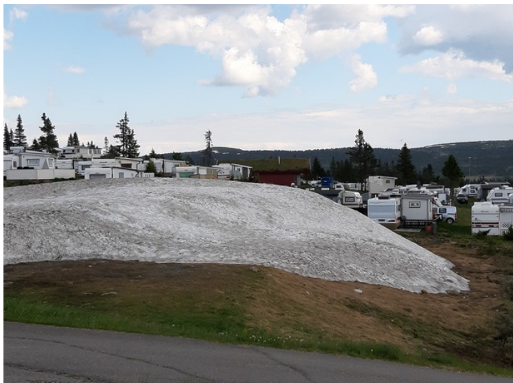
A big snow pile is still here.

There is a café, Sjusjøtunet Kafé , at the center, where we had planned to have lunch.