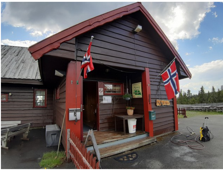
The entrance to the café.