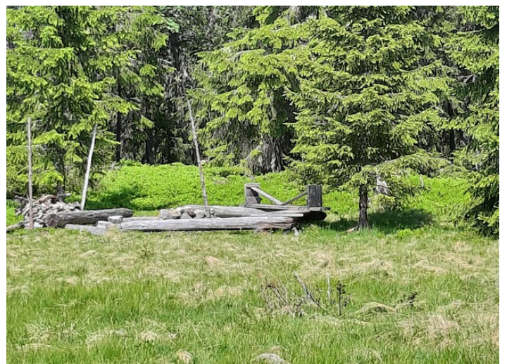
We did not find the shieling immediately. It is located a short distance from the road. There have been several houses here, but they are about to be taken over by nature.