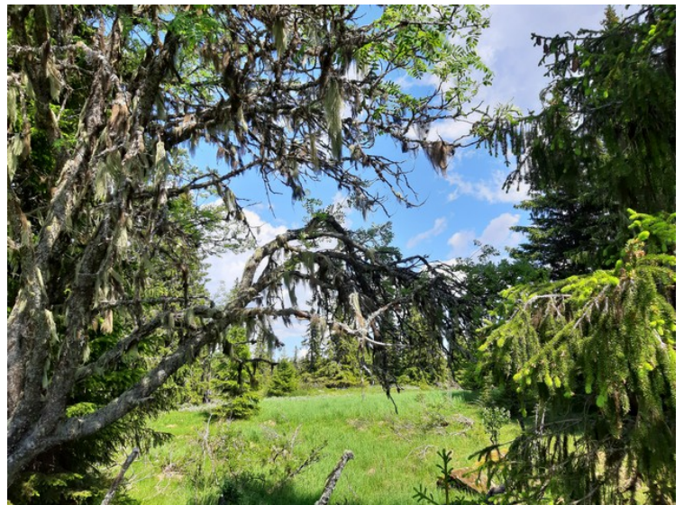
There is some forest along Gunhildsætervegen. The trees are not tall as this is at 700 meters above sea level.