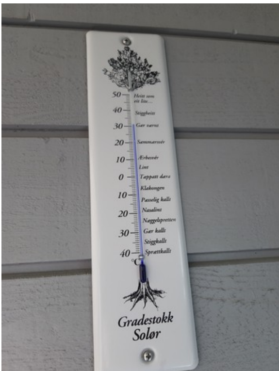
When we got home we saw that the temperature was over 30 degrees.