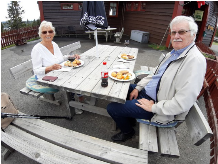
We were eating outside.