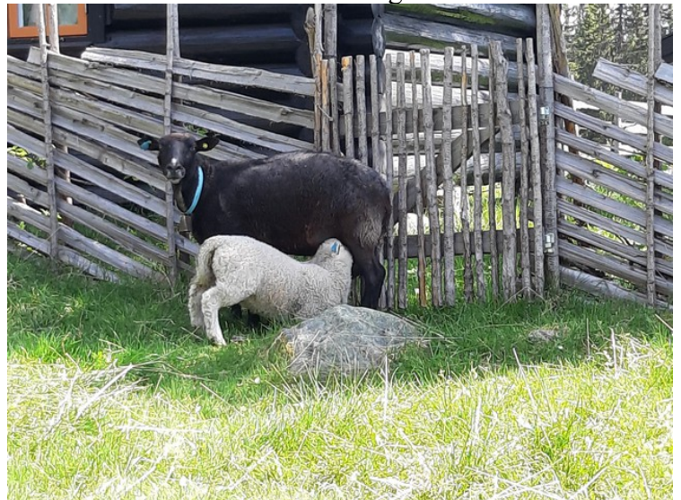
Here were some sheep with lamb.