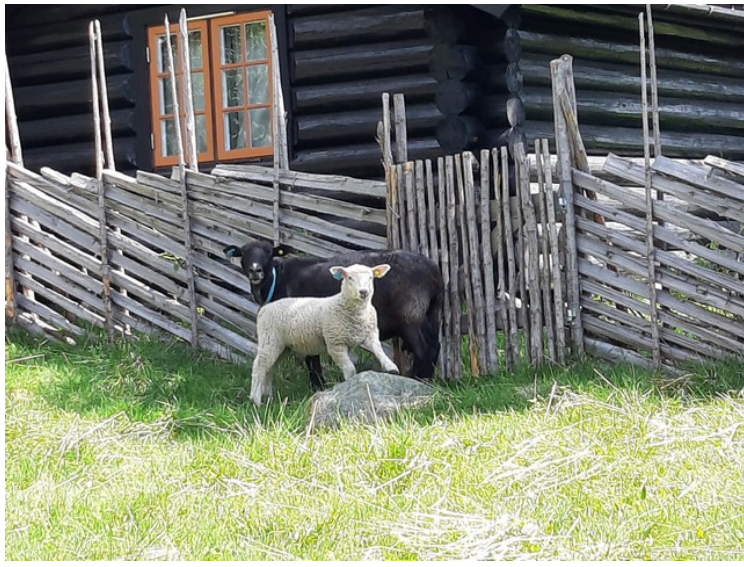
The lamb became curious about us.