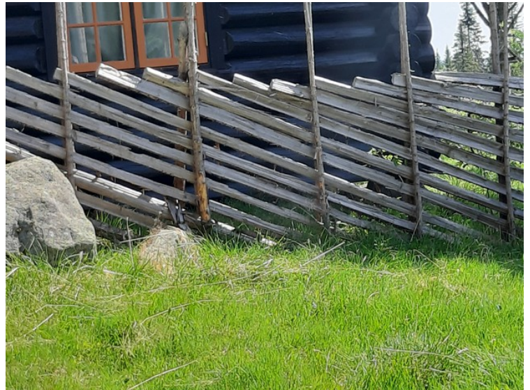
Fence around the neighbor cabin.