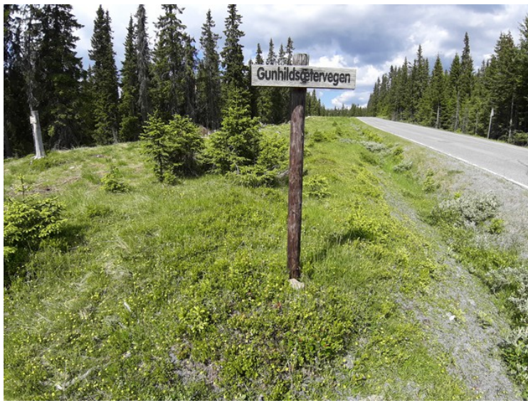
This sign is between Mesnali and Sjusjøen. Gunhildseter road. A “seter” is the same as a shieling .