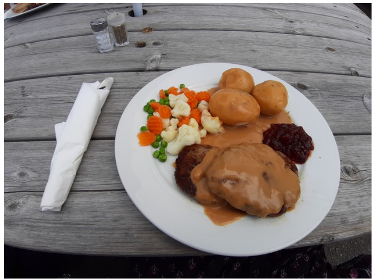
We all had “elgkarbonade”. It was very good. “Elgkarbonade” is a flat meatball made from ground meat from a moose.