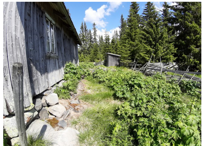
Vegetation around the house.