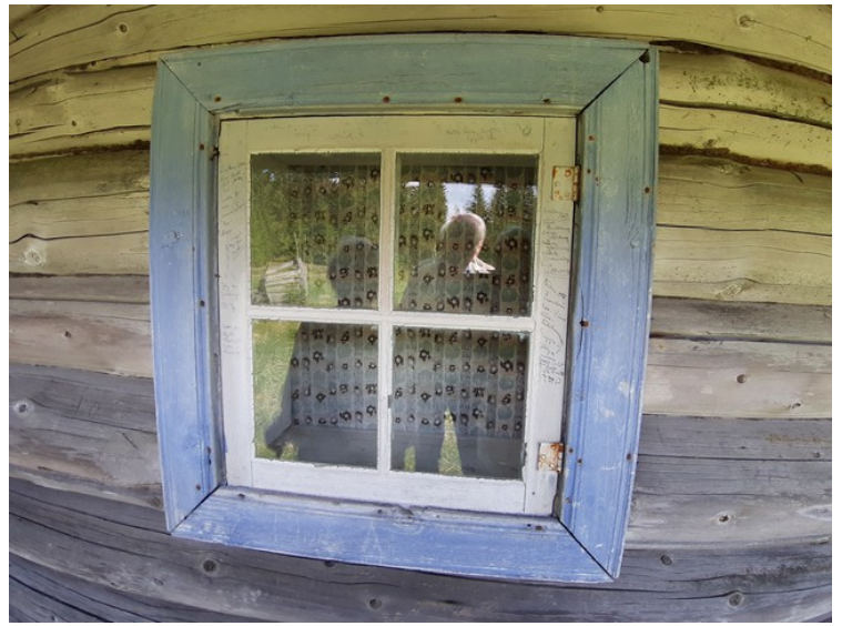
This window is a little special, because some Easter guests have written greetings on the window profiles.