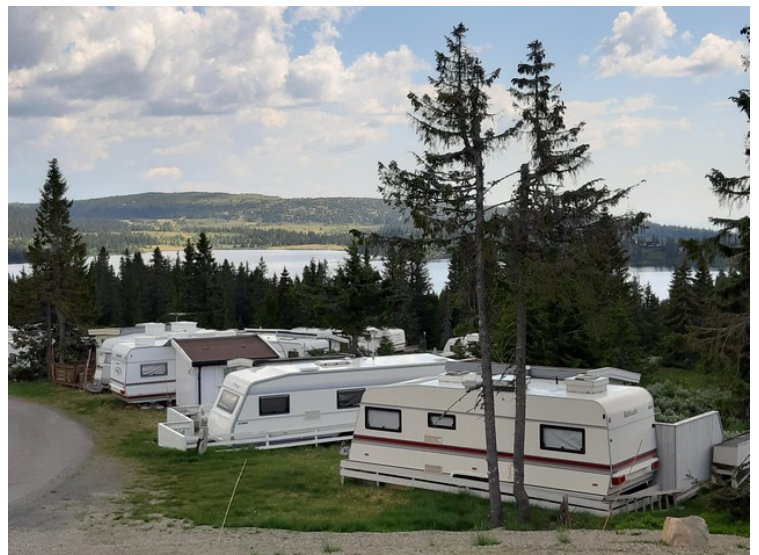
Lot of caravans. We can see Sjusjøen in the background.