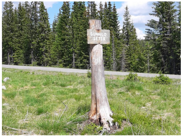
At the start of the road is this sign.