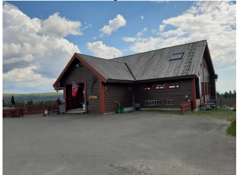
The next stop was at Sjusjøen . There is a large cabin and caravan center here, Sjusjøtunet hytter og CaravanSenter .

There is a café, Sjusjøtunet Kafé , at the center, where we had planned to have lunch.