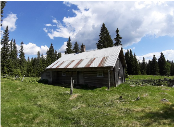
This is the shieling.