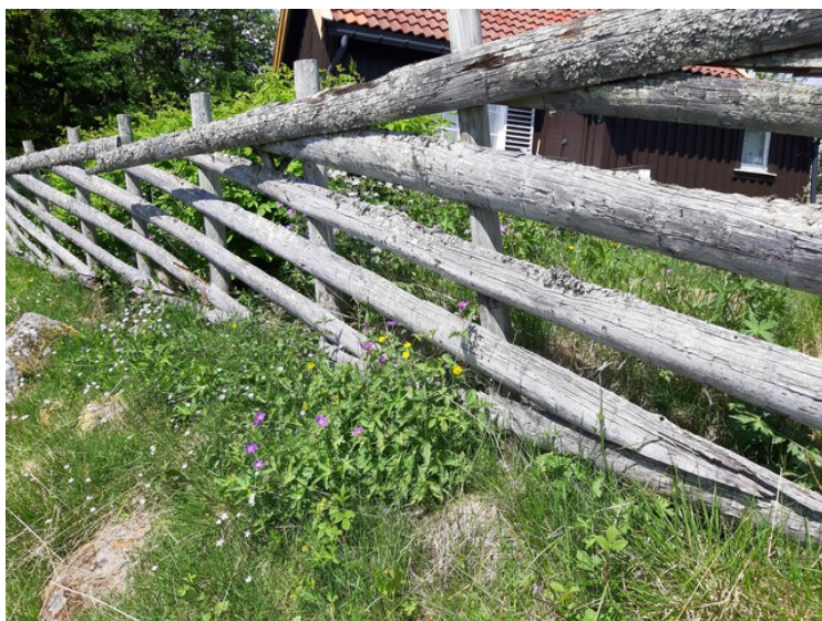
There are also some cabins in the area. Here is one with a roundpole fence around.