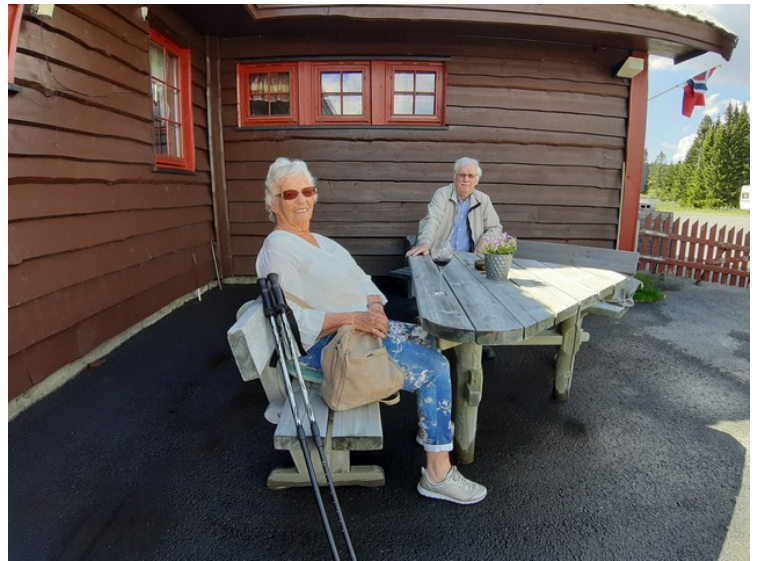
When we had eaten, the sun came. Then we found out that it was better to sit in the shade.