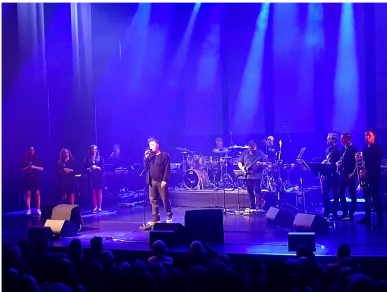
Here is the concert in progress. It was very good.