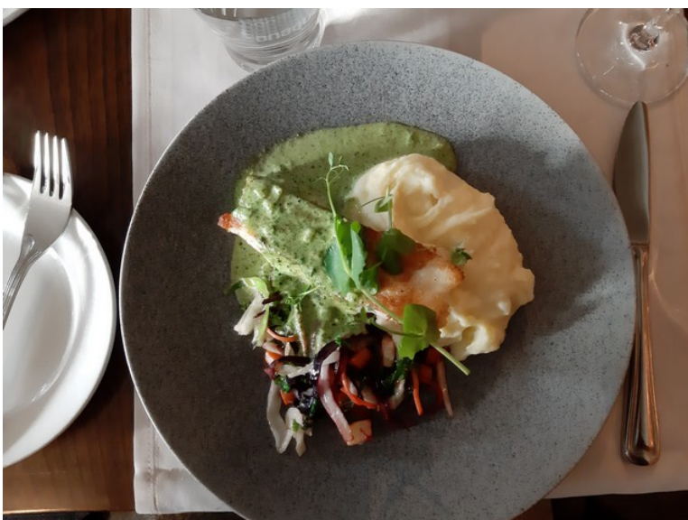
Anne Berit had roasted catfish with pickled fennel, roasted root vegetables, almond potato, cream and spinach sauce.

We were going to celebrate the birthdays of Anne Berit, Hemming, Janette and Stian.