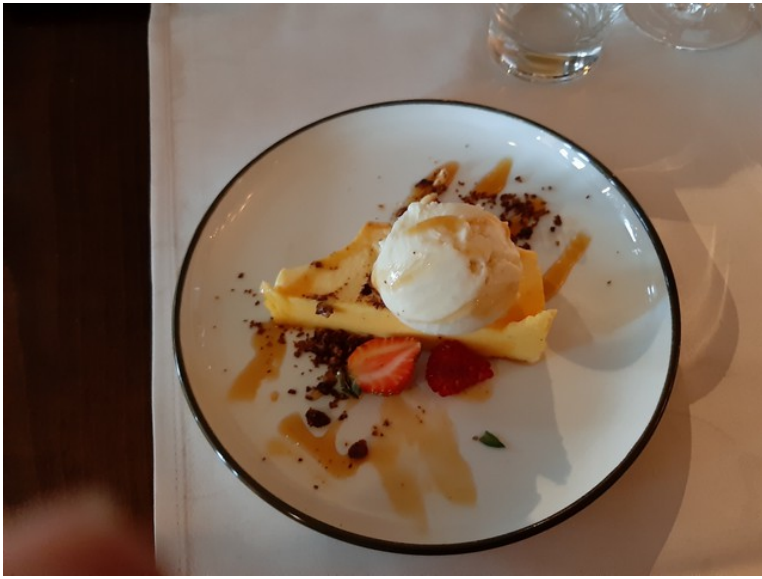
For dessert we had caramel pudding with vanilla ice cream from Iskremgarden, raspberries, caramel sauce and hazelnut crumble.