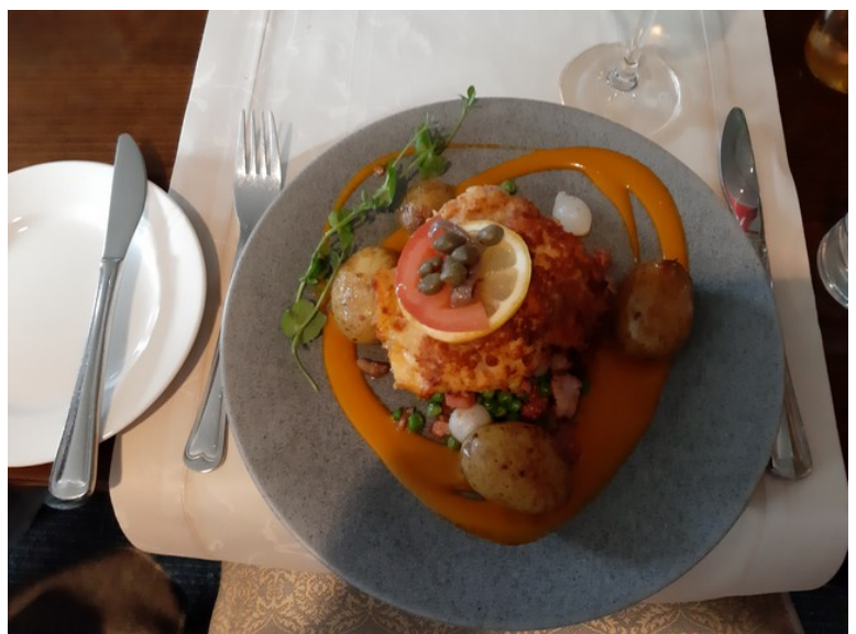
I had Schnitzel, the hotel's special with pork loin stuffed with cheese, ham and ravigotte sauce, served with peas bonne femme and oven-roasted potatoes.