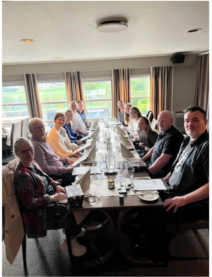
Here is everyone.

The day after, Sunday the 14th, we traveled back to Kongsvinger.