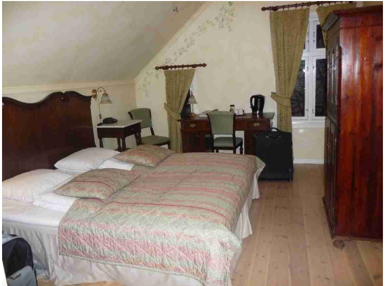
All the rooms are individually furnished, but they have all objects from old times.