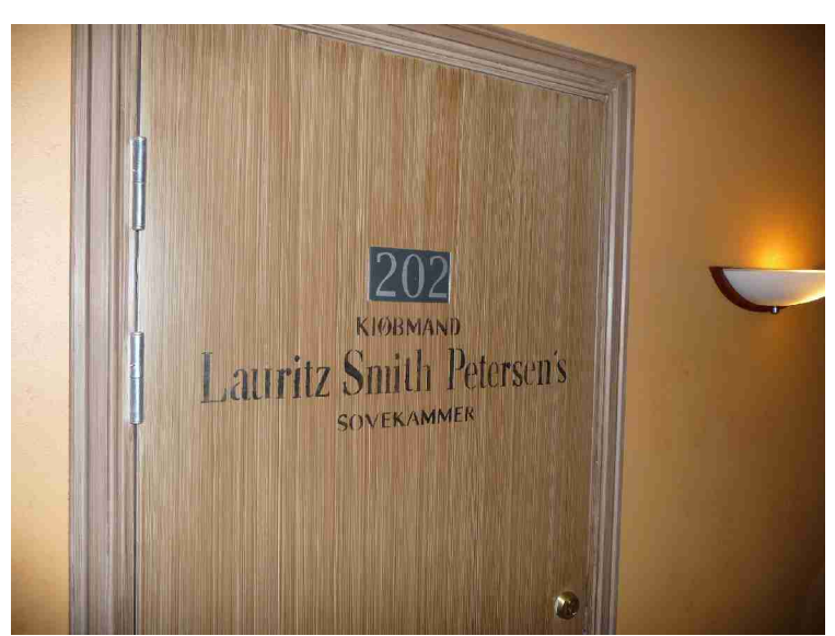
Here we are entering our room at the hotel.