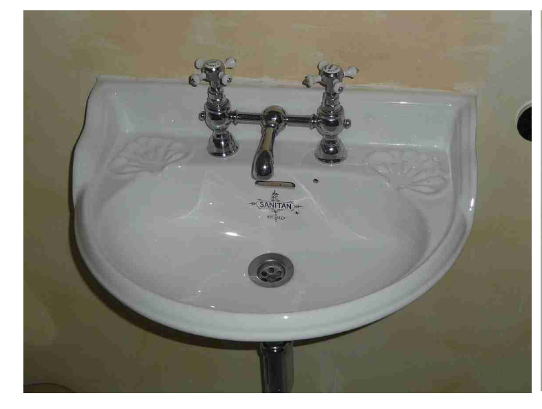
Old fashioned type of sink.