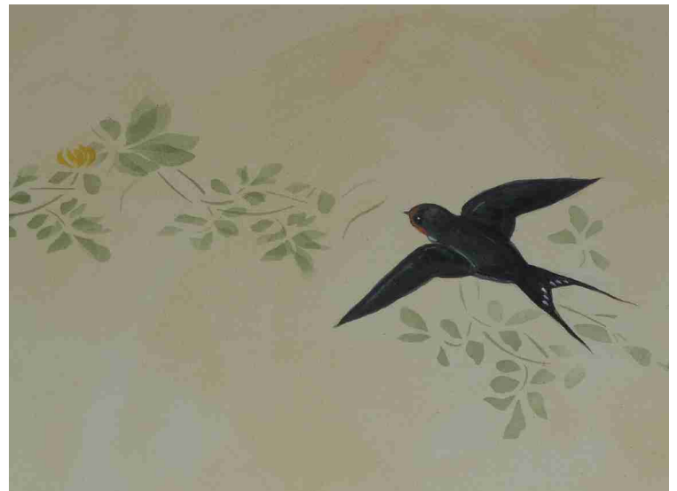
The wallpapers were hand painted.