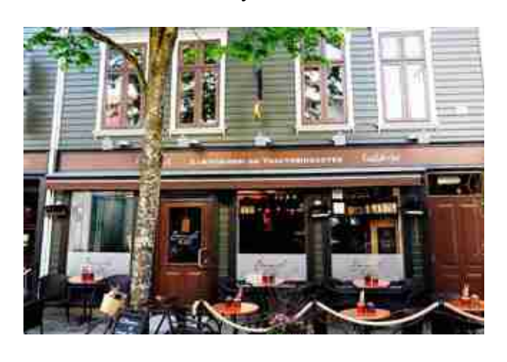
This part is towards the pedestrian street.