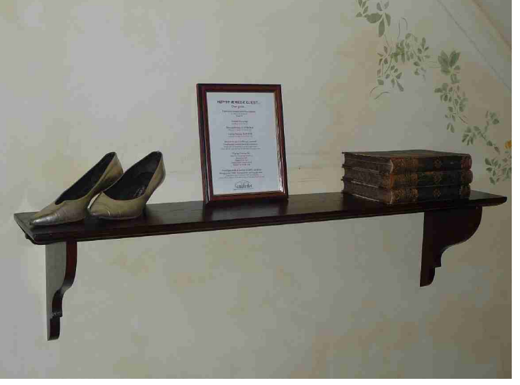
Books and rules + old shoes