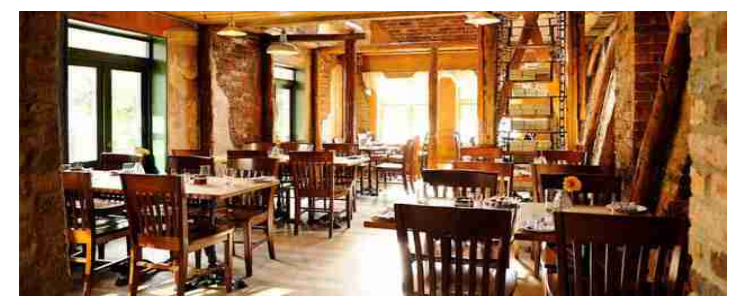
One of the dining rooms.