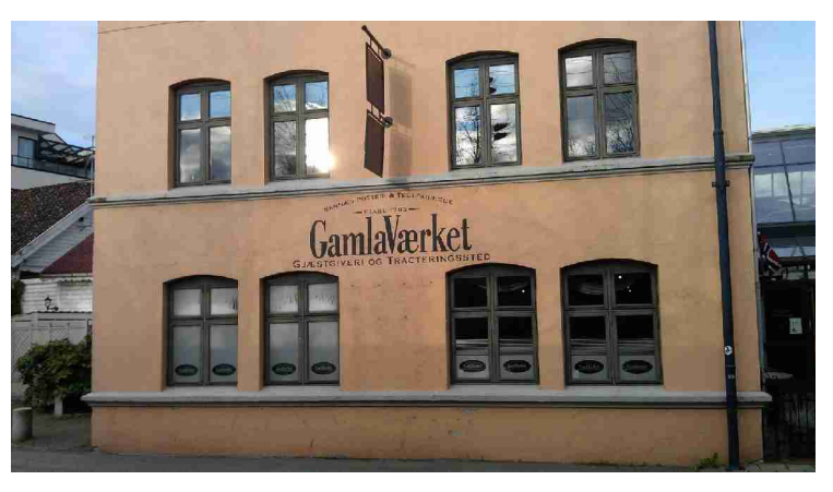
This is the front of one of the buildings belonging to the hotel.