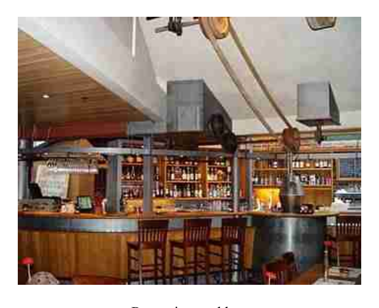
Reseption and bar.