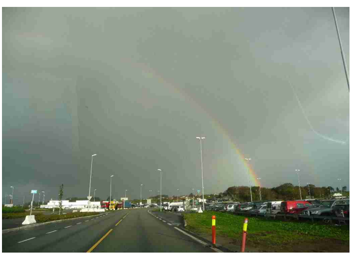
It was raining when we went from the airport.