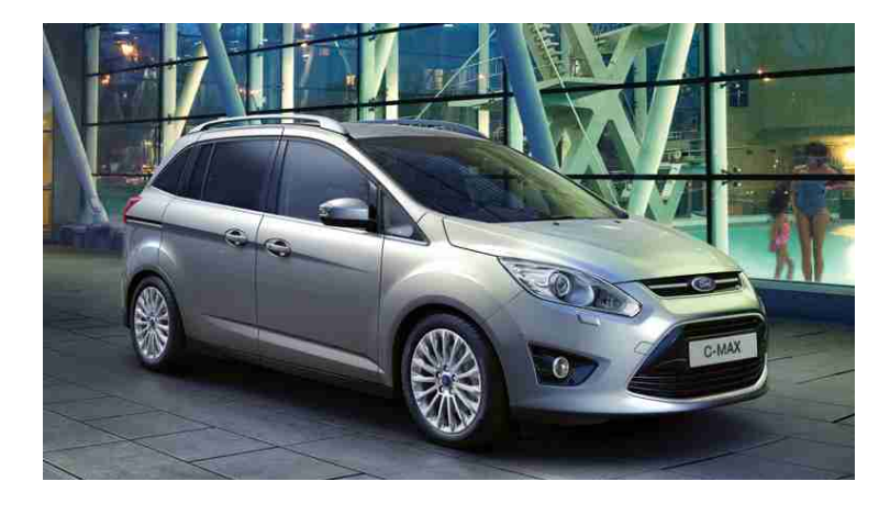
We rented a <u>Ford C-Max</u> at <u>Europear</u>. They have an office at the airport.

We traveled with <u>Norwegian</u> from <u>Oslo Airport</u>, <u>Gardermoen</u> to <u>Stavanger Airport</u>, <u>Sola</u>. We parked the car at <u>Dalen</u> <u>Parkering</u>. This was the last trip this year, so we had Christmas presents with us.