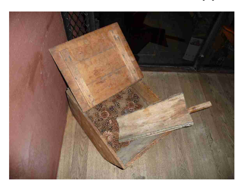
A box with cones to light the stoves. It is not in use any more. © There are quite modern heating in the rooms.