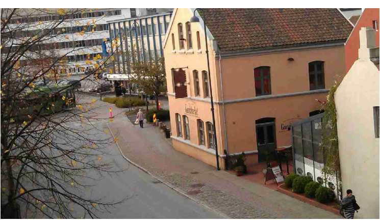
The hotel lies centrally in Sandnes, right besides the railway station.