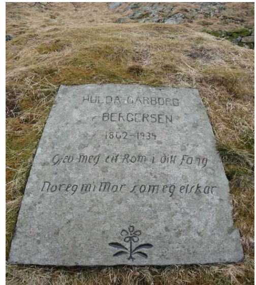
Memorial plaque for Hulda Garborg.

More links to Knudaheio: Jærmuseet , Time kommune , Forfattarnett , Olavsrosa (All Norwegian)