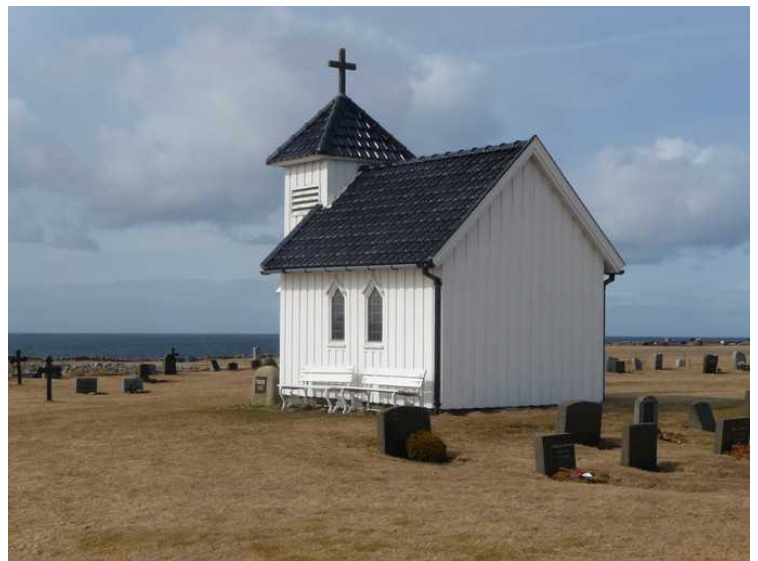
Varhaug old chapel and graveyard . The cemetery and the chapel is located on the farm Varhaug, out to the sea.