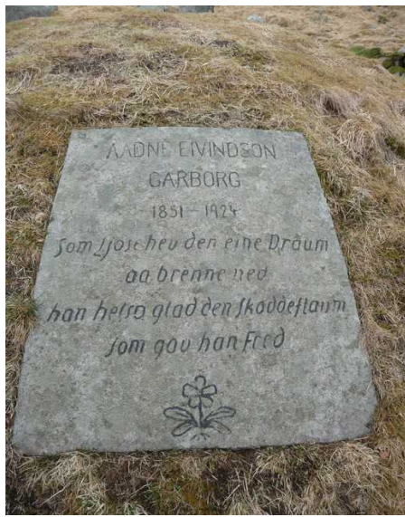
The memorial plaque for Arne Garborg.