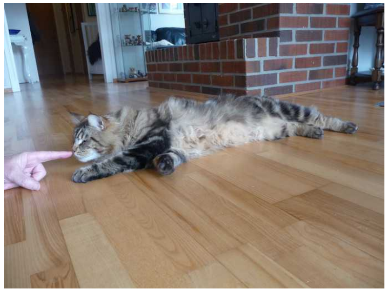
Here I am trying to familiarize myself with the cat. It went pretty well. The cat is of a Main Coon.