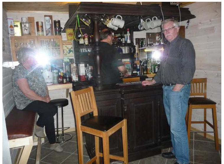
I am quite impressed.