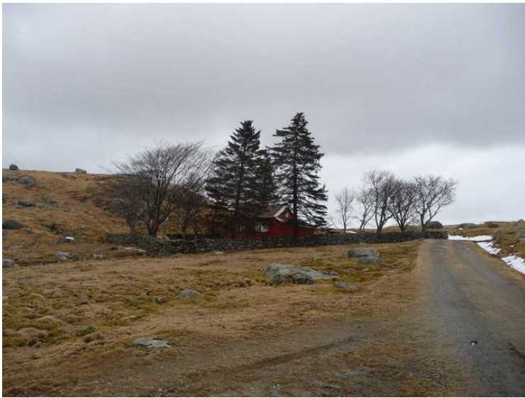
Here we are approaching the house.