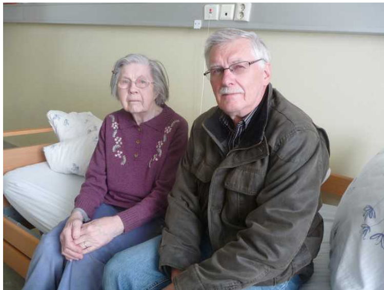
Me and my mother in Stavanger Hospital. She had received temporary space here because she had become demented.