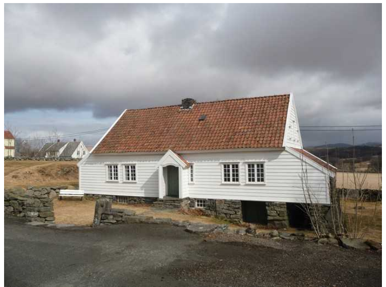
Garborgheimen at Garborg, south of Bryne . Arne Garborg is born here and lived here until he was 16.