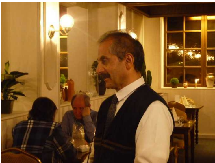
The waiter was from Rethymnon on Crete, and he works all winter in Stavanger and summer in Crete.