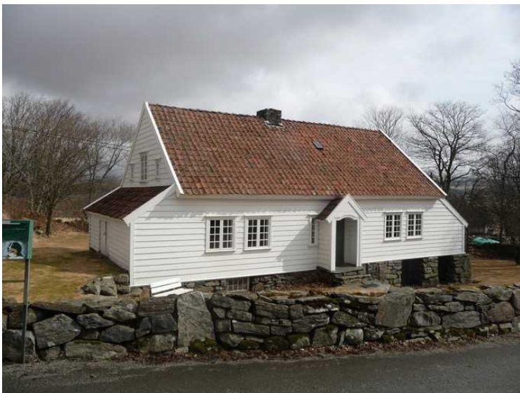
More links in Norwegian to Garborgheimen: Jærmuseet , Time Kommune , Olavsrosa