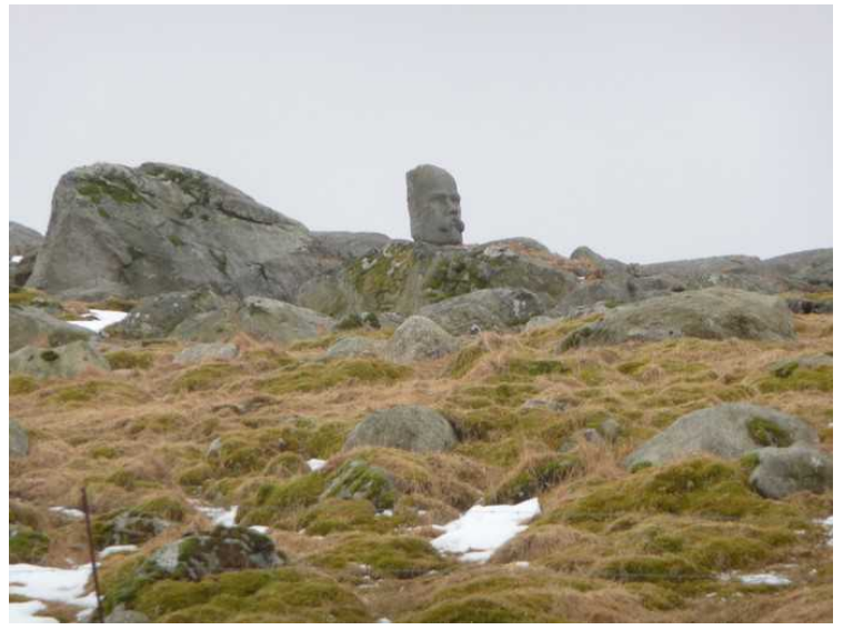
A sculpture in stone of Arne Garborg . It is made by Hugo Wathne . It is located at a height above the house.