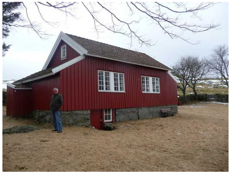
Here I stand outside the house.