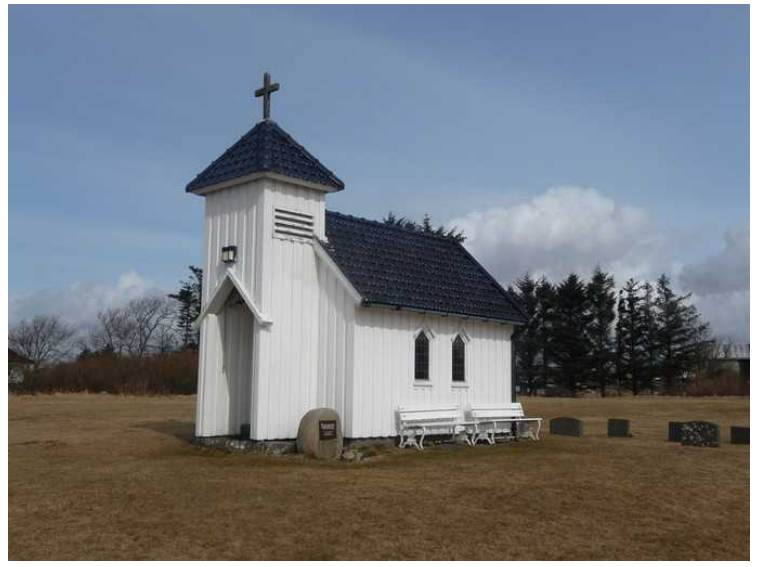
The chapel has only 14 seats (wicker).