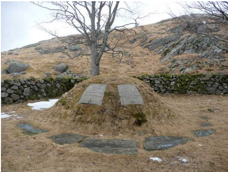
This is the mound where Arne and Hulda Garborg is buried.