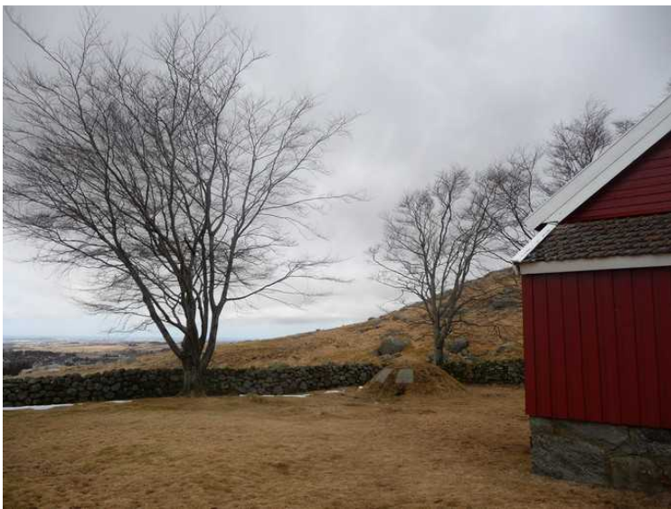
The view north.