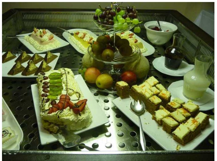
The dessert table.