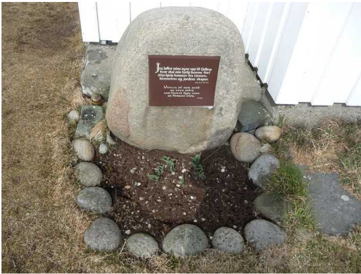
This stone stands outside the front door.