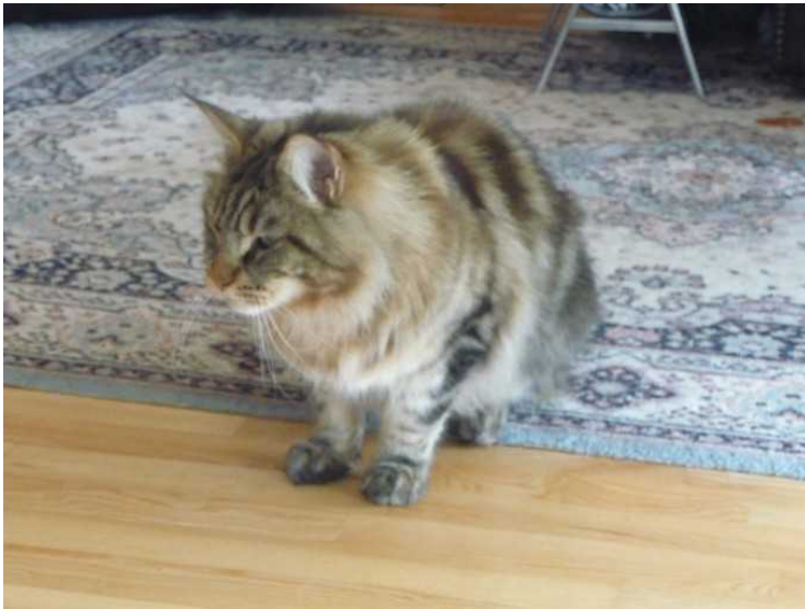
Here it has accepted me.