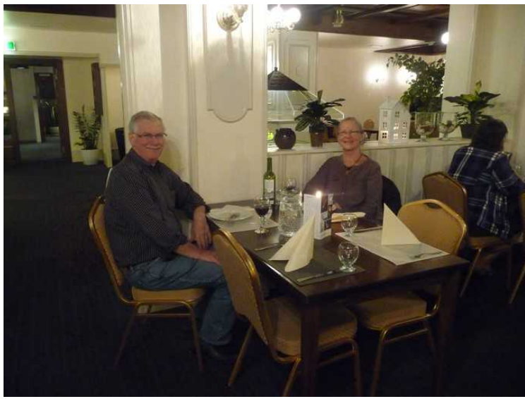
In the evening we ate dinner at the hotel.