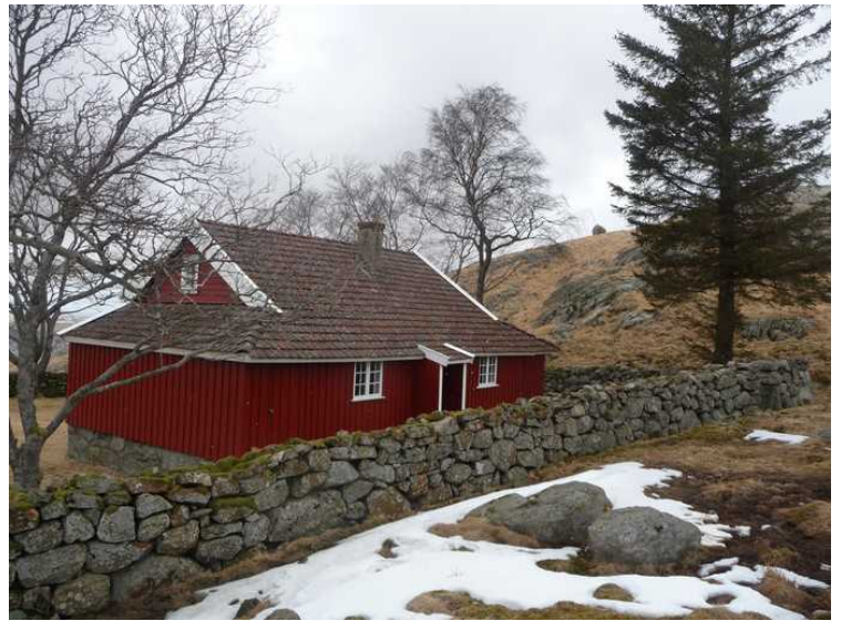
The house seen from above.