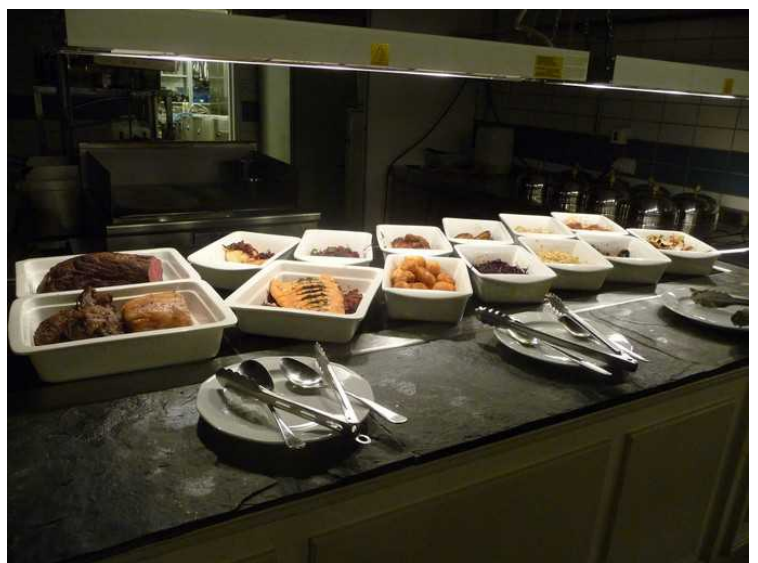
Several different dishes.