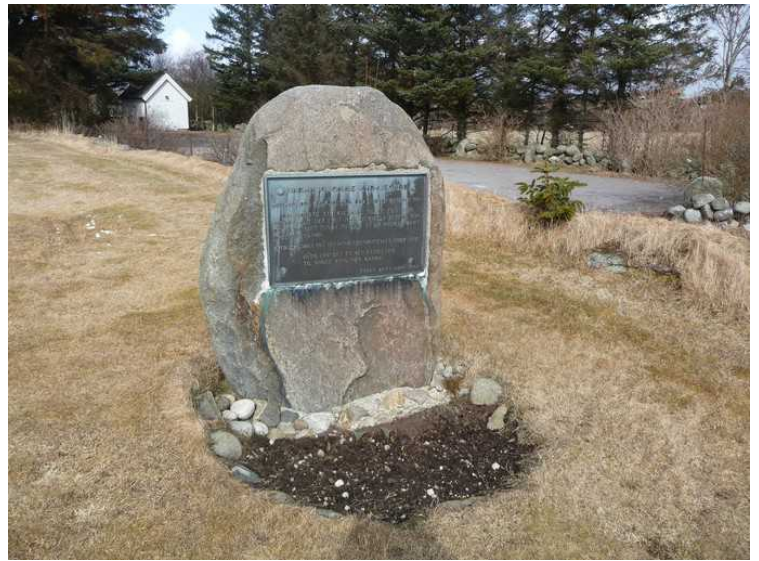
A stone with an information board stands near the entrance gate.