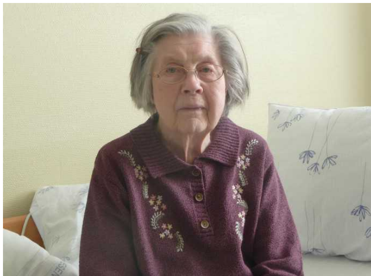
She always find it nice to get visits. You would not believe she is over 90 years old.