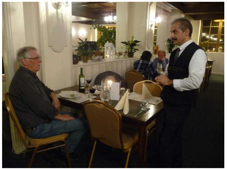
It was buffet style and there was a lot of good food.