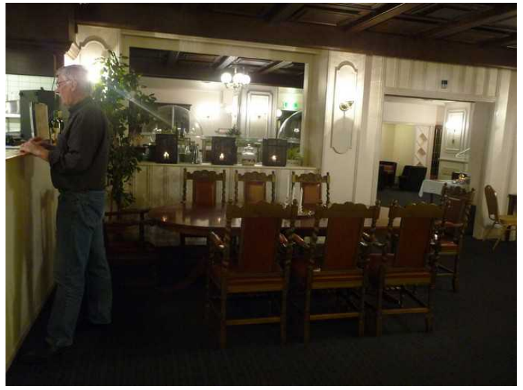
Here I pay for the dinner.

We have many more photos of my family, but they do not want these pictures to be published on the Internet.