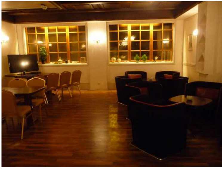
This is the reception.