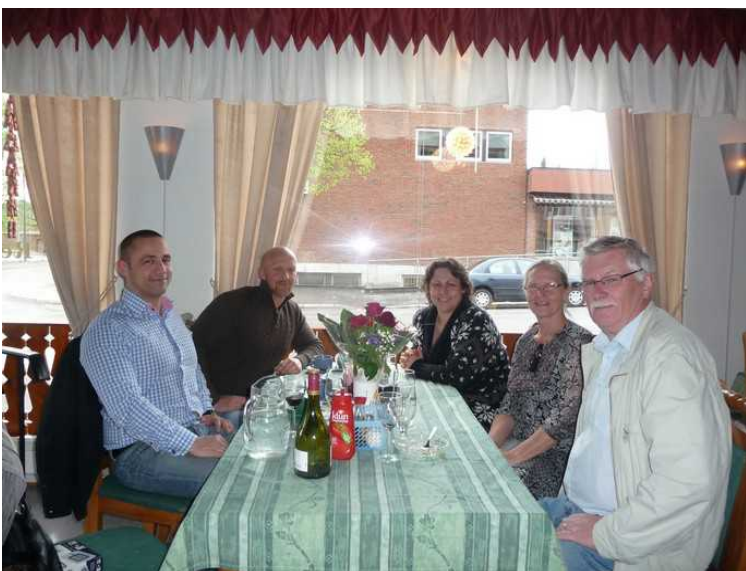
Here we have calmed down again.