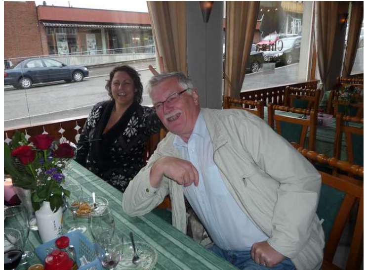
Here was a little more fun.