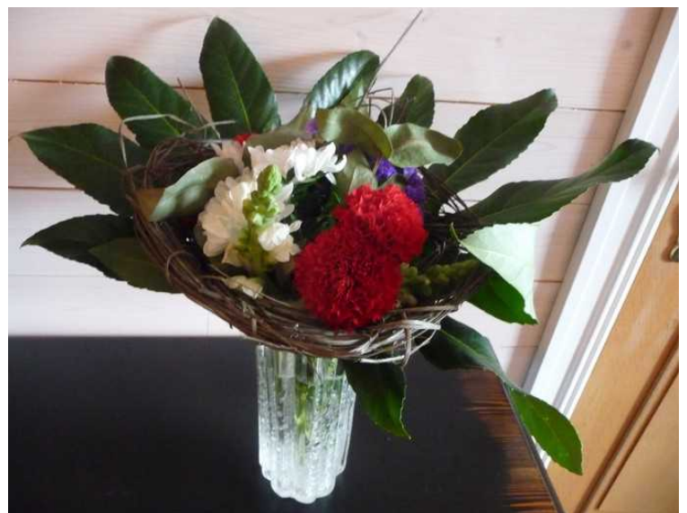
There were flowers from Silja and Erik.