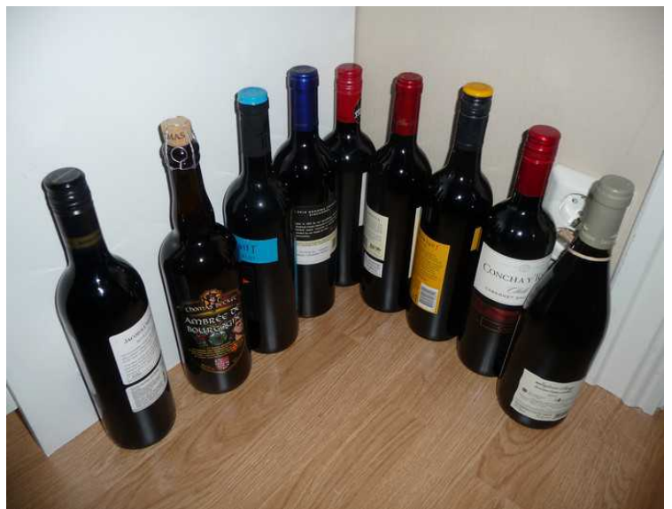
Vine from my kids.