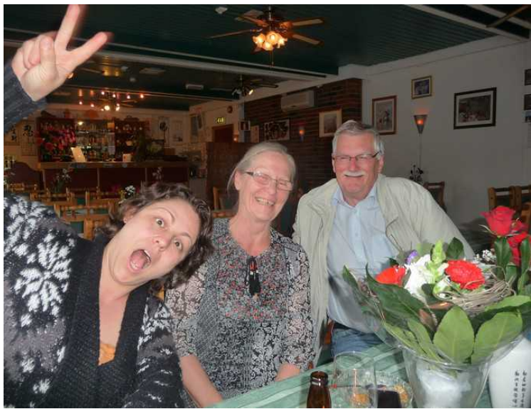
Now there is more show.