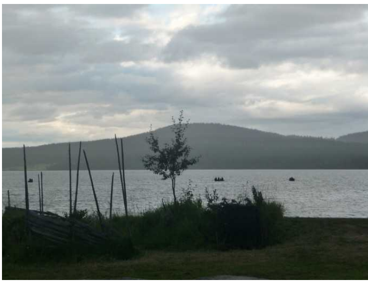
Here comes the boats on the lake Gålåvatnet.