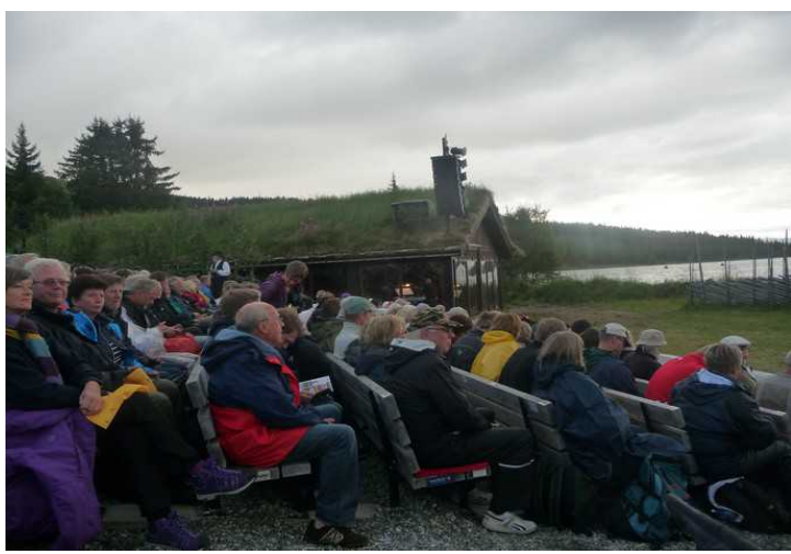
Here people are seated and ready for the show.