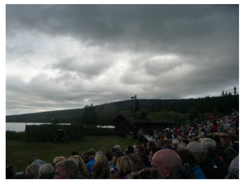
It was full on all the pews.