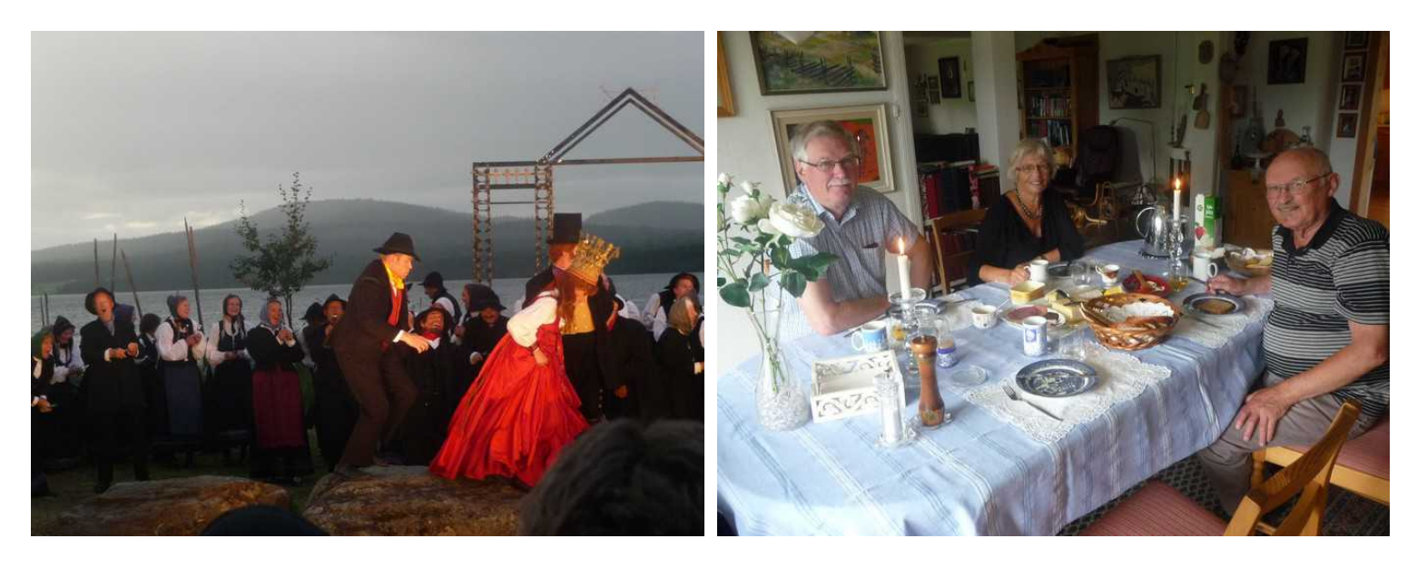
Here we have breakfast before we go back home.