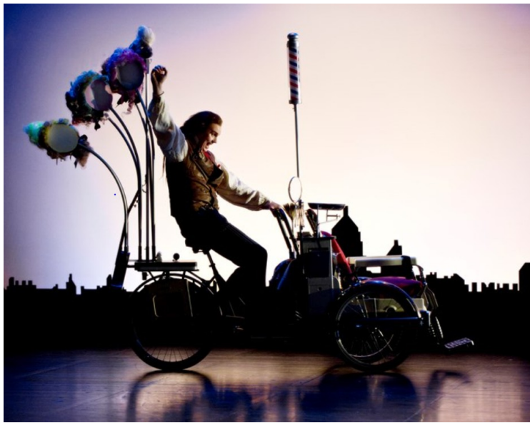
We had booked tickets at the show The Barber of Seville .

The barber of Seville is a comic opera in two acts with music by Gioacchino Antonio Rossini , composed in 1816. Libretto is by Cesare Sterbini and based on a comedy of Pierre Beaumarchais ' original text. The act takes place in the Spanish city of Seville in the mid-18th century by the Count Almaviva's household.