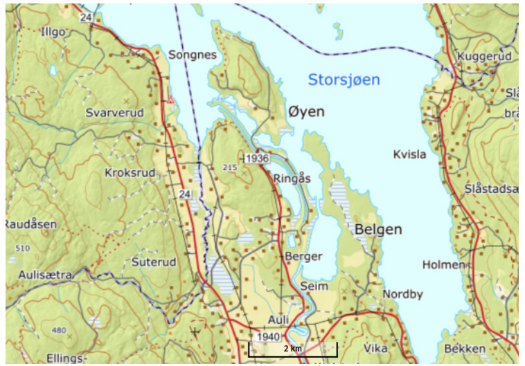
A map of the area where the nature reserve is located.