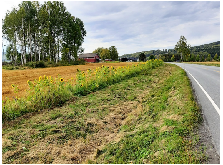
On the way further towards Mo we saw that sunflowers had been planted on both sides along the road.