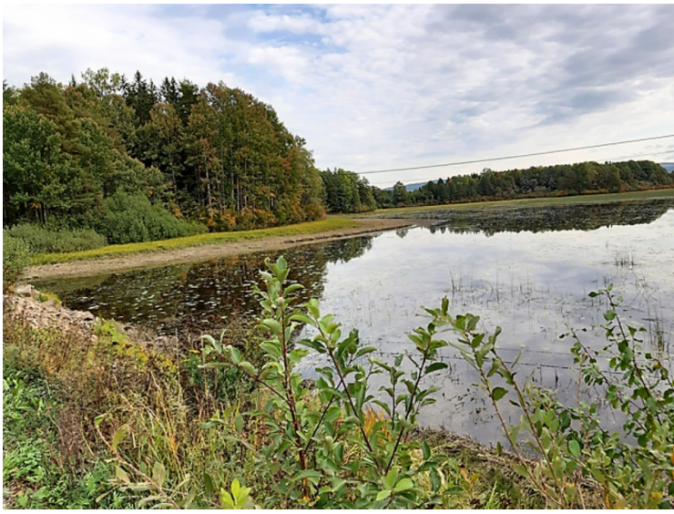
This is Sør-Nora.