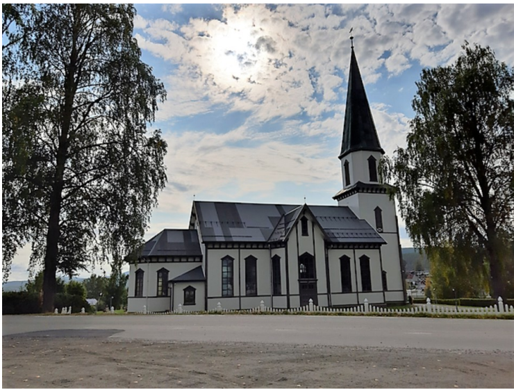
We drove through Sand which is a municipal center. This is Sand kirke .