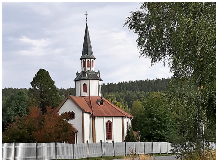
The last picture we took was of Mo church .