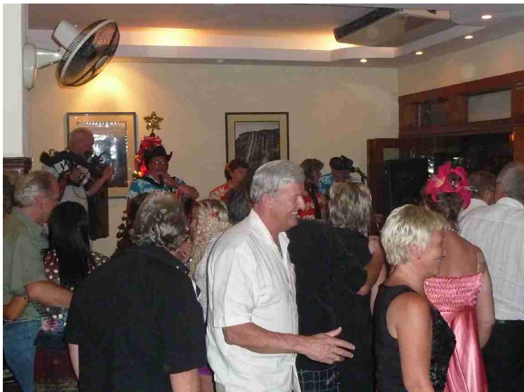
Here the dance is over.