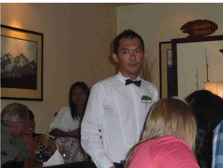
The waiter who attended our table. Very skilful!