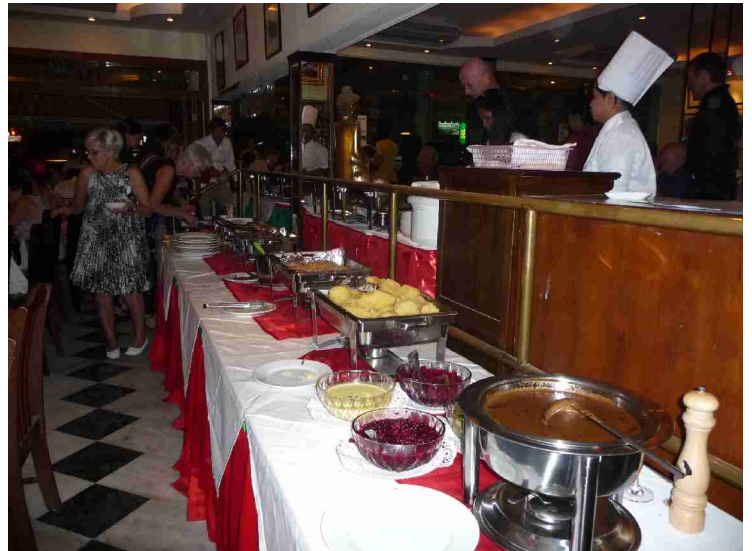
Lots of rib.