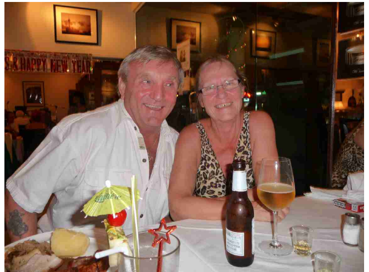
We got company at the table after a while.