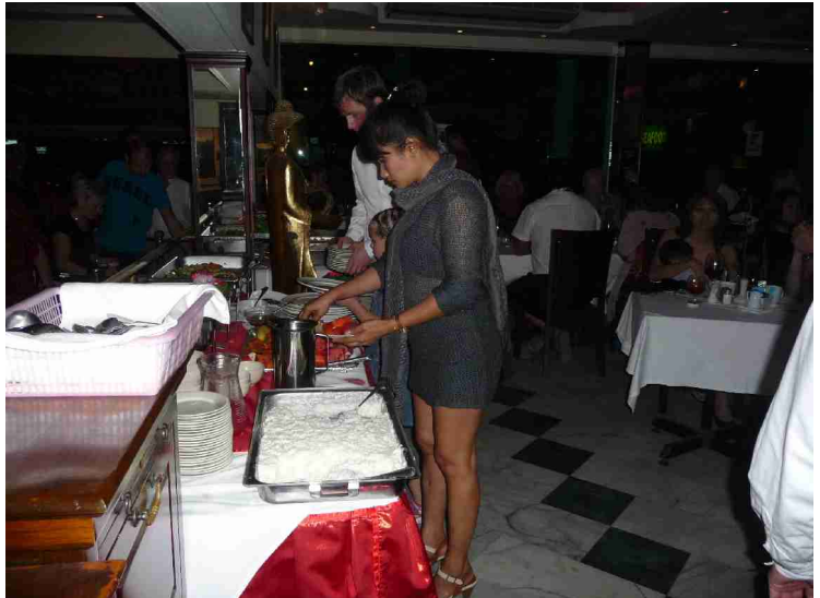
Then there was dessert, rice creme with raspberry sauce and fruit.