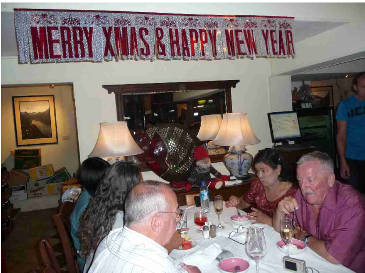
People enjoy themselves.