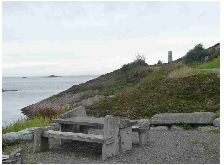
There was a stone monument on a little hill near the car park.