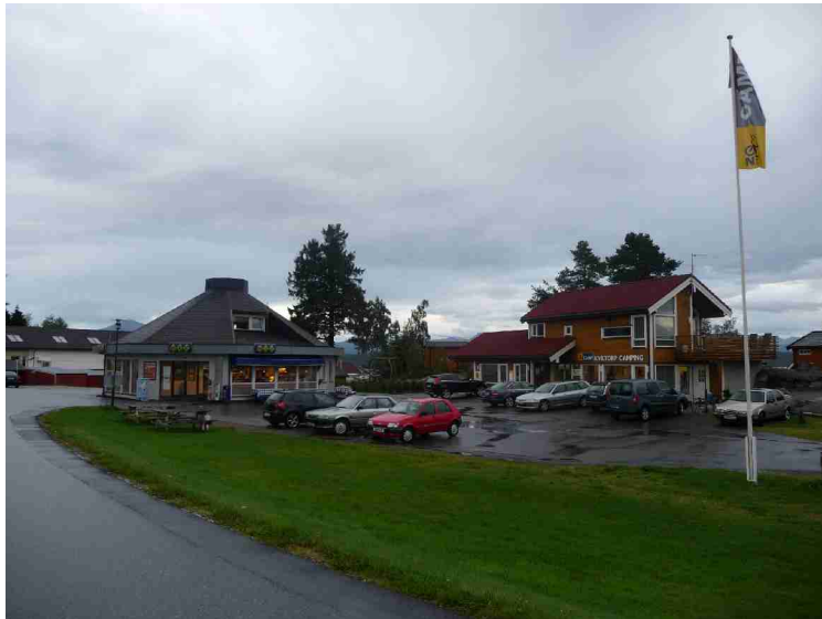
While in Bud, it started to rain quite much, so we went directly to Molde to find a camping site.