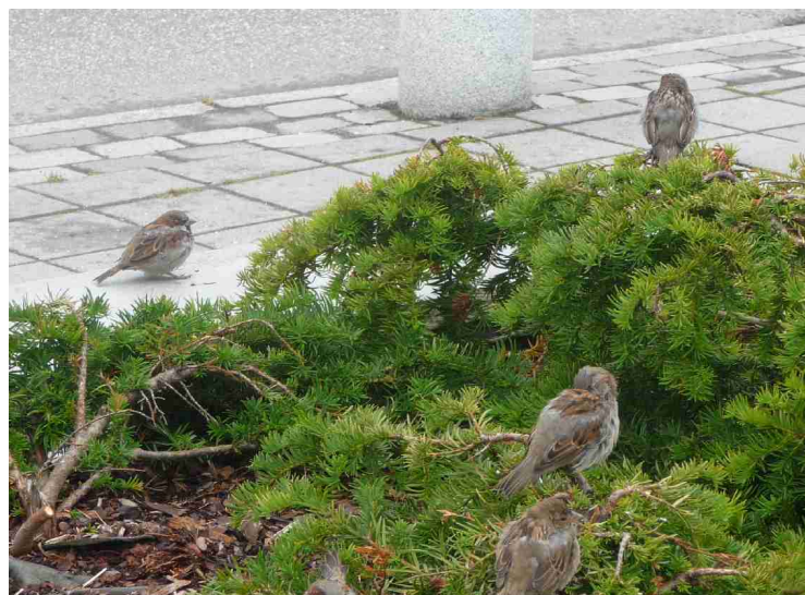
Sparrows at the quayside.