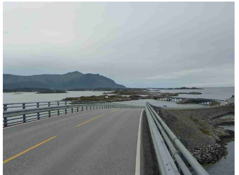
Going over Storseisundet bridge.