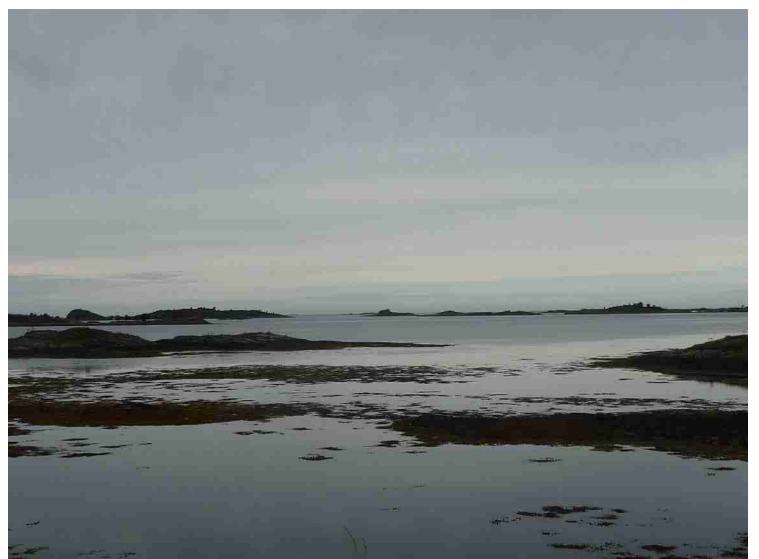
Nice coastal landscape.