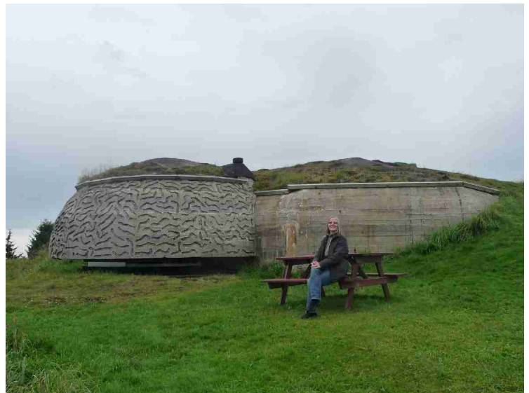
One of the bunkers.