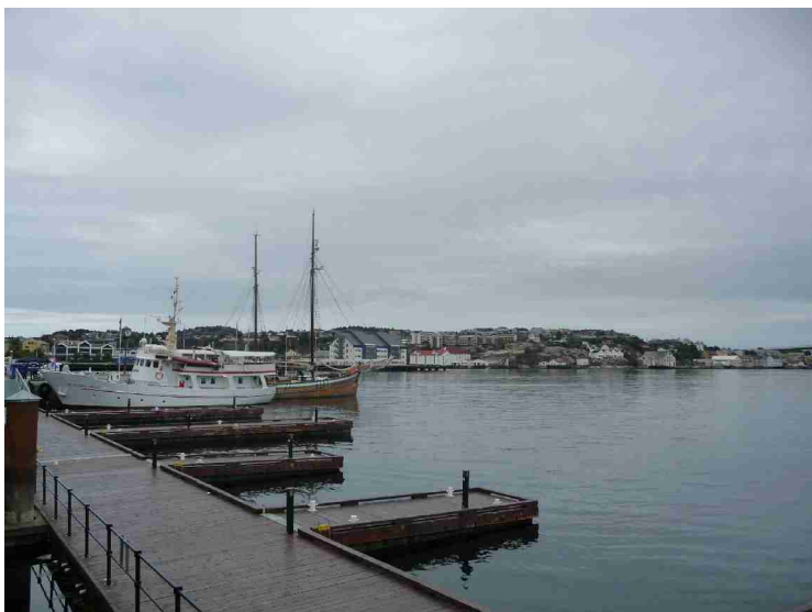
At Sørsundet with a view over to the island Nordlandet .