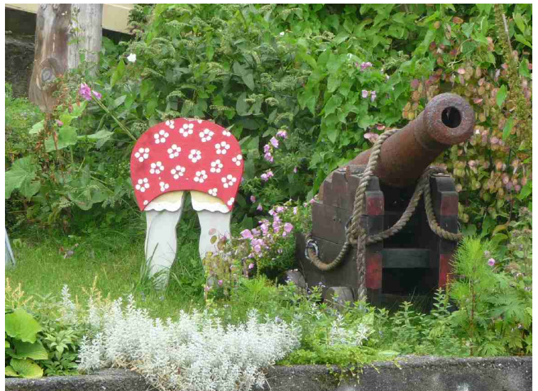
A figure in a garden.