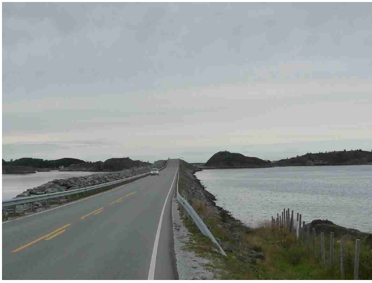
Here we are arriving at Atlantic Ocean Road . Link to Visitkristiansund .