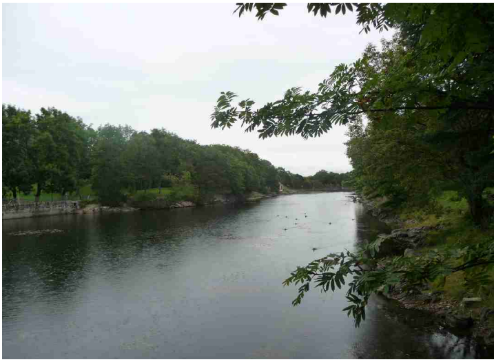
Up in the hill above the town lies a couple of dams that earlier were used for fresh water supply. Vanndamman seen towards east.