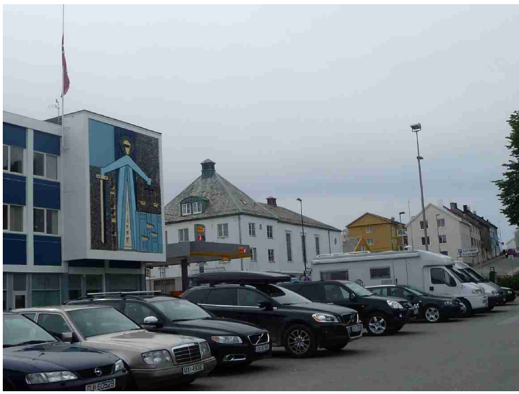
Here the camping car is standing, waiting for us.