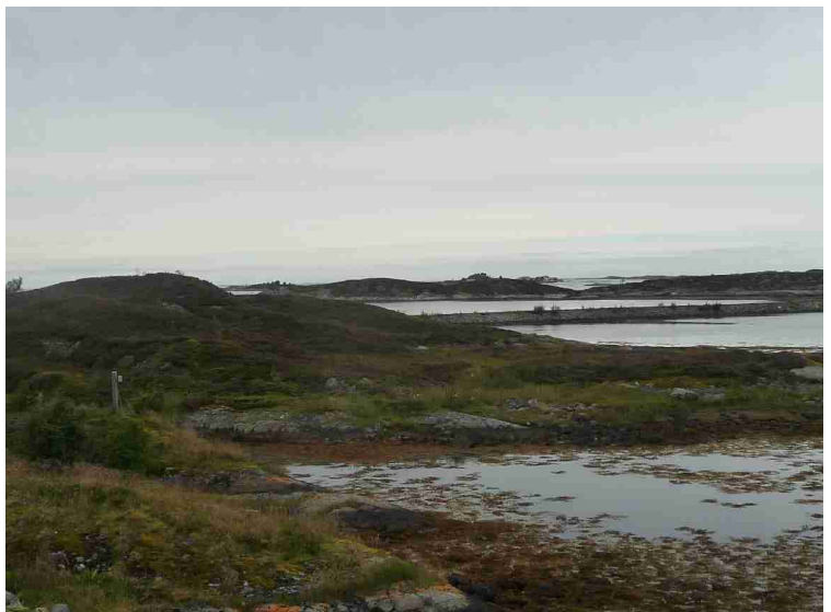
On the other side we came out in daylight again at Averøy .