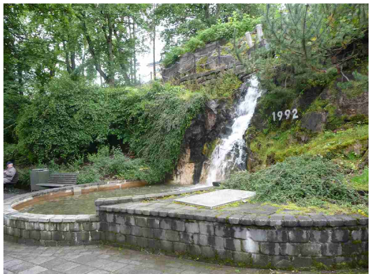
Back in the middle of the town and the town waterfall with a small bridge at the top.