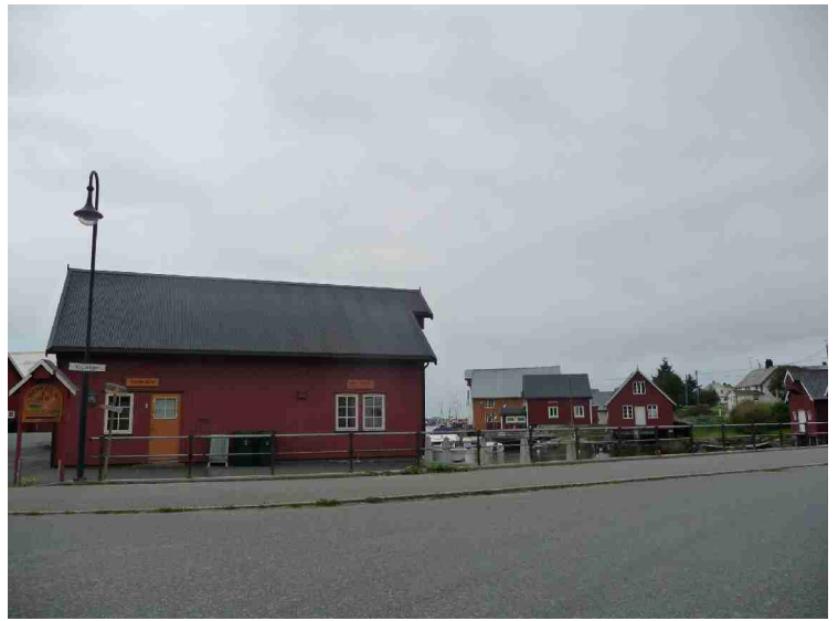
This is Bud . We made a little stop there.