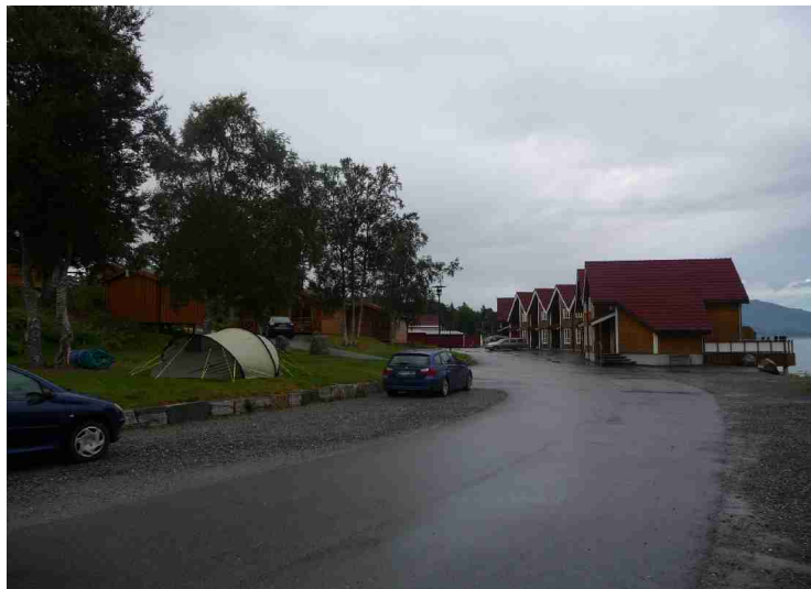
At the camping site.