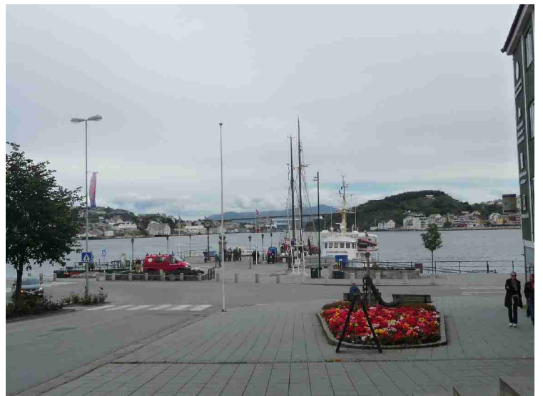
A view of the quay aresa.