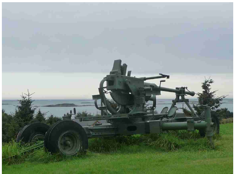
We walked up to a little hill where Ergan fort lies. Today it is a museum and here are a couple of weapons, which are not needed any more.