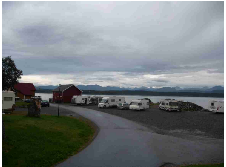
We moved in at Kviltorp Camping , which lies in the outskirts of Molde.