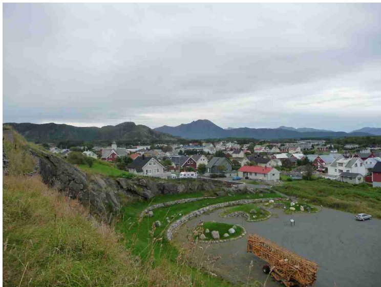
Looking down on a collection of various kinds of stone.