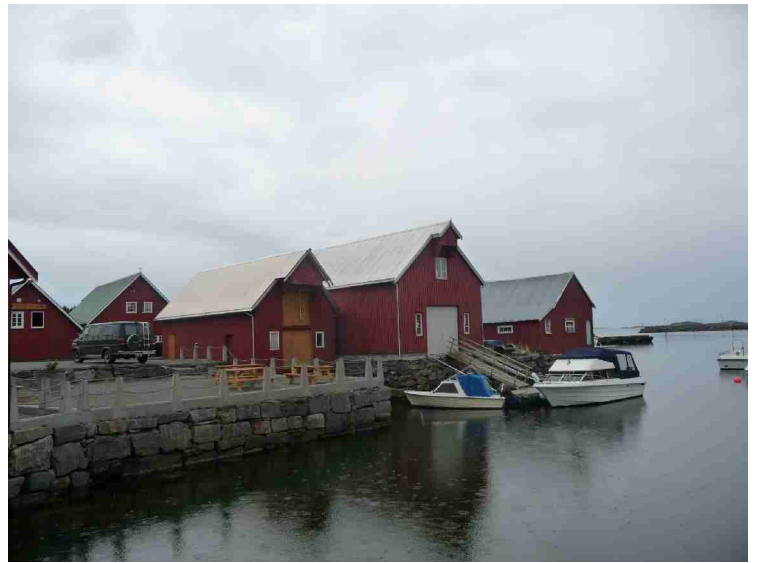
Boat houses in Bud.