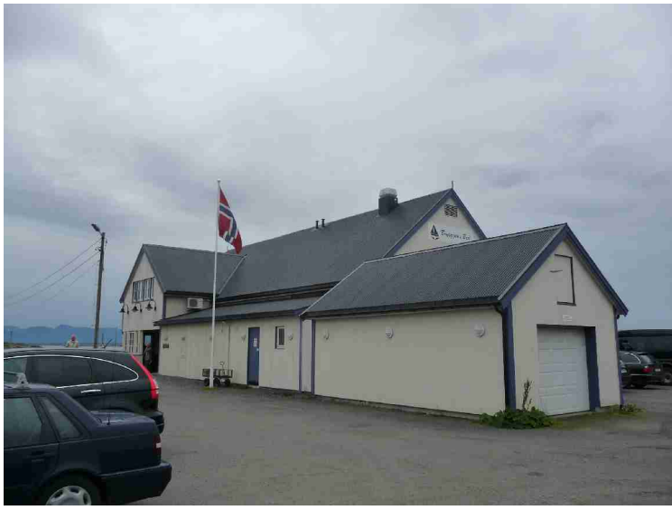
After having visited Ergan fort, we walked down again and had a Sunday buffet at the restaurant which is called “Bryggjen på Bud”. Good food.