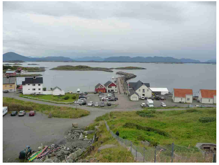
The view from fort.