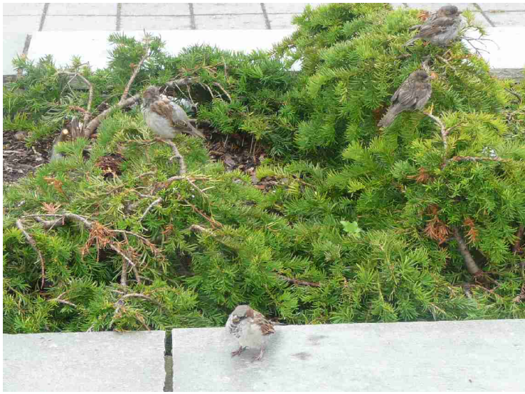
The sparrows like the shrub.