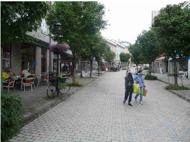
The pedestrian street.