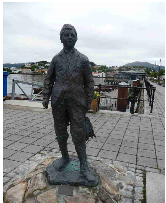
The herring boy.

These statues is standing on Kirkelandet where the sound boats lay to.