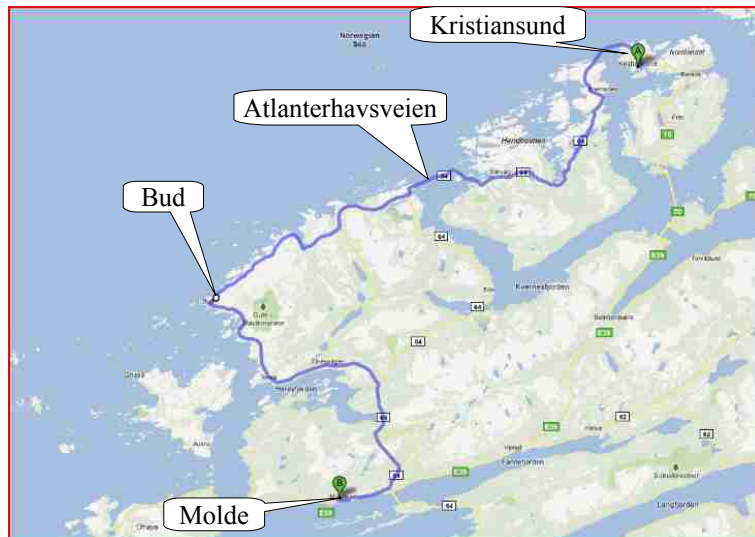
This is the route, which we used this day.