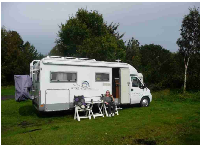
When we came to Kristiansund on Friday the 19 th of August, we took in at Atlanten Turistsenter in the outskirts of the town.