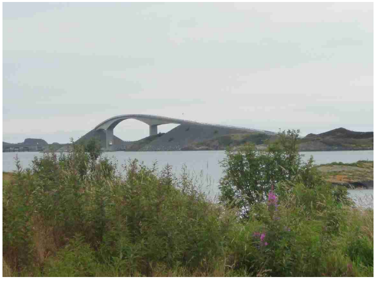
Storseisundet bridge is the biggest and best known of the bridges along the Atlantic Ocean Road.