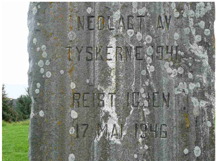
The Germans took it down in 1941 Erected again the 17 th of May 1946

There was a memorial stone up there. The text.