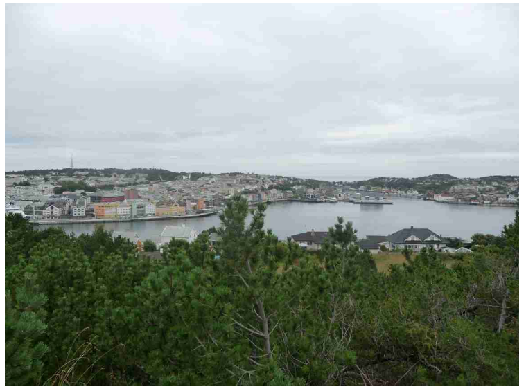
Nice view over Kirkelandet and Gomalandet.