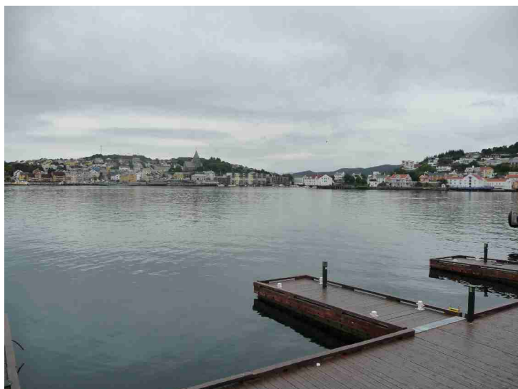
A view over to the islands Gomalandet and Nordlandet .