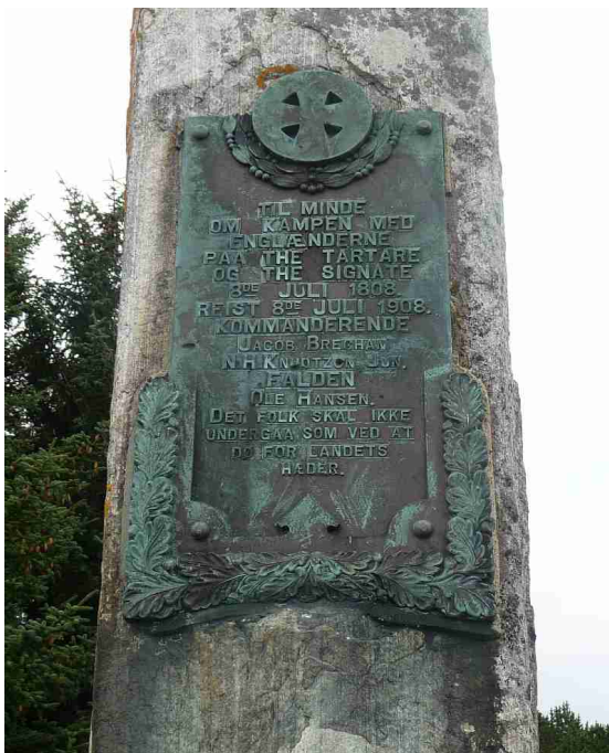
At last the text on the memorial stone.