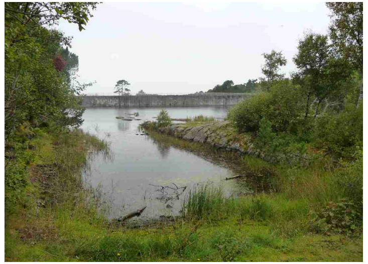
Vanndamman sett towards west.