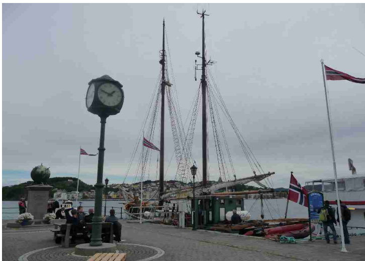
The next day, Suintay the 21 st we had planned to go to Grip with Gripexpressen . The trip was going to last 3 hours. It turned out that this boat didn't go this day. It was this old sail ship lying here. We had to sand outside during the trip back and forth. It was cold that day and rain, so we didn't go.