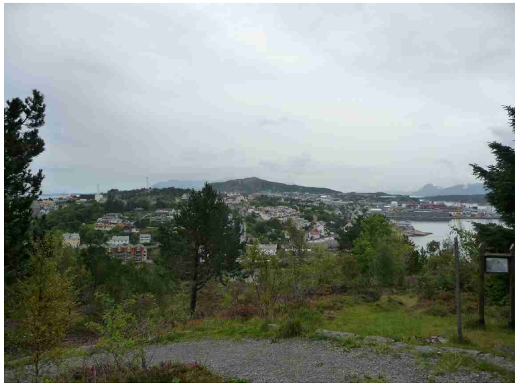
A view towards Kirkelandet.