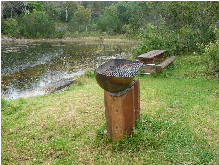
Here are barbque grill and benches to sit on.