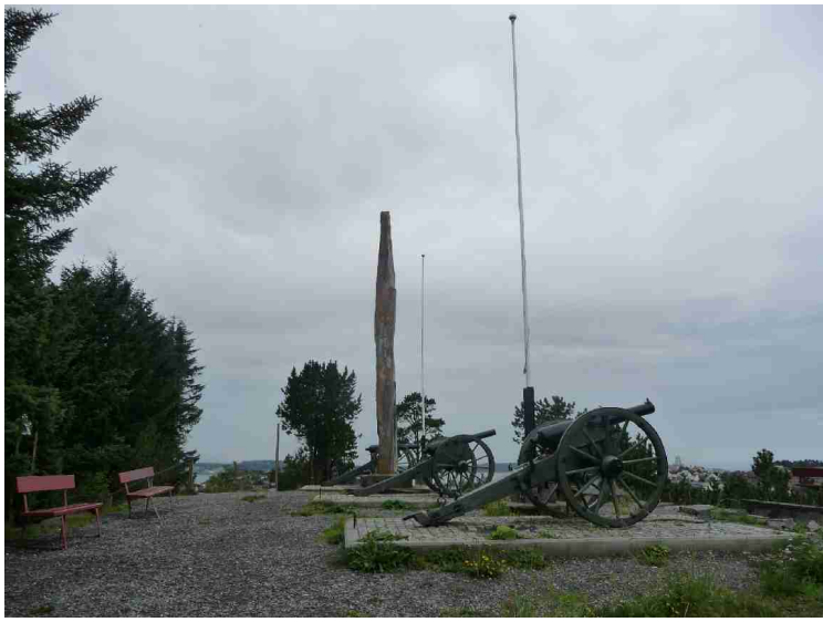
Up at the memorial stone on Innlandet. We went with the car over Sørsund bridge and parked just below the stone.