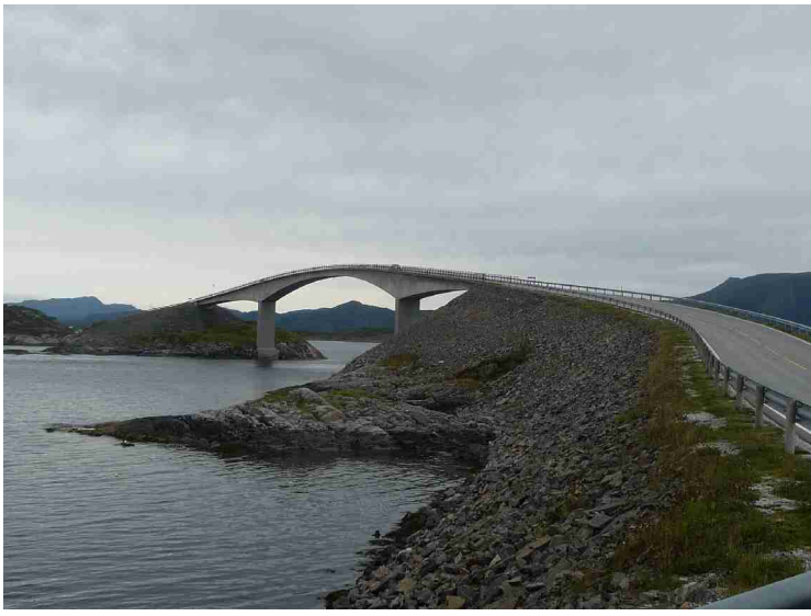
The bridge seen from the other side.