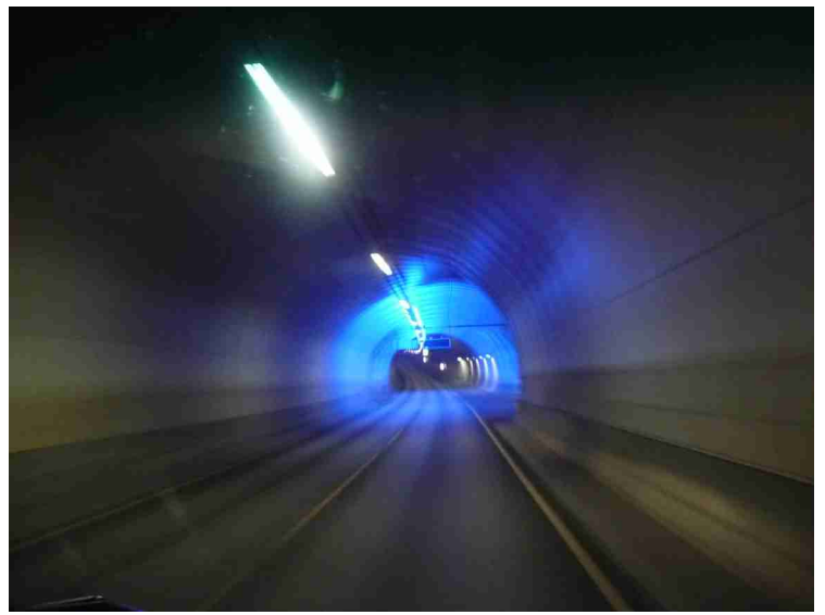
We moved therefore on through Atlantehavstunnelen .