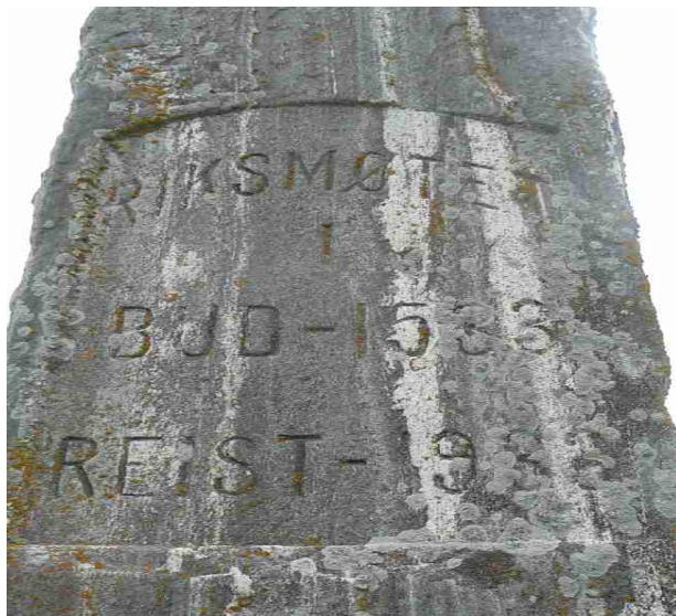
The privy council in Bud 1533 Erected 1933