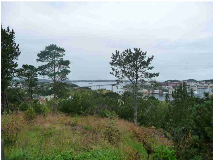
A view towards Sørsund bridge.