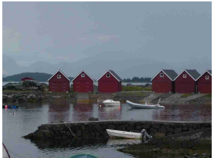
The camping site lies down to the fjord. The surroundings looks like this. Quite idyllic.