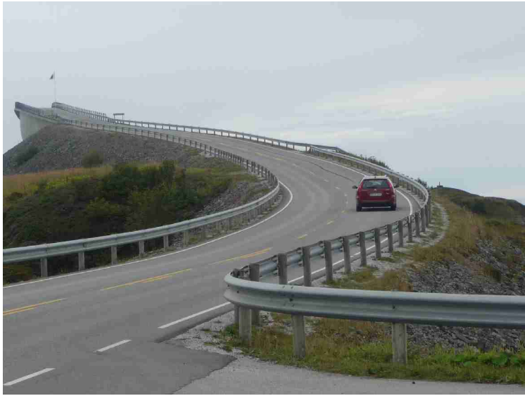
We stopped at a car park to take a picture before we went over the bridge.