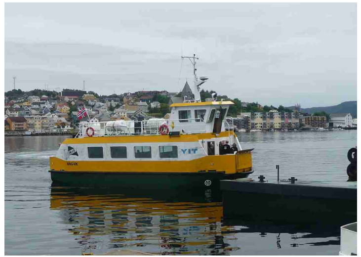
The sound boat goes between the four parts of Kristiansund.