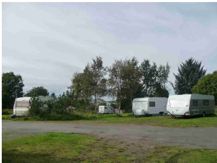
A picture from the site.