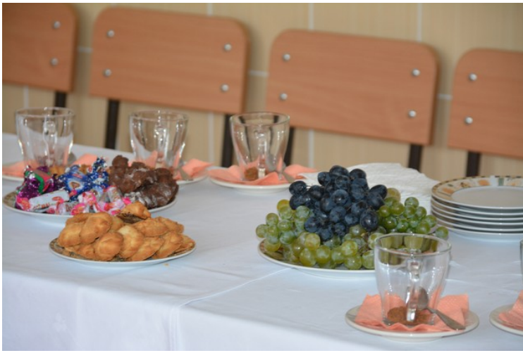
Very good grapes.