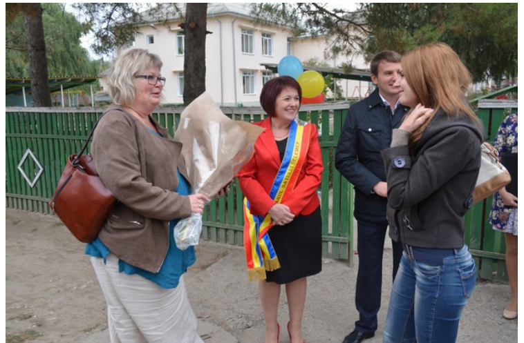
The interpreter to the right.