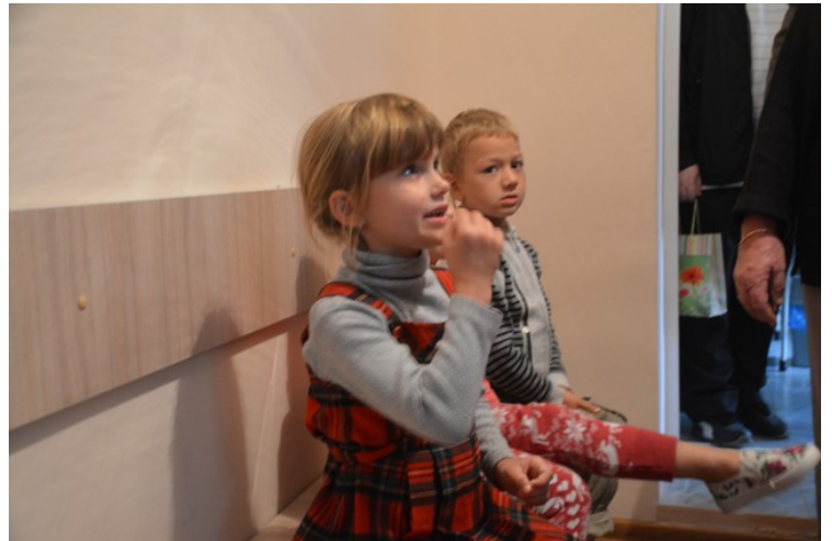
These are waiting their turn.