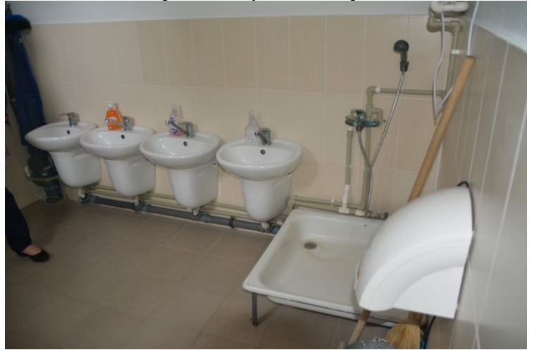
Nice washing room.