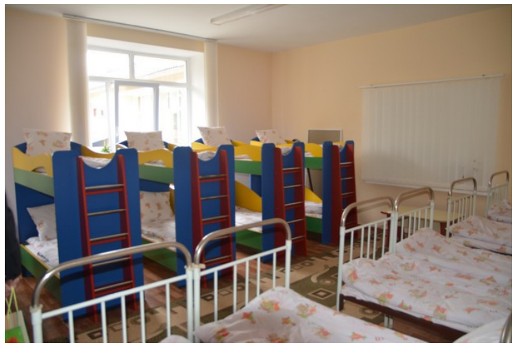
Here they can sleep when they are tired.