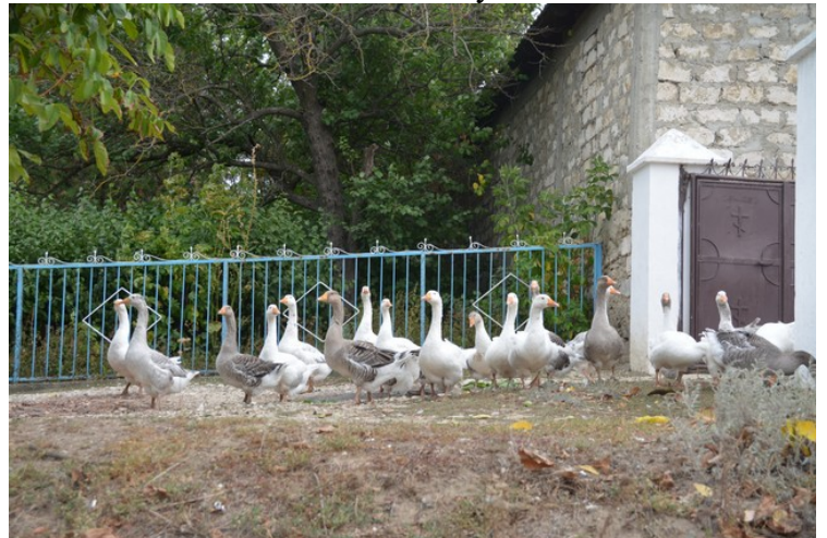
The geese are going freely.