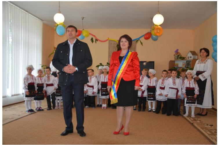
Then there are speeches.