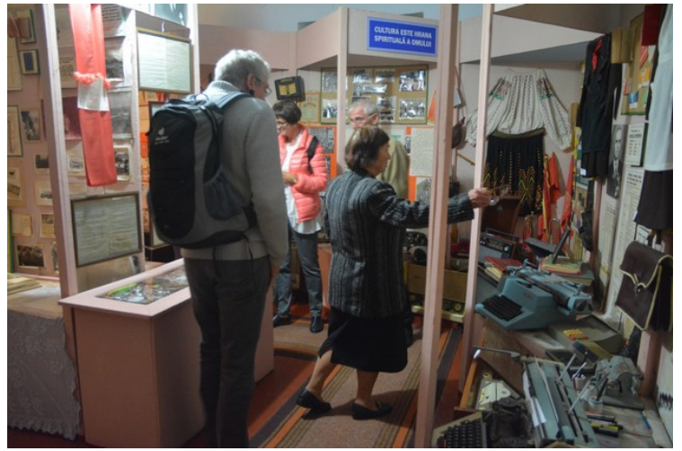
Here we are in the museum.