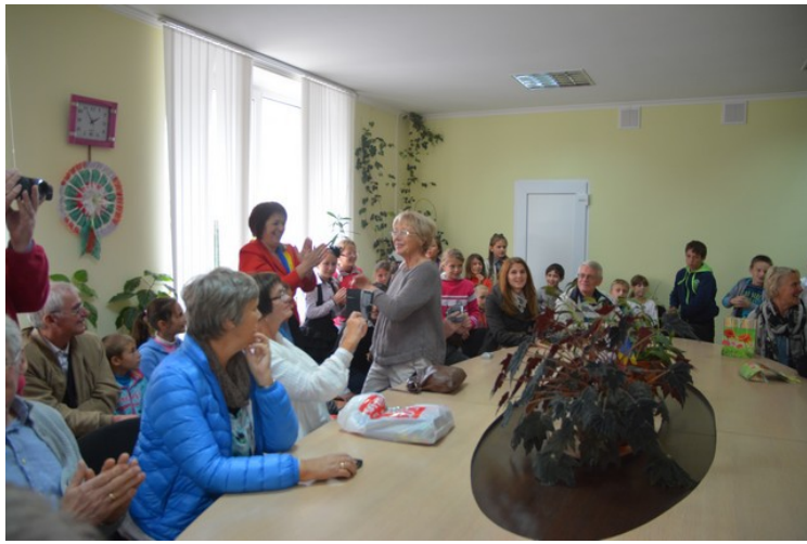
Then speeches again.