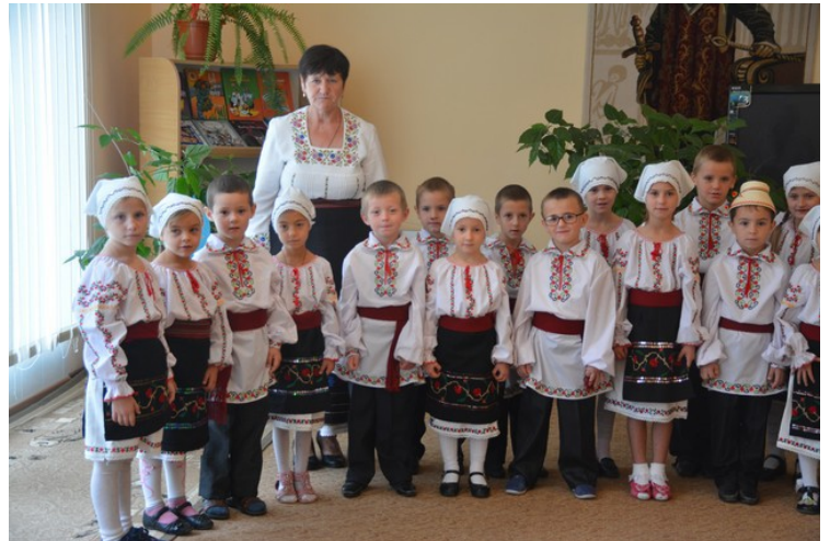
Now we will hear some singing.