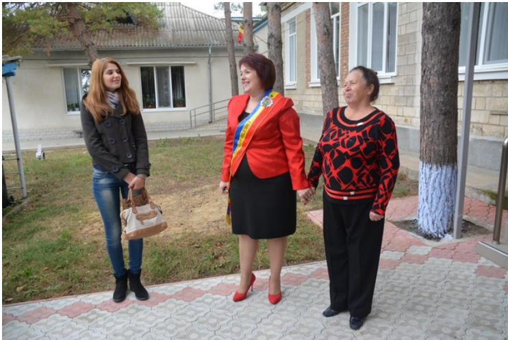
The kindergarten leader to the right.