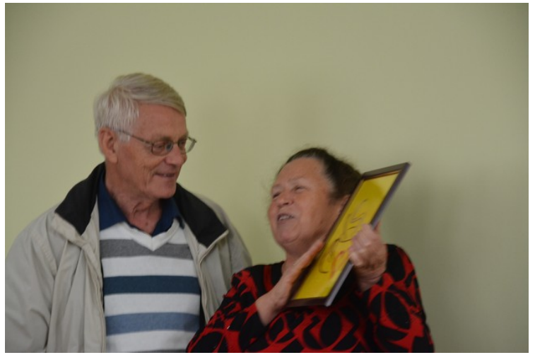
Everyone gets an image that the kids have made.