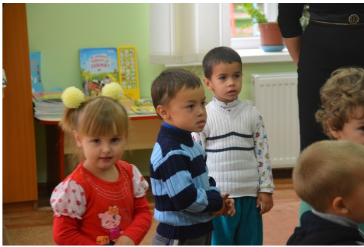
These are the smallest.