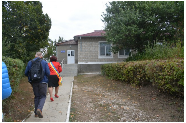
On our way up to the house.