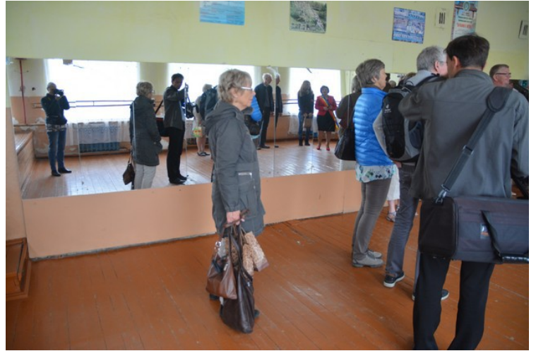
There is still something that is worn.