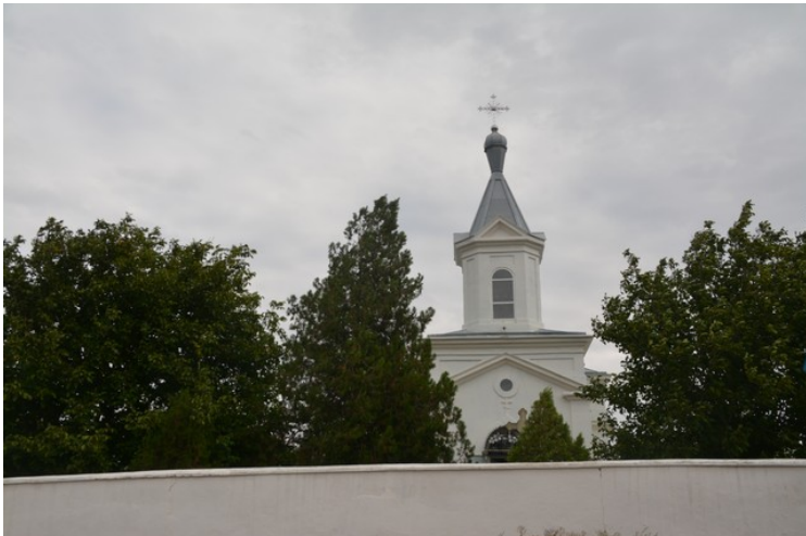
The church in Selemet.