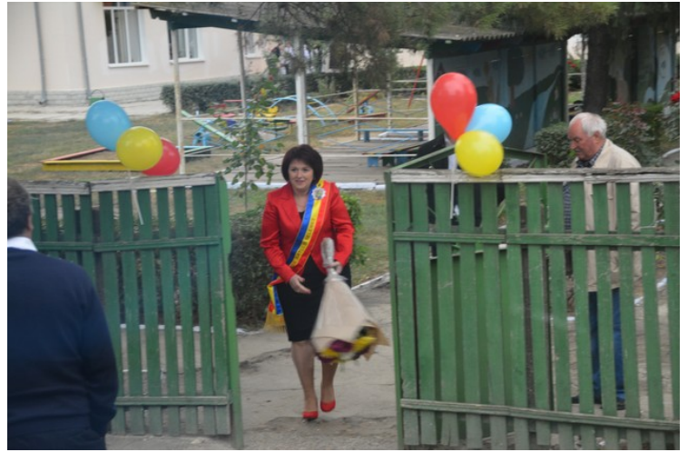
The Mayor of Selemet comes.