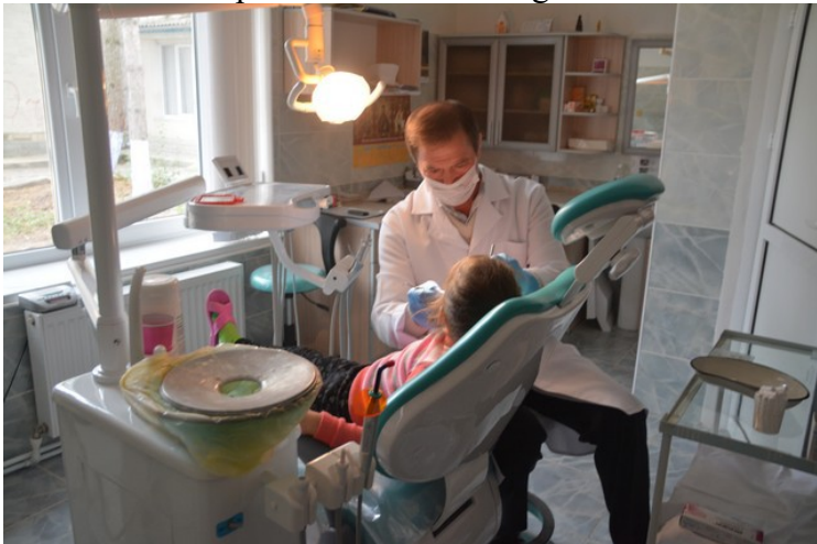
The dental office.