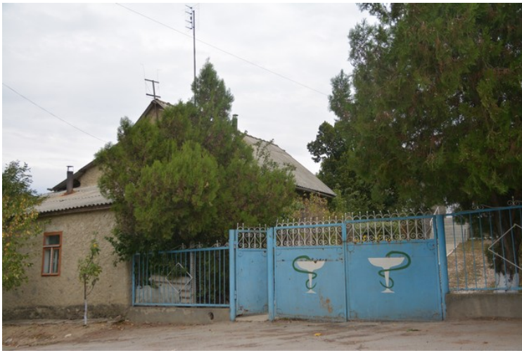
Then we will have a look at the medical center.