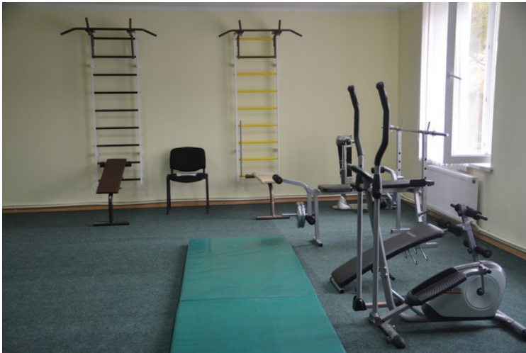
We peeks into the training room.