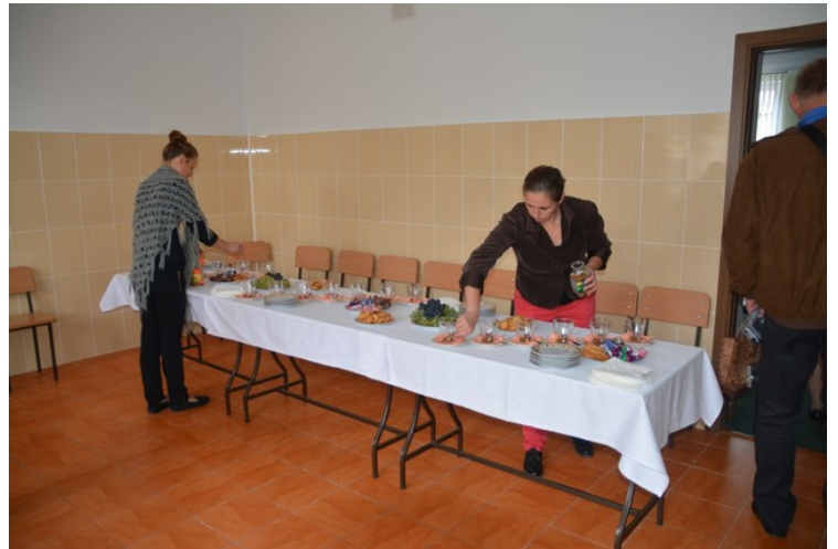
Then we will get some coffee, cakes and chocolates.