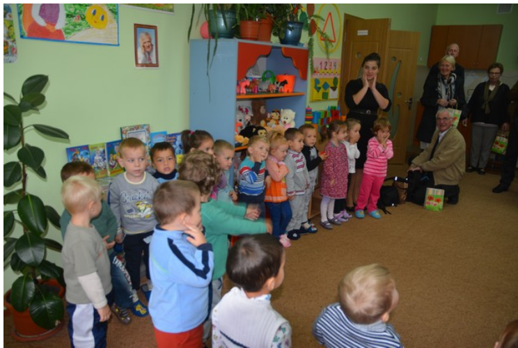
Acting of the smallest.