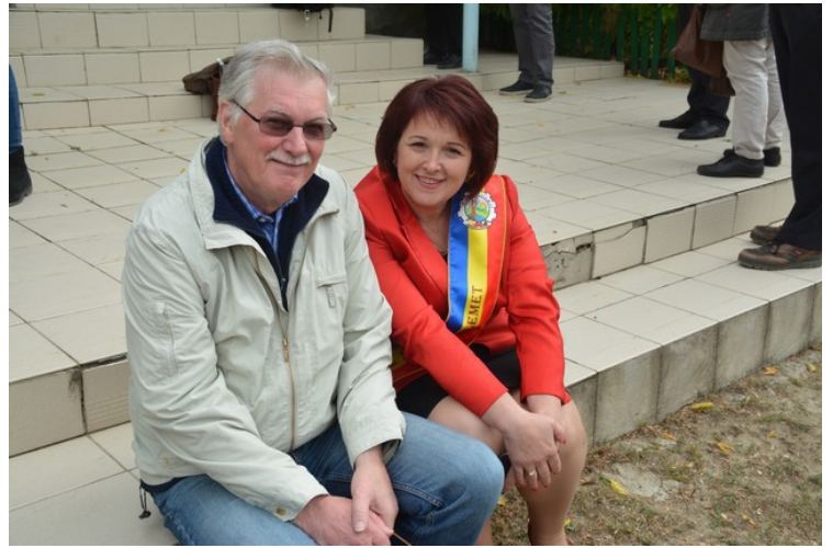
I and the Mayor.