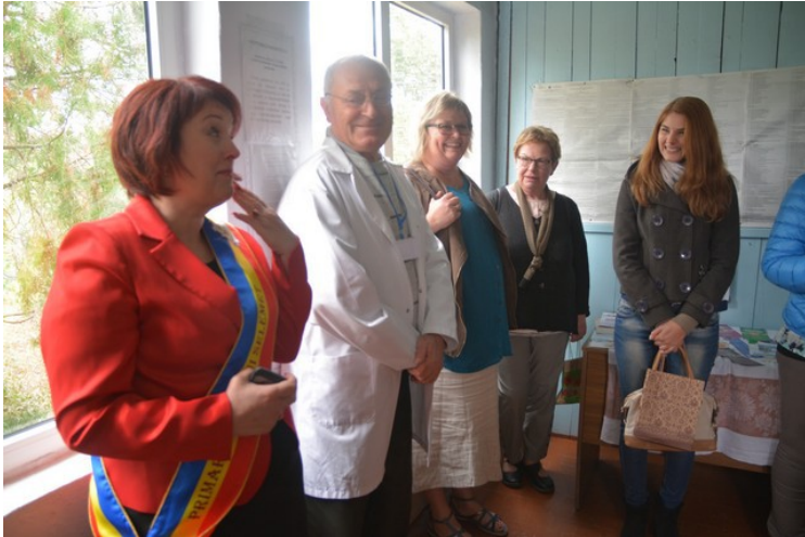
The doctor is retired, but he is still working, so the place should have a doctor.