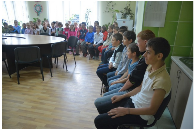
Then there will be entertainment by the greatest kids.