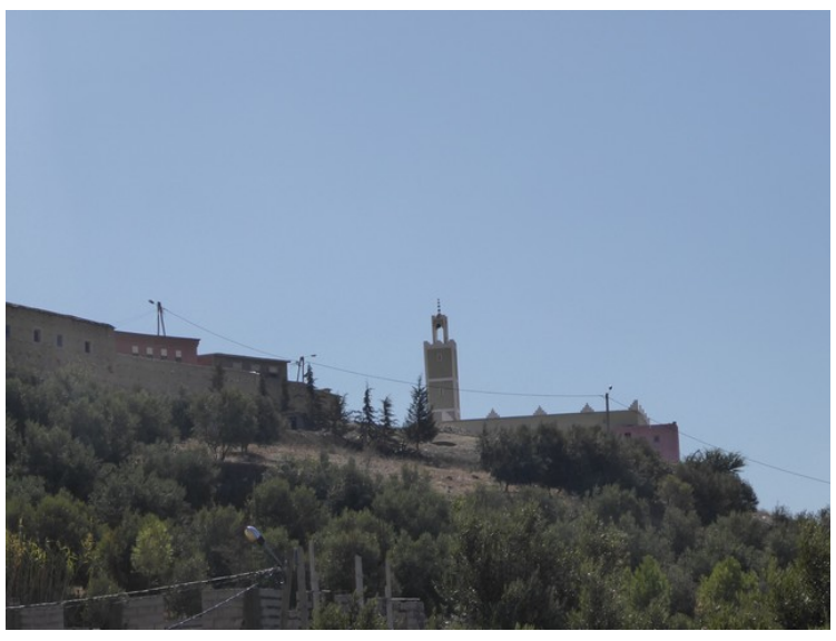
Those we visited are living on the outskirts of a small village, Tamarzirt. We looked up to the mosque, opposite the neighboring village, Aguergour.