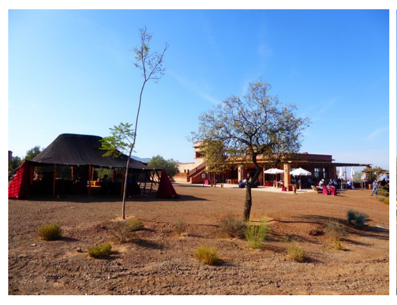
The Bedouin Tent on the left and the main building to the right.