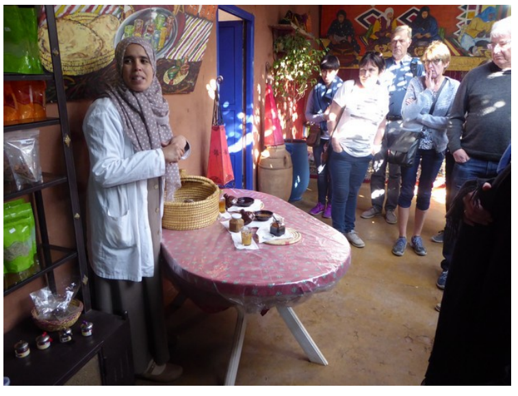
Here she spoke about the products.