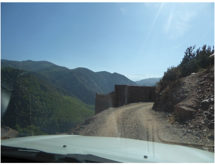
To get down to the main road, we had to go down the cliff.