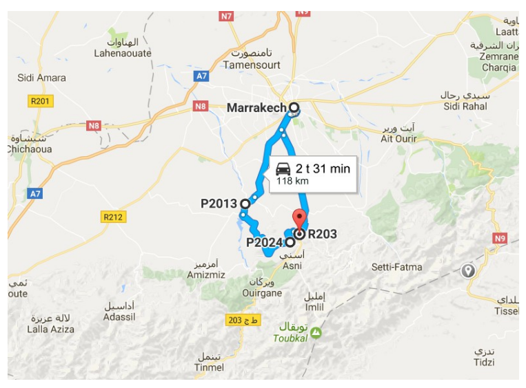
The last full day, we were on a tour in the <u>Atlas</u> mountains. We drove in three jeeps.