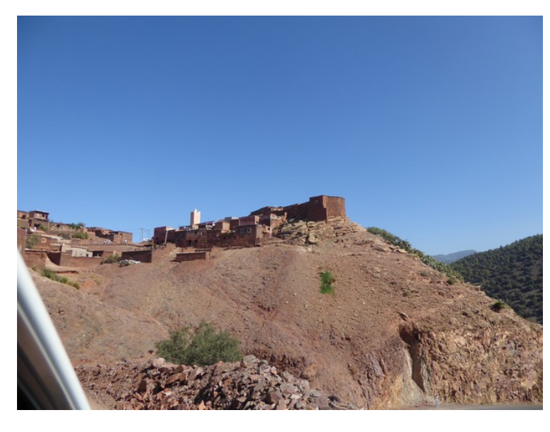
Here we look back to the village.