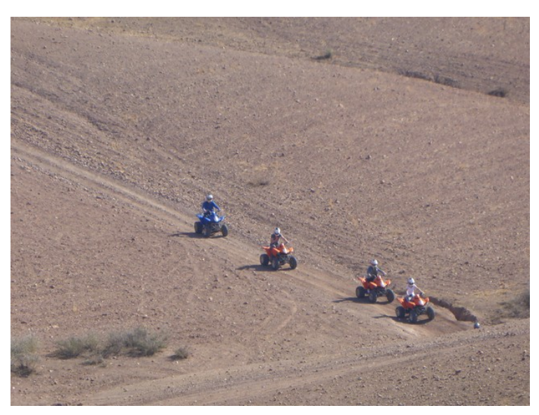
While we stood there, there came a series of ATVs down a slope.