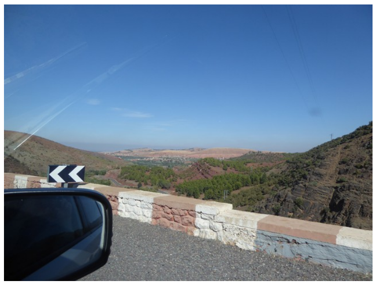
Then we were on the main road again.