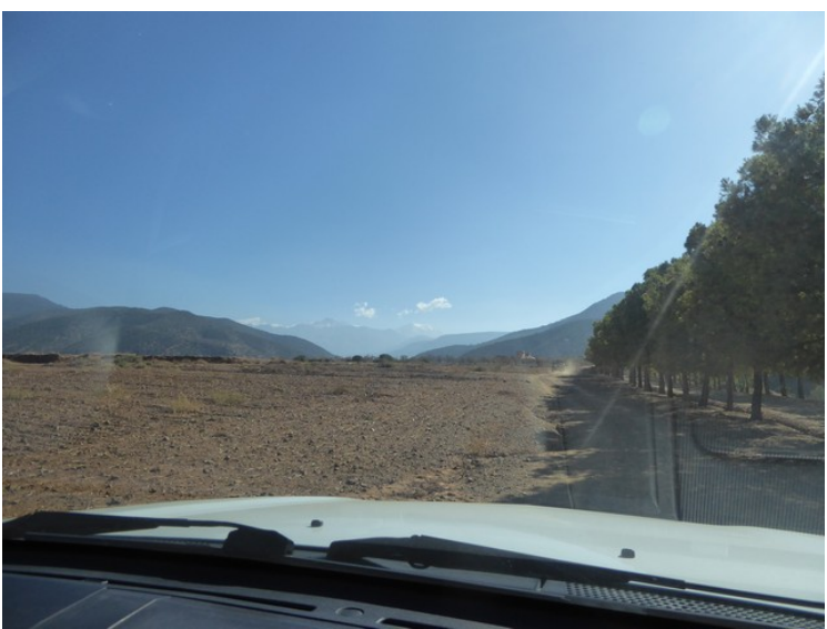
We drove just a little bit before we took a detour to where we were going to eat lunch.