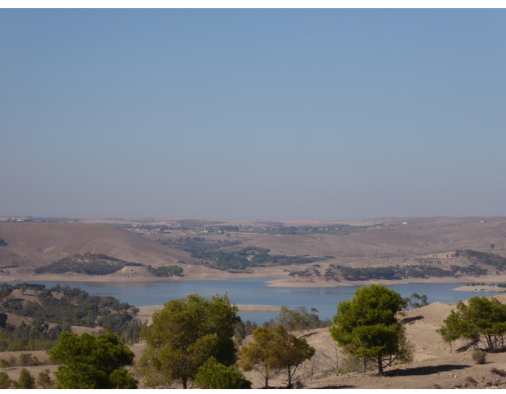
By zooming a little, we see the sea. It was built by the French in the 1920s to provide water and electricity to the area.