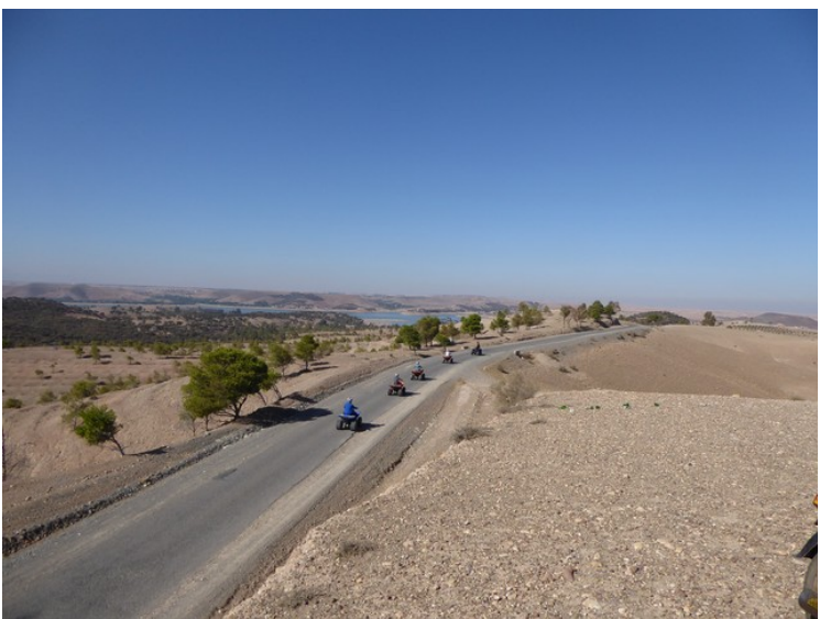
They drove right past us.