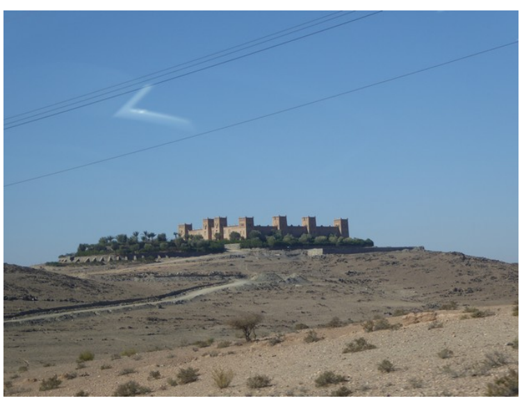
This is a major new hotel south of the city.