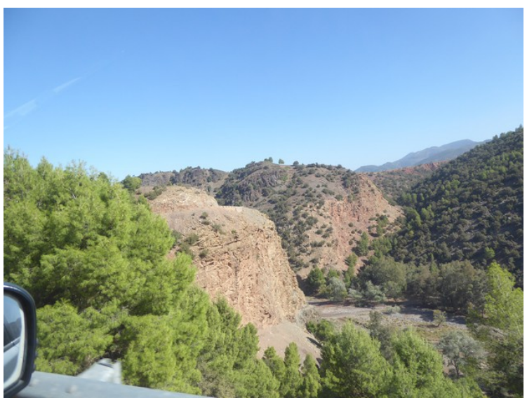
The main road is down here.