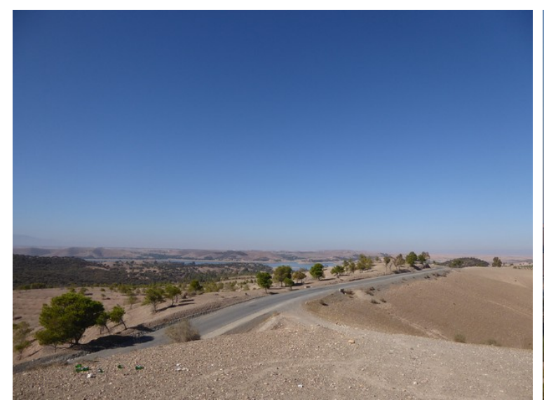
We made a stop near <u>Lalla Takerkoust</u>. We see the artificial lake in the background.