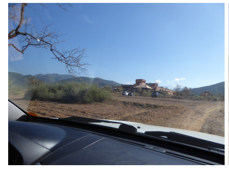
Here we see the restaurant.