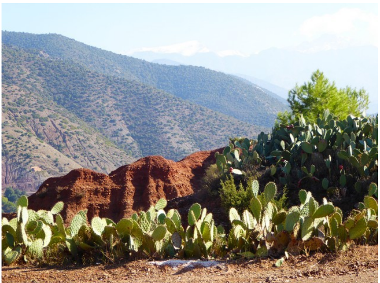
A valley down here.