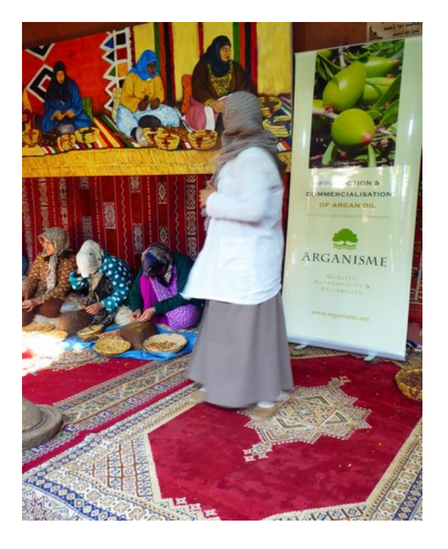
She told about the production of oil.