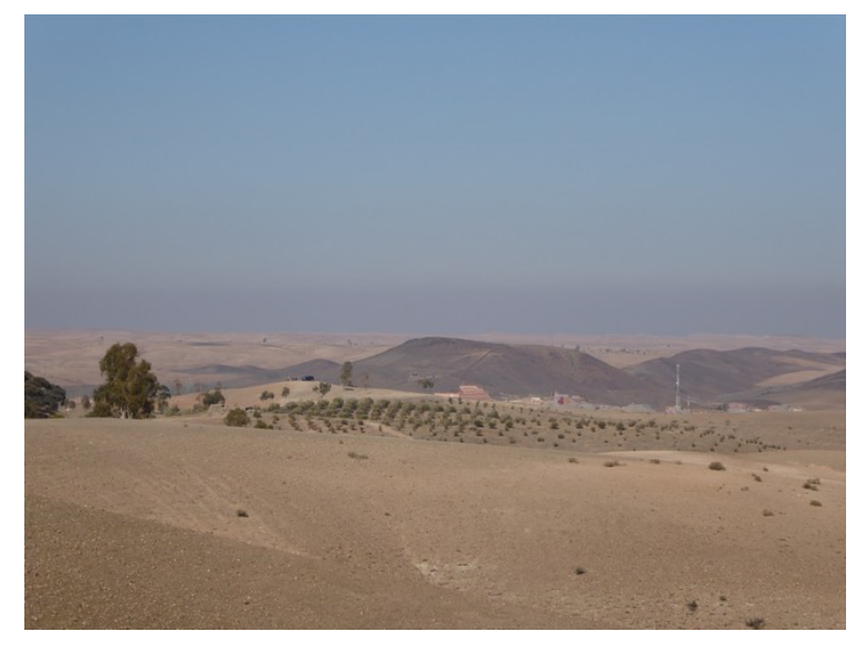
View in the other direction.