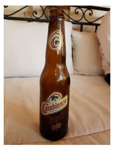
The next day The journey back home was in the afternoon, so there was time for a beer on the roof terrace of the hotel.