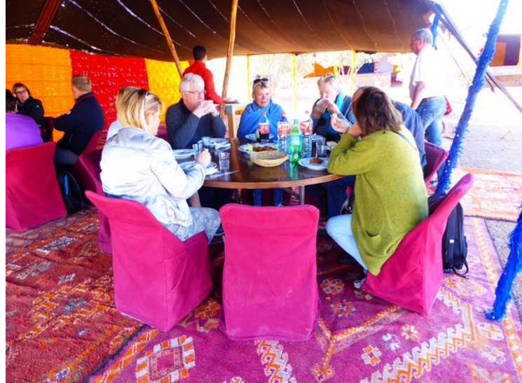
There was covered two round tables for us.