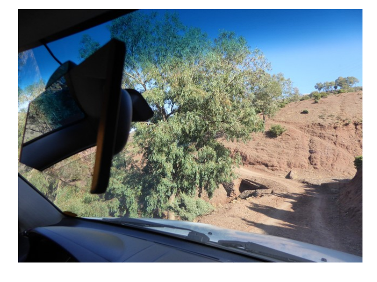
Then we drove on. We were going to a greater main road to get back to Marrakesh. Here we have taken off from the paved road to take a shortcut.