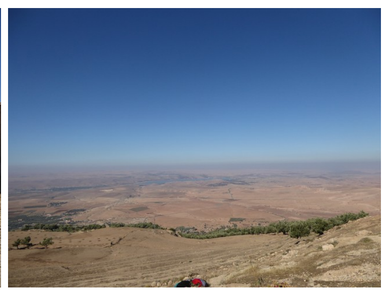
There was a good view from here onward the plains below.