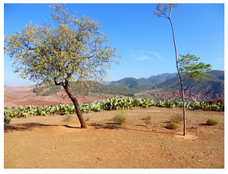
Here we look the other way. There were cactus plants along the entire edge.