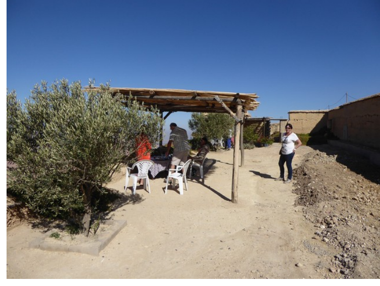
Next stop was at a family a little higher up. Here we were going to have tea and cakes.