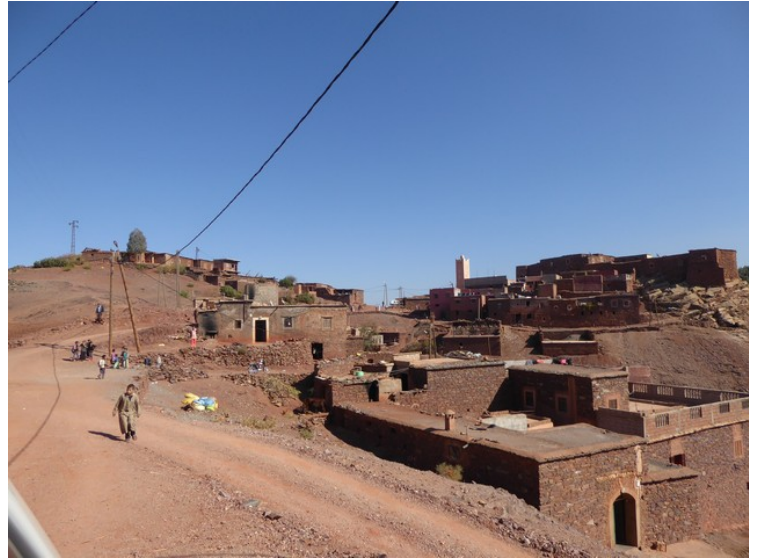
This is right before we get down to the main road.