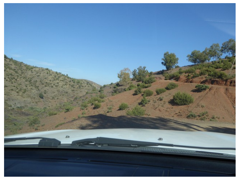
The road was narrow, winding and steep