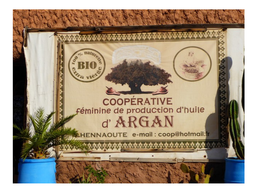
TAKARKOURTE TAKARKOURTE PARAMENTI, illes and venement à la vie. à la diputait et à painantsi, illes and venement à la vie. à la diputait et à l'aniportain par le l'empagnie. Et à l'emmer and disonne responsables de justicement et la maginitaite de luis d'avaps april une jenneties aux techniques d'extractions, de conditionnement, de position, d'ampaissant et de commentainante. These animales internations d'et commentainantes. These animales internations d'approache à unes differenties. These animales internations d'extraction entre unes dispandies. These animales aname d'applicationation diagonale dans le endre de la completation. COOPERATIVE FEMININE AFRA HULLE D'ARGAIN COOPERATIVE FEMININE AFRA HULLE D'ARGAIN Produits de Torres.