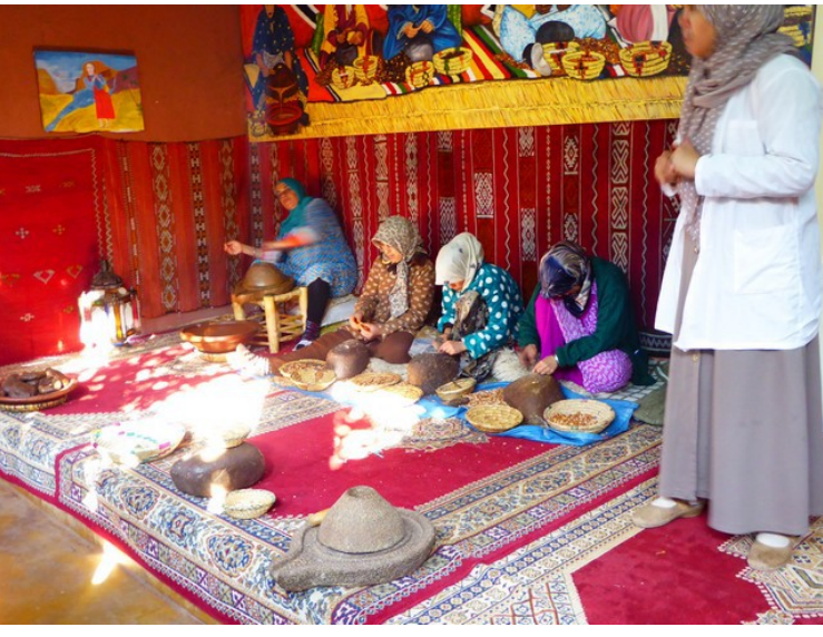
It seems to be painstaking work.