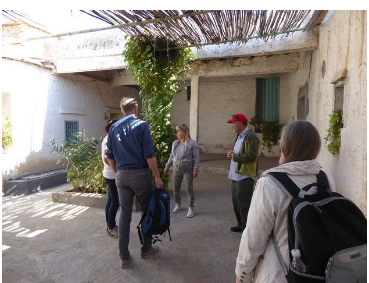
We also got to see the house that the family lives in. There were many family members, but it looked as though they had plenty of room. This is in the riad.