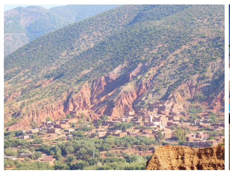
Here we look across the valley. The small village on the other side is called Outghal