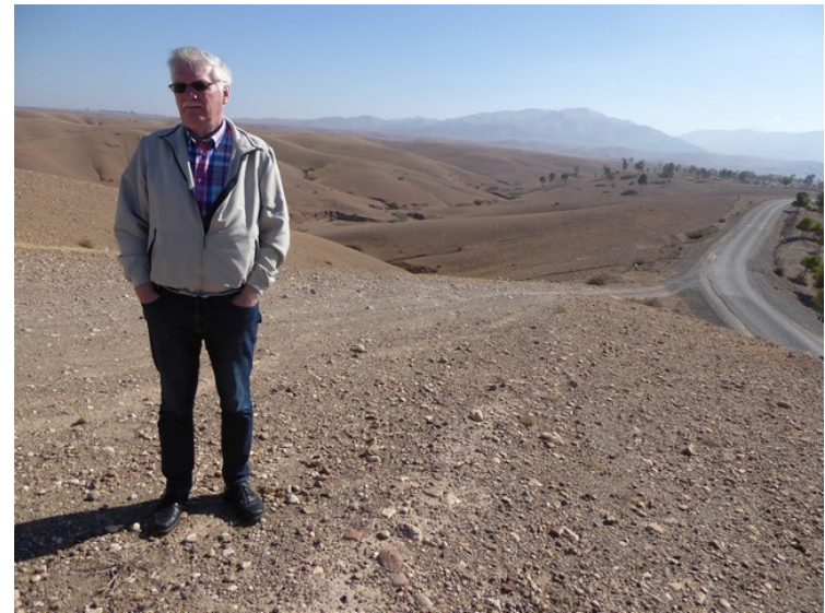
We see the snowy peaks of the Atlas Mountains. This snow came a week before we came to Marrakech.