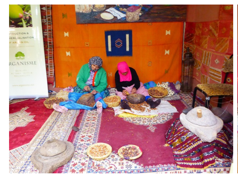
Here sits a lot of women and crushes nuts from the argan tree.