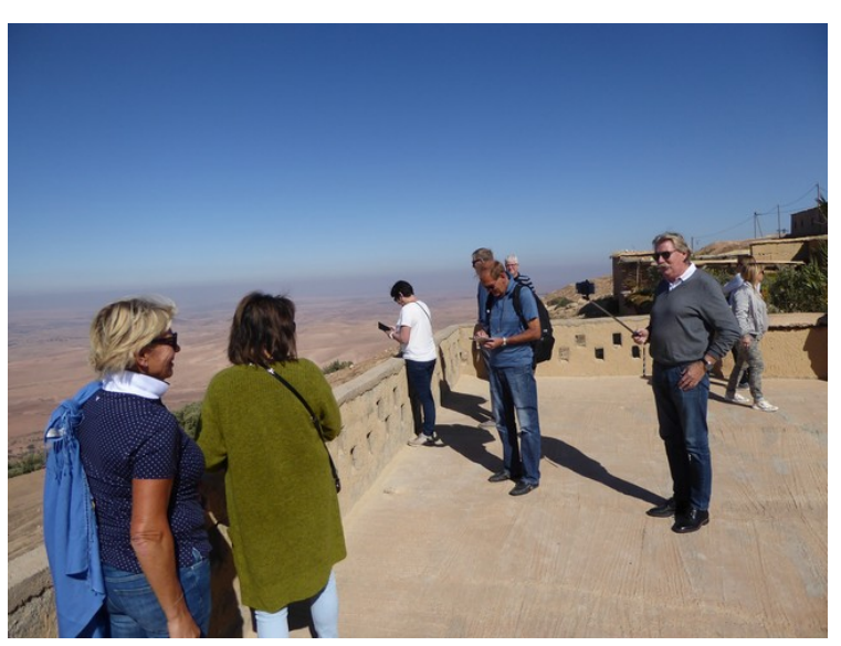
Many in the group took pictures here.