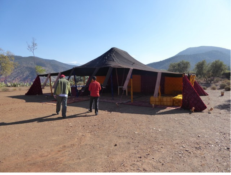
We walked through the main building and over to this Bedouin tent, where to eat.