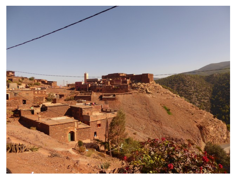
The village is situated on a cliff. It's called Tagom.