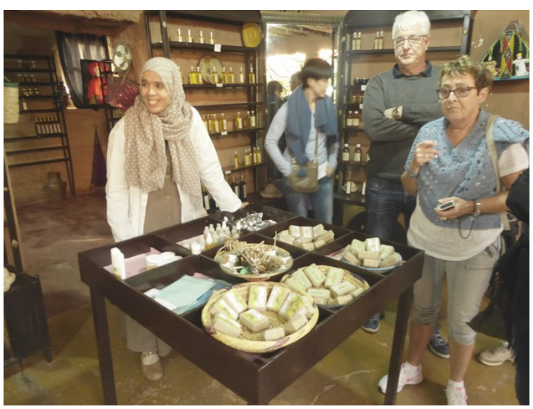
Then there was pressure to buy.