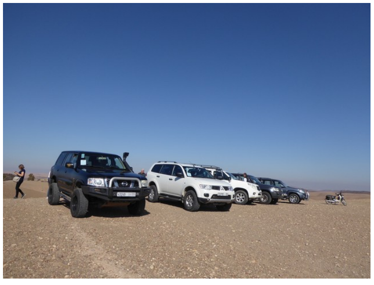
These are the cars, which we drove in. There came several cars to the viewpoint while we stood there.