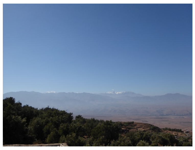
Here we also saw the Atlas mountains better.