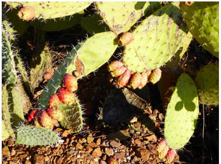
A close-up of the cactus.