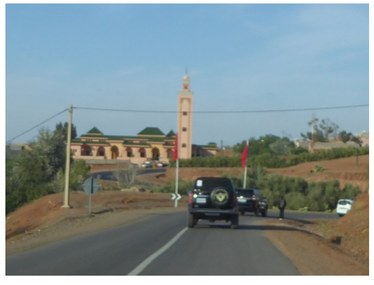
Another mosque in Talat Marghn.