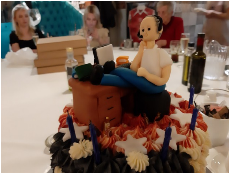
The decoration on top of the cake. It is depicting Asbjørn late at night, sitting with his feet on the table, writing a book and drinking whiskey.