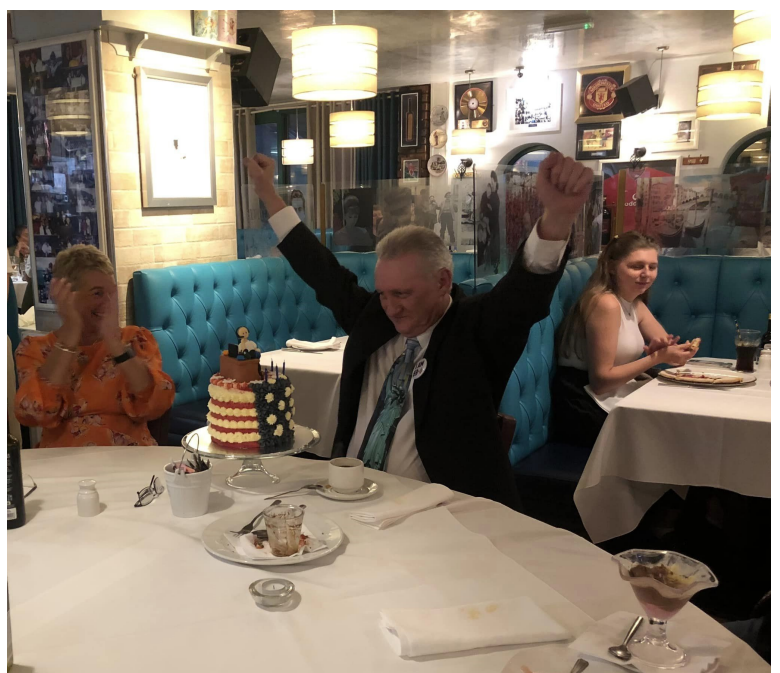
Managed to blow out the candles!