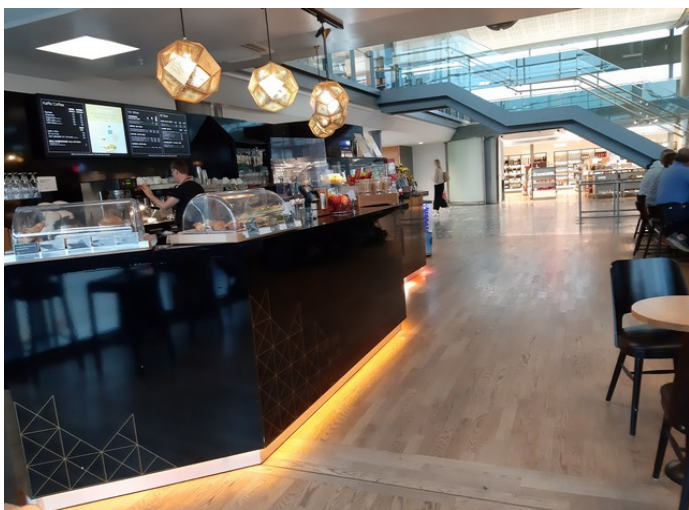
We are sitting at Bar Oslo.