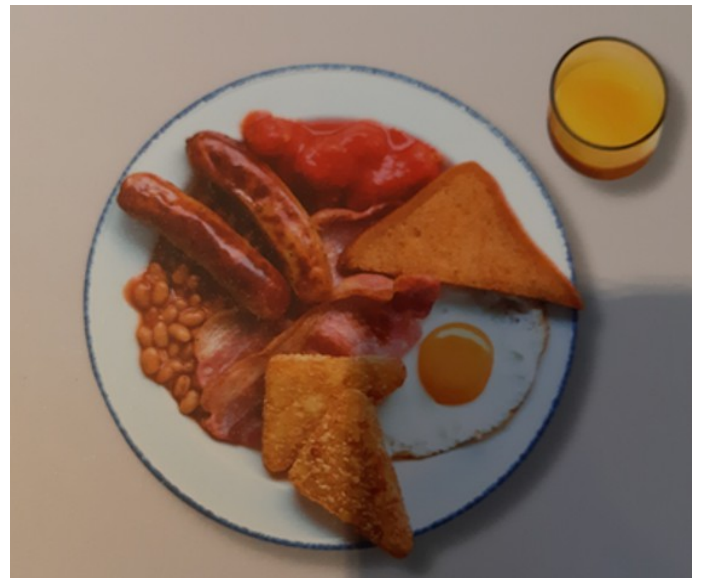
We ate something like this.