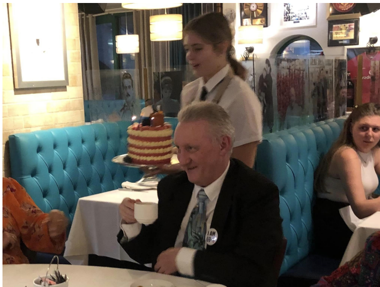
After dinner a birthday cake appeared at the table.