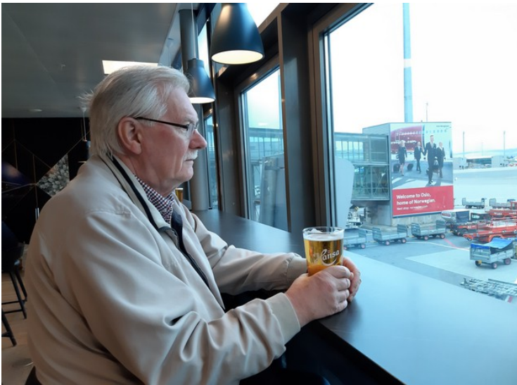
Here we are the next day, waiting to board the plane.