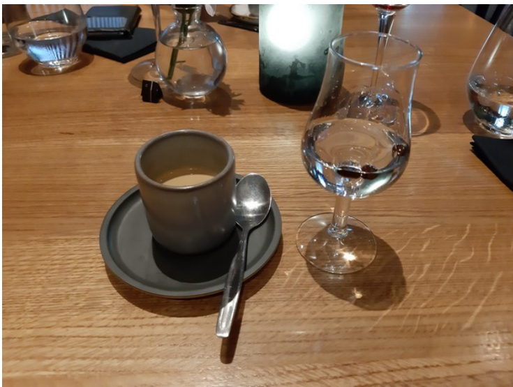
We chose espresso and Sambuca.