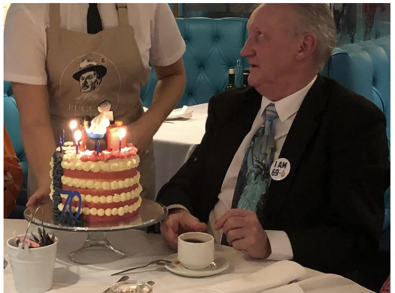
The candles were lit.