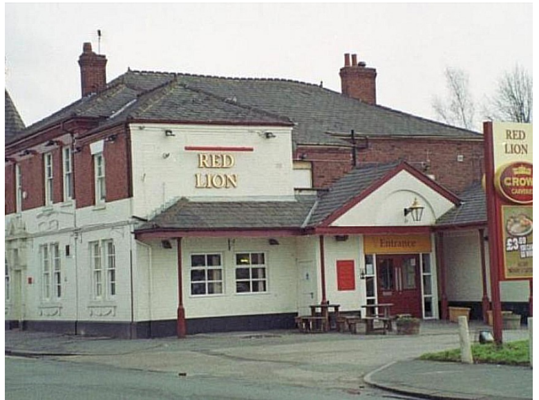
The last time we stayed at the Premier Inn we could have breakfast at Henry Boddington, but they had stopped serving breakfast and didn't open until 12 o'clock. We therefore took a taxi over to Red Lion Pub to have breakfast.