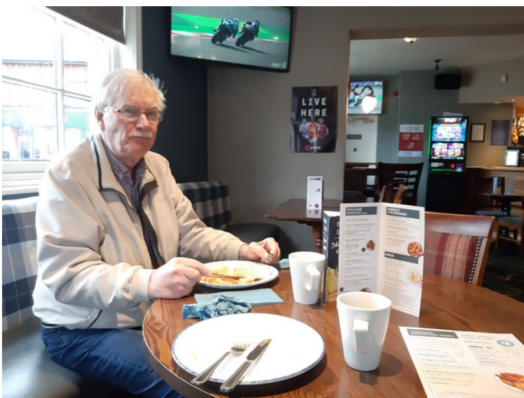
I was hungry. After we had eaten, we took a taxi back to the hotel. We had to check out before 12 noon.

Our Breakfast Deck includes all your favourites such as pork sausages, back bacon, free range eggs, hash browns, baked beans, plum tomatoes, fried bread, Belgian waffles, black pudding and toast and jams.