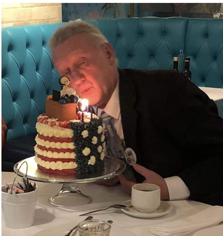
The candles are blown out