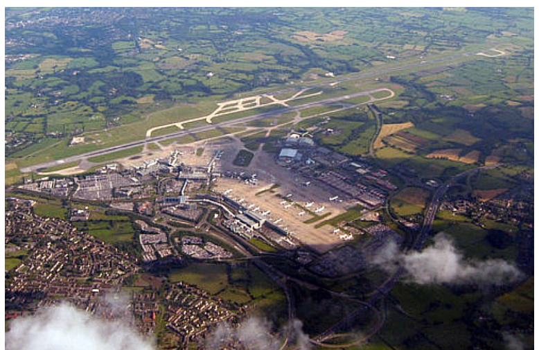
We landed at Manchester Airport , which is a little south of the city. It was opened in 1938. It has slightly less traffic than Gardermoen.