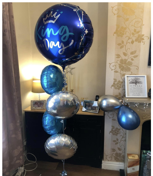
Then we visited Asbjørn. There were a lot of birthday decorations there.