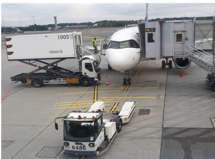
Food is loaded. We had ordered breakfast on this trip.