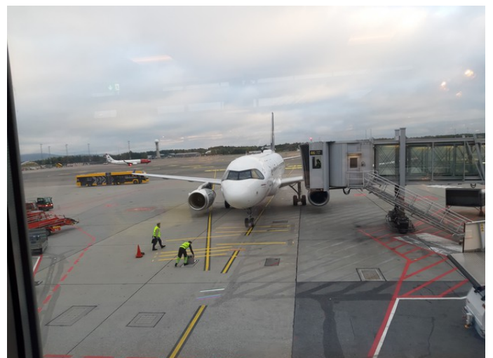
Our plane is arriving.