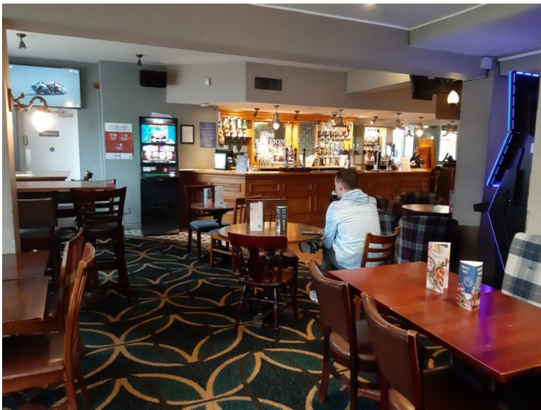
Here we are at the pub.