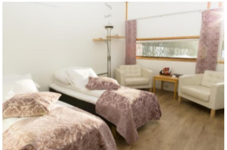
The room looked something like this.

We ate dinner there in the evening, salted meat with potatoes and turnip puree . It tasted good as a change after we had eaten sausages with mashed potatoes and fish pudding with mashed potatoes all week.