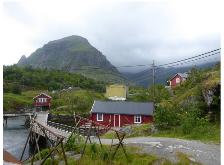
Here there is a footbridge across the kill and towards the center.