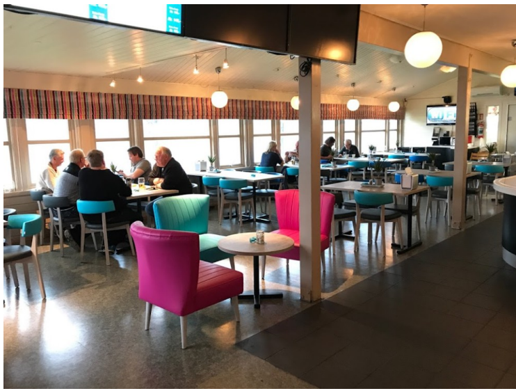
This is from the restaurant where we ate dinner and breakfast.