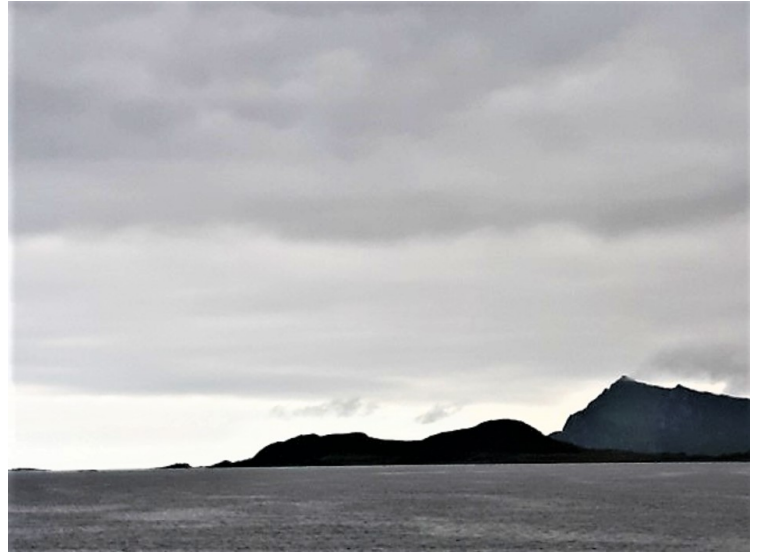
Here we have driven across Gimsøystraumen Bridge to Austvågøya and looks south along the east coast of Vestvågøya. Vestvågøya was formerly called Lofotr, which gave its name to Lofoten.