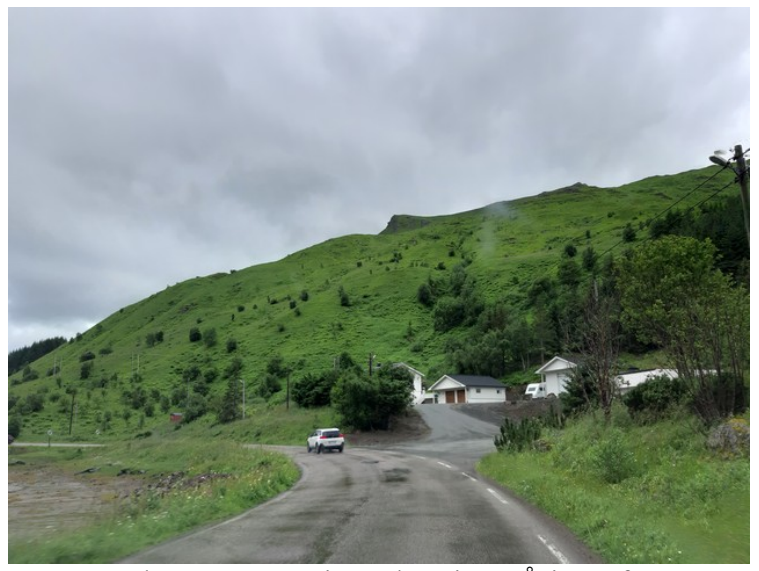
On July 13, we continue the trip to Å in Lofoten.