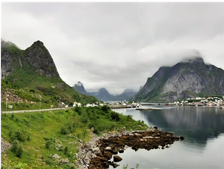
Then we drove on towards Reinebruene. We see Reinevågen to the right. At the back right we see Olstinden.

Across the Reinefjord , the main road crosses several small islands that are connected by bridges. The bridges are called Reinebruene . They were completed in 1981. Previously, there was a ferry between Reine and Hamnøy . These islands are called Andøya, Sakrisøya , Olenilsøya and Toppøya.