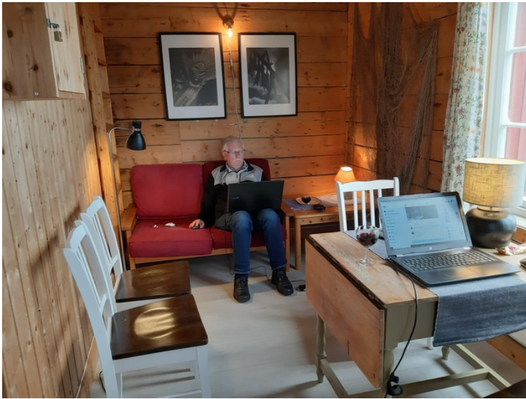
Here we are in place in the cabin. I'm checking today's news.

Today, tourism is increasingly important for Å, even though the place has traditionally been a fishing village with, among other things, stockfish racks and a cod liver oil factory . Å has two museums: Lofoten Stockfish Museum and Norwegian Fishing Village Museum .