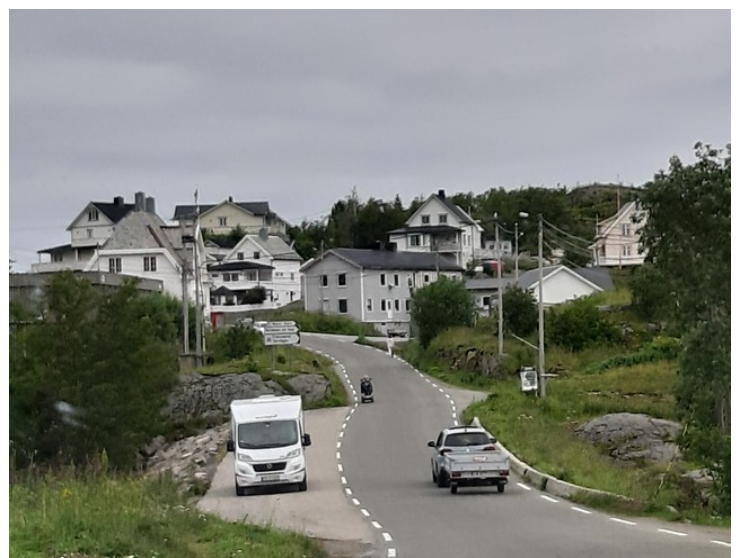
The next day, the. On July 14, we drove back in the direction of the airport. Here we drive through Sørvågen .