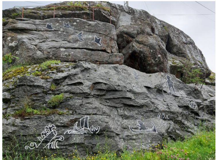
Graffiti on a rock wall by the fishing museum.