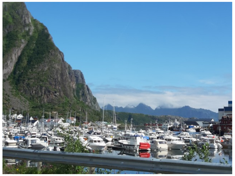
A couple of pictures from Svolveer as we drive through. Many small boats in the harbor.