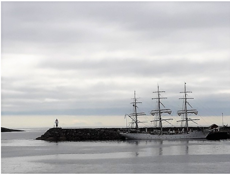
Here we look over towards Fiskarskjæret on Reine.