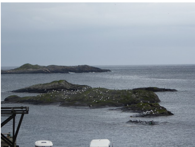
On an islet out in the bay there were many birds. The islets are called Skarvskjæran (Cormorant Skerries).