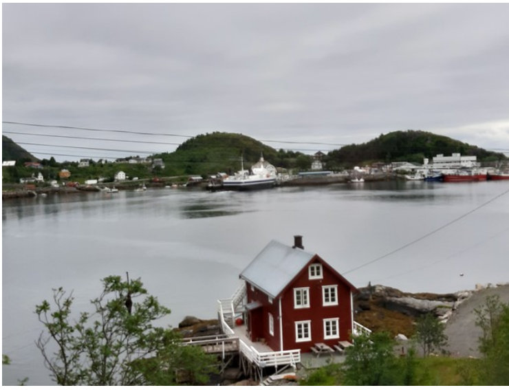
Here we look across Moskenesvågen. There is a ferry connection to Værøy, Røst and Bodø.