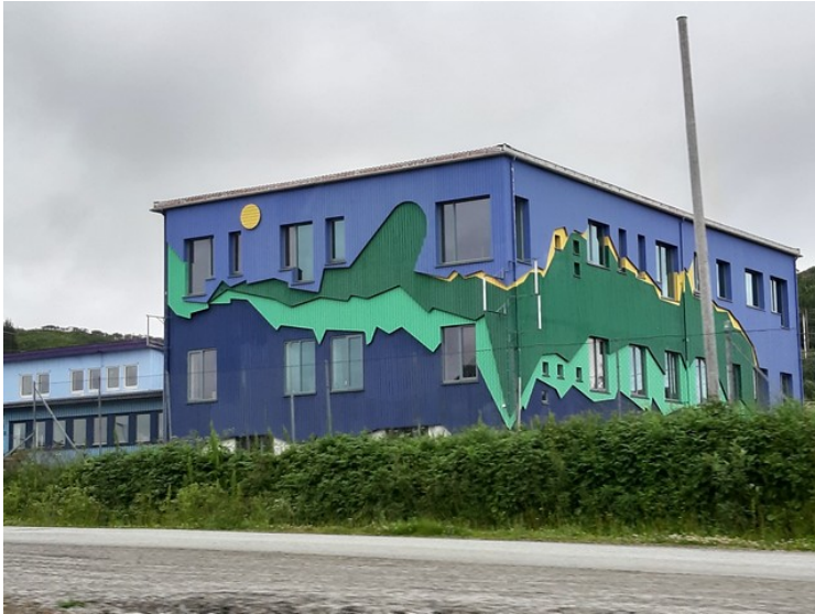
From Moskenesøya we drove across Flakstadøya to Vestvågøya .