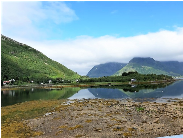
Here we have come to Vestpollen on Austvågøya.