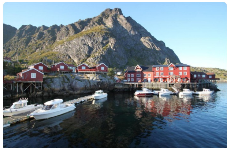
We had booked a rorbu at Å-Hamna Rorbuer . We got rorbu no. 3 from the left.