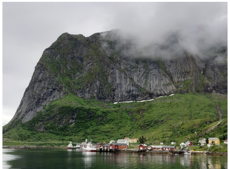
Here we look back across to Reinevågen and Reinebringen .