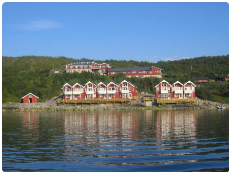
The hotel seen from the sea.

It is located by the Tjeldsund Bridge which crosses Tjeldsundet between Hinnøya and the mainland. We thought it was at a suitable distance from the airport where we would return to Gardermoen the next day.