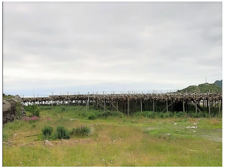
Here there are many cod heads still hanging to dry. It is a by-product of stockfish production and they are often ground up for fertilizer. Lots of exports also to Africa, especially Nigeria.