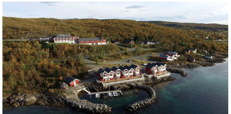
This day we were to spend the night at Tjeldsundbrua Hotel .

It is located by the Tjeldsund Bridge which crosses Tjeldsundet between Hinnøya and the mainland. We thought it was at a suitable distance from the airport where we would return to Gardermoen the next day.