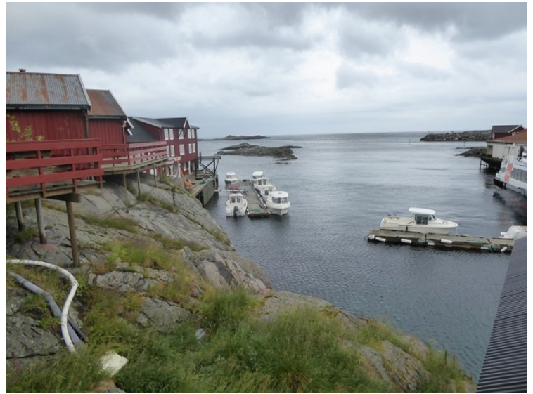
The view from the cabin.