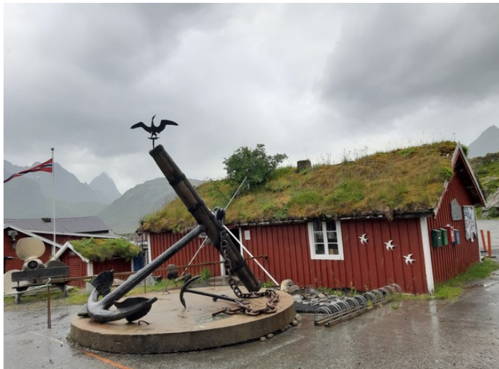
We drove a detour to Sund . It is considered to be one of the oldest fishing villages in Lofoten. Here is a fishing museum and the blacksmith in Sund lives here.