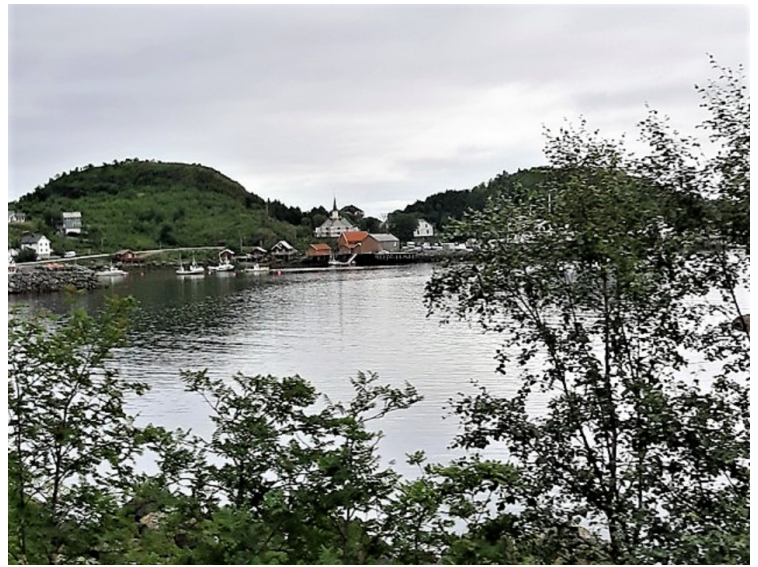
Moskenesvågen. We can see Moskenes Church in the middle of the picture.