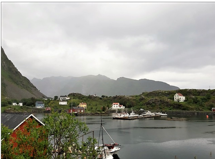
This is in Sundvågen.

Hans Gjertsen gained a reputation as 'Smeden i Sund' (the blacksmith in Sund). He is especially known for 'Kongeskarven' - the cormorant that he gave to King Olav V during the opening of the main road Svølvær - Å in 1963. The museum was taken over by Tor-Vegard Mørkved - 'Nysmeden' (the new blacksmith) in 1989.