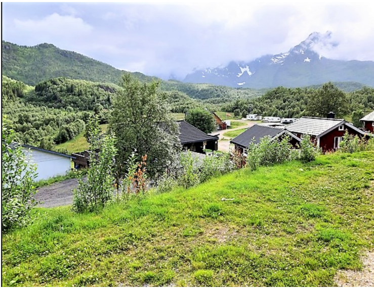
This is the view from cabin 5.