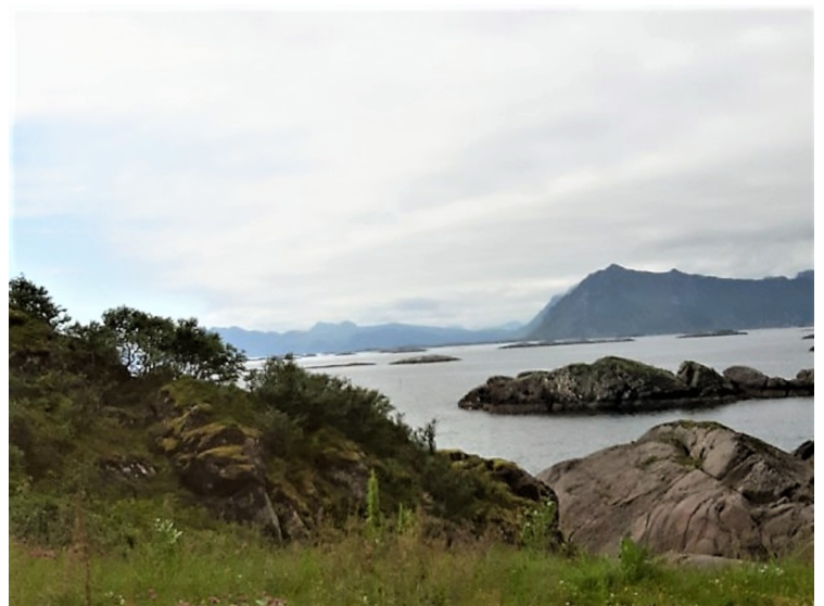
Views across Gimsøystraumen towards Vestvågøya.