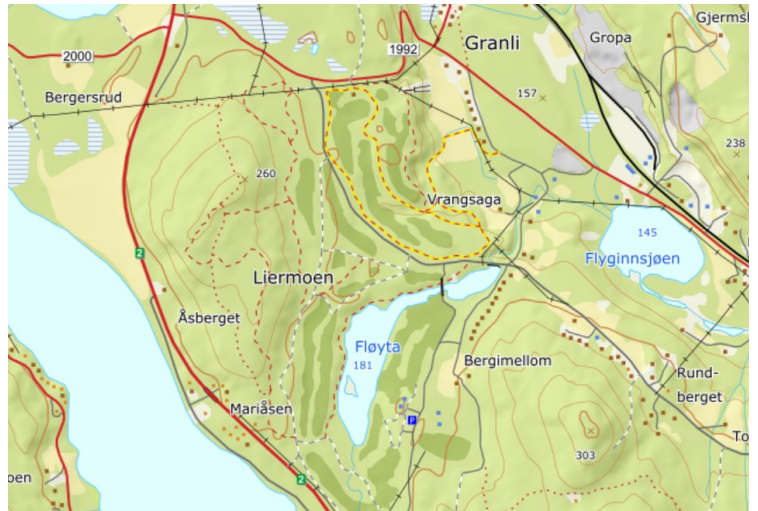
Large parts of Liermoen are managed by Kongsvinger Golfklubb . They advertise that they have been named Norway's best golf club.