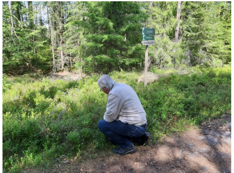
The first stop was at Liermoen . Here we have found some blueberries.