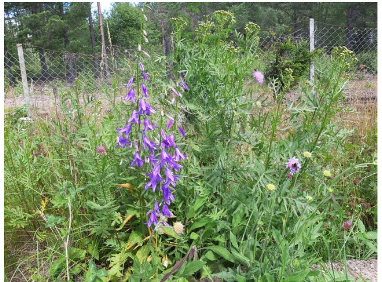
A number of flowering plants grew along the railway track.