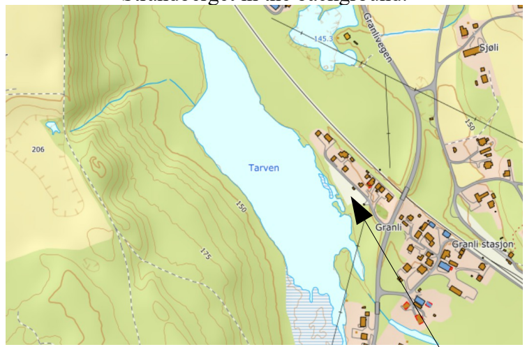
The park-like area is located here.