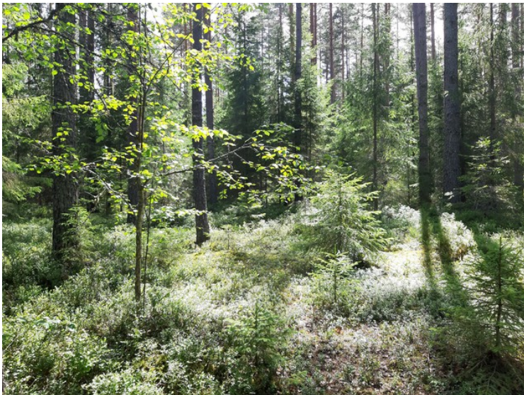
It is nice in the forest on Åsberget by Liermoen.