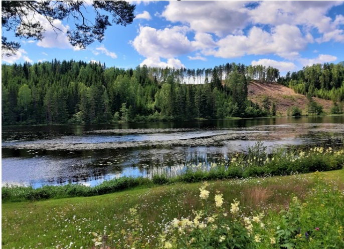
The next stop is at Tarven.