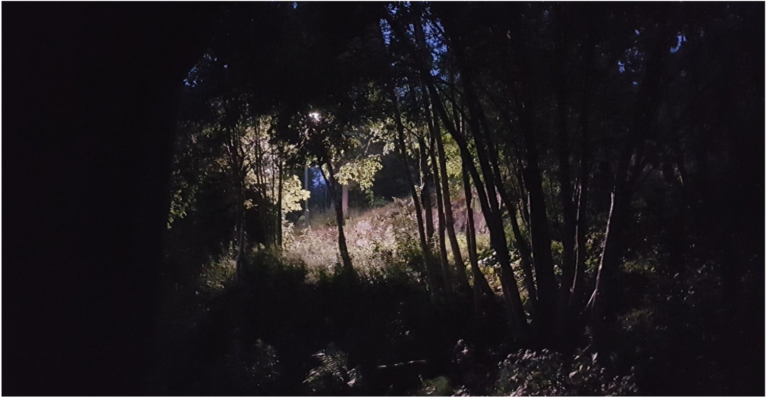
This is in the evening at the back of the block where we live.