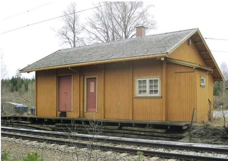
This is the station building on Granli. When we were there, it seemed to need painting.

Afterwards we traveled towards Granli stasjon . It is a closed station on the Kongsvinger line that goes towards Sweden . When we take off from the main road towards the station, this tree trunk stands with a mark of how high the water has reached when there is flooding in Glomma . The top mark is a sign that says these are flood marks. The highest was in 1995. The second highest was in 1967. Normally the water from Vingersjøen flows into Glomma, but when there is a flood in Glomma, the water from Glomma flows into Vingersjøen. When the water level here is high enough, the water flows further south into Tarven and further down to Vrangselsva which continues to Vänern and Götaelv .