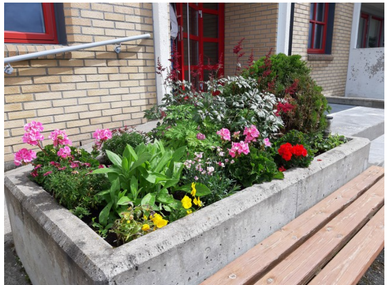
This is outside the entrance to our home.