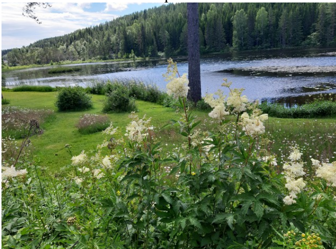
A great job has been done here.