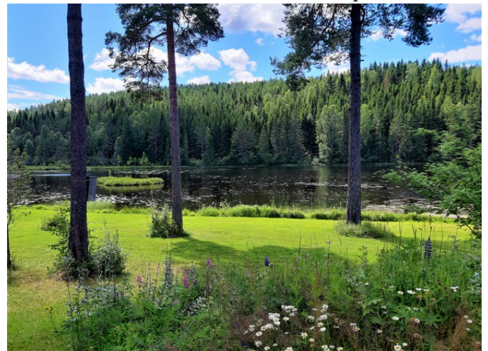
Strandberget in the background.