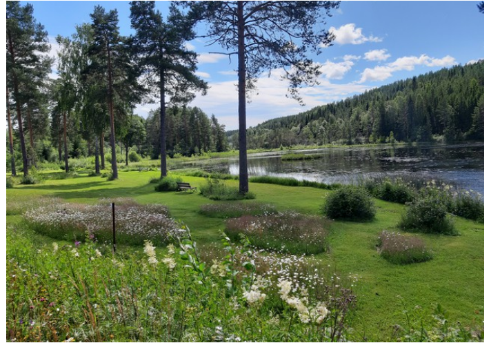
Here it is made almost like a park.