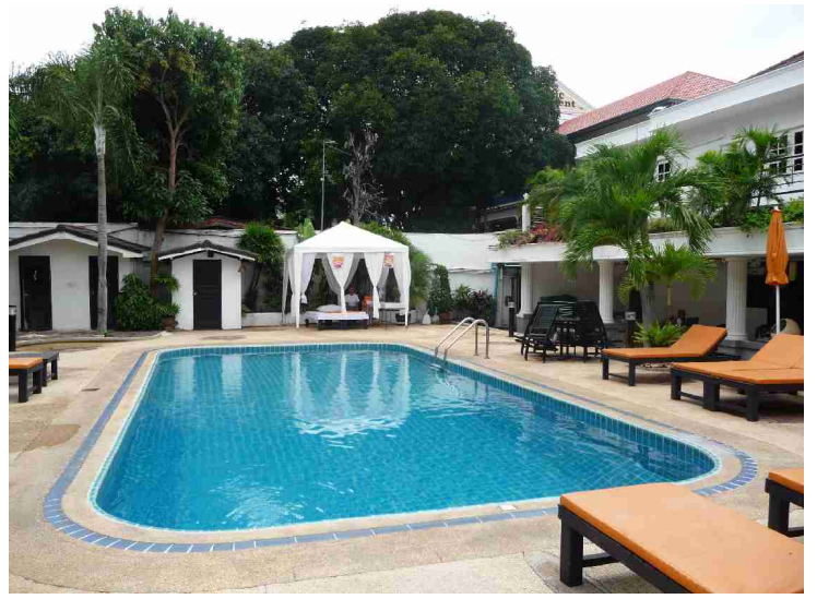
Between the fitness room and the restaurant there is a pool, which we use after the training.