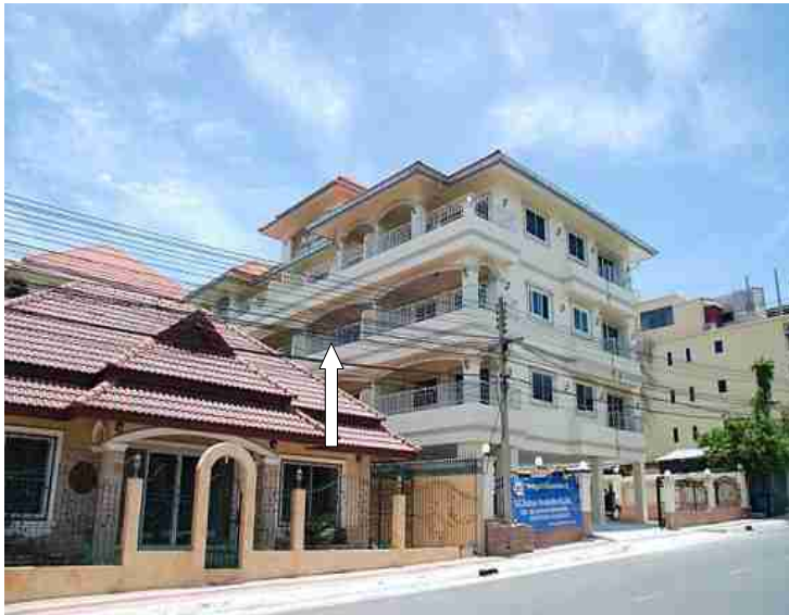
Here we are staying.