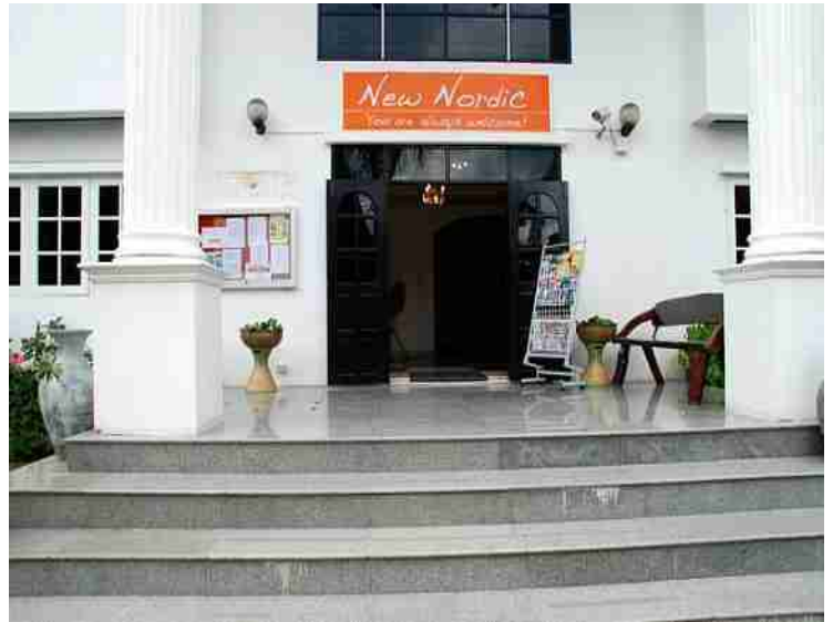
The reception is in another building.