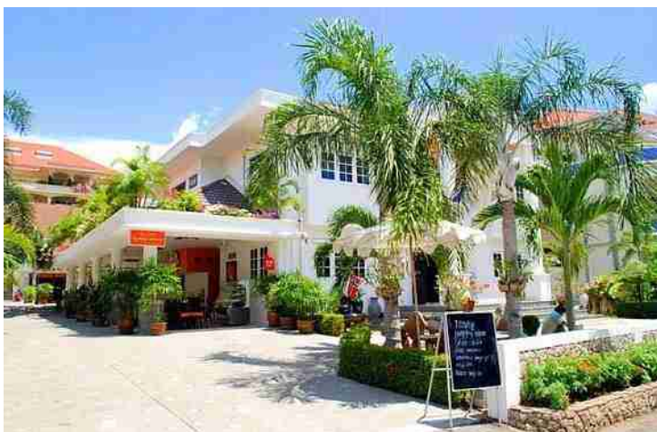
Reception and restaurant.