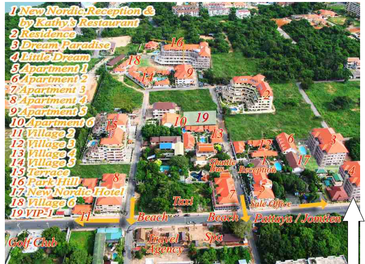
We are staying in the building down to the right.