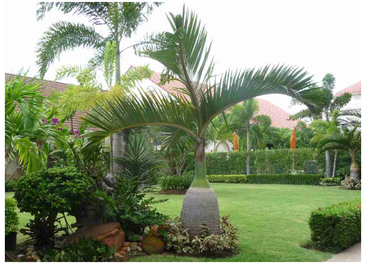
There are nice plantings outside.