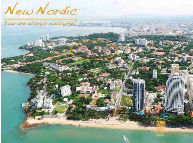
We are staying in the area, which is circled on the picture.

We stay in a apartment and hotel complex, New Nordic, that is run by Norwegians. It is situated between Pattaya and Jomtien, with address Jomtien.