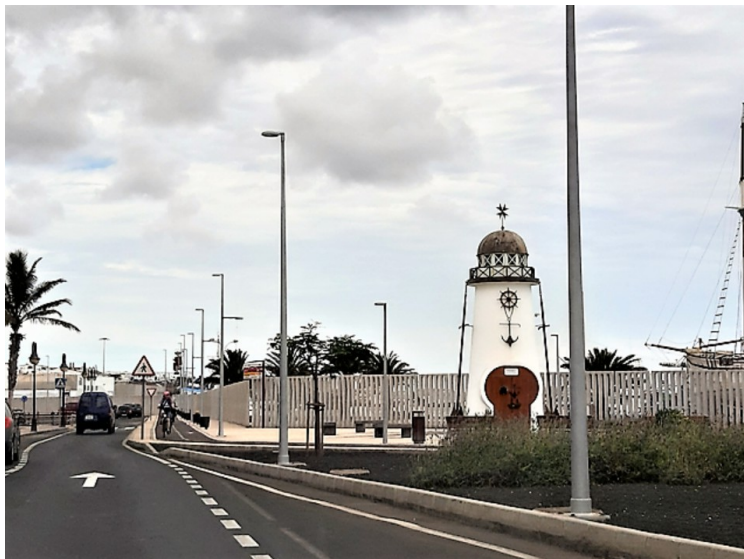
This tower is a monument in memory of 7 fishermen from Lanzarote who were killed by assailants on November 28, 1978 when they were on board the boat 'Cruz del Mar'. It was inaugurated in 2013.