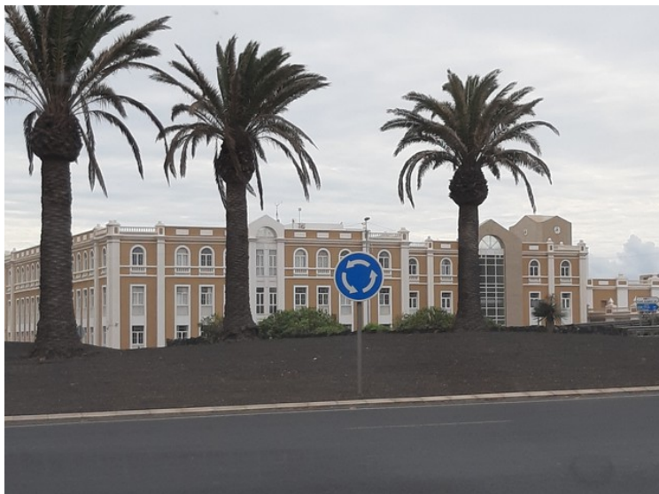
On the outskirts of town we drove past this building. It is a state institution located here. It's called Cabildo de Lanzarote .