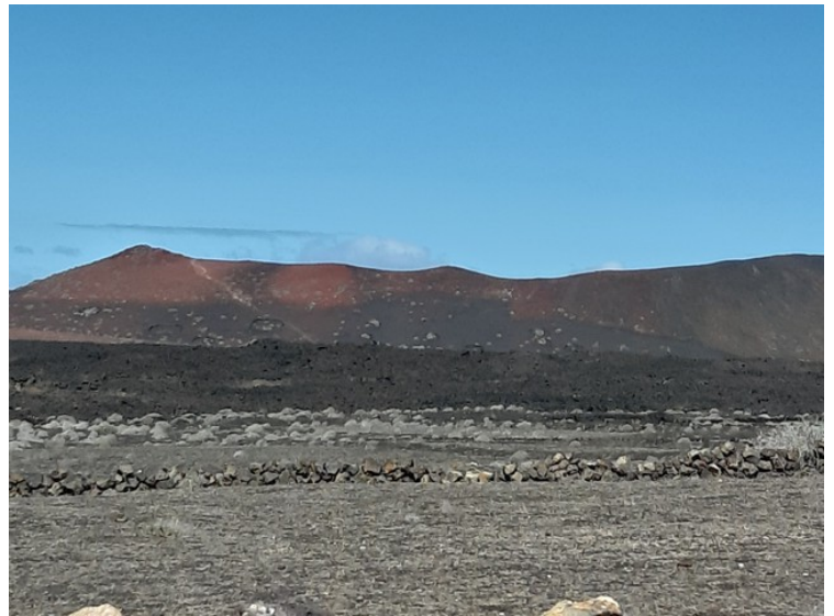
On the way between Yaiza and El Golfo,