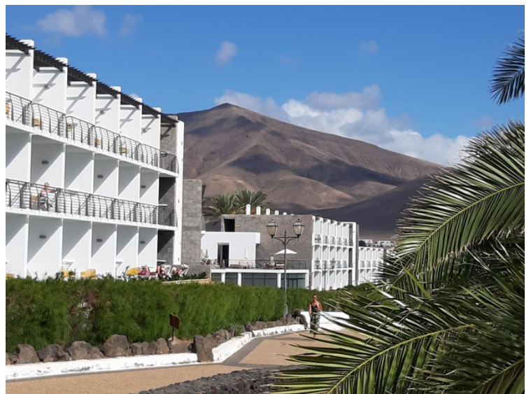
Apartment blocks along the seafront.