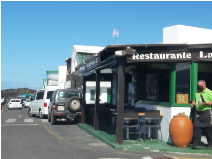
Then we're in El Golfo . It's a small place, but there were a lot of people there when we were there.