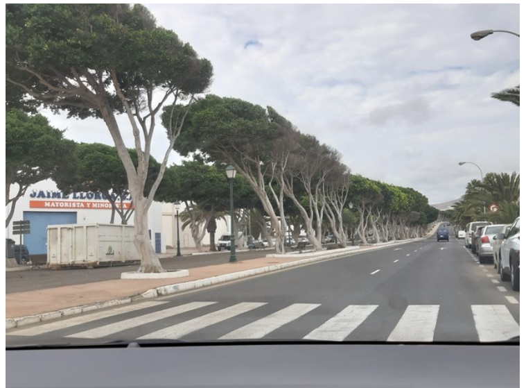
Then we're on our way out of Arrecife.