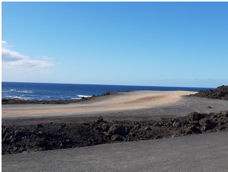
We drove on towards El Golfo, but the road was closed for road work, so we had to turn here.