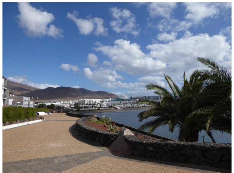
Here we see large hotels in the bay.

There is a beach promenade here from the lighthouse on Punta Pechiguera to the beaches on the Costa Papagayo. Most are laid. It's called Paseo Marítimo and Avenida Maritima.