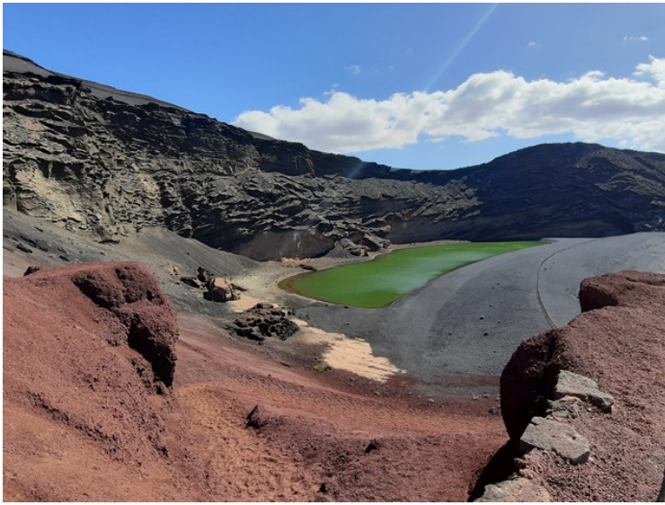
This is the green lagoon El Charco de los Clicos, also called Lago Verde. The green color comes from plankton that live in the lagoon.