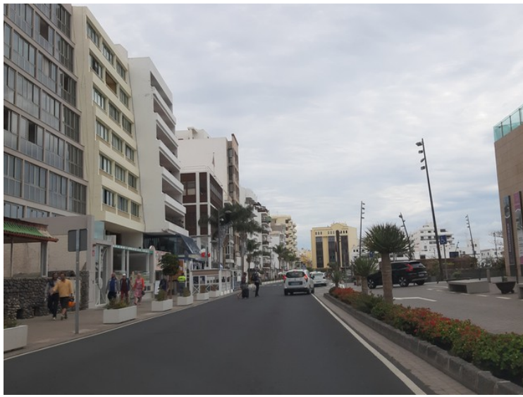
The road continues along Calle Dr. Rafael González.