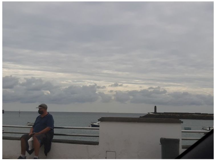
At the far right we see the island of Isote de Fermina. A footbridge has been built out there.