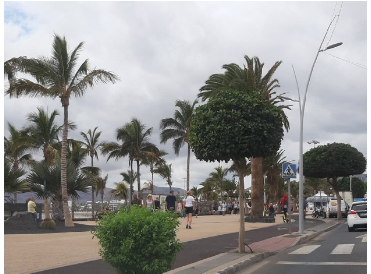
Here we are approaching Puerto del Carmen.