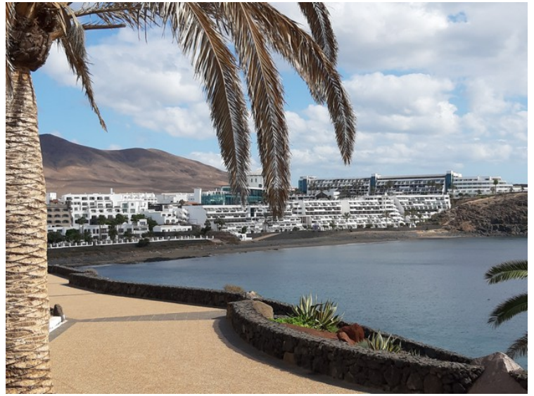
The hotels in the bay,