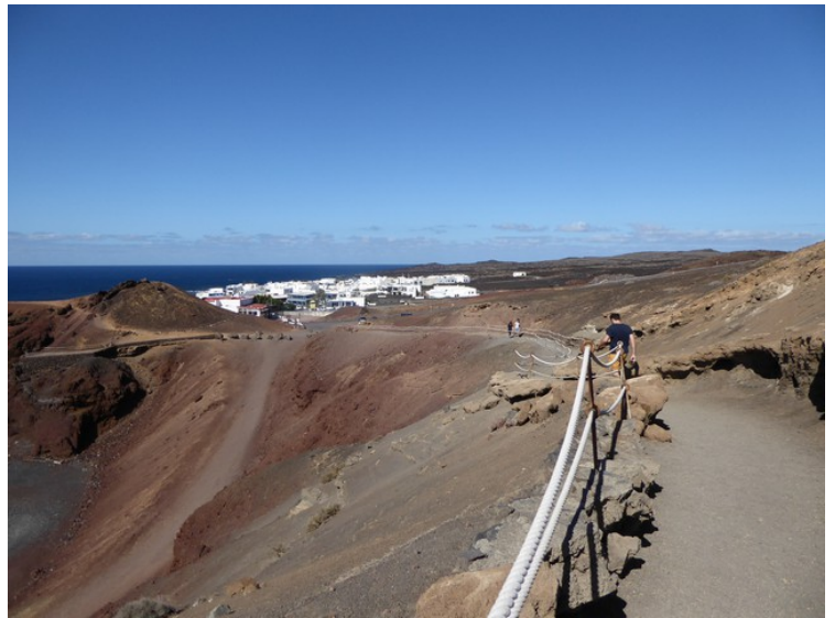
Further up we can look back towards El Golfo.