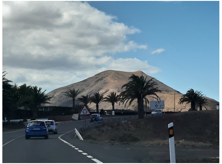
Almost back in Yaiza.