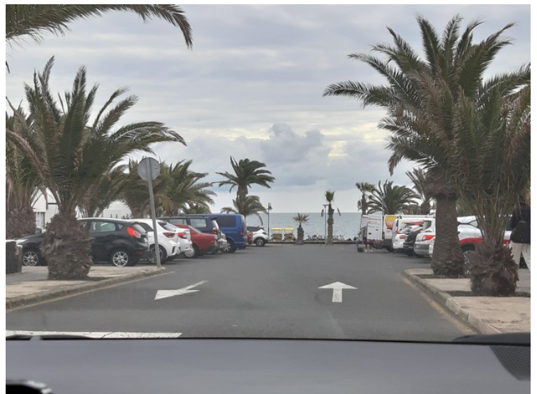
In Playa Honda.