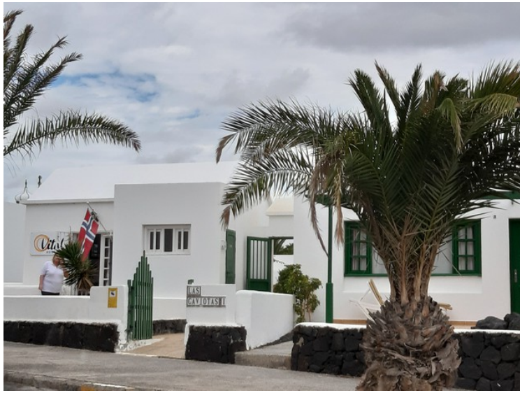
Apartments in Playa Hondas.