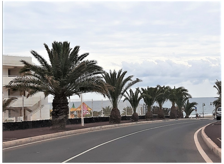
We drove further along the coast.