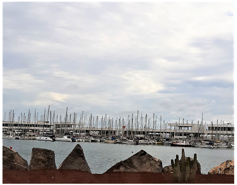
Furthermore, we drove past Marina Lanzarote. There were many boats here.