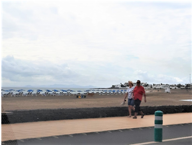
This is Playa de los Pocillos