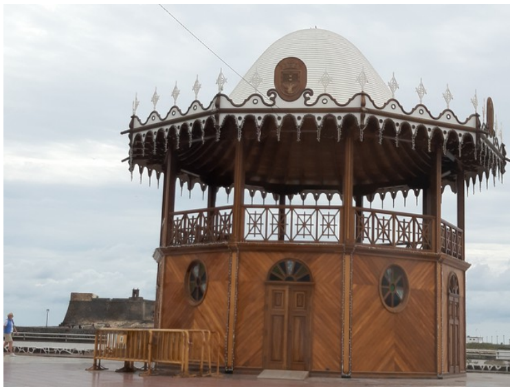
Here we are at Avenida la Marina with the José Ramírez Cerdá Park.