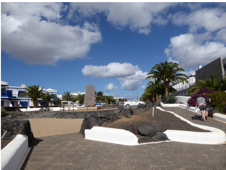
Here we can walk from the street and down to the promenade.