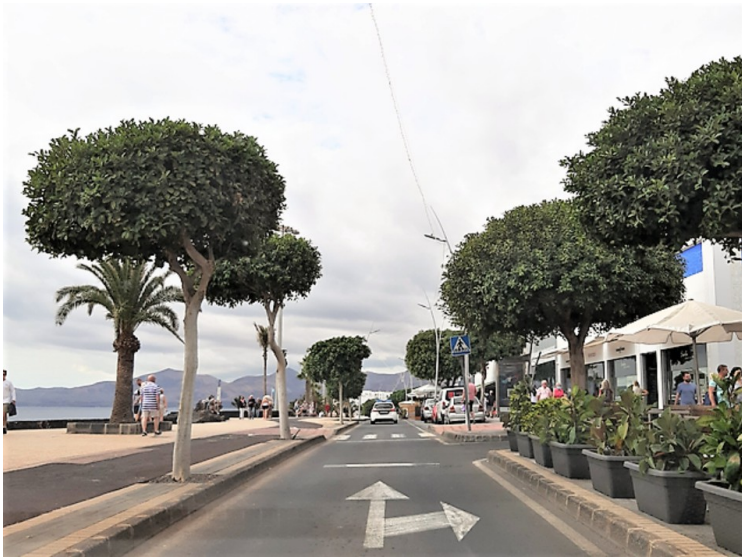
Avenida de las Playas continues further along the seafront.