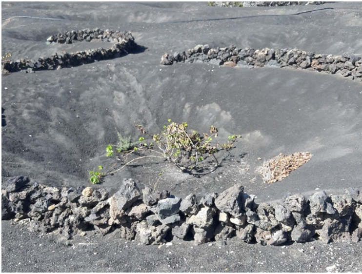
An example of a plant in a depression volcanic rocks around.