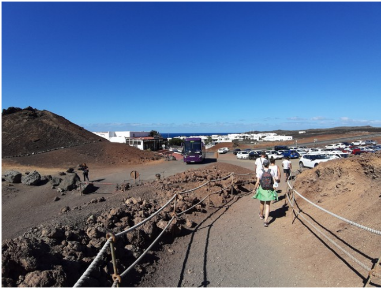
El Golfo is best known for the green sea outside the city. Here we are on our way up from the parking lot.