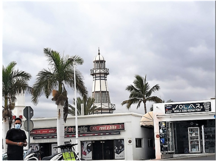
A lighthouse near the old harbor.