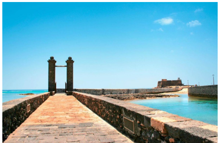
At the same time, a drawbridge, Puente de las Bolas, was built to the island. The name means the ball bridge. This is because a cannonball is placed on top of the two pillars.