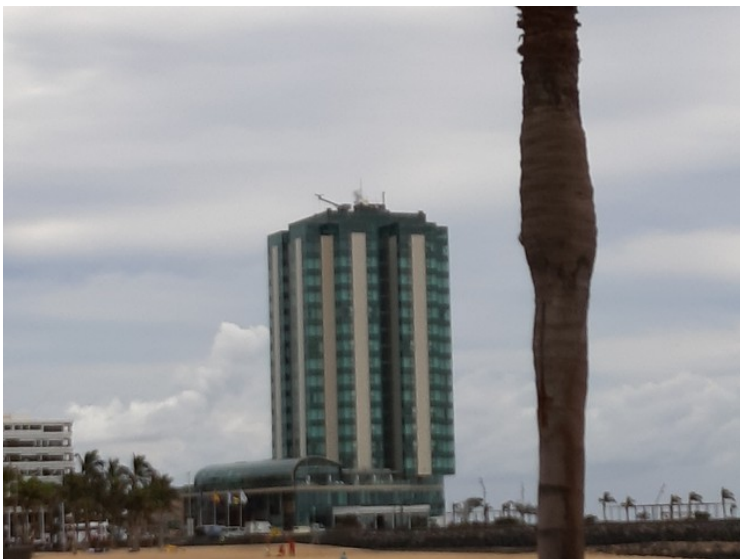
Wednesday was a day of rest, but on Thursday the 11th we drove to Arrecife . It is the largest city on the island. This is the tallest building, the Arrecife Gran Hotel .