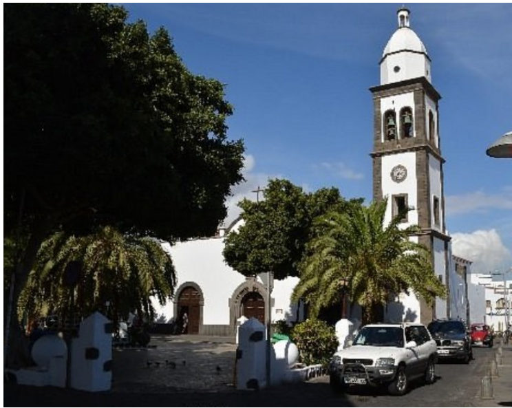
This is Iglesia de San Ginés .