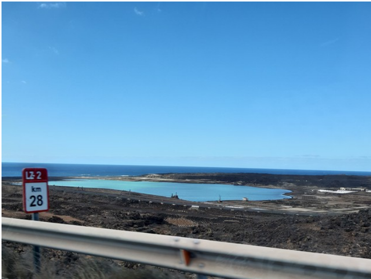
We drive past Laguna de Janubio again.