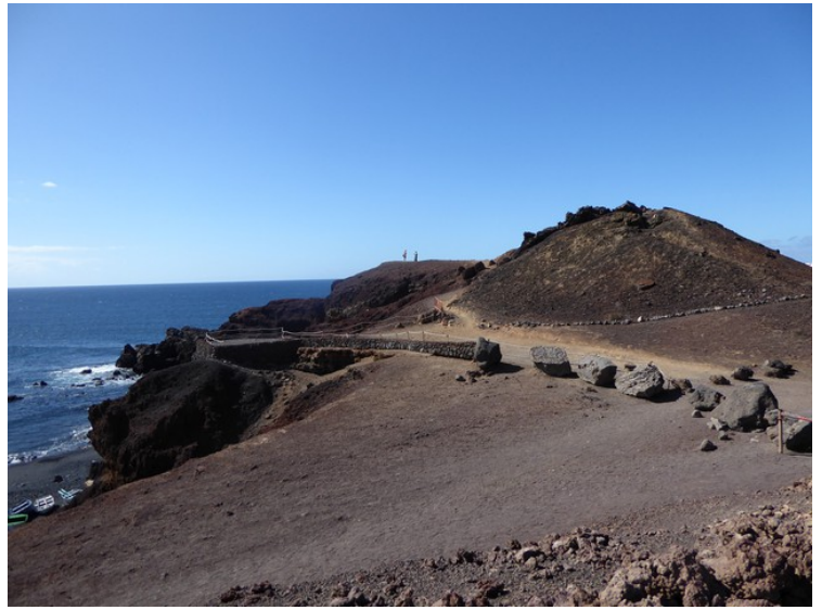
Here we see Mirador El Golfo.