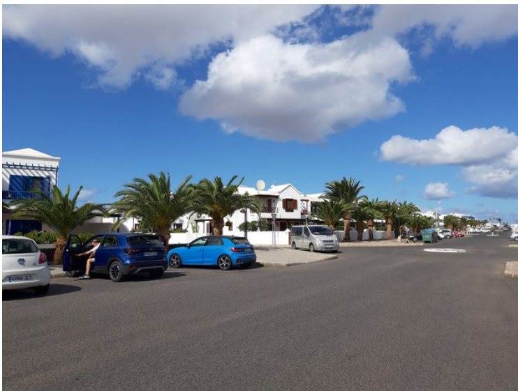
Saturday the 13th we drove a trip down to the sea. It is about 1.5 km from where we live. This is along the road.