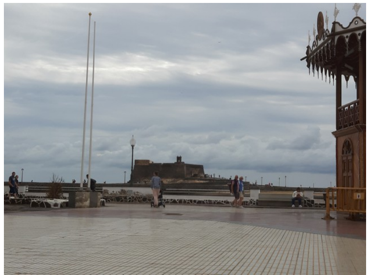
This is Castillo de San Gabriel. Barcelo Lanzaroteinformation Spain-lanzarote