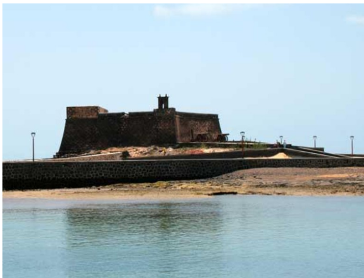
The fort was built in 1573 as protection against pirate attacks. The first fort was made of wood, but it was destroyed and burned down by the pirates a few years later. It was then rebuilt in stone.