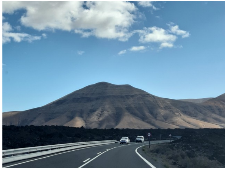
On our way back to Playa Blanca.