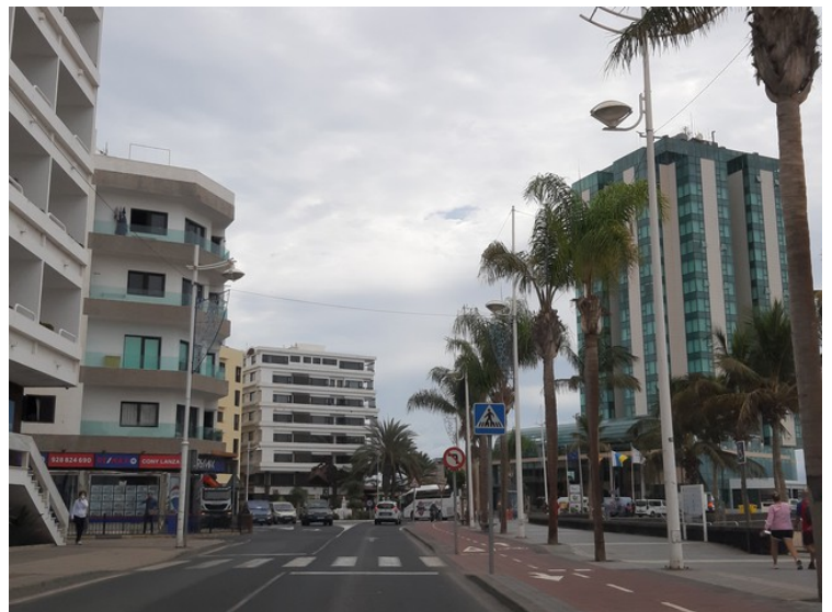
Arrecife Gran Hotel to the right.