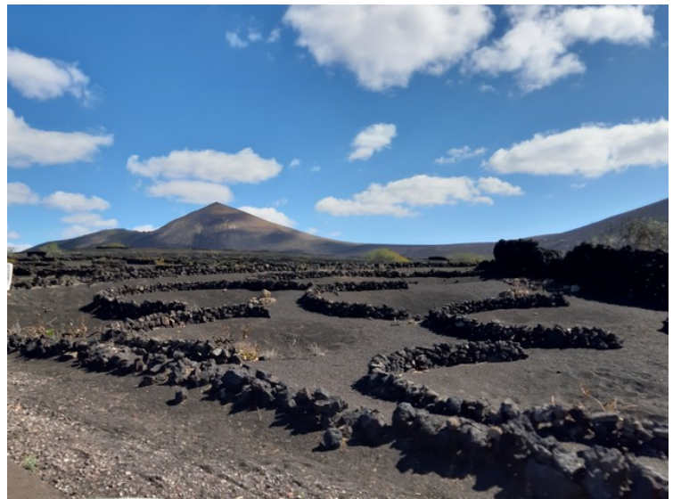
Here we have passed Yaiza and Uga. This is an area where they grow grapes.

Many of the volcanoes erupted from 1730-36 and covered large parts of southern Lanzarote with lava ash. The farmers here had to relocate the entire operation. They found that it was good to grow grapes in the ashes, but because of the strong winds, they had to shield the plants from the wind. They did this by digging depressions for the plant and building living walls of volcanic rock around it. The volcanic soil is quite fertile and it has the advantage that it absorbs the rain that comes and prevents evaporation.