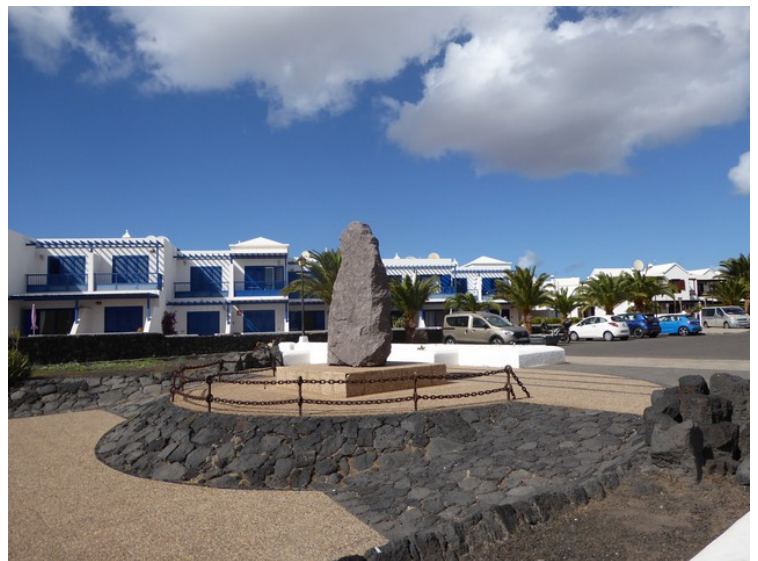
There is a stone statue at the end of the street.