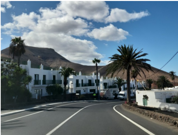
The outskirts of Yaiza . The city has been called the most beautiful city in Spain,