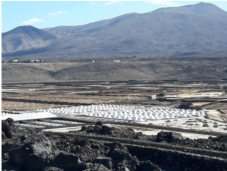
Piles of stored salt.