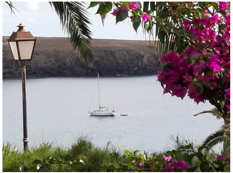
Here we look across the bay towards the Costa Papagayo.