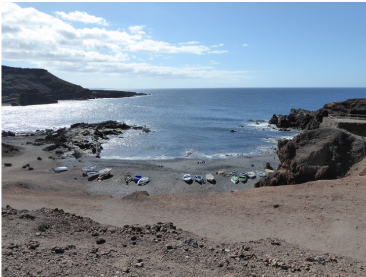
It seems that this is the only place nearby where small boats can be moored.