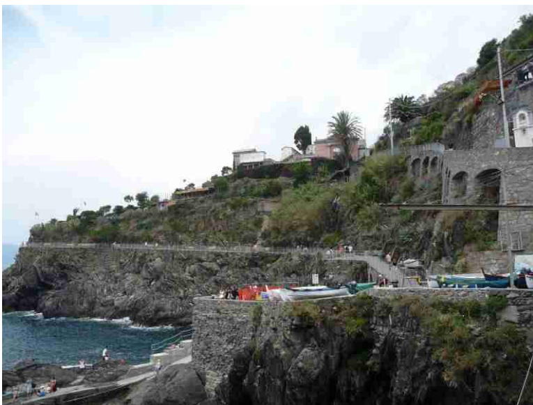
Here the path is continuing from Manarola to Corniglia.