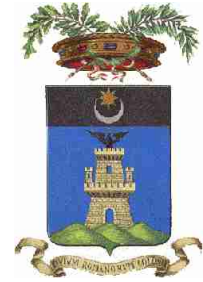
The province of La Spezia's coat of arms