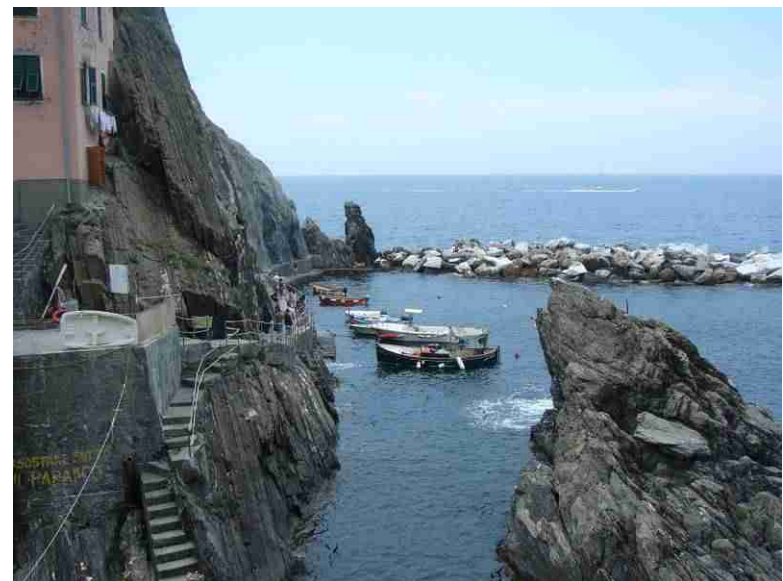
Here we are looking back to the harbour in Manarola