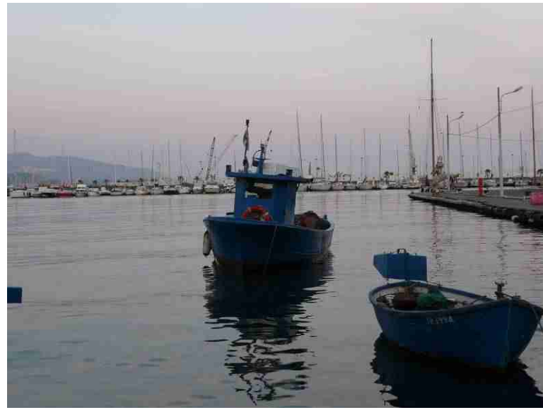
In the evening we went to take pictures from the harbour of La Spezia

Sundag the 28 th of June 2009 – This day we just relaxed