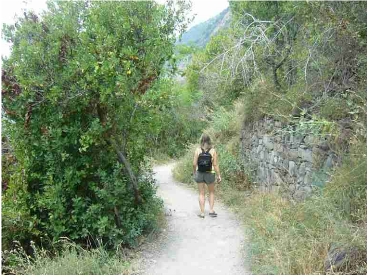
Here it is easy again