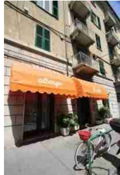
In La Spezia we were going to stay at Hotel Birillo