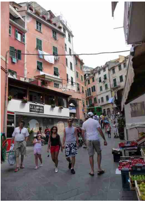
The only main street