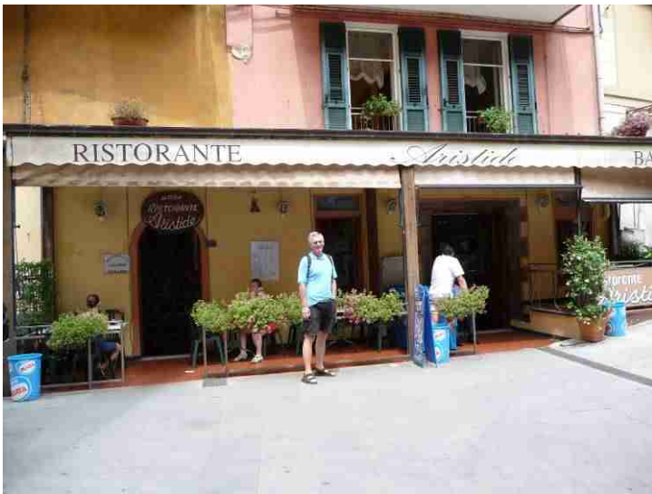
Here we have arrived in Manarola. This is the restaurant where we met a Swede the last time we were here in 2007.