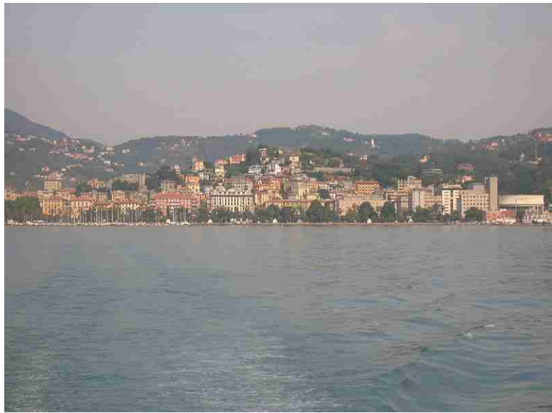
La Spezia seen from the sea

Now we continue further on to La Spezia. La Spezia is a town in Liguria and the capital in the province La Spezia. The town is one of the biggest Italian military and commercial port towns.