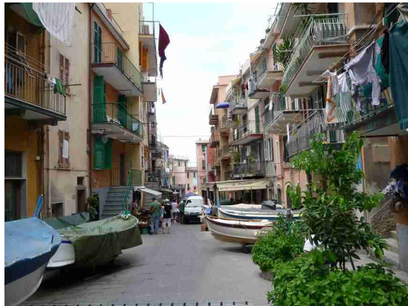
The boats are kept on land