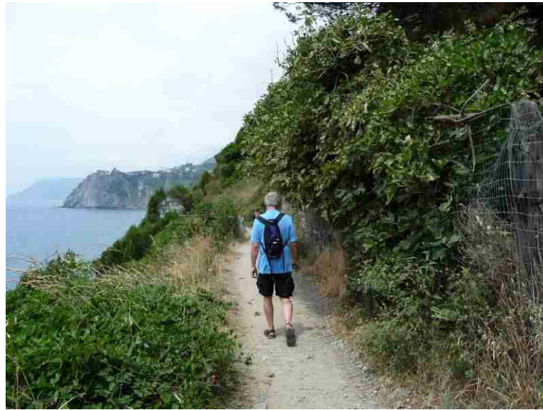
The path is narrower here