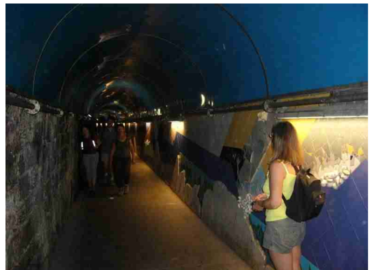
There were many wall paintings in the tunnel