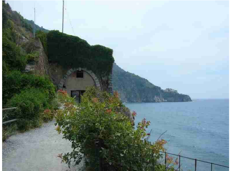
Here we look back in direction Manarola