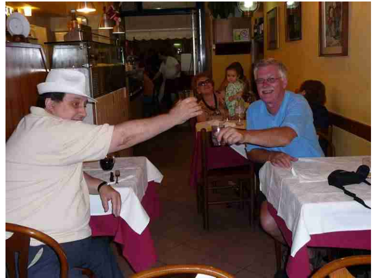
In the evening, eating at a pizza restaurant