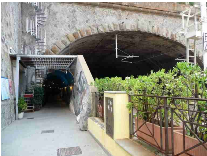
To get to the village from the railway station we have to go through this tunnel

This day we go to the nearest town in Cinque Terre that is named Riomaggiore. Cinque Terre is the name of five fishing villages straight west of La Spezia. The whole Cinque Terre area has status as a national park, and is on the list of UNESCO's world heritage sites. The five villages are Riomaggiore, Manarola, Corniglia, Vernazza and Monterosso al Mare