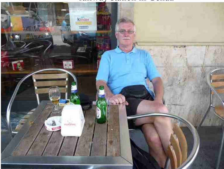
Here we are sitting at a cafeteria in La Spezia before we go to the hotel (Hotel Birillo) and check in