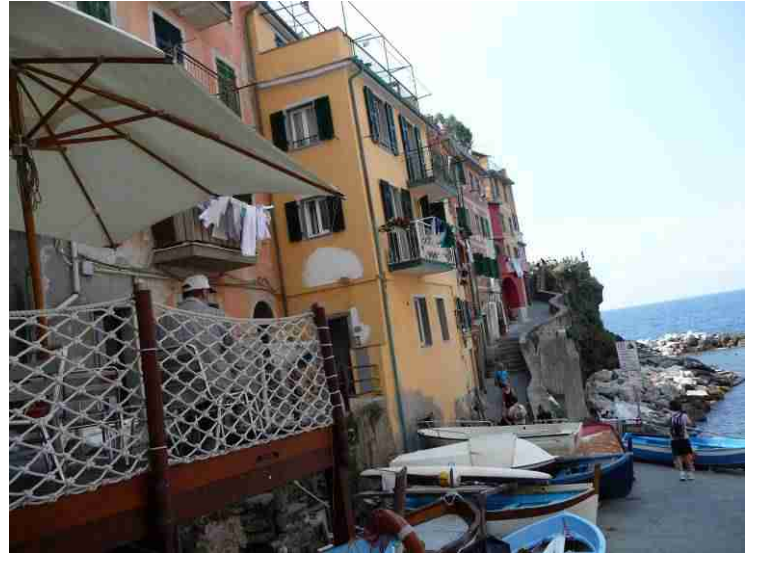
The boats are pulled on to dry land when they are not in use