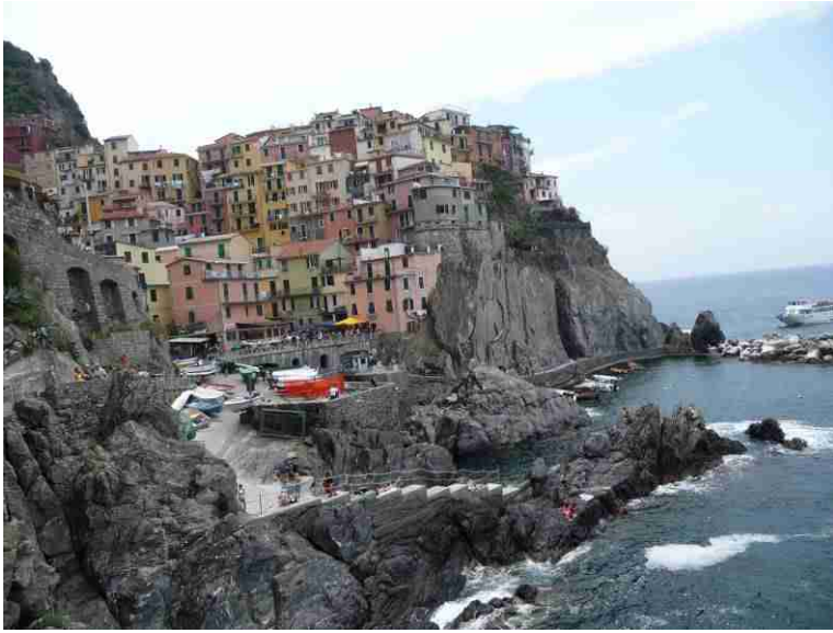
It is not the biggest of harbours