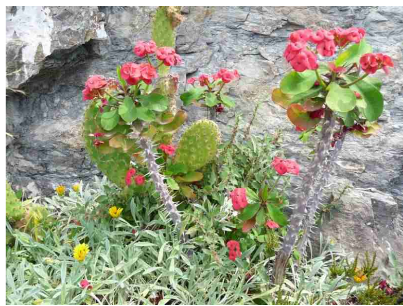
The were also some flowers