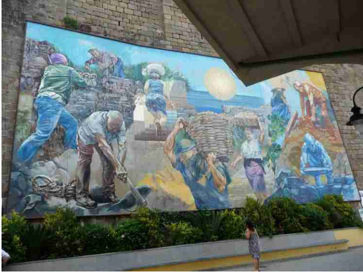
There is a large painting just outside the tunnel