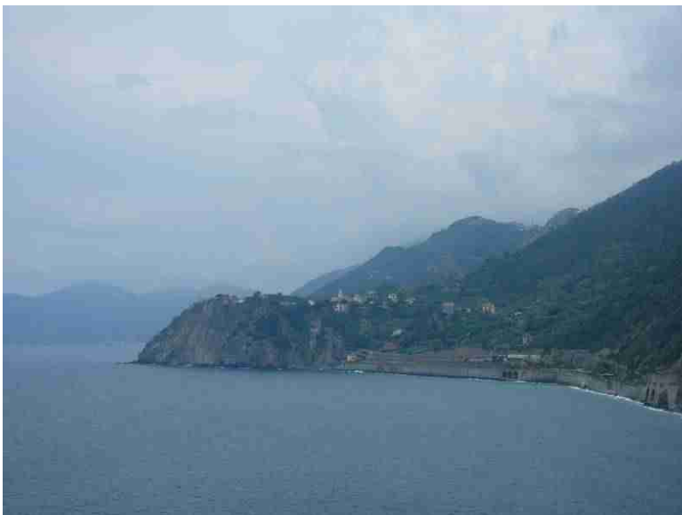
Here we look in the direction of Corniglia