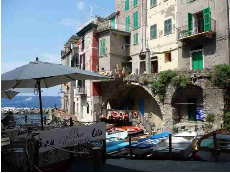
Here we have come down to the small harbour