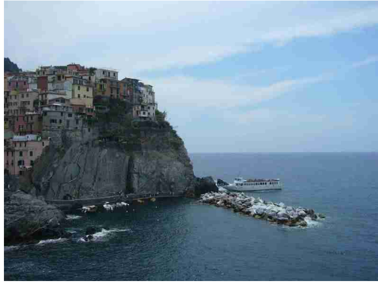
There are sightseeing boats between the villages