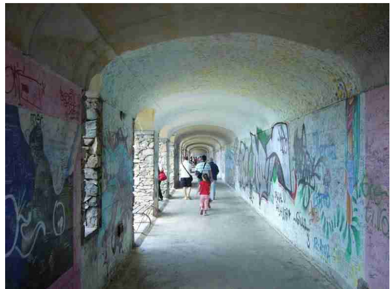
The path is partly cut out of the mountain and supported by concrete