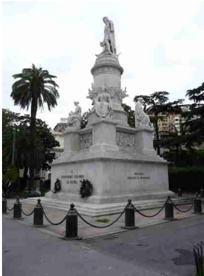
Before we leave Genua we take a picture of the statue of Christopher Columbus, which is standing right outside the railway station in Genua