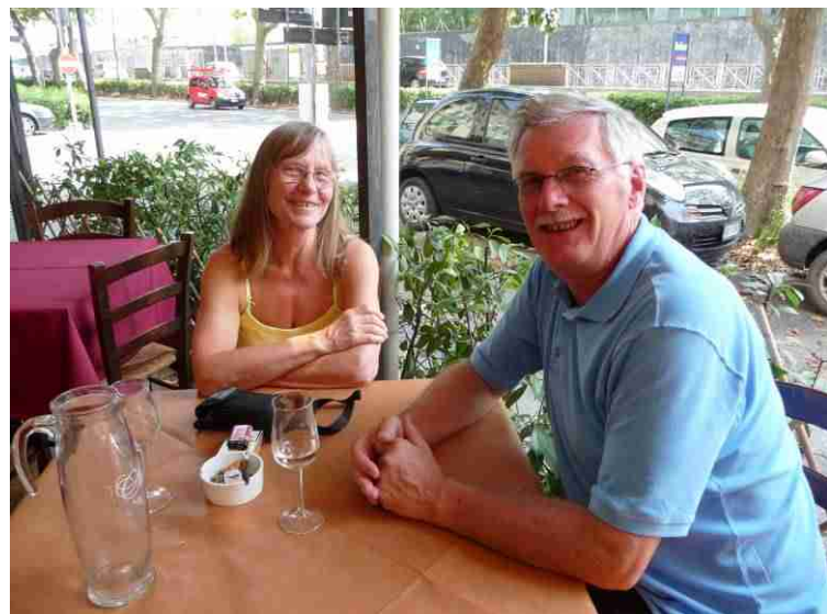
Here we are having lunch at a restaurant right beside the hotel