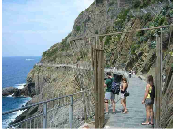
There are paths between the villages. Here is the start of the path between Riomaggiore and Manarola