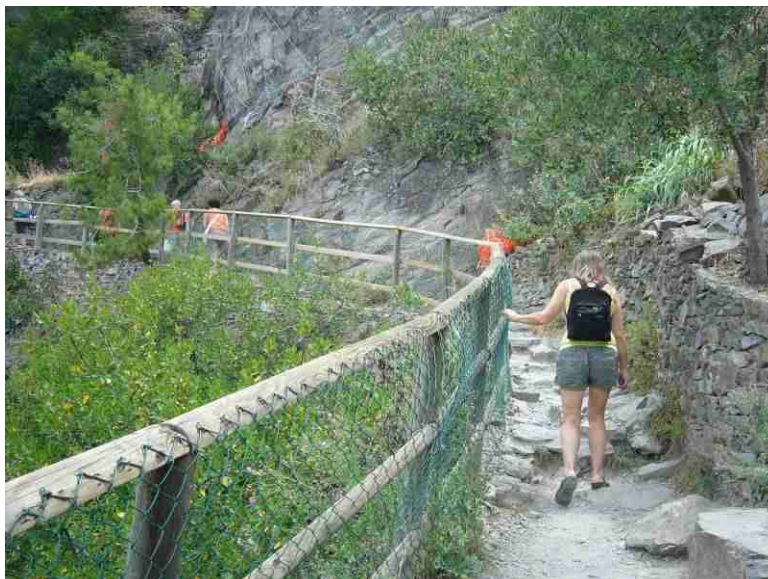
Some stretches are more exhausting