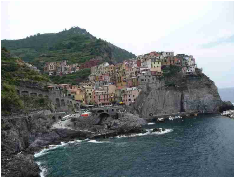
A last view back on Manarola