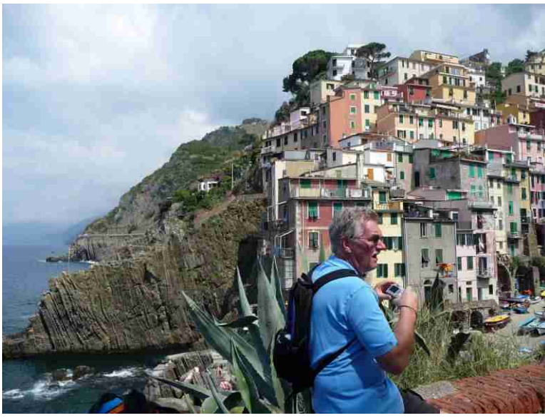
Here we take pictures of the village from a viewpoint