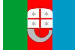
Liguria's coat of arms

La Spezia is a very modern town; almost all buildings are from after 1920.