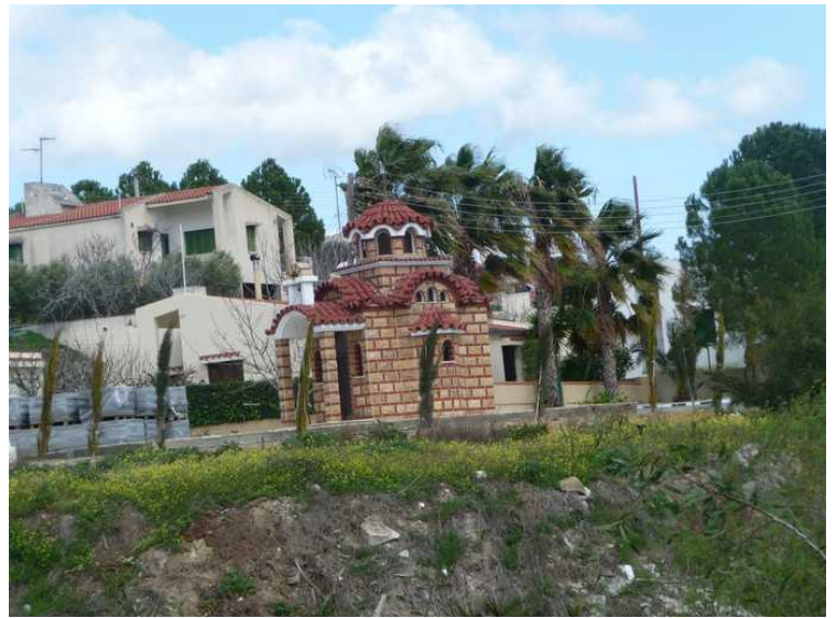
A couple of pictures from Alassa.