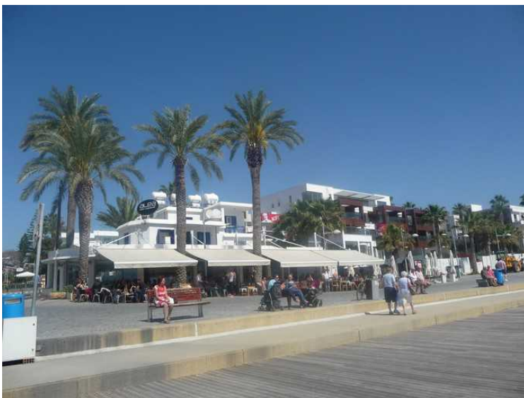
The next day, the 19th of March, we walk on the seafront in Kato Paphos . Closest to the town center there are many restaurants along the sea.