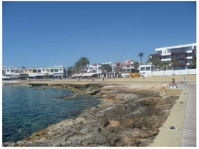
Here we look north towards the center of Kato Paphos.