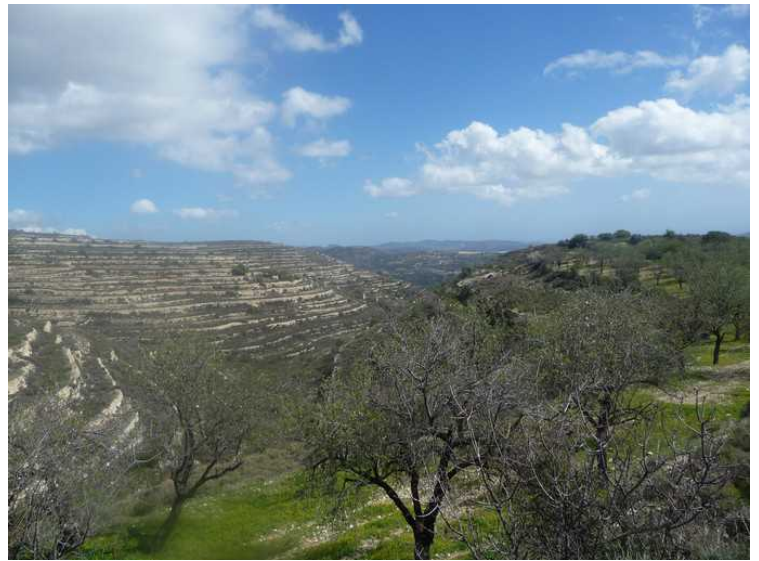
In the valley below, there are many terraces on the hillsides.