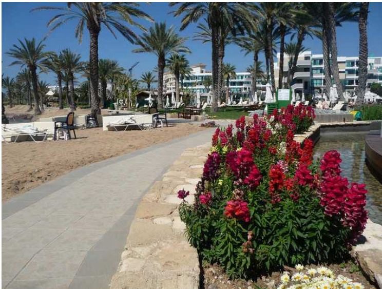
Then we went back the same way to where we had parked the car.