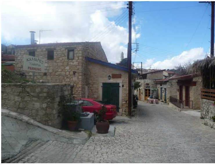
The street below the restaurant.