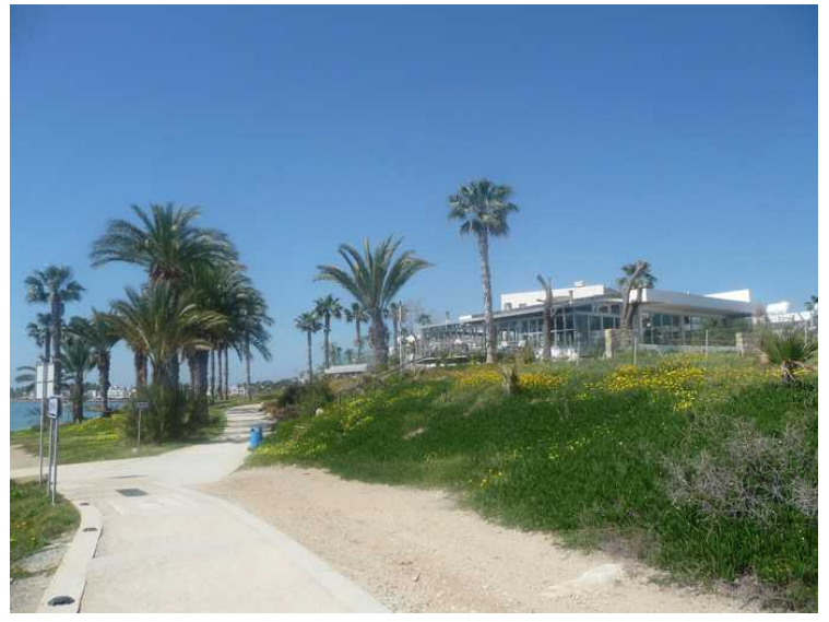
Here we look north towards the center of Kato Paphos.