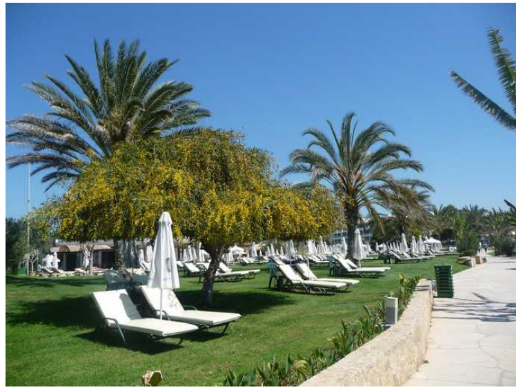
The next day, the 20th of March, we continue south. Here are the hotels close to each other.