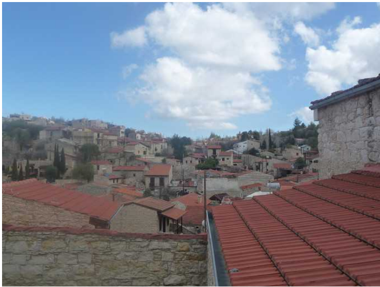
Here we are looking across the roofs.