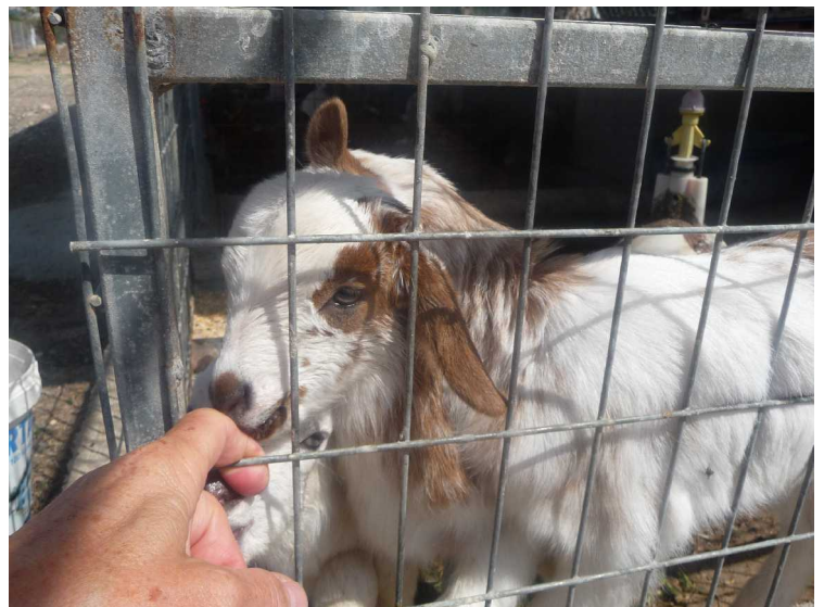
The goat kids were very curious.