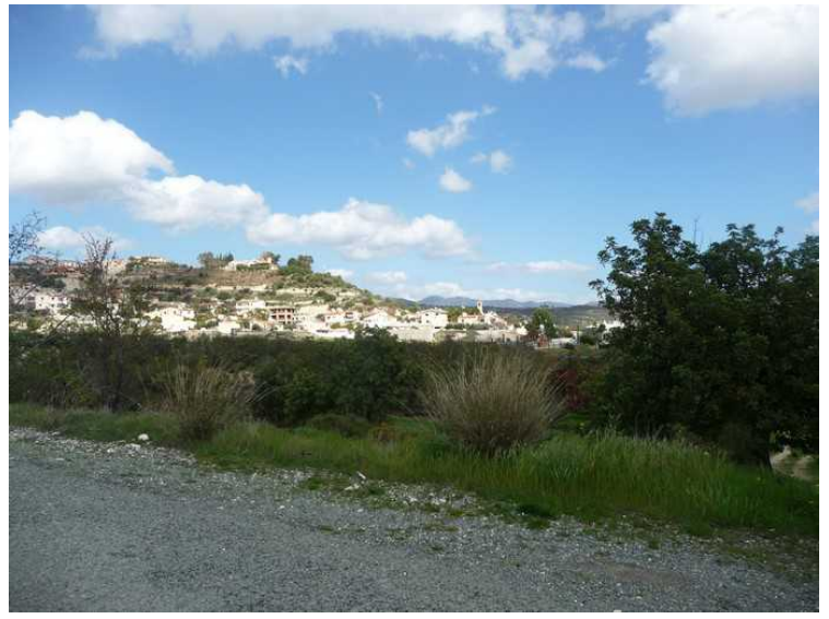
This is how Alassa looks now, after it is moved. Alassa's history.