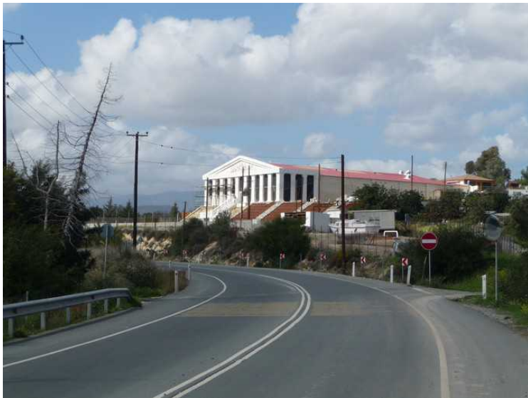
Here we drive past an imposing building in almost no man's land.