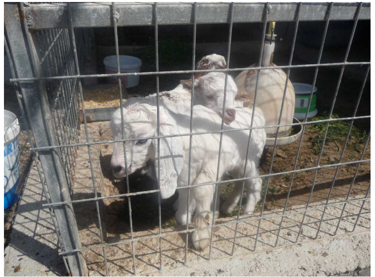
A place they had animals in enclosures. Here are a few goat kids. They had not plenty of space, but they had both food and water.