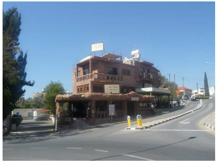
Rock Taverna Restaurant on the corner seems to be bricked in local stone. It is located right in the center of Kato Paphos.