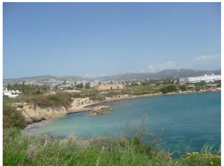
Here we are back where we parked the car. We see here Corallia Beach.