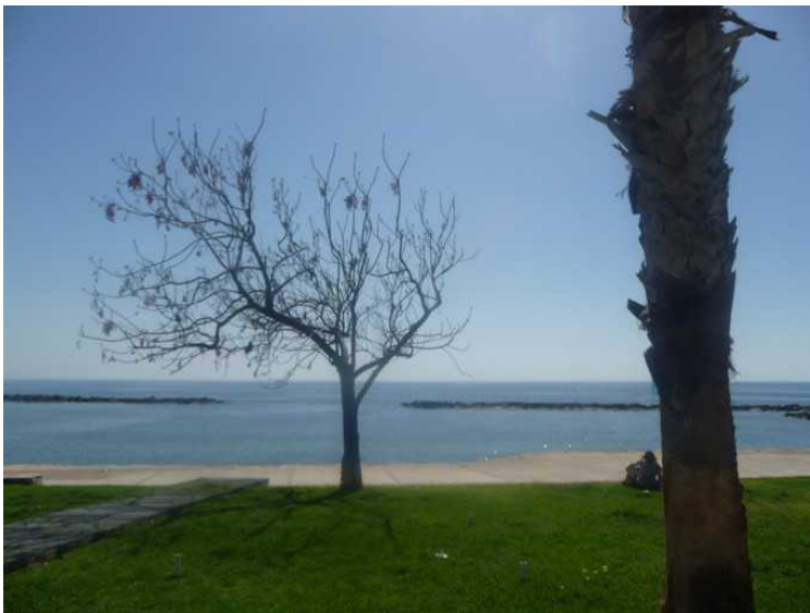
There are some trees that lose their leaves during the winter.