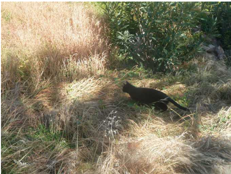
The cat is hunting something.