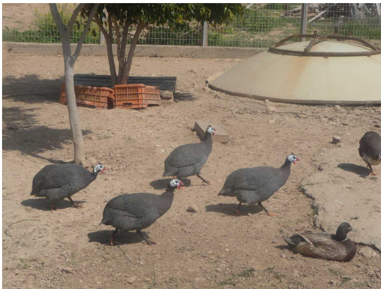
There were also ducks, chickens and these birds, which we believe are guinea fowls.