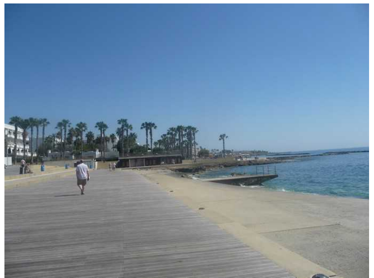
The boardwalk goes further south, until Paphos Airport .