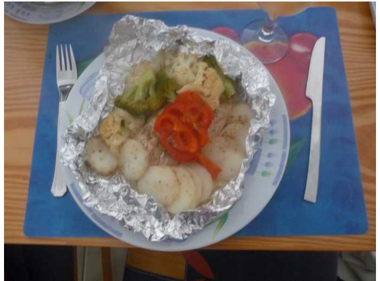
This is chicken cooked in foil.