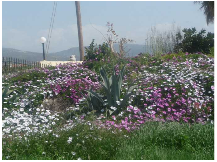
In this slope there was quite a flowering.