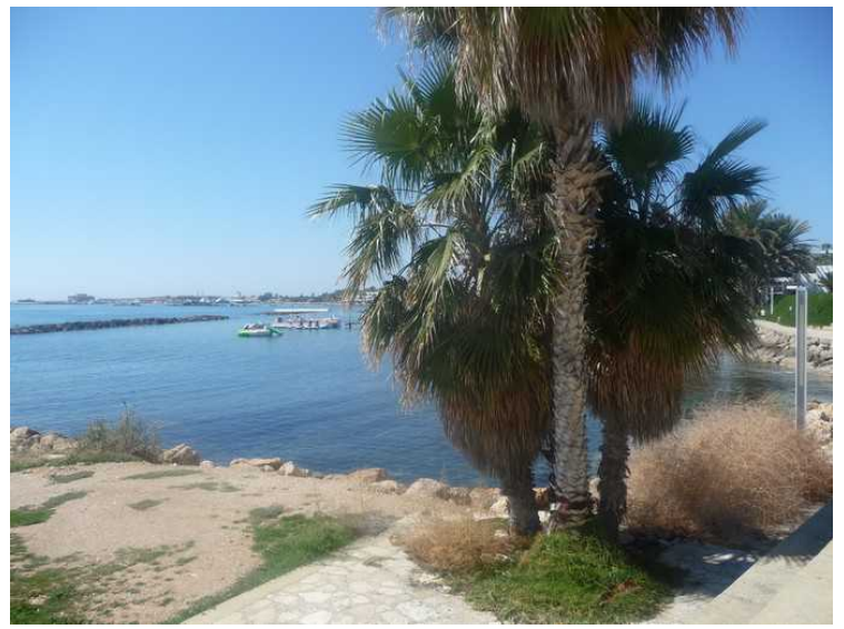
A view of the harbor of Kato Paphos.