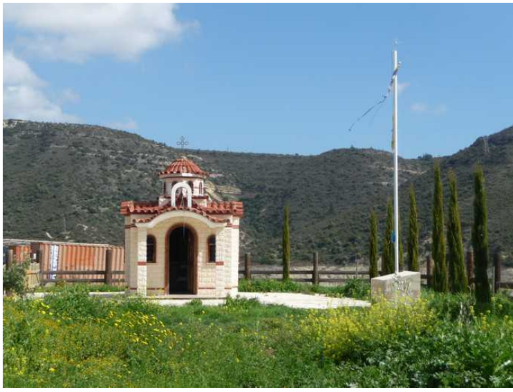
A chapel is a little higher up.