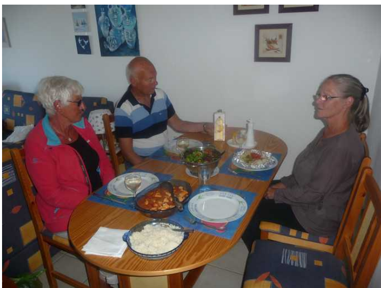
I'm allowed to take a picture.