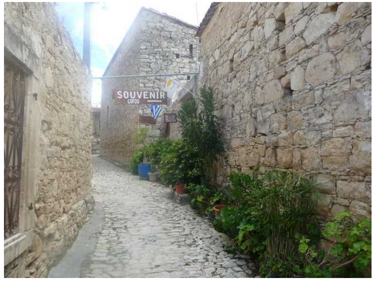
The street above the restaurant.