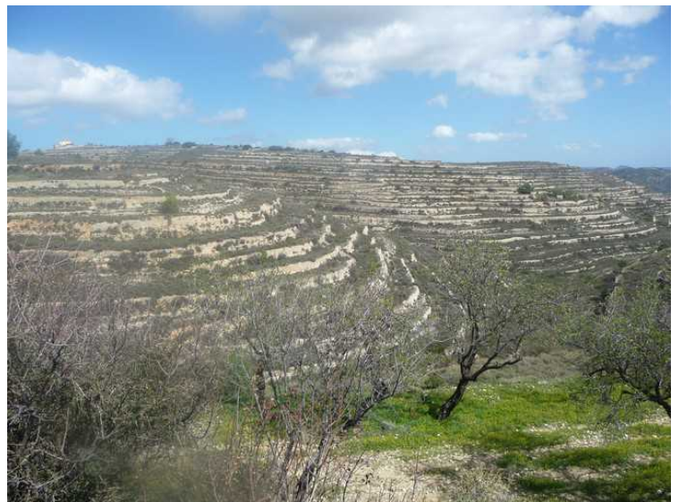
Terraces along the entire valley sides. It looks like natural terraces.