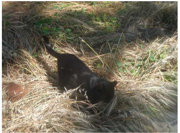
The hunt is over.