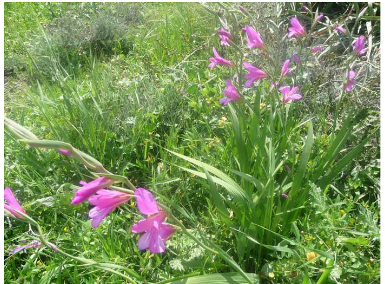
The 18 th of February we went for a walk along the coast again. At that time there were many flowers. More flower pictures follows.