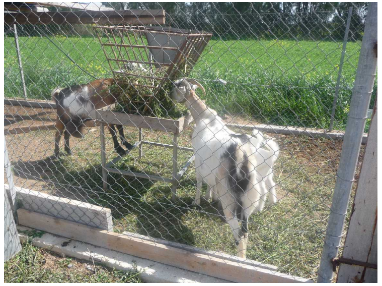
Here are the goats.