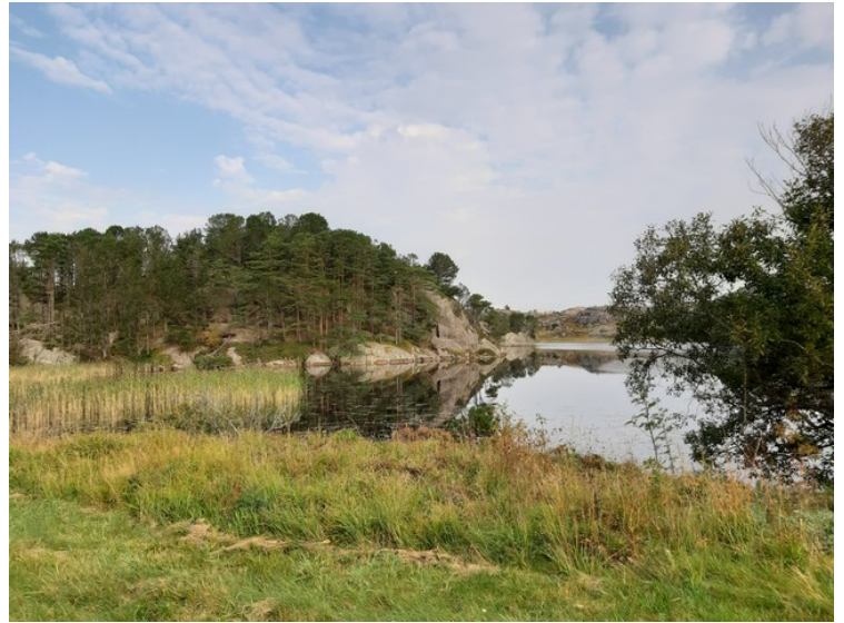
Some pictures from Stemmatvatnet after we drove by Sirevåg .