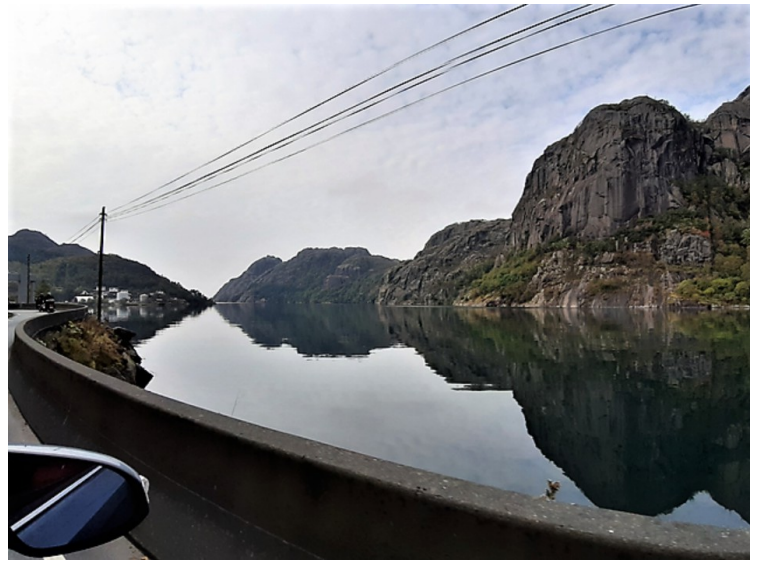
It was quiet on Jøssingfjorden this day.