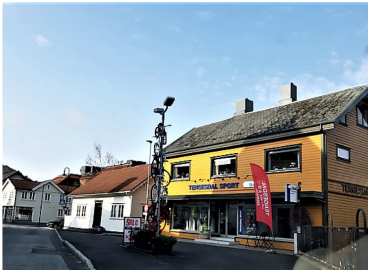
Tengedal Sport has set up an original eye-catcher, a tower of bicycles.