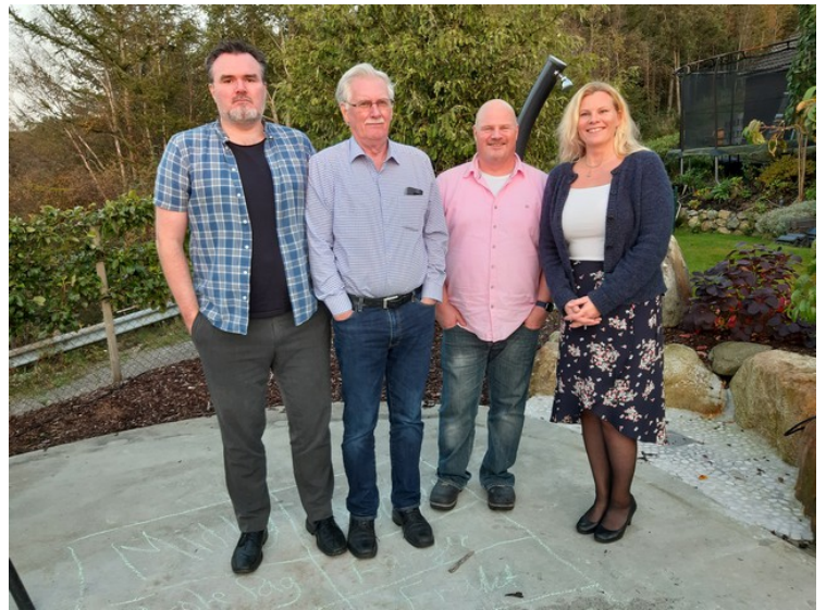
Me and the «kids».