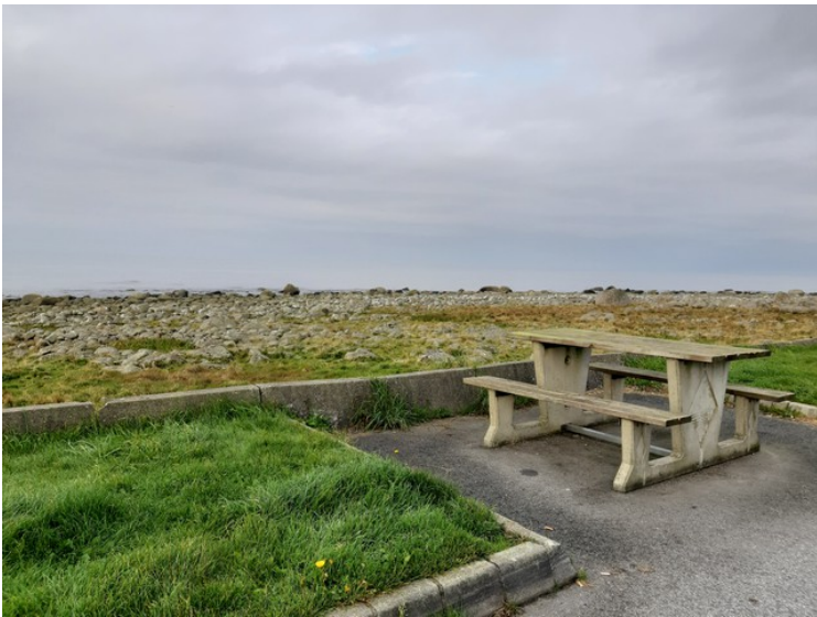
Here there are benches overlooking pebble stones and the North Sea.