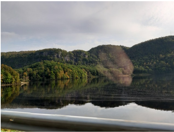
Skolandsvatnet right west of Lyngdal .