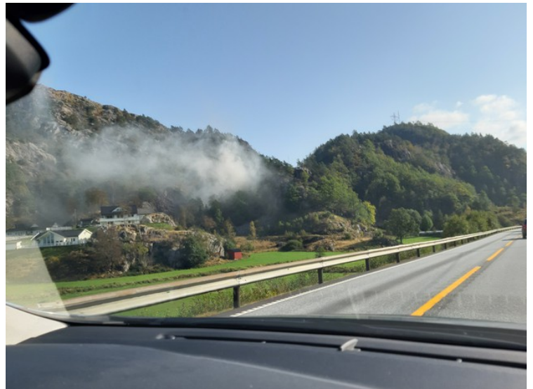
Then we were past Flekkefjord. It looked like there was smoke from something burning.