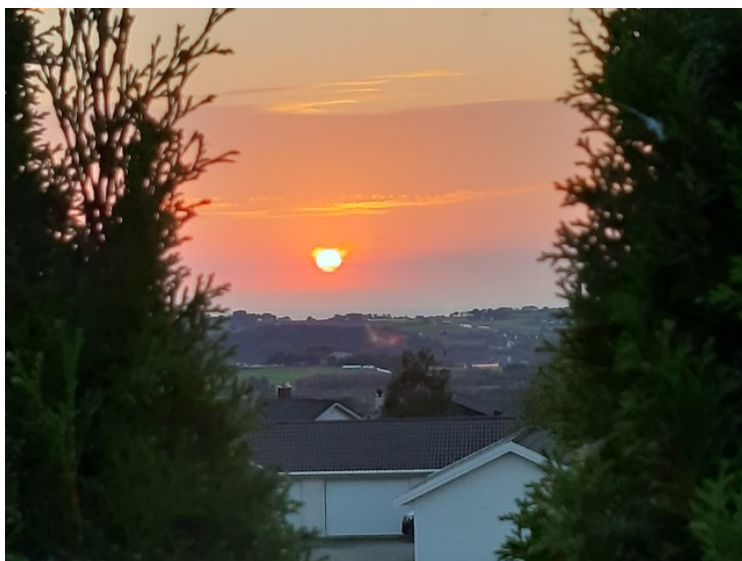
The sunset at Kvernaland .