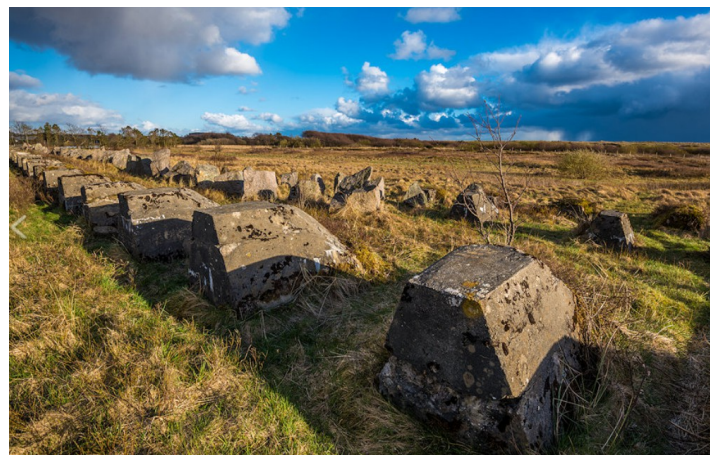
These Hitler's teeth are located along the road at Brusand . They were part of a fortification built under the auspices of Germany during World War II. The Germans feared an attack from the sea, and to stop Allied tanks, wide minefields were laid on the beach, and large boulders and concrete blocks were placed in several rows.