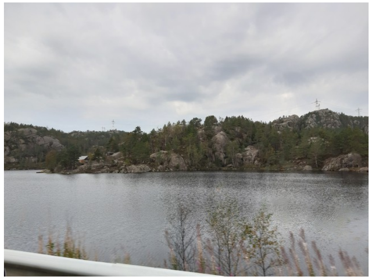
Store Hestesprangvann just before we come to Flekkefjord .