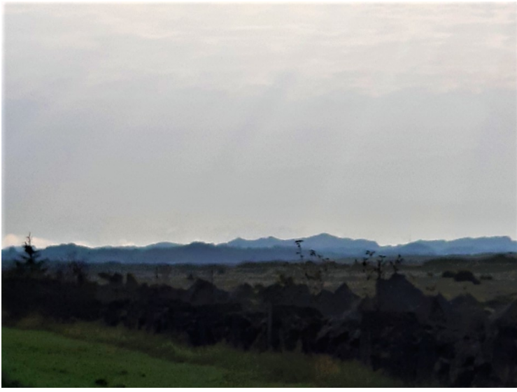
Once we have passed Ogna we come to Dalane . Dalane is the southernmost part of Rogaland .