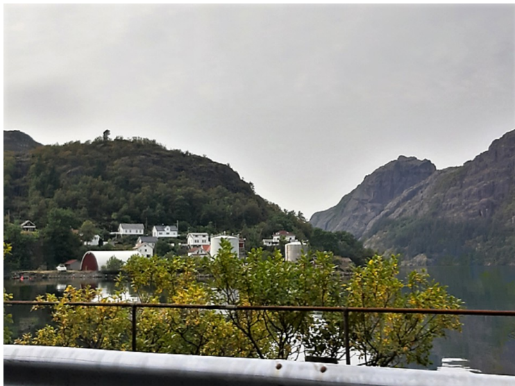
The small place Jøssingfjord is located by the fjord of the same name.