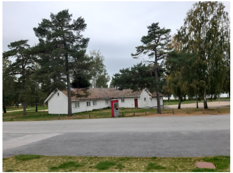
We could also see this big house.