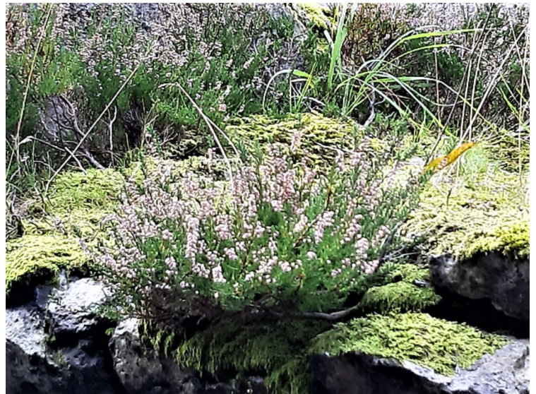
There are still plants that grow here, moss, grass and heather.