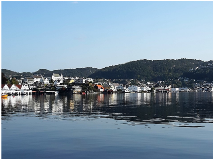
Here we come to Flekkefjord .