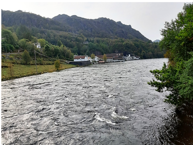
Sira flows down here towards Åna.