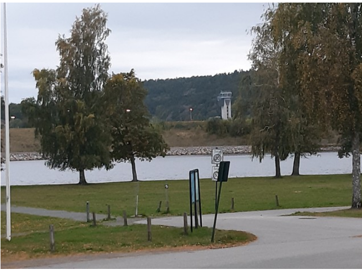
From the apartment we could see over the Tovdal river towards Kjevik Airport . The Topdal river flows into the Topdalsfjord to the left in the picture.