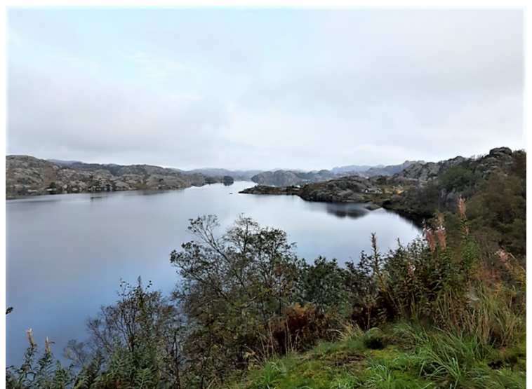
Right after Svåheia we came to Spjodevatnet. Some pictures from there.