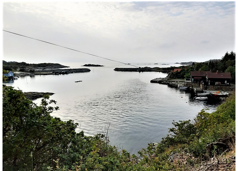
Nålaugviga. We see Ternholmen furthest away.