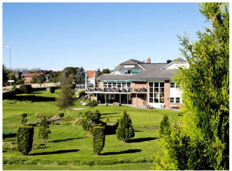
We stayed at Bryne Kro og Hotell in Bryne .