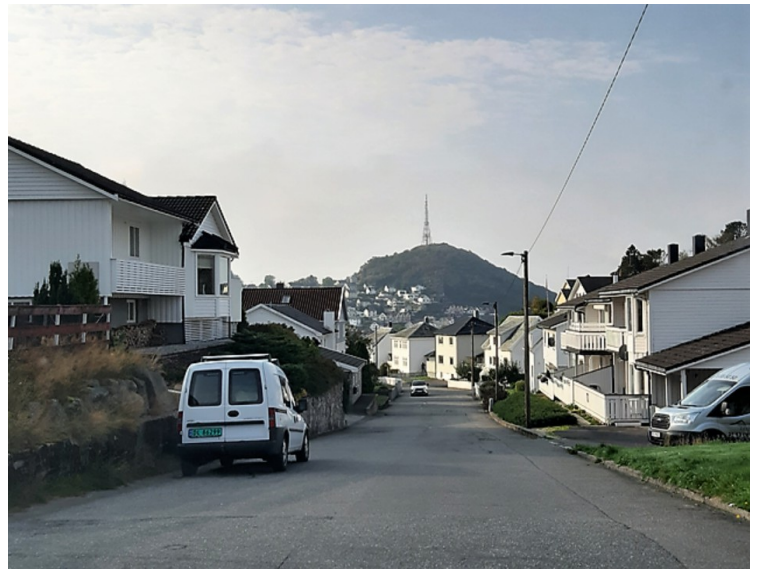
Here we are in Egersund . We have taken a small detour from the main road. Here we are on Hafsøyveien and looking towards Vardberg .