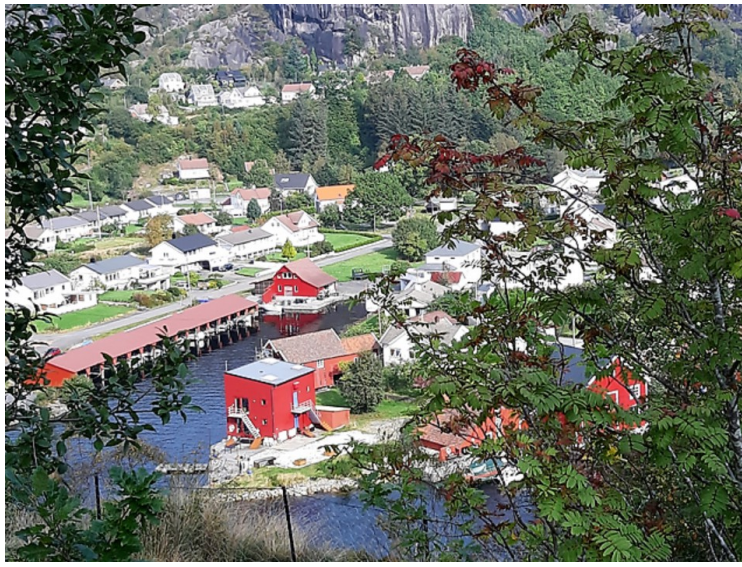
On the way up the hill we look back down towards Åna-Sira .