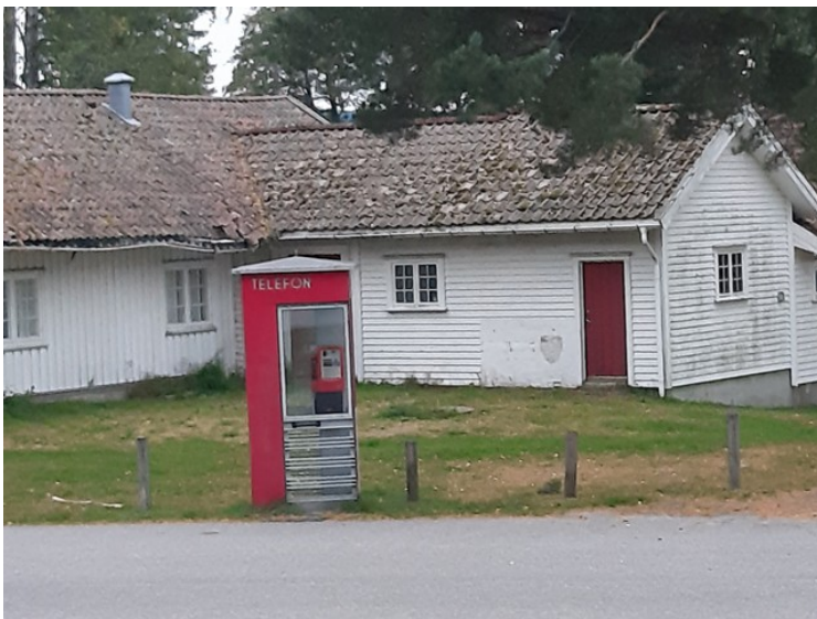
In front of the house there is a telephone booth.