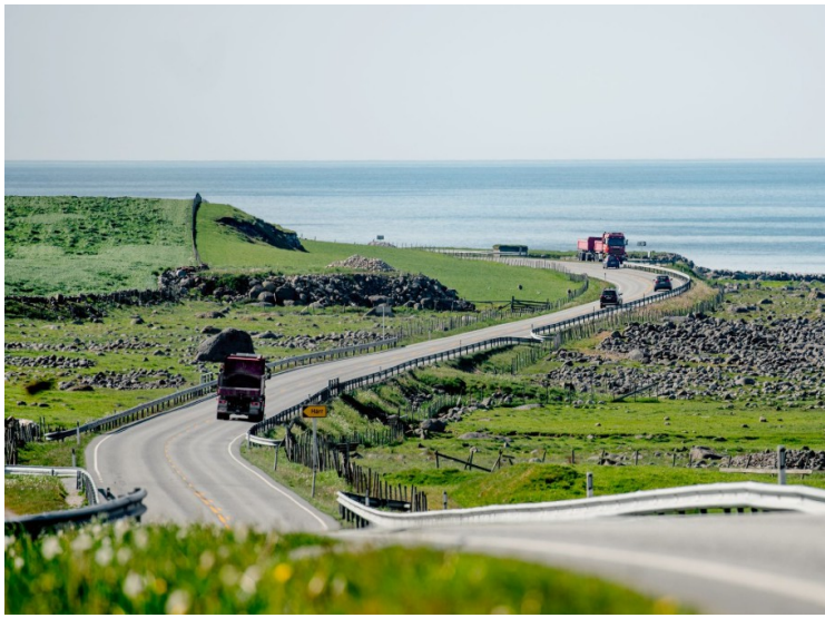
The next day we drove Riksvei 44 from Bryne to Flekkefjord. Here we come to Hårr, where there is a picnic area.