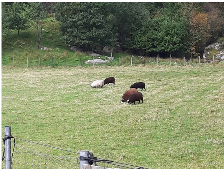
We had planned to see Ruggesteinen in Sokndal , but we found out that it was too far to walk, so we turned here by these happy tractor eggs .