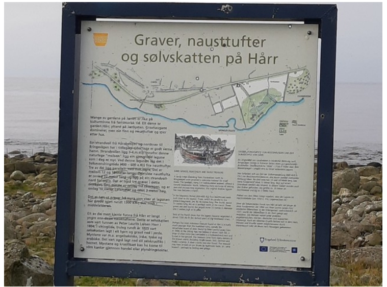
This sign is on the picnic area located by the National Tourist Route, Jæren . Link to description of the area.