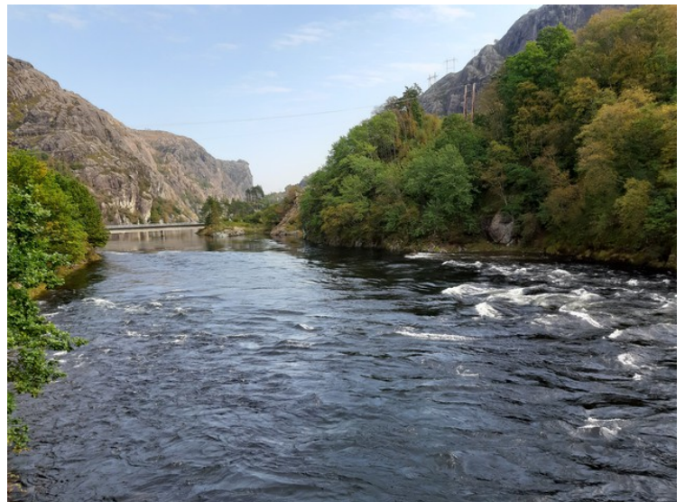
This is Sira or Sireåna which comes from Sirdalsvatnet and Lundevatnet and flows into the fjord called Åna . Here we look up towards Lundevatnet.