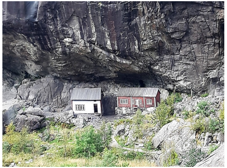
This is Helleren with houses from the 19th century. People have lived under this rock formation since the Stone Age. In 1865, 15 people, 5 cows, 12 sheep and a pig lived here. Then there were several operating buildings here.