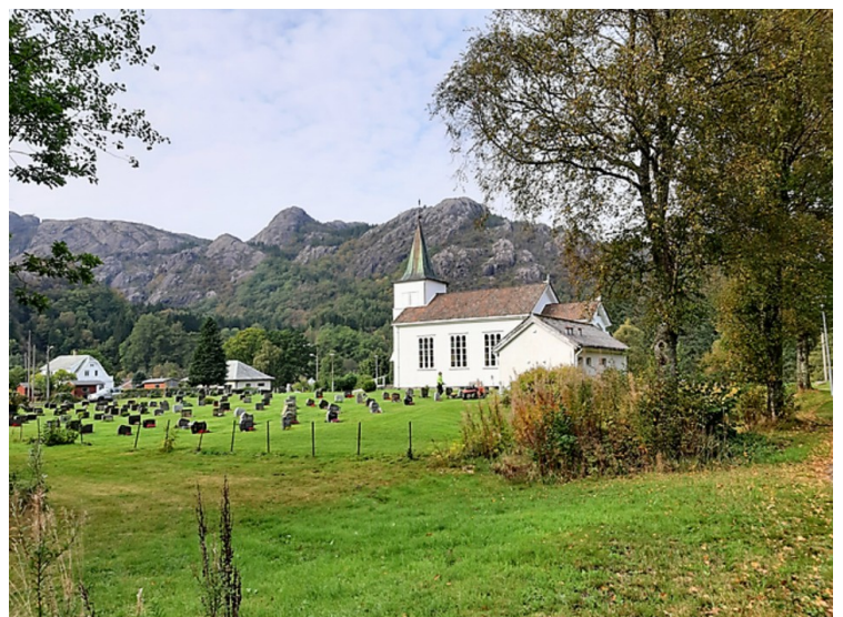
While we were standing there, we just as well took a picture of Åna-Sira church which is located by the river.