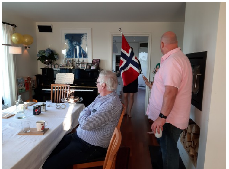
Me and the jubilant.