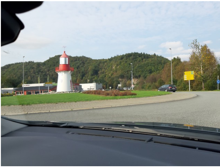
Then we have come to Vigeland . At the roundabout there is a lighthouse, which is a model of Lindesnes lighthouse .