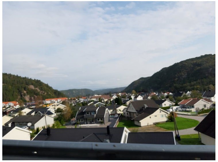
The center of Vigeland.