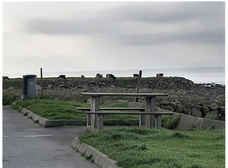
The cows thrive here.