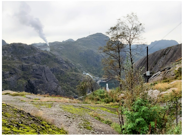
Here we see steam from Titania's plant.