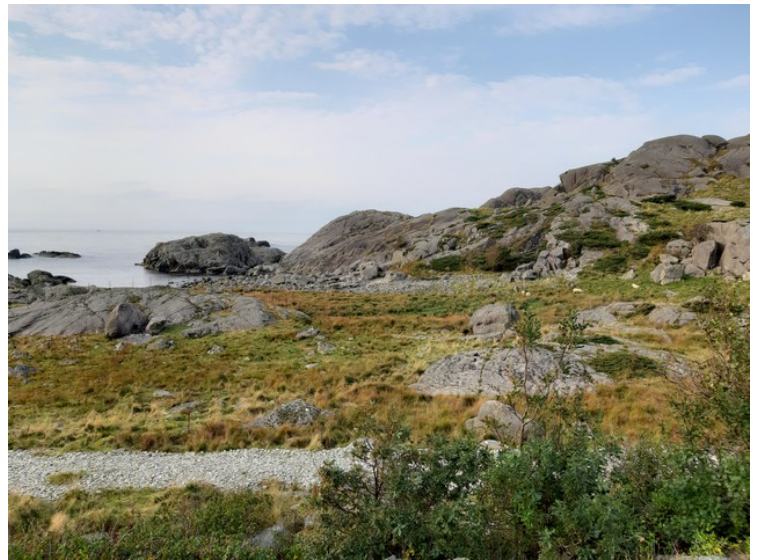
Here we have come a little further, to Moivika.