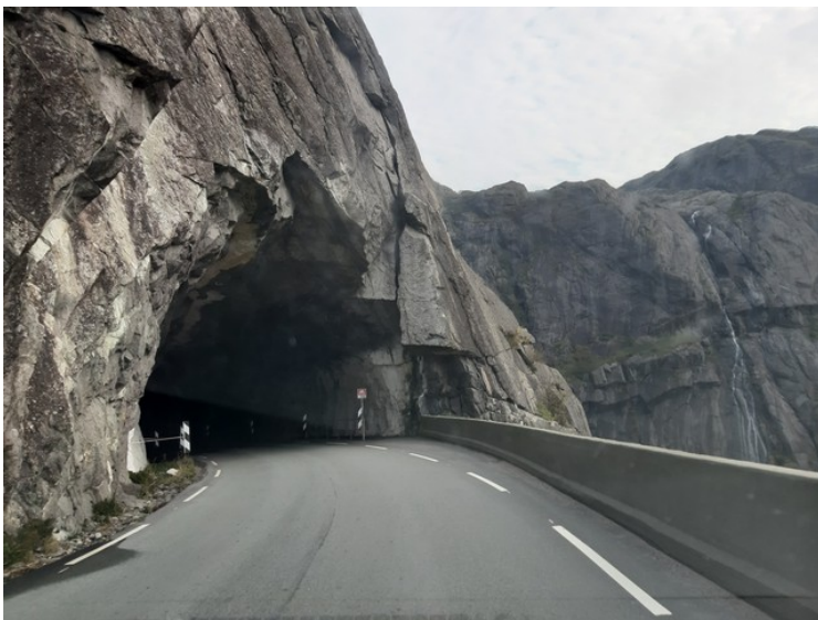
On the way further down we have to go through a tunnel.