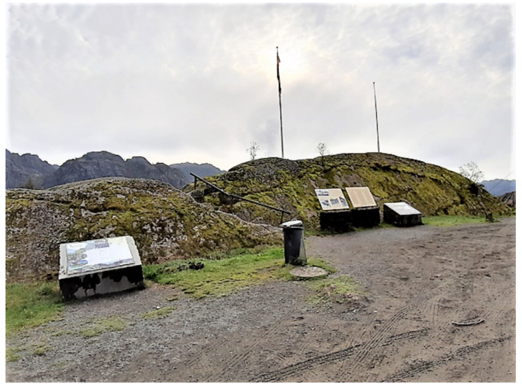
At the picnic area, there are posters that tell about the sights by the fjord.