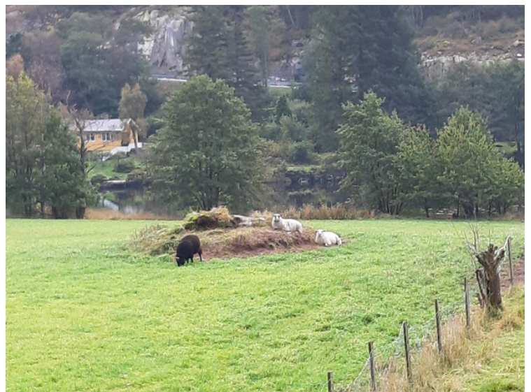
These sheep will eat 'tractor eggs' this winter.

The next stop is in the descent to Jøssingfjord , at a picnic area. Here we took some pictures of the view. This fjord is best known for Helleren with two houses that are situated underneath the rock formation, for the Altmark incident during the last world war and for Titania which extracts titanium ore.