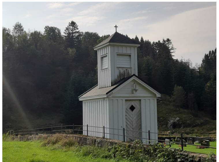
A small chapel at Kvanvik.