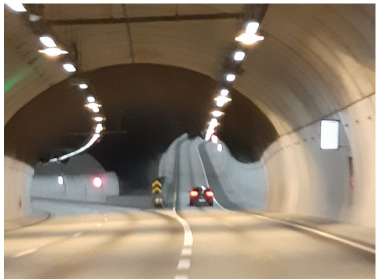
This is the Vestervei tunnel west of Kristiansand .