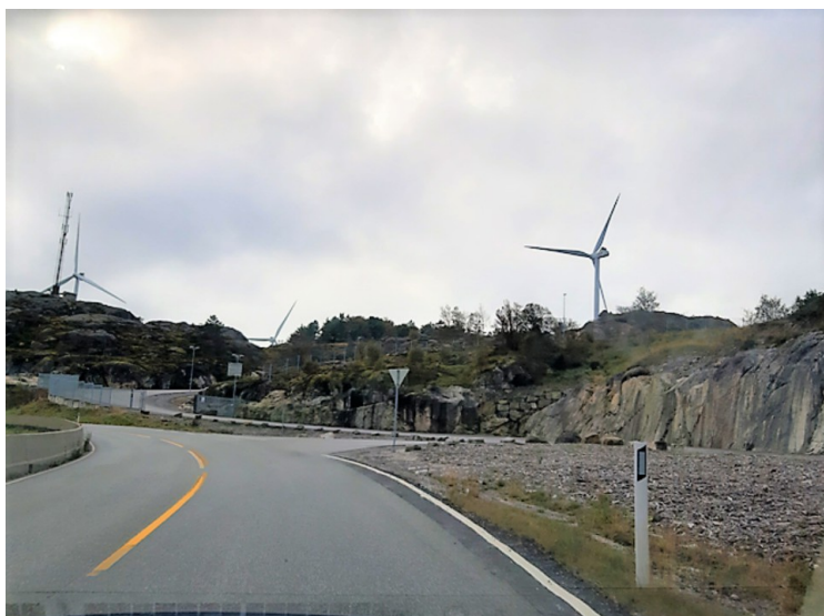
This is Svåheia Wind Turbines.