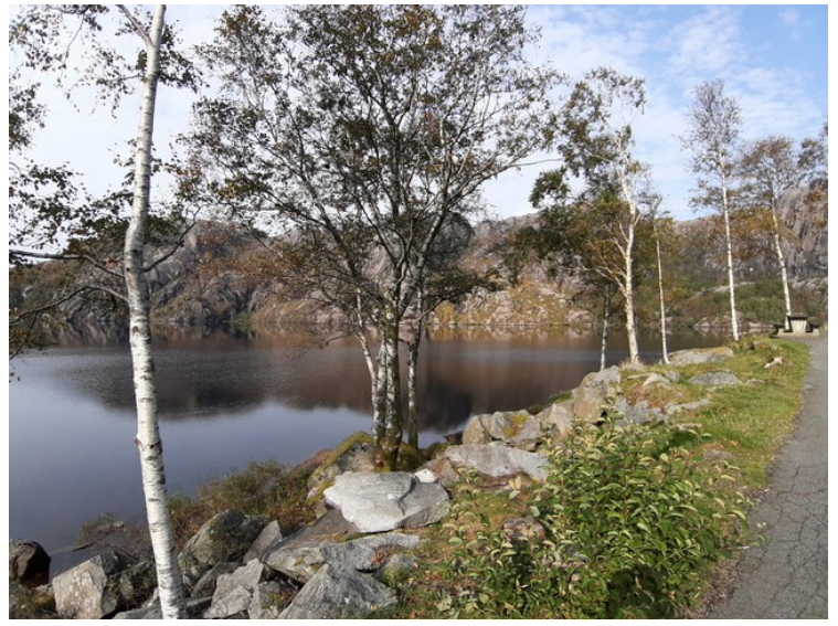
This is by Botnevatnet.