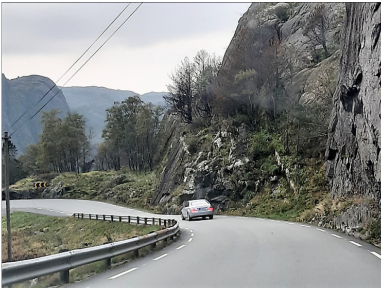
At the top of the slopes down to Jøssingfjord.