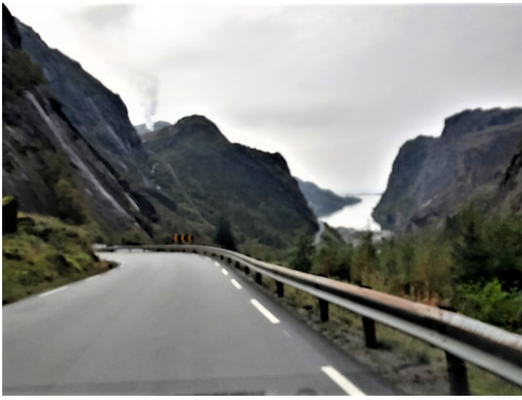
Here we look out over the fjord.