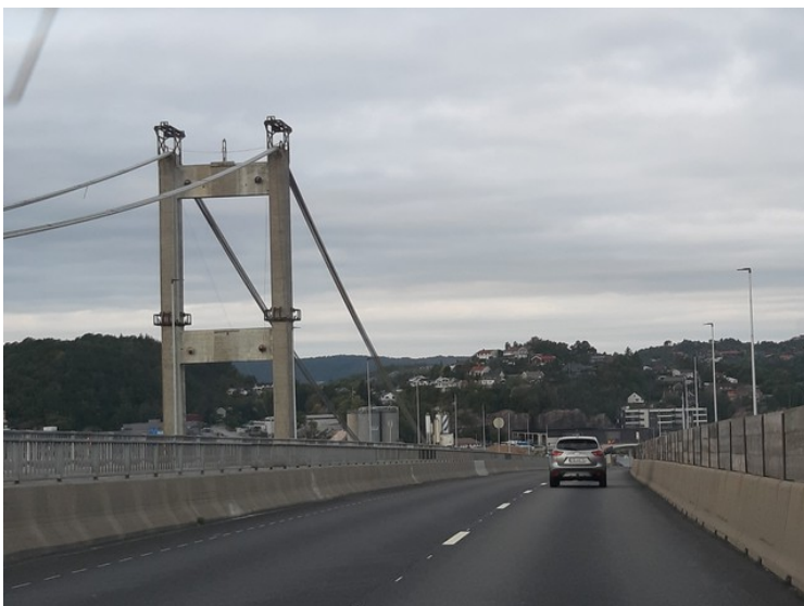
Then we drive over the Varodd Bridge . The first bridge came in 1956 and replaced the ferry connection across the Topdalsfjord. The last bridge came in 2020. Now there are a total of 6 lanes.