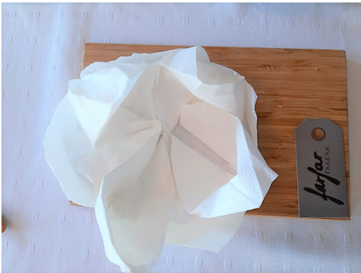
Then we are in the birthday party.