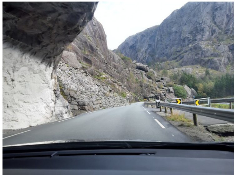
Out of the tunnel.