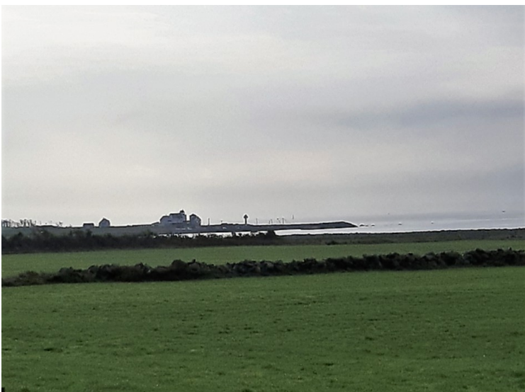
We see Kvasseheim Lighthouse in the distance.