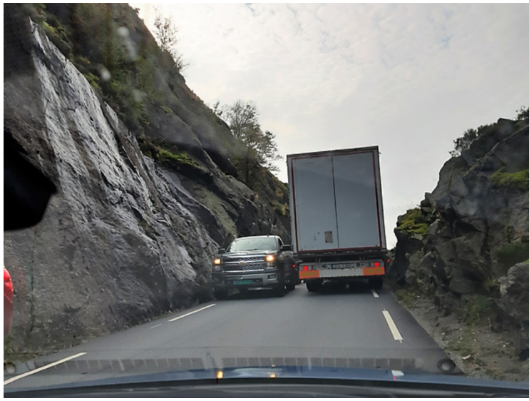
The road further along the fjord is so narrow that it is difficult for a car and a truck to pass each other.