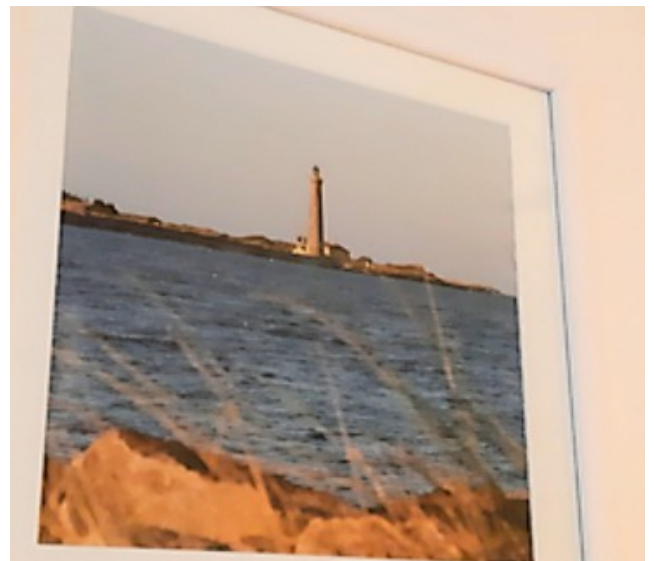
A picture of Oksøy lighthouse inside the apartment. Oksøy lighthouse is located outside Kristiansand.