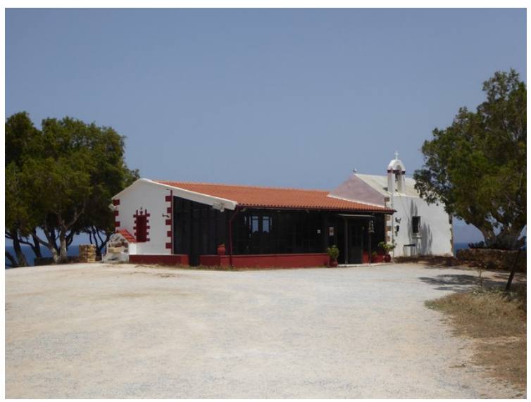
A couple of pictures of the church.