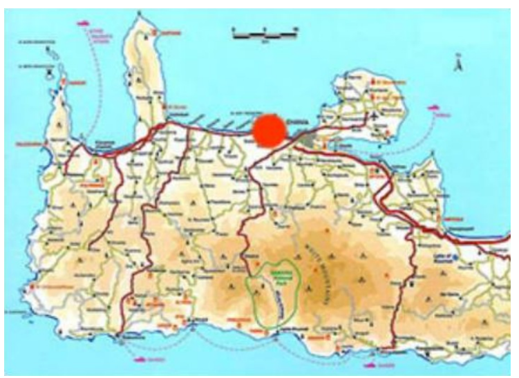
Map of West Crete. The red spot shows where <u>Agii</u> <u>Apostoli</u> is located. The airport is also displayed.