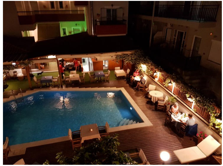
The restaurant and the pool seen from our apartment in the evening.