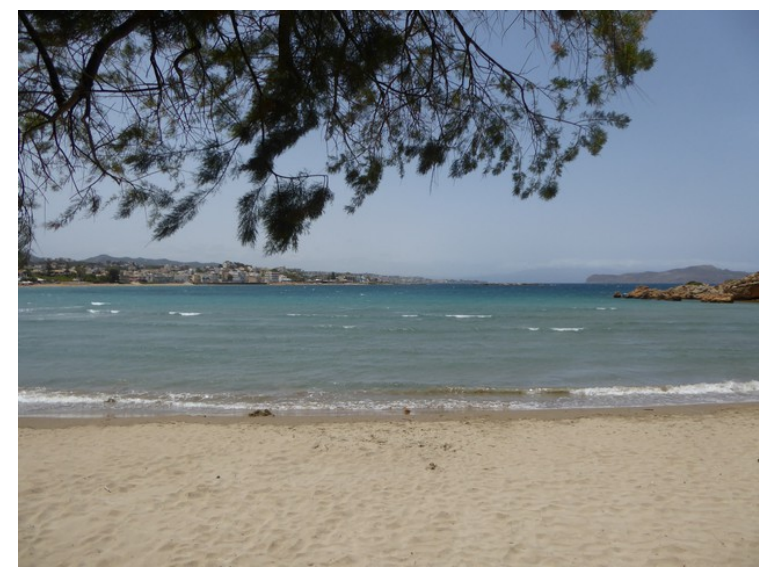
The Glaros beach.