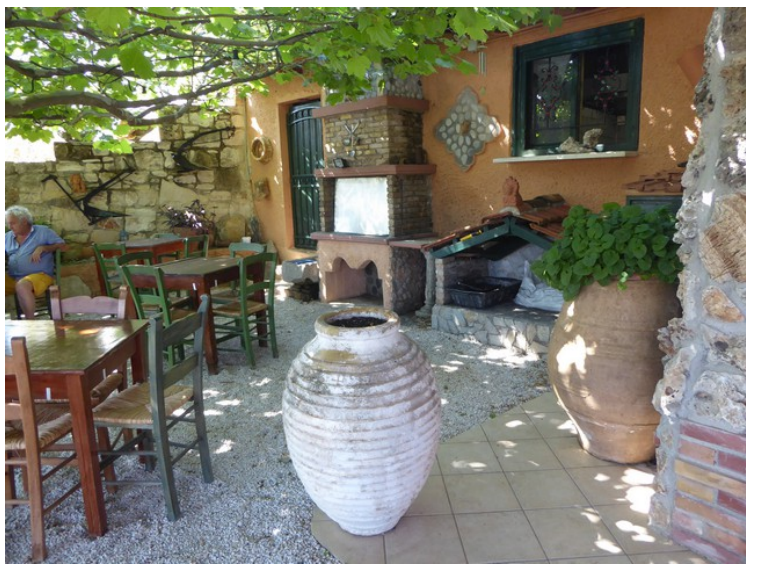
In the the restaurant yard they have various old objects.