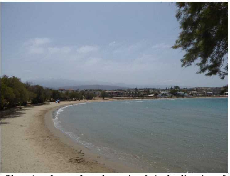
Glaros beach seen from the peninsula in the direction of Agii Apostoli.