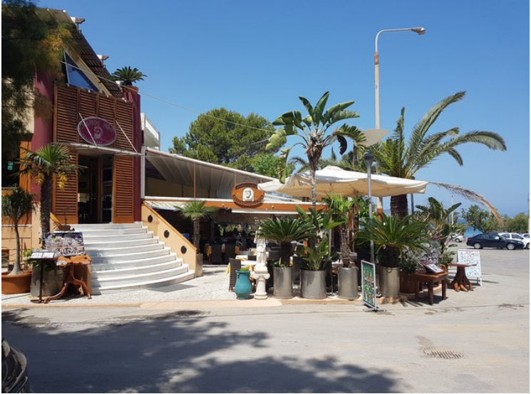
We ate a couple of times at this restaurant which is just beyond our hotel, in the direction of the beach. It's called <u>Xenios Dias</u>, and is ranked 11th in 14 restaurants in Agii Apostoli. We noticed the difference in relation to the food at Talos.