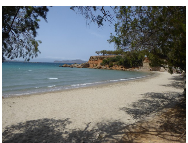
Glaros beach is west of the peninsula. We see the peninsula on the right in the picture.