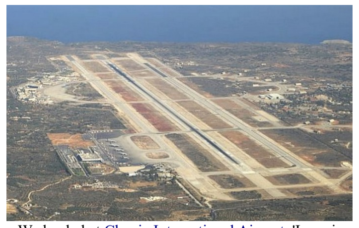
We landed at Chania International Airport, 'Ioannis Daskalogiannis' located at Souda Bay. The airport is named after Ioannis Daskalogiannis, a rebel from Crete who fought the Ottoman Empire in the 18th century. The airport is also used by the Greek Air Force, and by the United States. The Norwegian F16 unit for air operations in Libya in 2011 was stationed here.

We were very pleased with this hotel. It had nice rooms, good food and very good service. We will certainly be using this hotel several times.