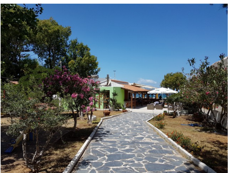
We had lunch once in this restaurant. It is located a little further west and it is called <u>Siroccos Restaurant</u>.