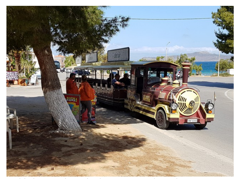
This is a tourist train that operates along the coast west towards Afrata and into the island as far south as Meskla and Therissos. They hat 7 different routes.