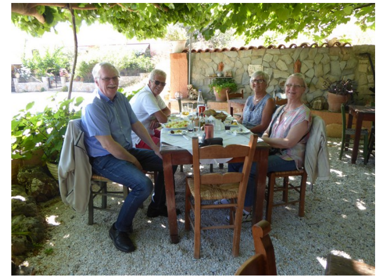
One of the guests at the restaurant took a picture of us all. I took a picture in through the door into the restaurant.