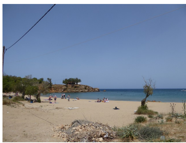
This is the Iguana beach which is located east of one of the peninsulas in the area. On this peninsula there is a church called the Church of the Holy Apostles (Agii Apostoli). It has given the place the name.