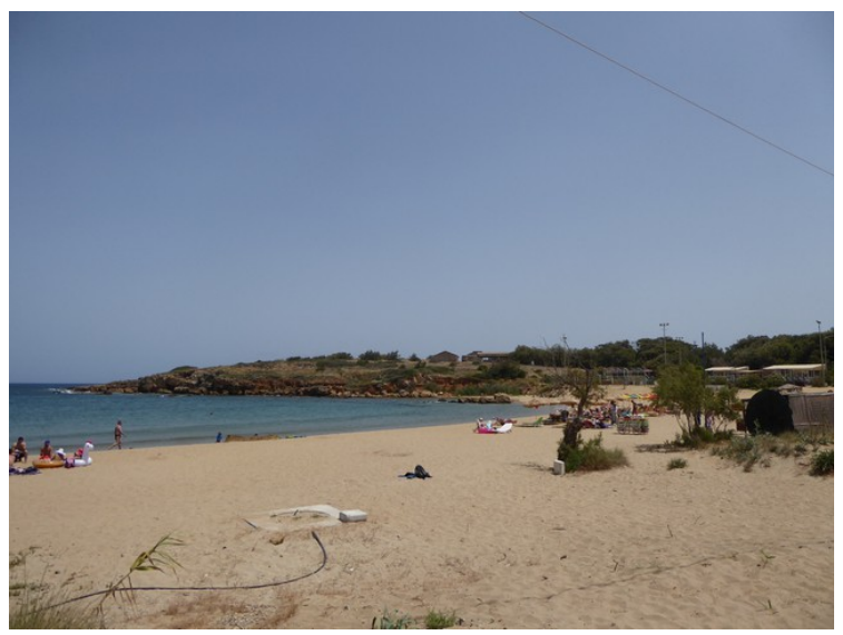
The Iguana beach looking eastwards.