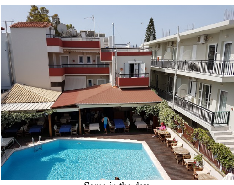
Same in the day.