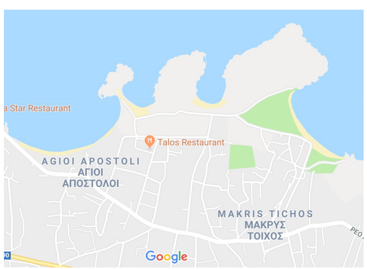
A more detailed map showing where the hotel is located. The hotel is called <u>Talos</u>.

The hotel is quite simple but OK. According to <u>TripAdvisor</u>, it is rated as number 14 of 33 accommodations in the area. We thought it was nice to stay there for a week and it was peaceful without disturbing noise of any kind. We ate mostly at the restaurant in the hotel. They had very good food there, and according to <u>TripAdvisor</u>, the restaurant is ranked number 1 of 14 restaurants in the area.