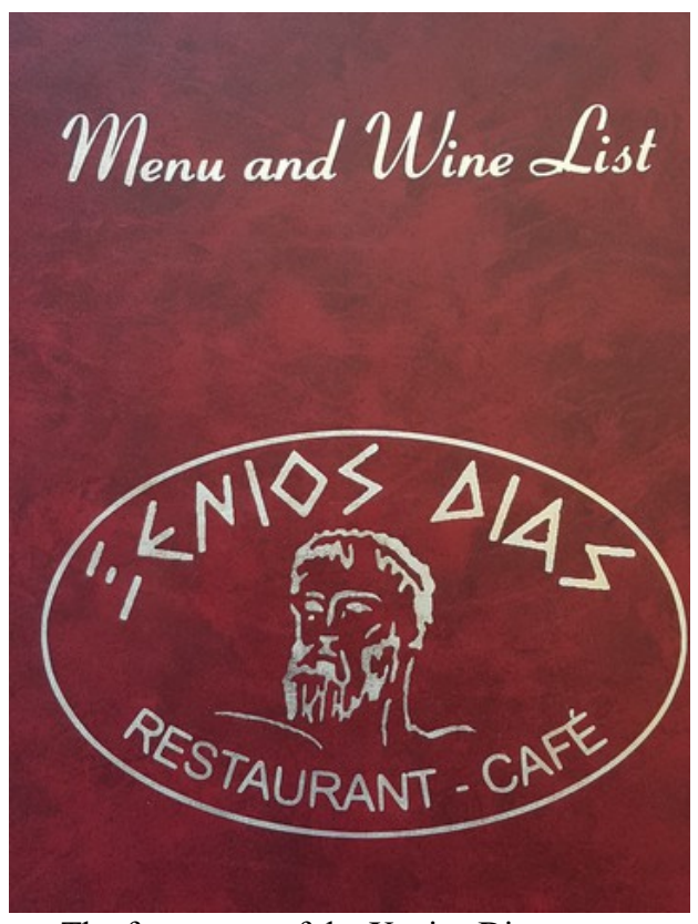
The front page of the Xenios Dias menu.