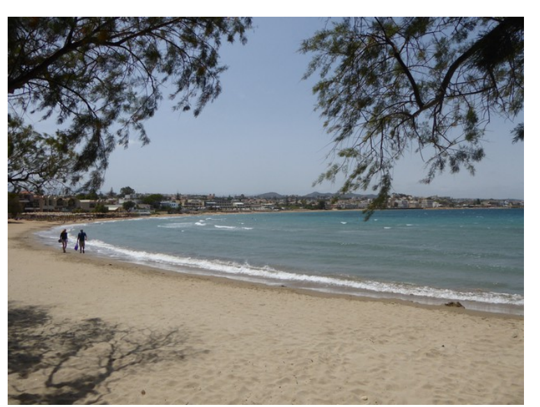
Same beach seen westward.