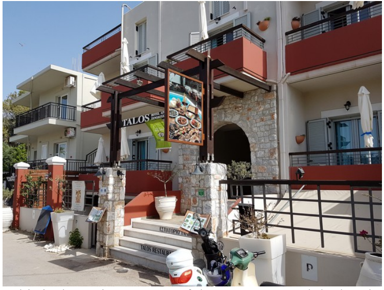
This is the main entrance of the restaurant and the hotel.