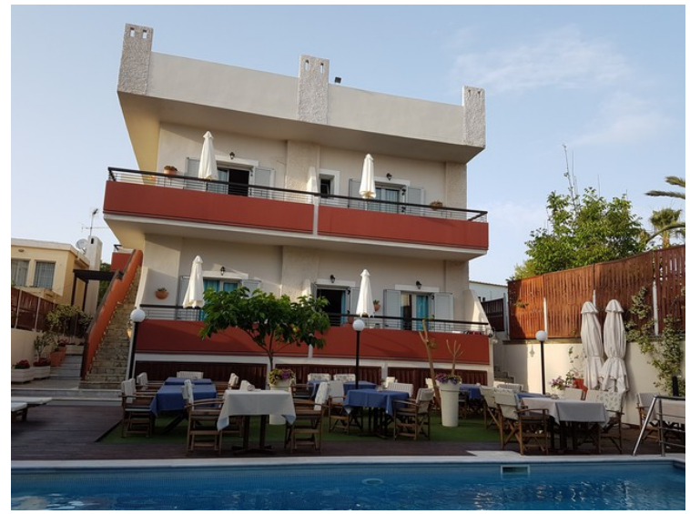
The building where we stayed seen from the restaurant. Our apartment was on the top left.

The hotel is quite simple but OK. According to <u>TripAdvisor</u>, it is rated as number 14 of 33 accommodations in the area. We thought it was nice to stay there for a week and it was peaceful without disturbing noise of any kind. We ate mostly at the restaurant in the hotel. They had very good food there, and according to <u>TripAdvisor</u>, the restaurant is ranked number 1 of 14 restaurants in the area.