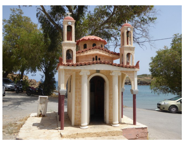
This is at the start of the peninsula.