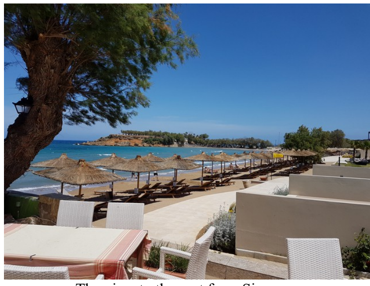
The view to the east from Siroccos.