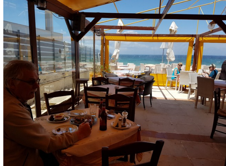
Here I'm lunching at Sirocco's Restaurant, which is ranked number 5 of 14 restaurants of <u>TripAdvisor</u>. All right food.