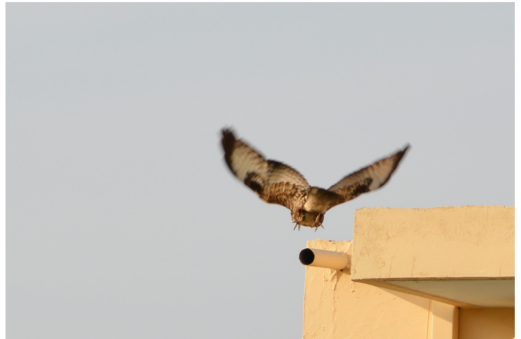
Here it certainly discovered something, and flies away.