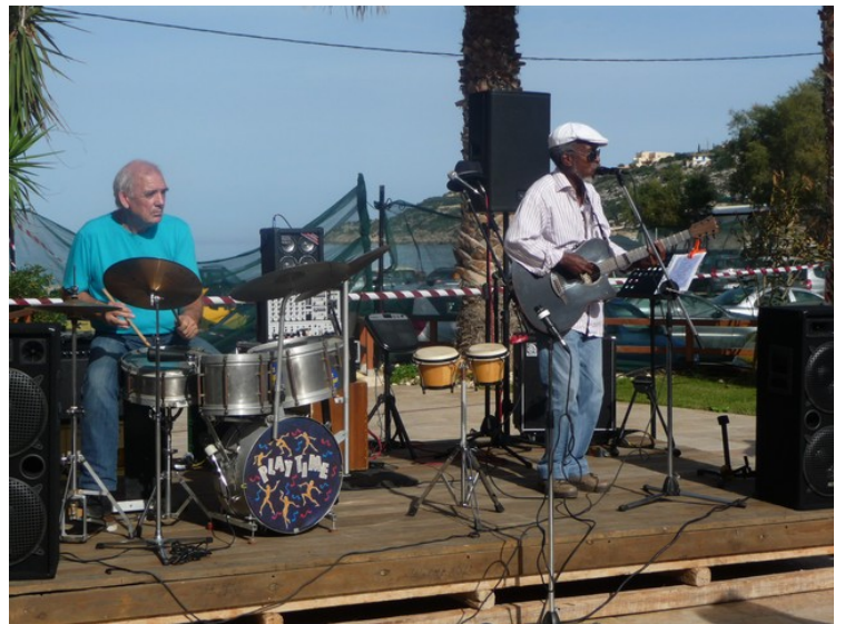
Two guys playing old reggae music that was popular 50 years ago.