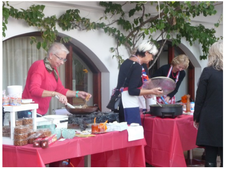
Here Asian food is wokked.