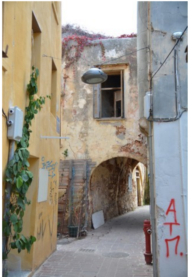
Below follows street pictures from the The Distrikt of Splanzia .