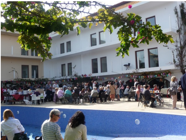
The pool area.