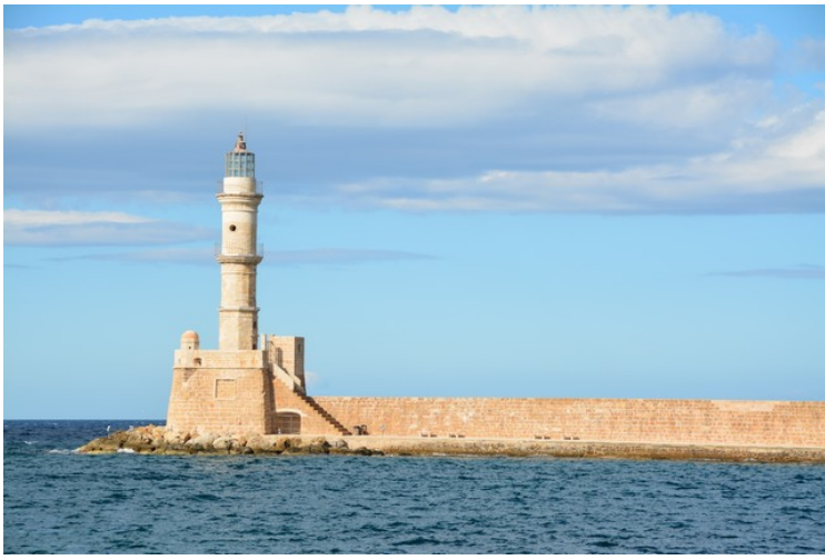
The Lighthouse seen from another angle.