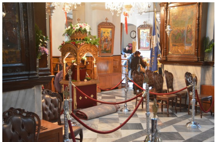
Inside the church.