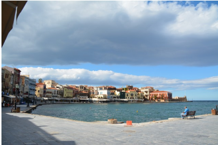
The harbor. Link to a description of the harbor area.