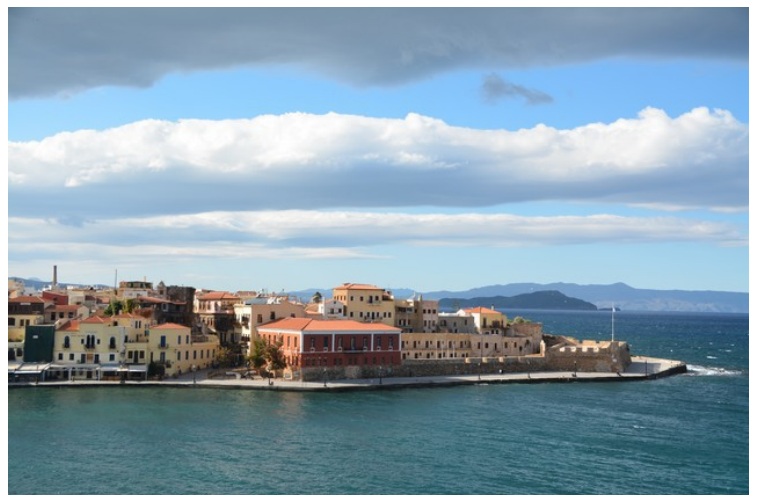
View across the harbor to Firkas.