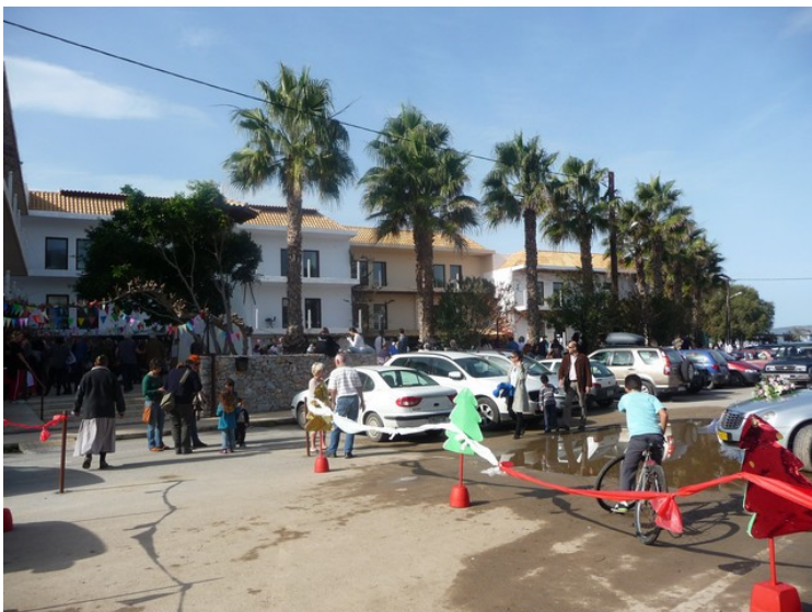
The Parking lot between Almyrida Residence Hotel and Almyrida Beach Hotel was full with cars.