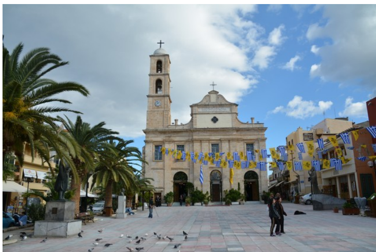
Atinagora Square with Trimartyri church at the rear. Is described in section 1 and 2 in the following link .