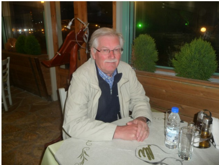
On November the 14 th , we went to eat at a restaurant called Makis Taverna . Here we have ordered and waiting for the food.