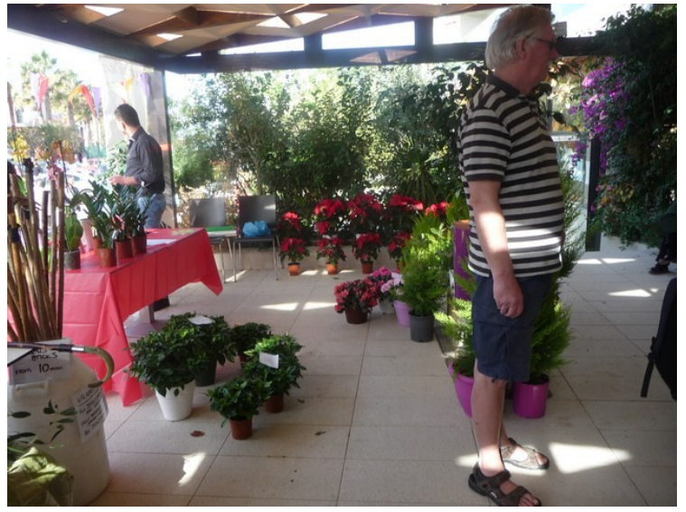
The market is indoors in Almyrida Residence.