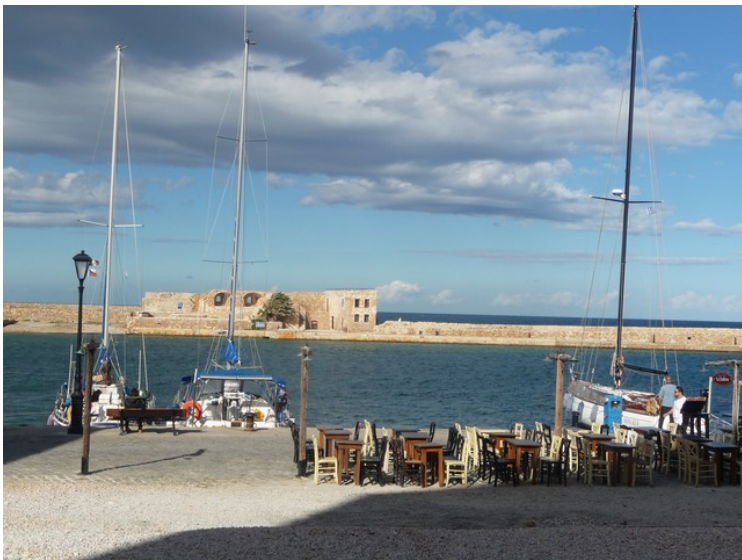
More boats in the marina. Looking across to the San Nikolaos bastion.