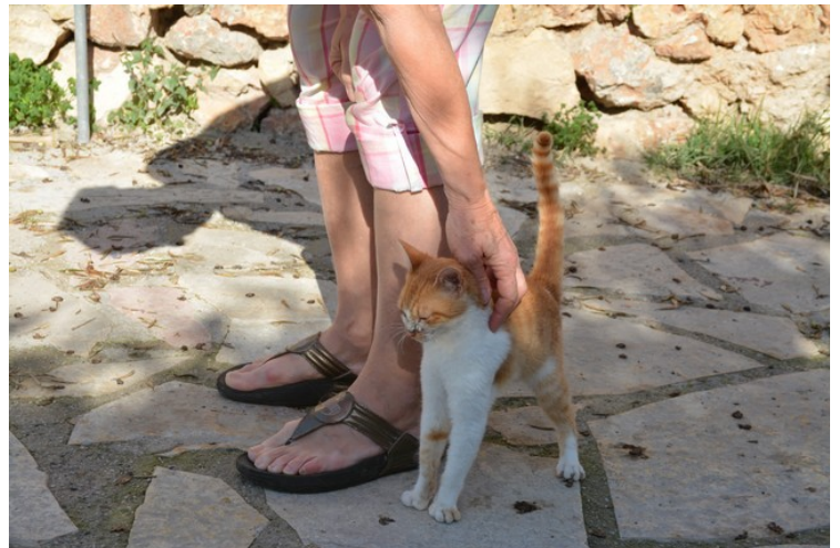
A small kitten also appeared. It was with us for a while when we were looking around, but when we went back where the small dogs kept guard, it didn't dare to go farther.