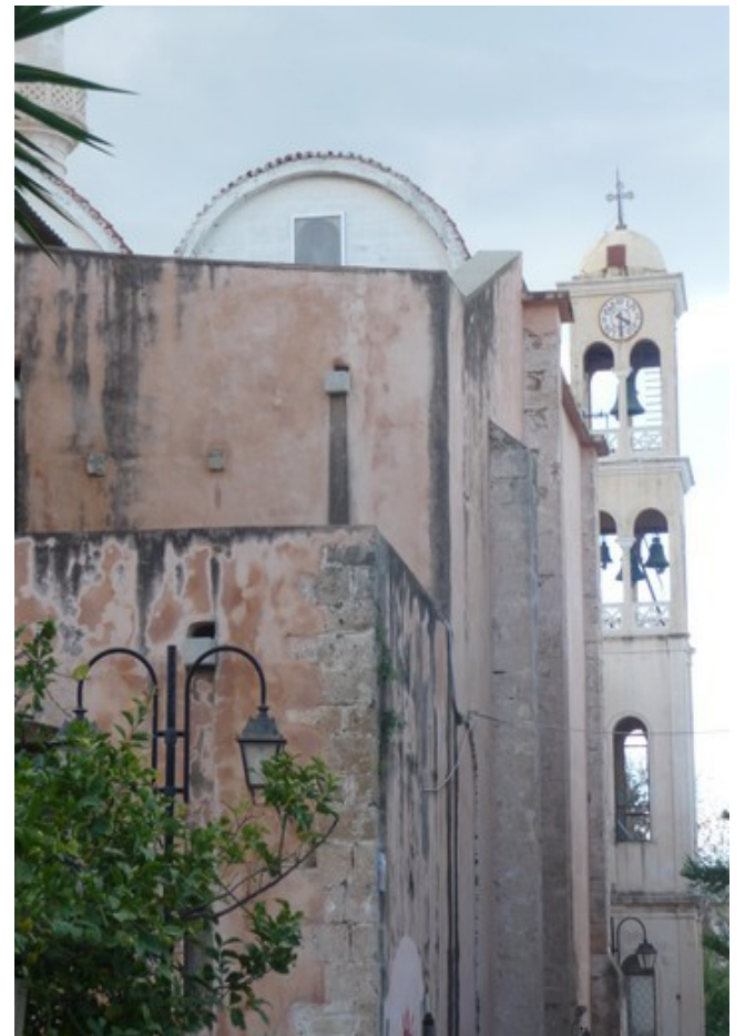
The back of the church / monastery.