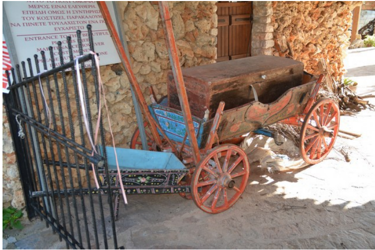
An old wagon in the gate.