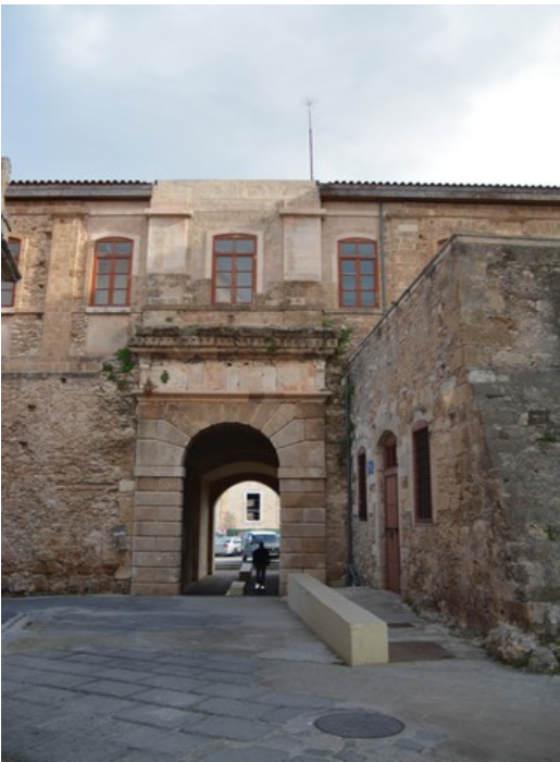
Here we have gone through the gate and are looking back.