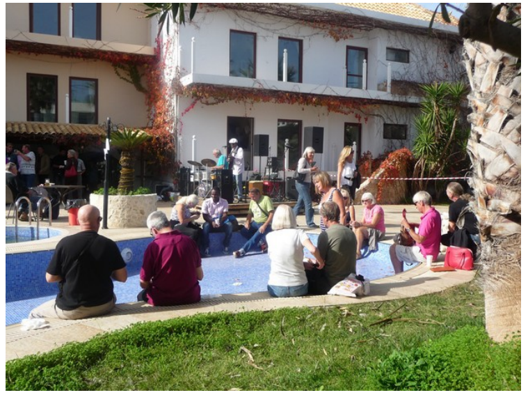
Since all tables and chairs were occupied, we sat on a low wall near the pool, but there were also many who sat on the poolside.