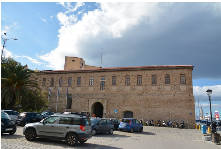
This is The Grand Arsenal . To get to the donkey stairs we went through the large opening in the middle.