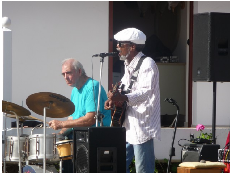
Drums, guitar and vocals.