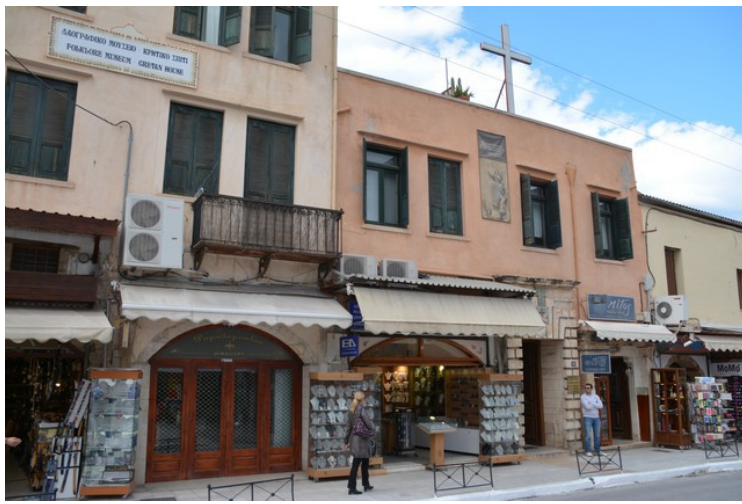
Inside this quarter is the Roman Catholic Church. Are described in section 4 in the following link .