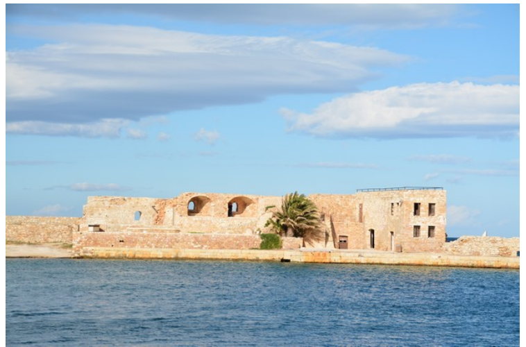
The San Nicolaos bastion.