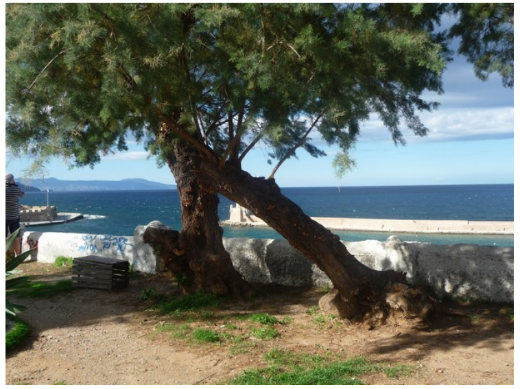
A couple of picture looking towards Firkas.