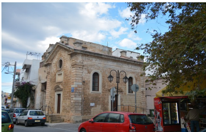
In northeastern corner of the square stands the San Rocco Church. Described in pt. 41 in the following link .