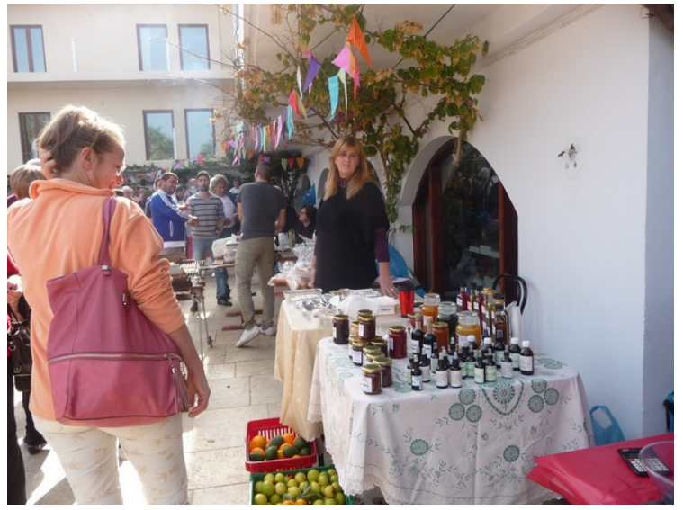
Fruit and jam.