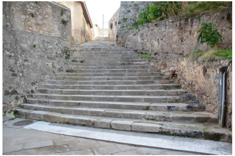
The donkey stairs. Described in pt. 17 in the following link .