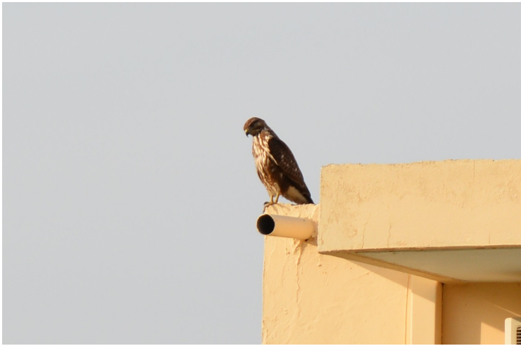
On November the 28 th , we saw the buzzard again. He was sitting on the same roof as last time, on the house next door, looking for prey.