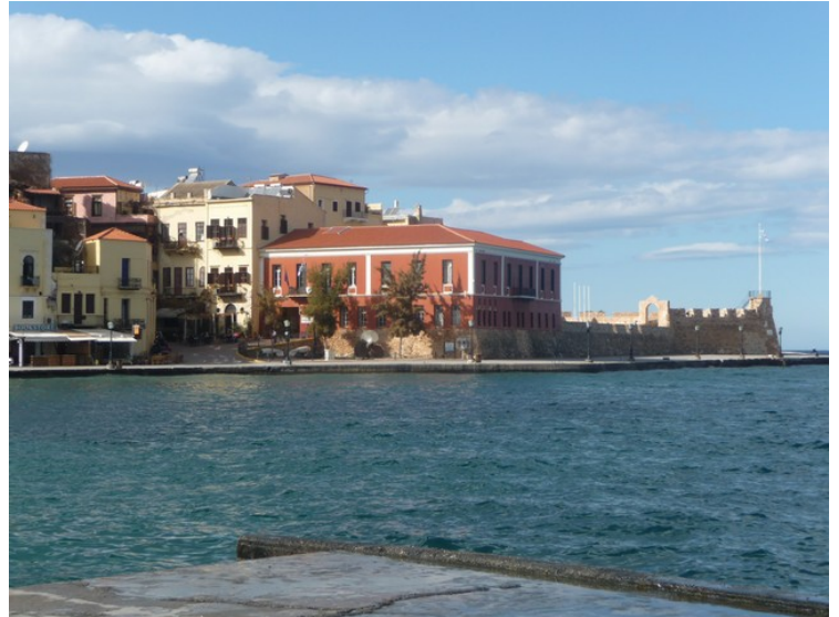
Furthest out we see Firkas fortress and towers.