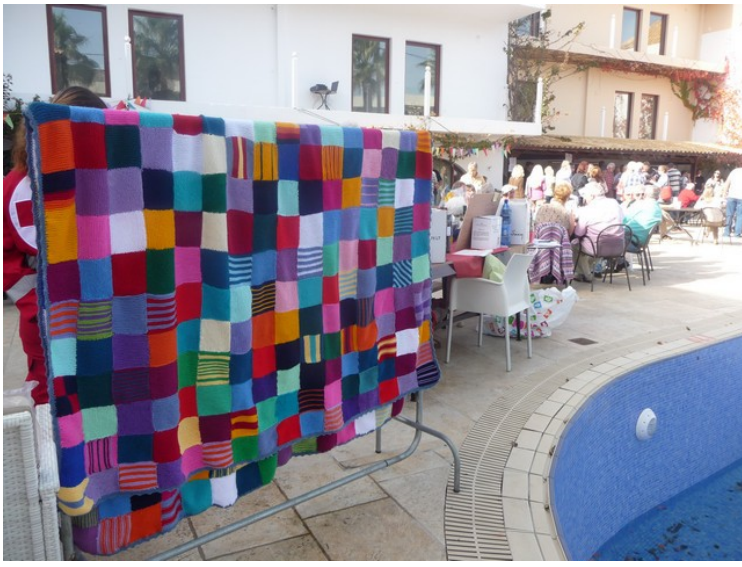
Also other things are sold here, not just food. Here are blankets / plaids.