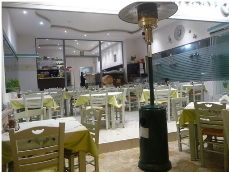
We were a little early and were the only guests in the restaurant, but not many people live here in the winter and most restaurants are only open in summer.