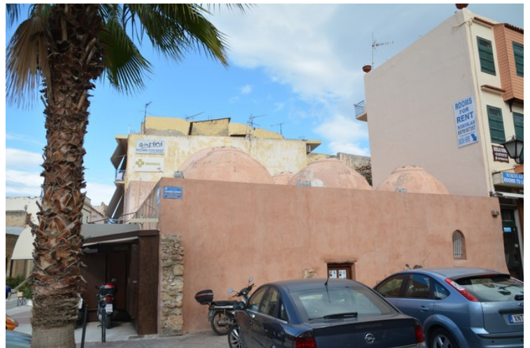
On the 21 st of November, we took a new sightseeing trip to Chania. This time we walked along the harbor and in the Splanzia district.