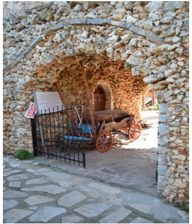
The main entrance.