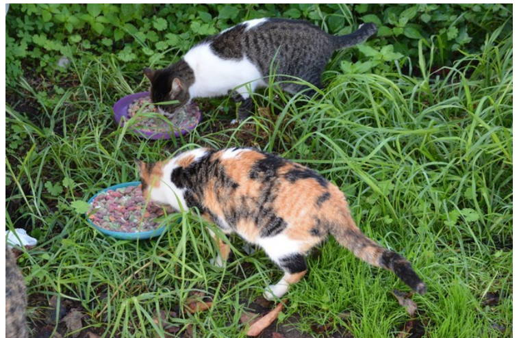
Some of our neighbors feed a herd of cats. They are wild cats and they are fairly shy, but they are starving, so they come when there is food to get.