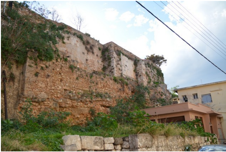
Here we are down again from the hill and are looking at some of the wall.