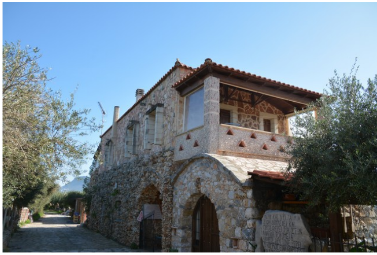
The main building.