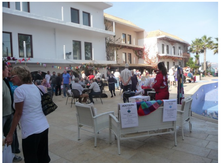
It is set up tables and chairs by the pool, and here is full of people.