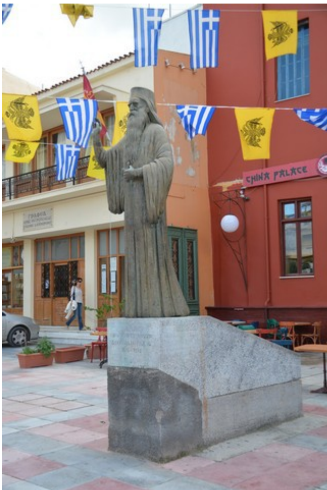
Ecumenical Patriarch Atenagoras I , Patriarch of Constantinople 1948-1972 as the square is named after.