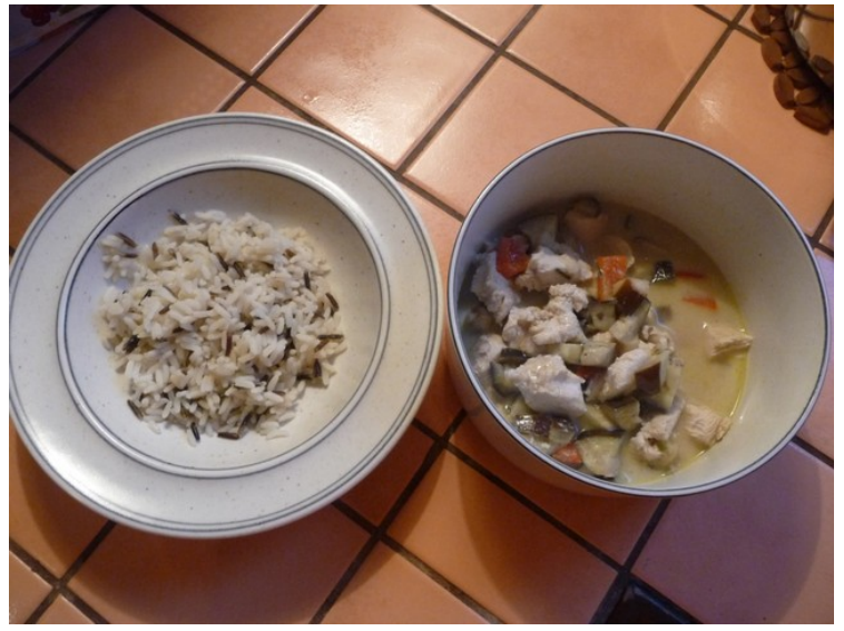
On the 26 of November we made a Thai dish for dinner, "green curry soup." It does not look so interesting on the picture, but it's really good! The recipe.