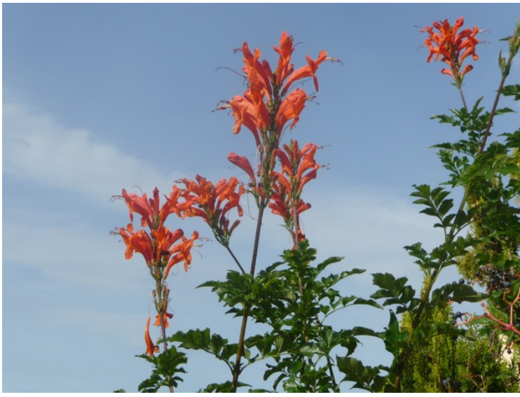
On November the 30 th , we went for a walk down to the village to have a look at the Christmas market , but first a picture of flowers on the other side of the road where we stay.