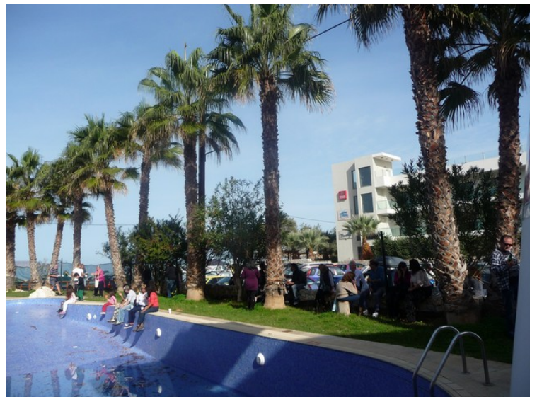
The pool at the Almyrida Beach is empty now in the winter, and the hotel is closed, but they have opened up the pool area for the market.