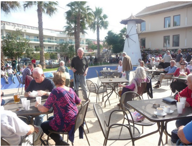
All the tables and chairs are occupied.