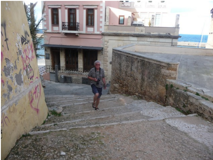
Here I'm on my way up the stairs.