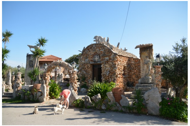
The dogs are following us.