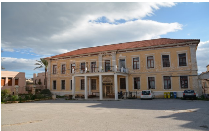
Up here is also The New Government House which was built in 1898 by France, Britain and Russia after the Turks were driven out. A description in pt. 16 in the following link .