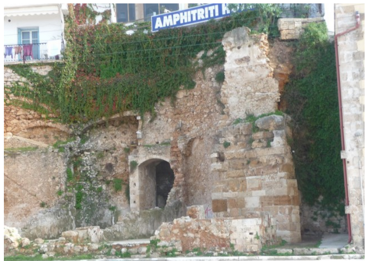
Ruins after the bombing during WW2.