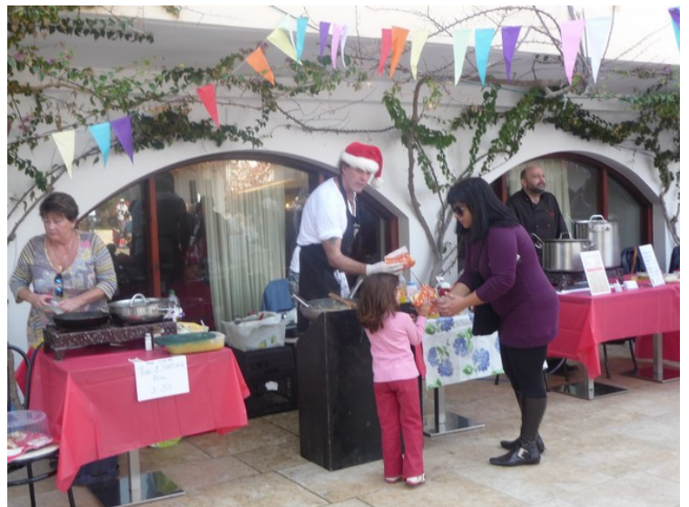
Outside Almyrida Beach is sold various food.