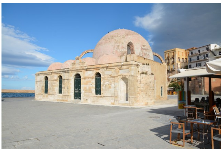
The Turkish mosque, Giali Tzamissi , meaning the mosque by the sea, was one of the first that the Turks built when they took over power. It was quite destroyed during the WW2, but it is built up again.