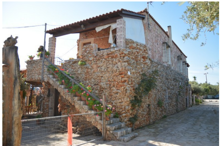
Stairs of stone.

Below follows more pictures from the site.