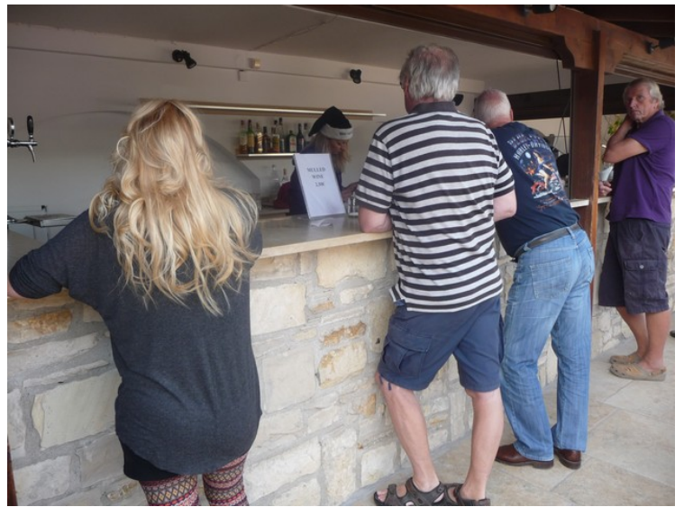
I buy a couple of beers at the bar.