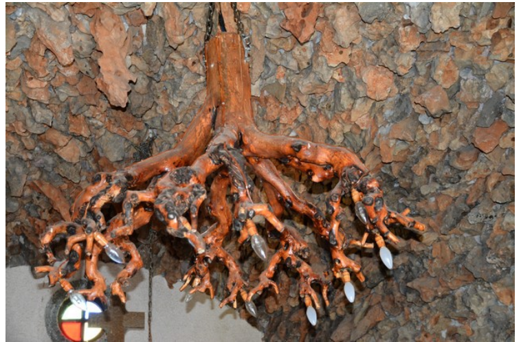
Inside the chapel there is made a lamp of a tree root.