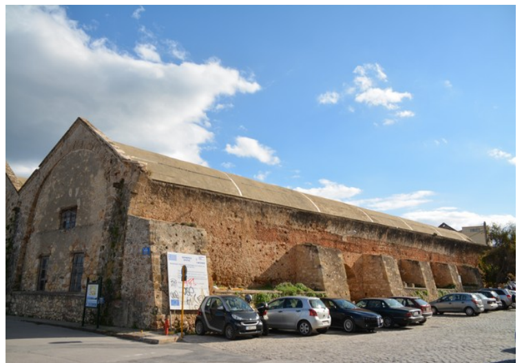
So we've gone down to the harbor again. This is Arsenali that the Venetians built in the 1400s. The 7 buildings were open at one end and was used for shipbuilding and repair. They were 50 meters long and 10 meters high. The ships could be drawn into it, you could work under cover. Discussed in section. 19 in the following link .