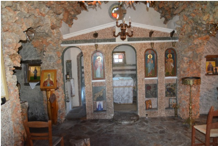
Inside the small chapel.