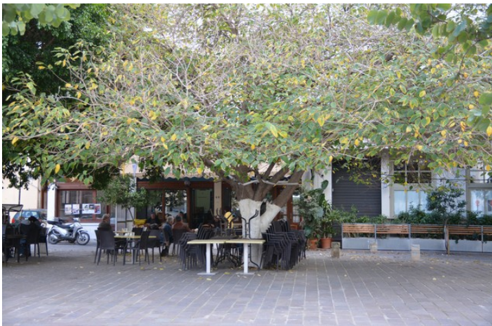
A picture from the square.