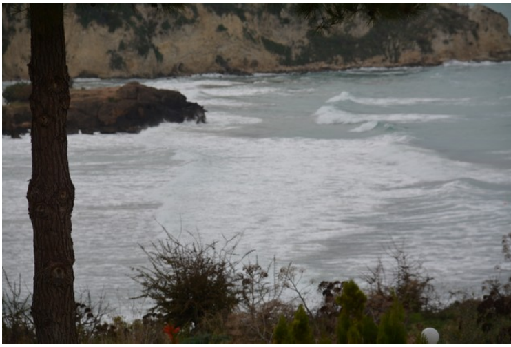
On November the 24 th there was heavy winds from the north. Then we had this view from the terrace.