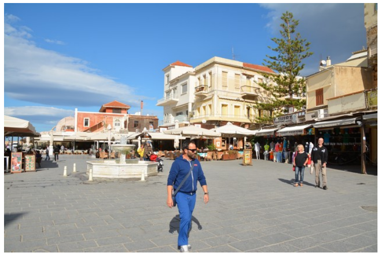
Here we come to the harbor, Sintrivani Square or Eleftherios Venizelos Square. A fountain stands in the middle of the square. Are described in section. 8 in the following link .