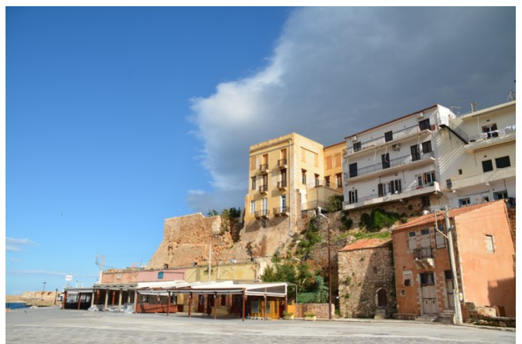
This is Kastelli Hill , located directly behind the mosque. During cleanup efforts after the bombings during the war there was found many relics from Minoan times. Link to the description of the excavations.