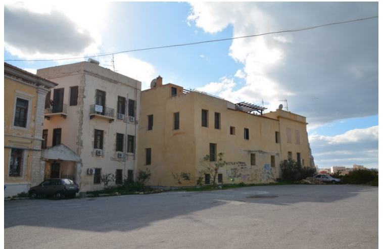
Up on top of Kastelli is a few houses, including the Venetian Rector's Palace . Described in pt. 12 in the following link .