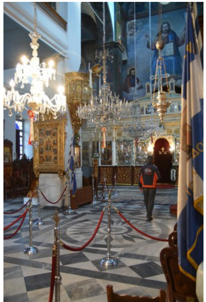
Inside the church.