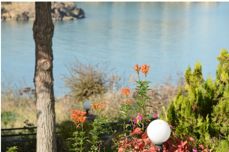
On the 29 th of November, new flowers have sprung at the neighbor.