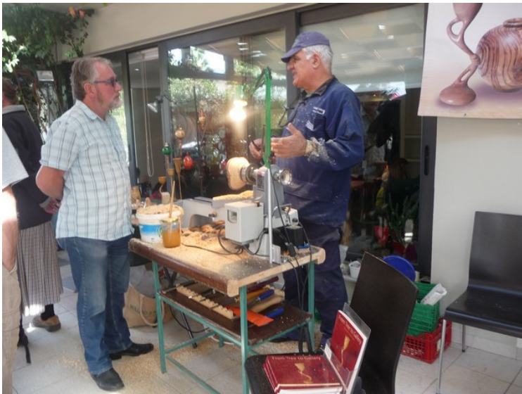
A lot of various items are for sale.