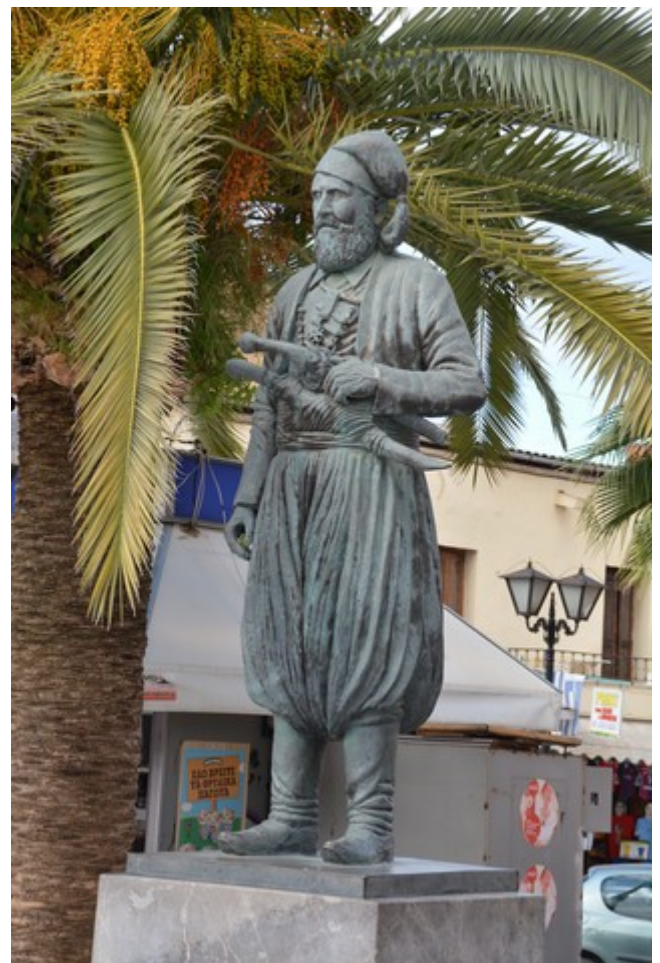
Freedom Fighter Anagnostis Mantak was one of the two who hoisted the Greek flag on Firkas tower in 1913.