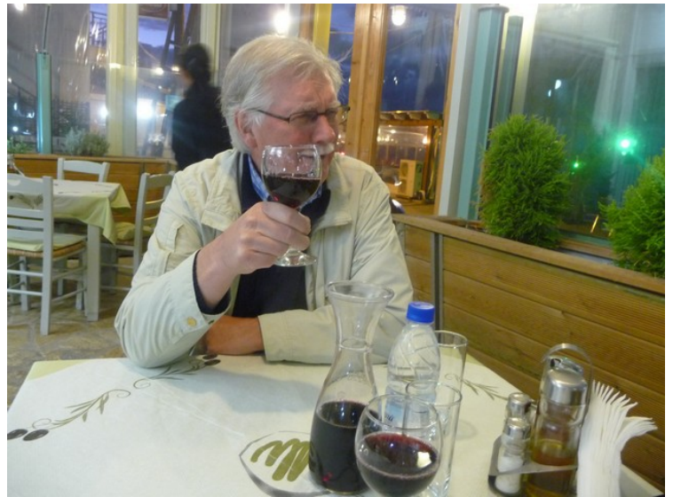
First we get the wine. Cheers!