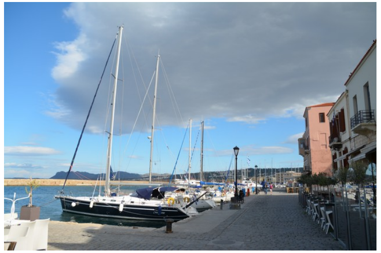
The marina east in the harbor.