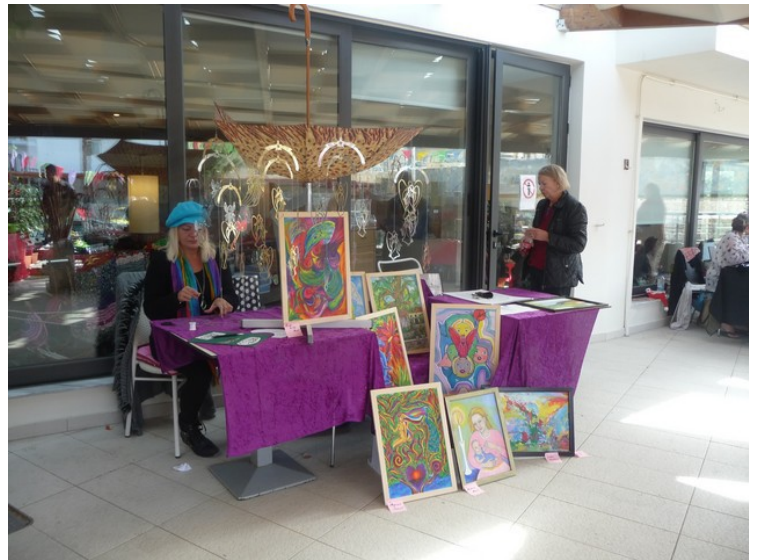
Here it is paintings.