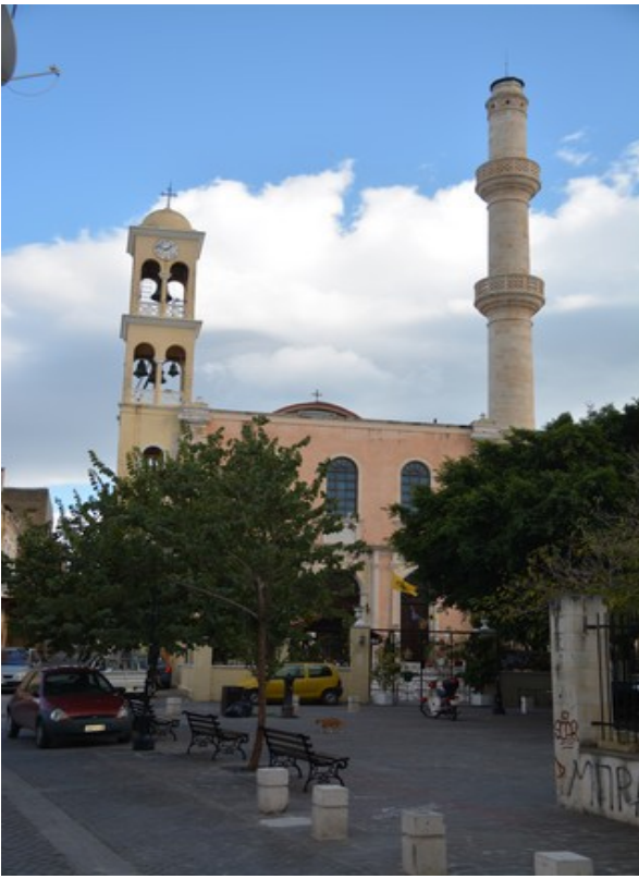
Then we have gone to the district Splanzia. Here is the church / monastery of Agios Nicolaos . During the Turk government the church was turned into a mosque and the minaret still stands.