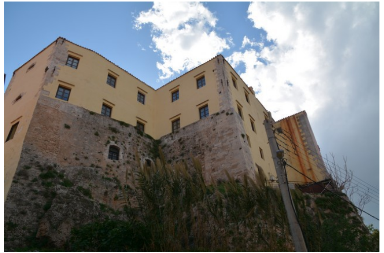
This was once a Turkish prison and government building. Described in pt. 15 in the following link .