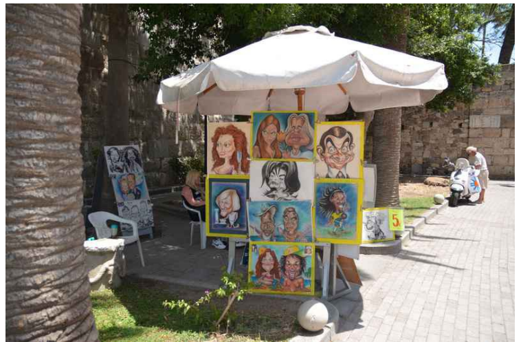
Here are the results from an caricaturist.