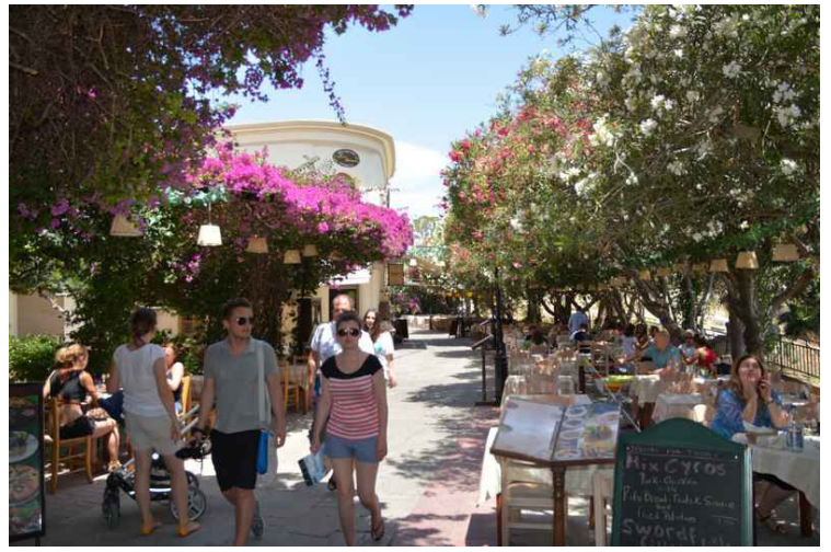
At the end of the restaurant street.