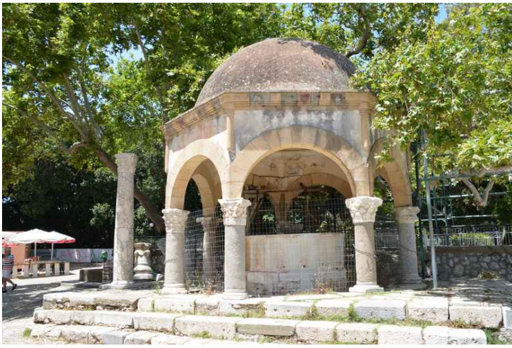
Hippocrates' well next to the plane tree.