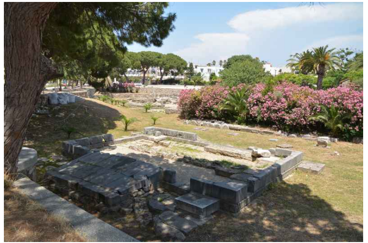
This is the altar of Dionysus . When we look at the link I'm not sure if we saw the altar.