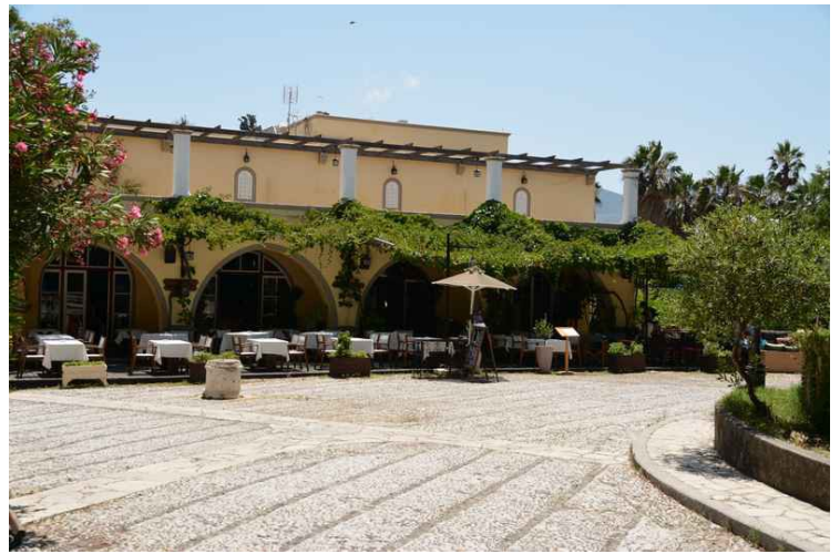
We had lunch at this restaurant at the plane tree square.