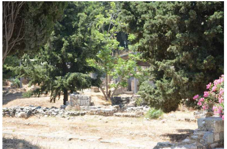
Archaeological excavations, The Western Archelological Site .