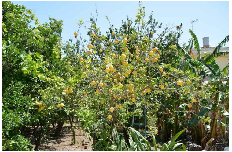
In the garden inside there was lots of lemons on this tree.