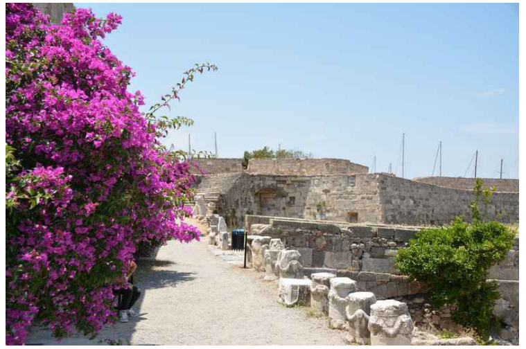
The fortress, Nerantzia Castle, built by the Knights Templars over many years, mostly from 1380-1514. Was built partially on and off the remains of an older building stock. Various pictures.