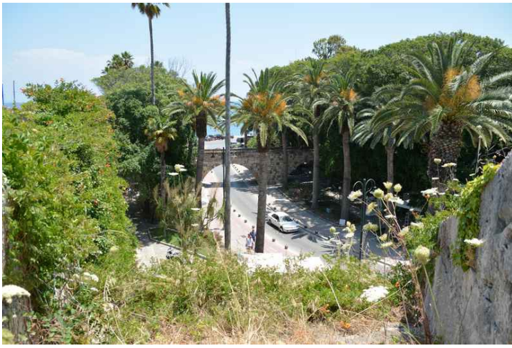
View from the walls down on the street and the bridge leading to the castle.