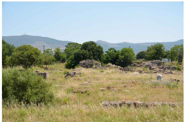
Here we are looking in the direction of Casa Romana , The Roman House. We did not go over there, but it should be nice.