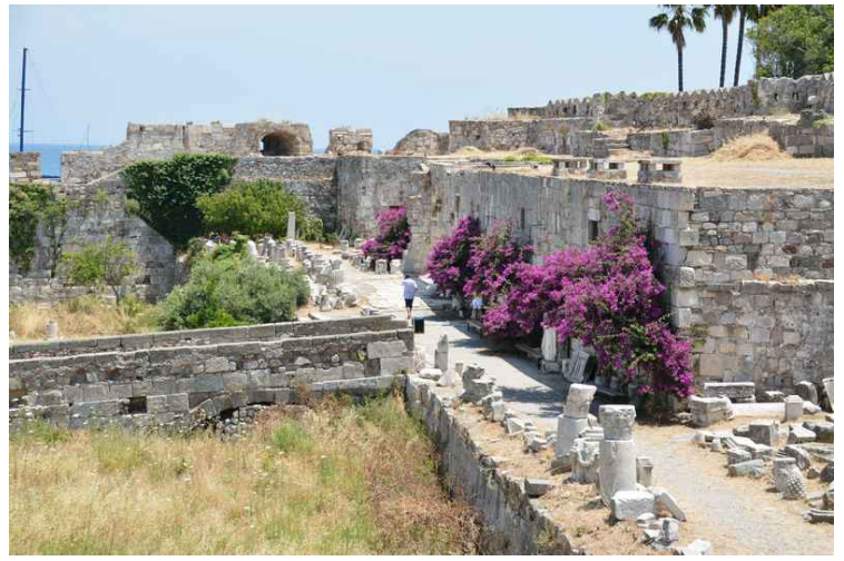
Restoration work is still in progress. The fortress was situated on an island until the early 1900s.