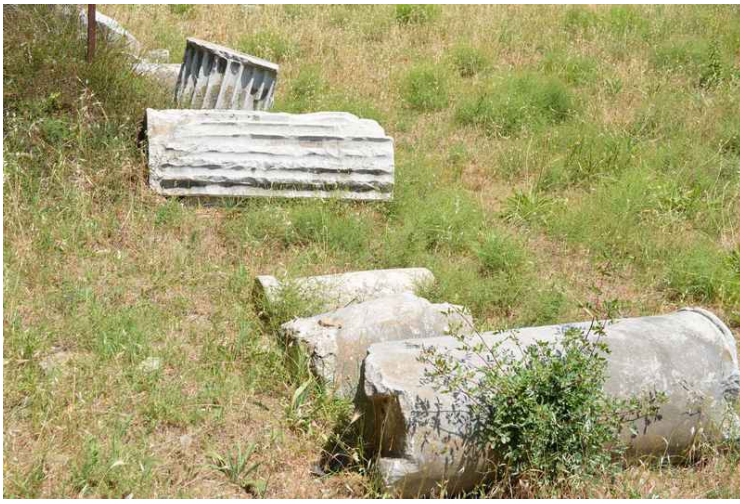
Here are remains of pillars.