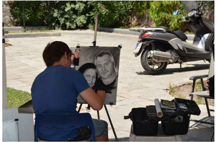
At the bridge, there were several artists who offered to make drawings of those passing by.