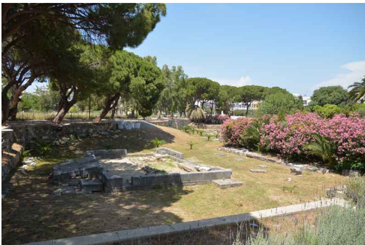
Another picture of the altar of Dionysus.