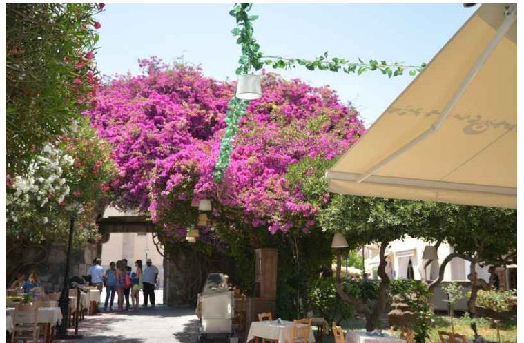
On the north side of the agora, there is a number of restaurants.