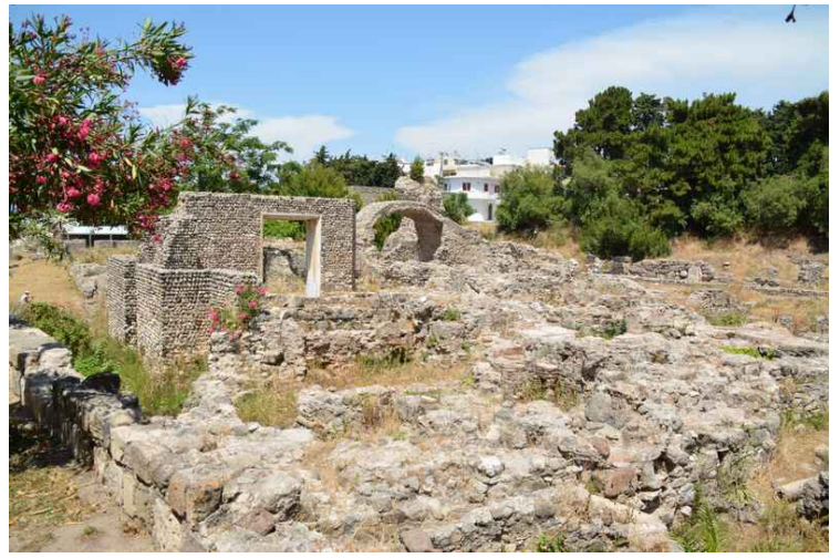
More archaeological excavations from The Western Archelogical Site .