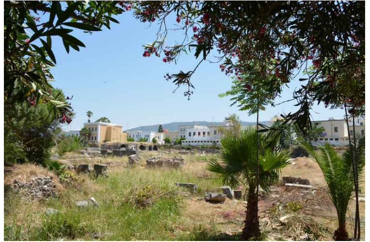
Photos from the ancient Agora.