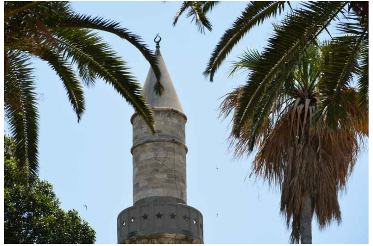
This is the minaret of the Pasha Gazi Hassan mosque.