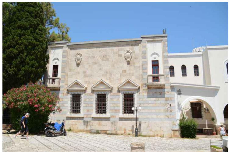
Opposite the mosque is this building.

The plane tree that stands there now is not more than 500 years old, but it may be an offshoot of the old tree.