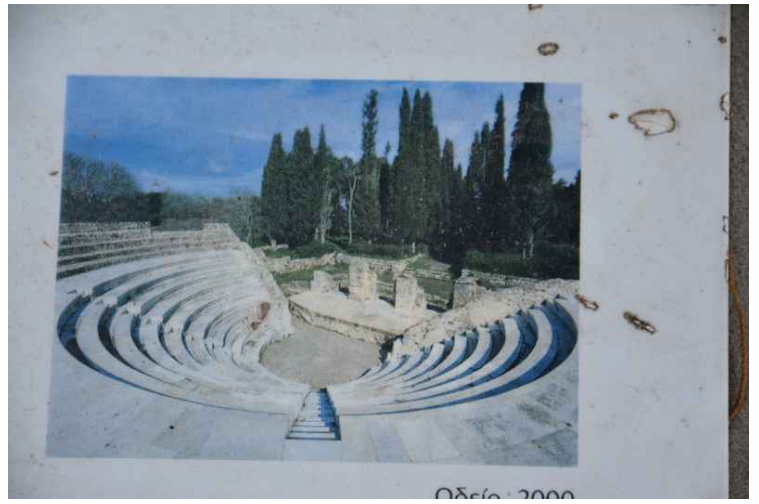
An image of Odeon on an information poster.