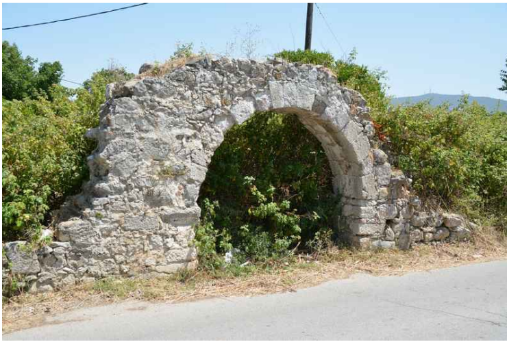
We looked for the Odeon, but we went wrong and came by this arc wall. We just had to have a picture of it.