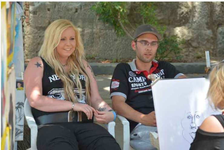
Here are a couple that are portrayed.