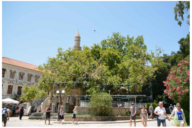
This is the tree that Hippocrates should have been sitting under, teaching his students the mysteries of medicine.