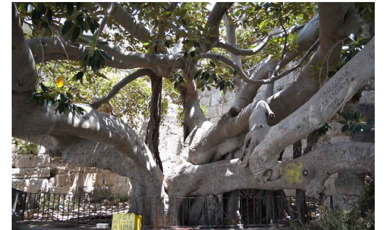
This tree is probably very old, because it has a huge trunk.