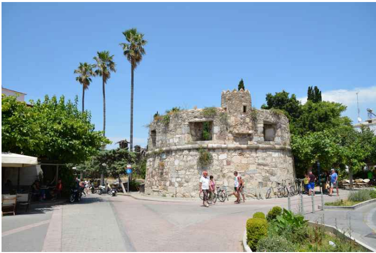
At Elftherias square, right outside the restaurant street.