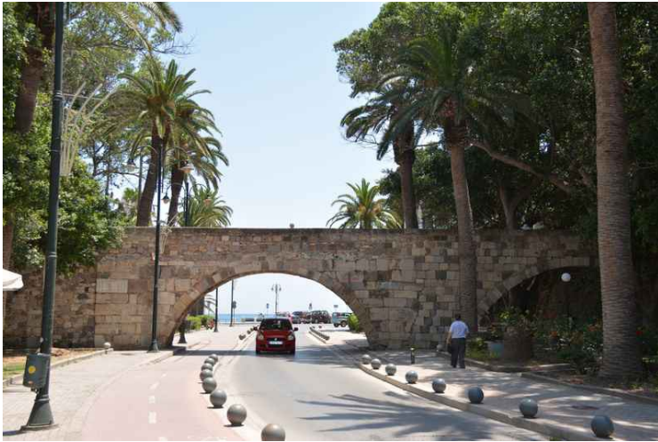
This is the walkway leading to the entrance to the fortress. We were not aware that the entrance was there, so we first went around the castle without finding it.