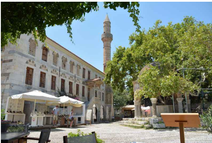
Where we are sitting at the restaurant we can look at the Hippocrates' plane tree on the right and the mosque on the left.

The plane tree that stands there now is not more than 500 years old, but it may be an offshoot of the old tree.