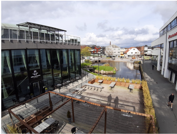
The view from the footbridge that crosses Bryneåna and Arne Garborgs road.