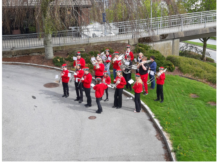
A band played outside the hotel.