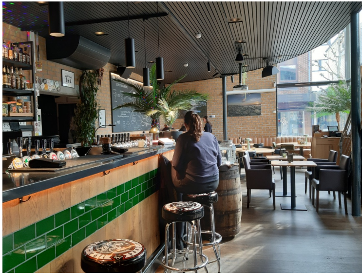
We were so early that there was hardly anyone there when we arrived.