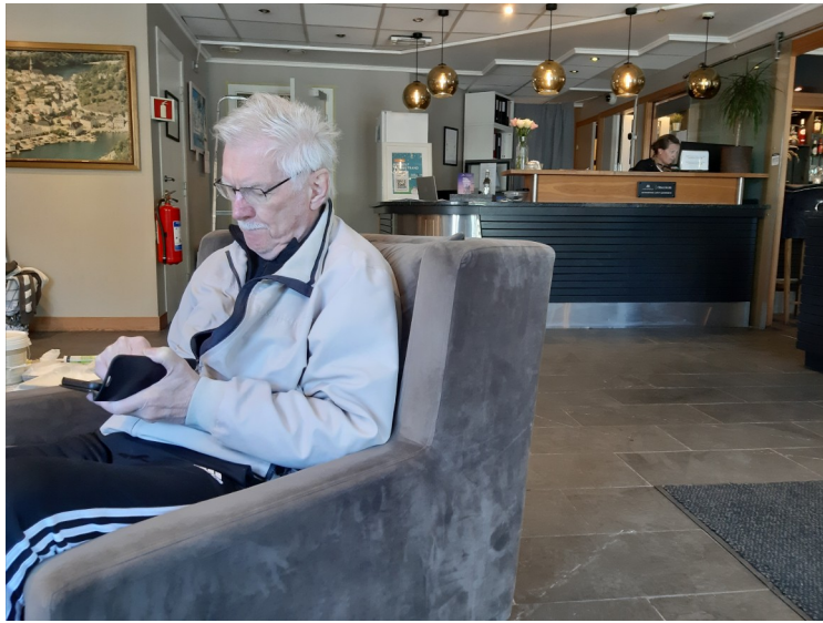
From the respition.