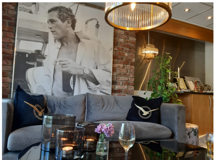
After we had checked in we had a beer and wine at the reception. Here there was a large picture of the actor Paul Newman.