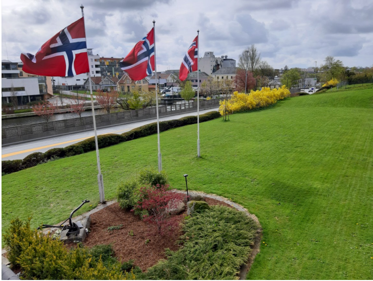
There was confirmation on this day as well and the flags were raised.