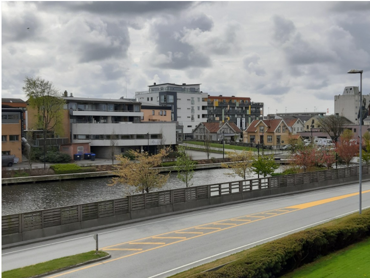
View from the hotel.