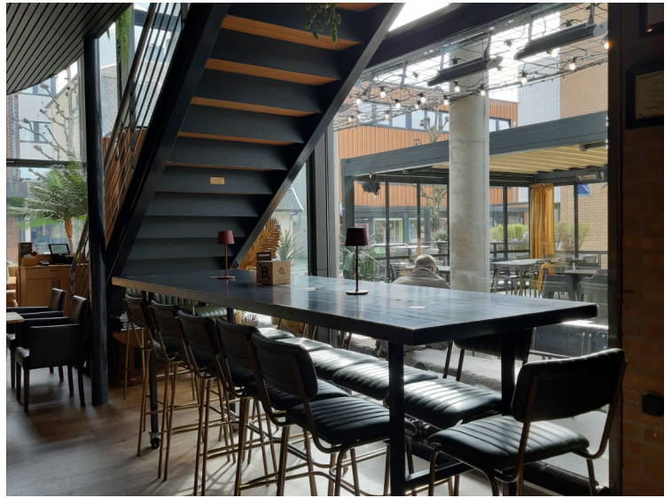
A guest has sat outside. We ate fish and chips.