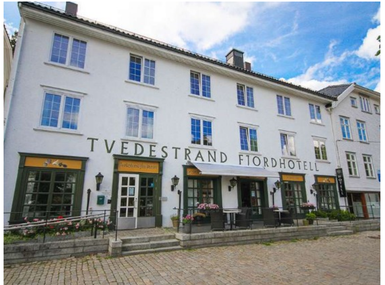
The next day traveled home. Along the way we spent the night at Tvedestrand Fjordhotell.