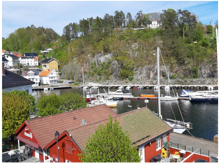
Some pictures from the surroundings before we left for home.