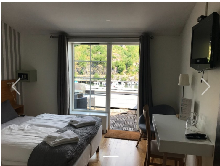
The next day traveled home. Along the way we spent the night at Tvedestrand Fjordhotell.