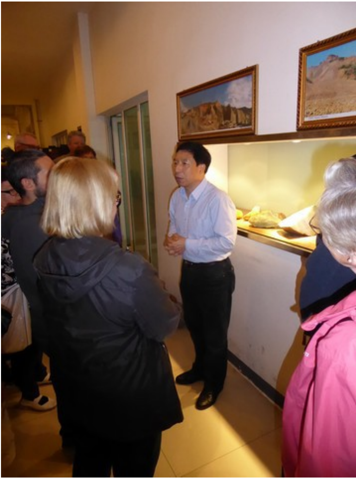
Here we are welcomed.