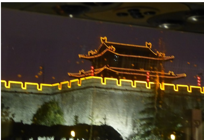
On the way back to the hotel, we see that the wall is illuminated.