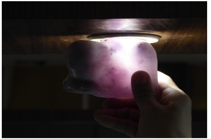
Viewed in light to check the quality.