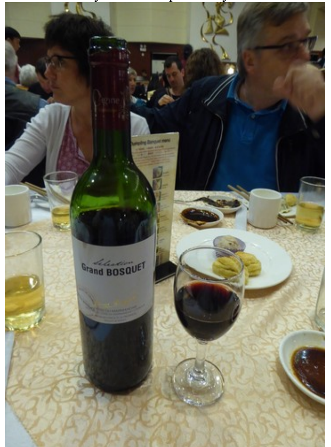
We bought this wine to go with the dumplings.