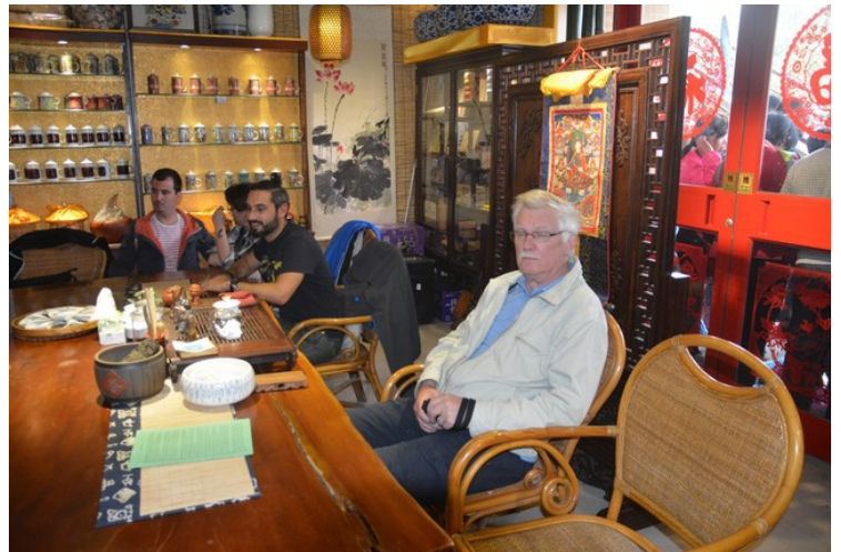
It was at the same restaurant where we had eaten lunch.