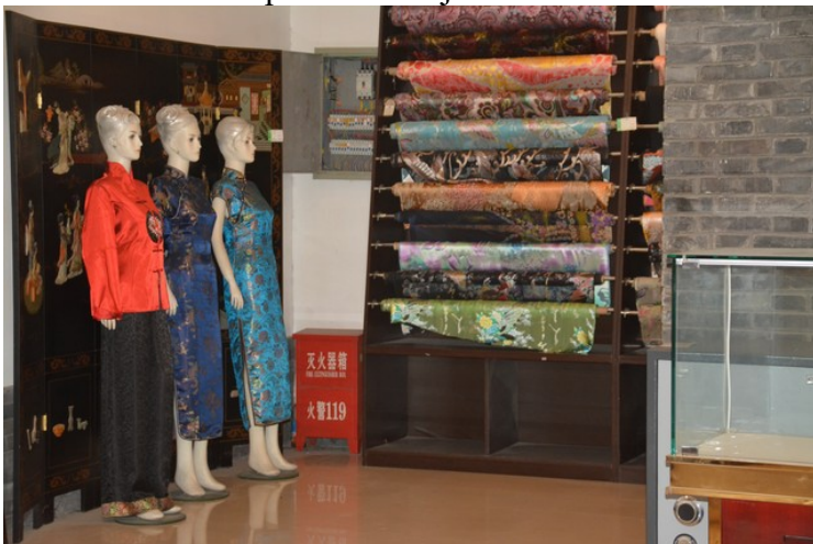
Figures made of jade.