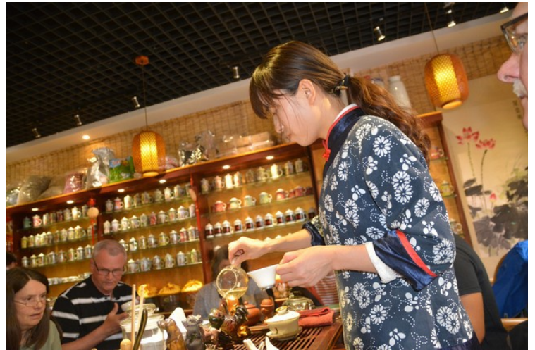
Here we have started the tea ceremony .