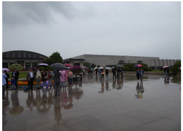
We were driven with electric vehicles from the bus to the halls that were built over the terracotta army. It rained that day.