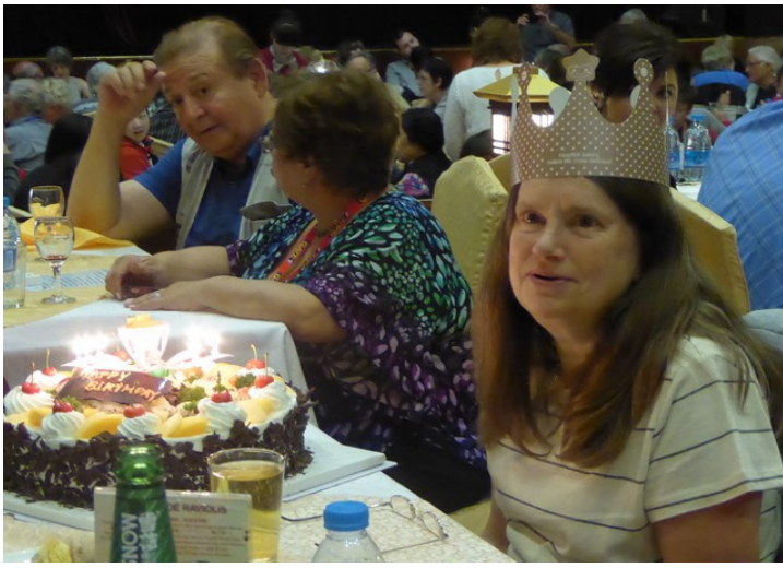
The birthday girl got cake.