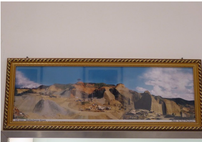
Another place where jade is taken out.