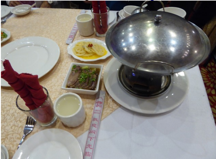
Before the show we get dumplings .