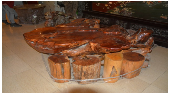
Ornaments made of jade .

On the 7th day, we first visited a jade factory . Jade is a rock found mostly in China, Burma and Central America. Most common are green and orange jade, but there are also white, yellow, red and blue varieties.