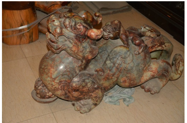
A figure made of jade.