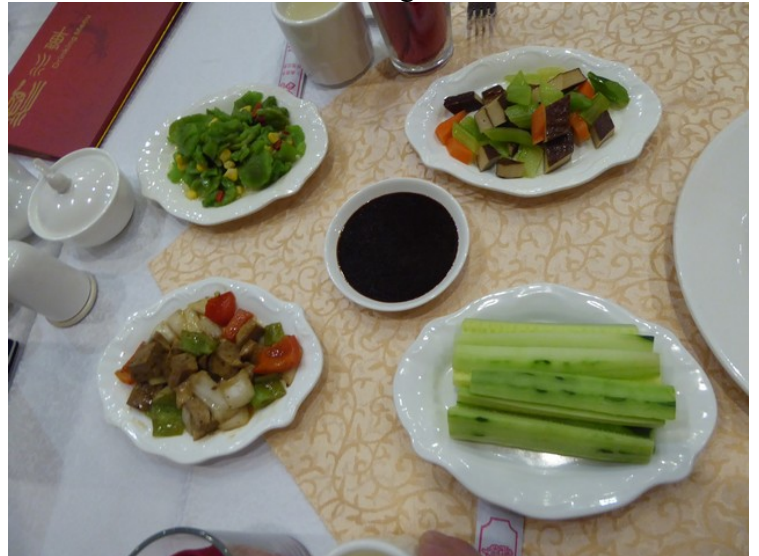
They are accompanied by this.