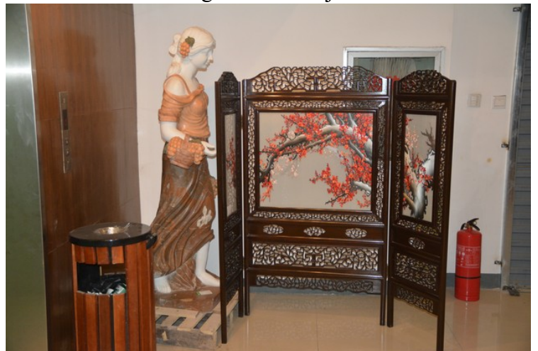
Below follows various figures that were on display.