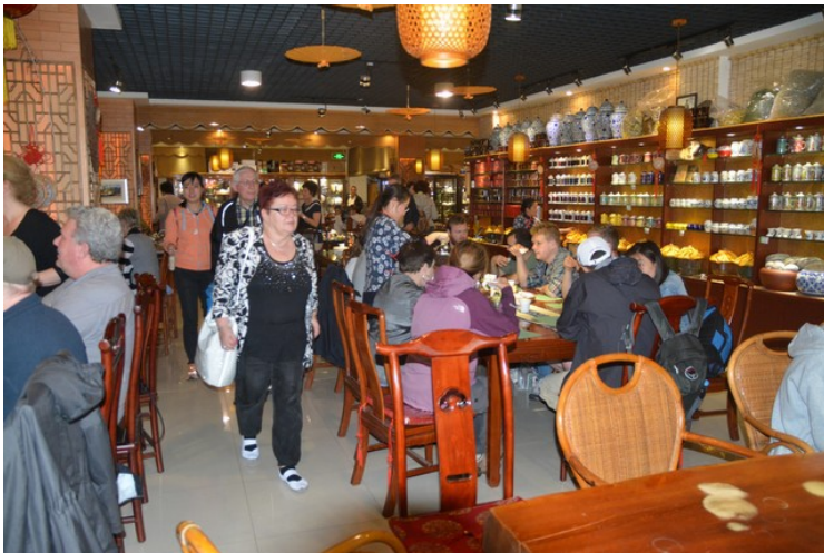
After lunch it was tea tasting.