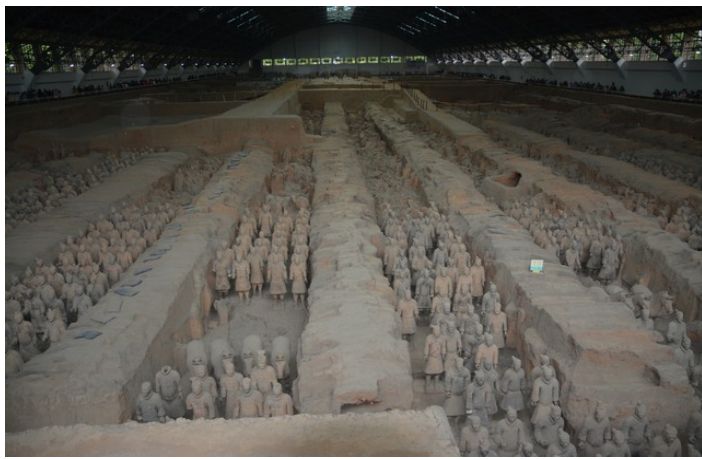
Then follow pictures of some of the characters that are excavated.