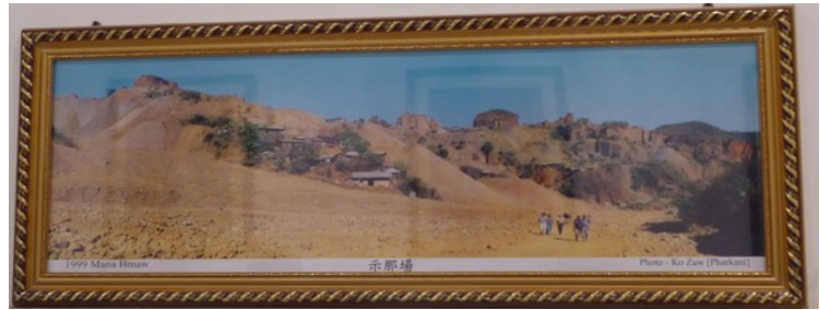
Picture of a place where jade is taken out of the mountains.

On the 7th day, we first visited a jade factory . Jade is a rock found mostly in China, Burma and Central America. Most common are green and orange jade, but there are also white, yellow, red and blue varieties.