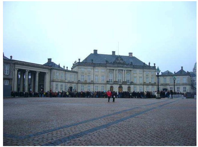
Here we have moved to Amalienborg where four rococo palaces lies around Amalienborg Courtyard. They were built in the years 1750-60.