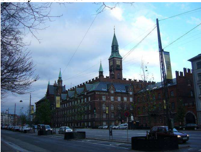
This day we first went past Rådhuset (The Town Hall) from 1907