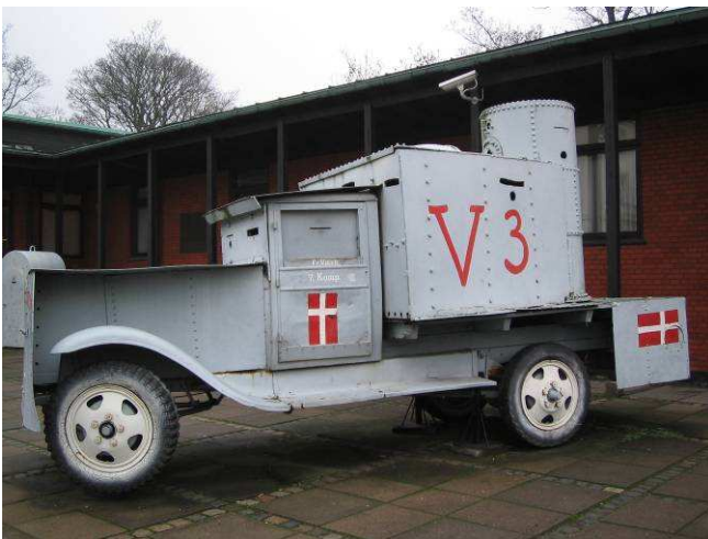
On the way back to the hotel we went past the Freedom Museum combat wagon. It was built by a resistance group Frederikbanens Verksted (factory) and brought into action 5. May 1945 against Nazi groups.