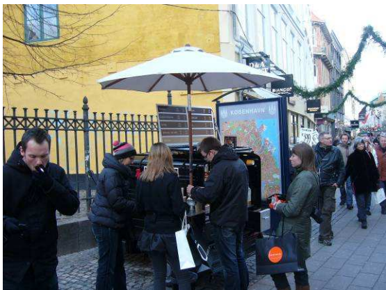
A car that is fitted up as a coffee machine