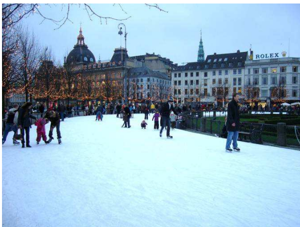
On the King's New Marked there also was skating rink