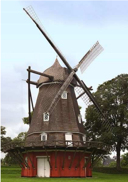
The windmill in the Citadel