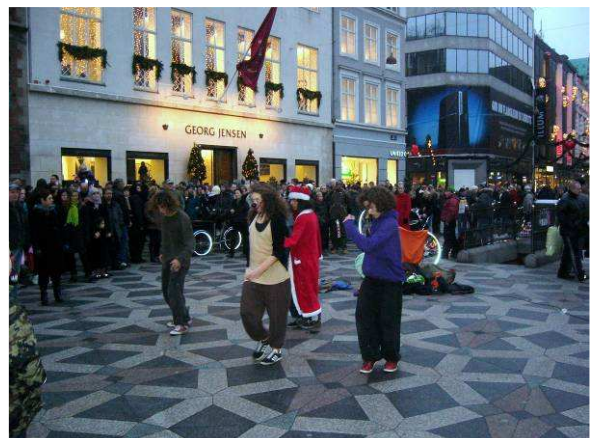
On Strøget (the worlds longest shopping street) there were performed break dance