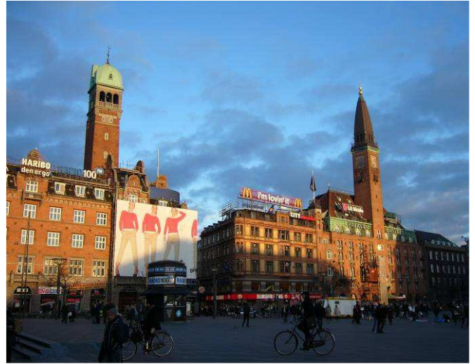
Here we are on The Town Hall Square