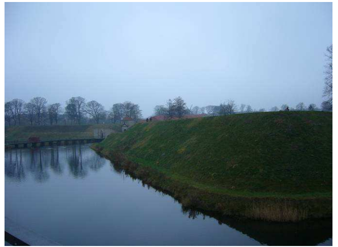
This is one of the moats with the windmill in the background