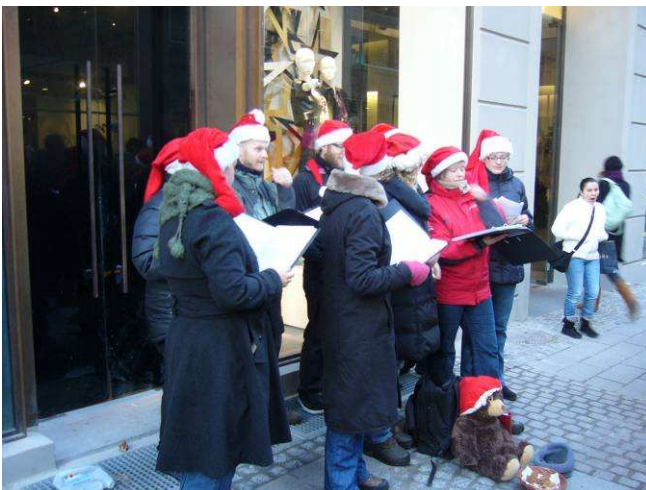
Then we looked at a choir singing the Christmas in