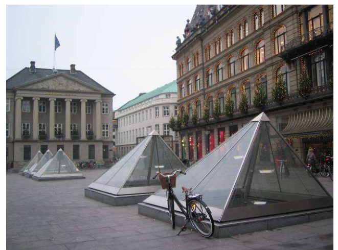
Underneath here lies one of the Metro stations and these are roof windows for these. Quite original.