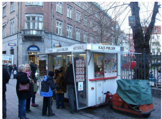
Standard hot dog stand