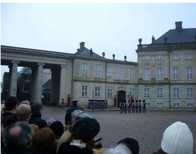
There are many people who want to look at the daily relief of the guard. Amalienborg is the monarch's winter residence.