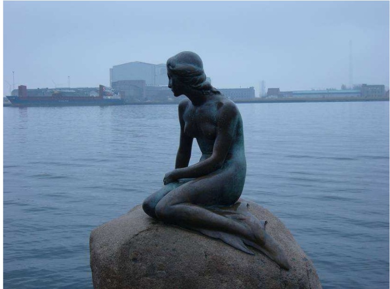
It is obligatory to have a picture of the little Mermaide