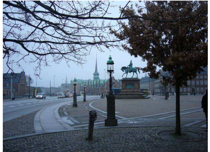
Here we look across Christiansborg Castle Square towards The Stock-exchange, which has an exceptionally spiral tower.