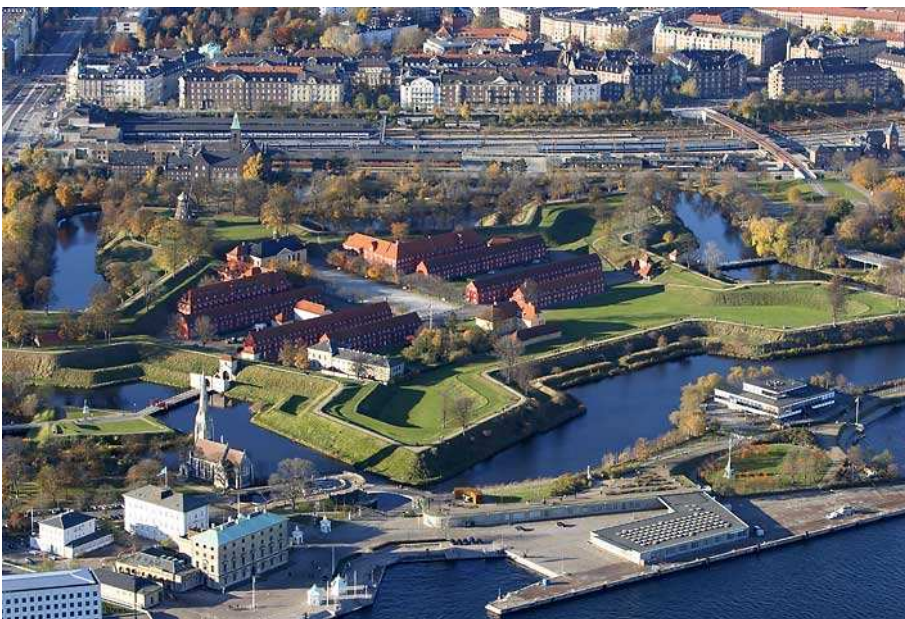
This is a view of the Citadel. This is one of the best preserved fortifications in North Europe. The five bastions are named respectively The King's, The Queen's, The Count's, The Princess's and The Prince's bastion. The Citadel has its own church, Kastelskirken (The Citadel Church) (since 1902 parish church for The Citadel Parish), and a windmill. Den northern entrance to the Citadel is called the Norway gate. In 2004 the Citadel was 340 years.