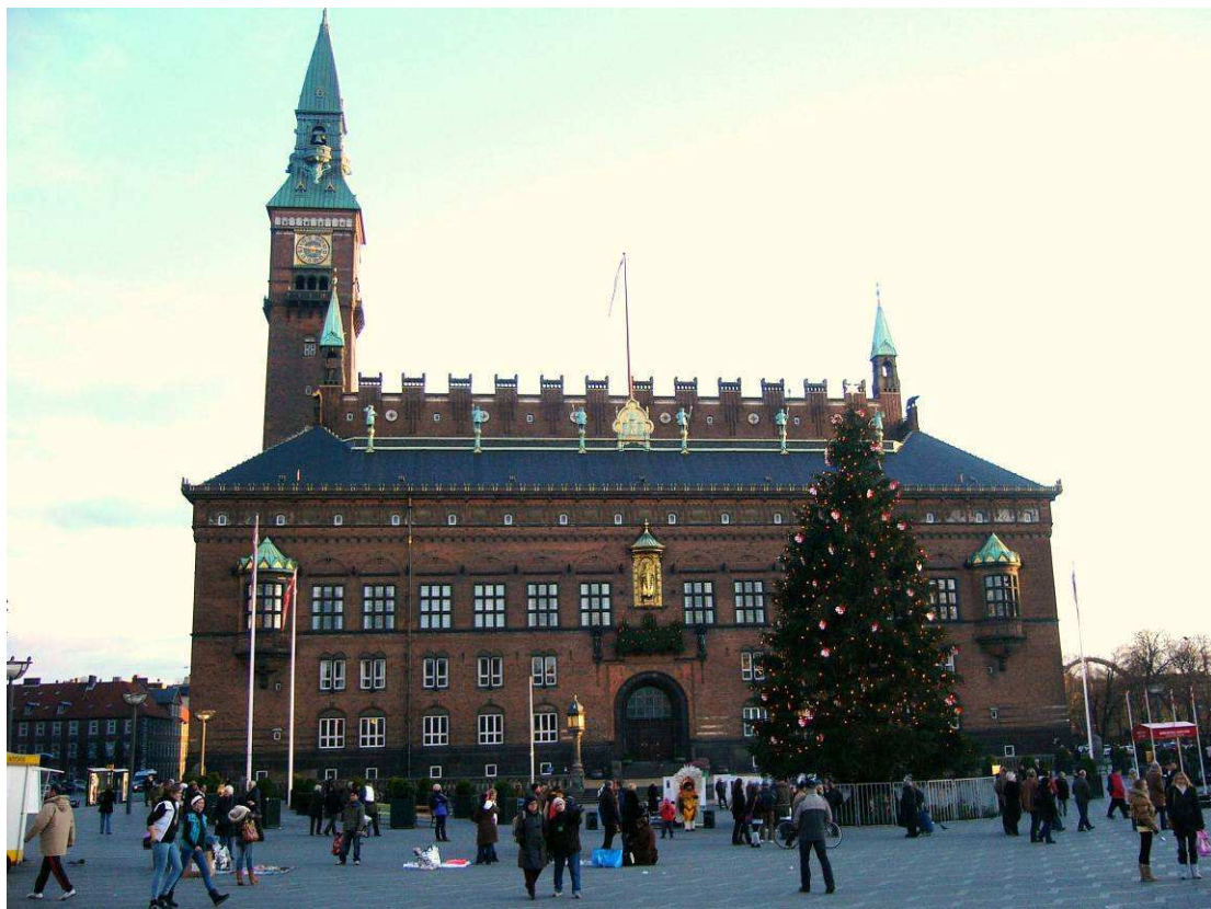
Here is another picture from The Town Hall Square and The Town Hall

Now we had seen what we had planned to see In Copenhagen, so now we could just relax until we had to go and get the suitcases on the hotel.