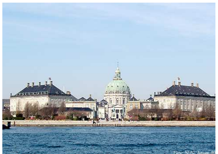
Here is a picture of Amalienborg taken from Yderhavnen (Outer Harbor). The Danish flag Dannebrog is up when Queen Margrethe is present. The Marble Church in the background