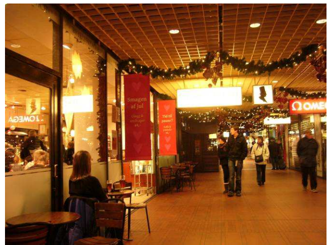
Afterwards we had a morning beer in a shopping center