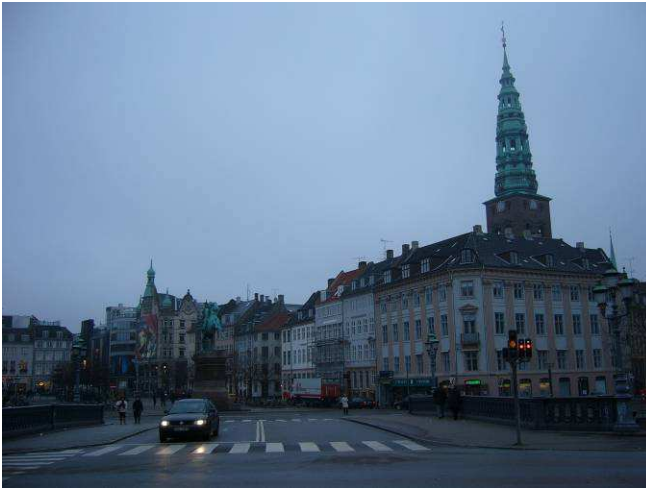
Here we look across The Stock-exchange Ditch in the direction of Høybro Square. The tower on the Nicolaj Church to the right.