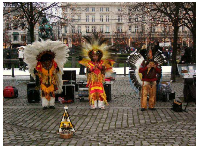
On the King's New Marked there were live Indian music