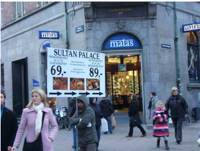
A boring job?