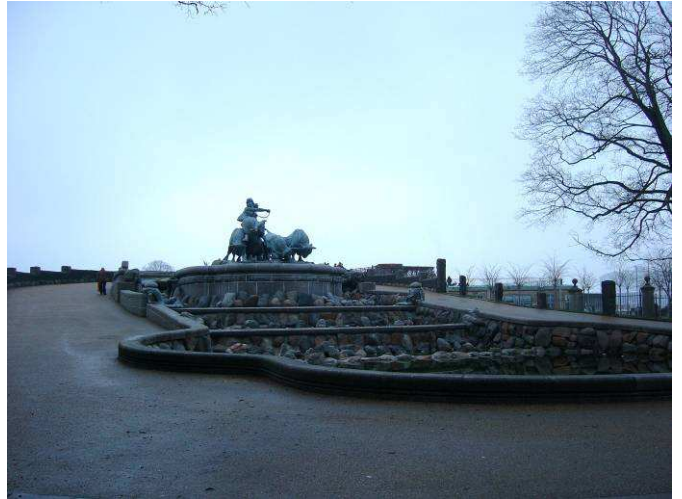
Here we have arrived so far north that we are at the entrance to Kastellet (The Citadel). Nice fountain.