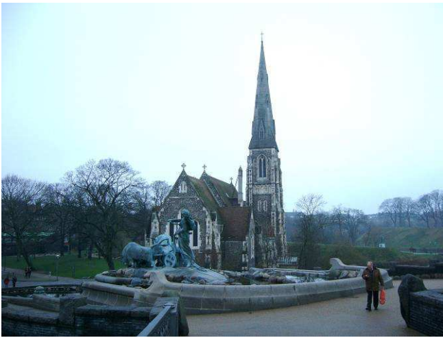
This is Kastelskirken (The Citadel Church)