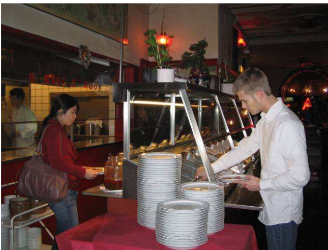
In the evening we had dinner at Mongolian Barbeque. We provided ourselves with meat and vegetables and the chef cooked them on the grill for us.