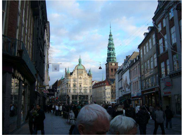
Street life on Strøget, which is the worlds longest shopping street