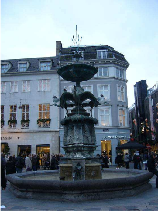
Fine fountain on Højbro Plads