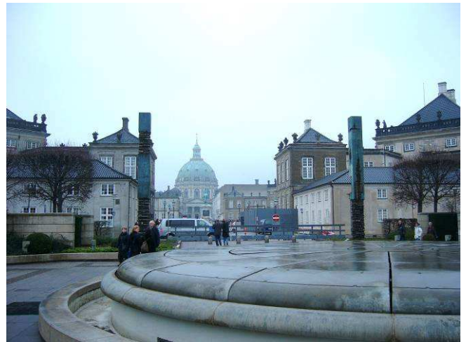
Here we are in Amaliehaven (Amalie's garden), which lies right besides Amalienborg. Marmorkirken (The Marble Church) in the background.