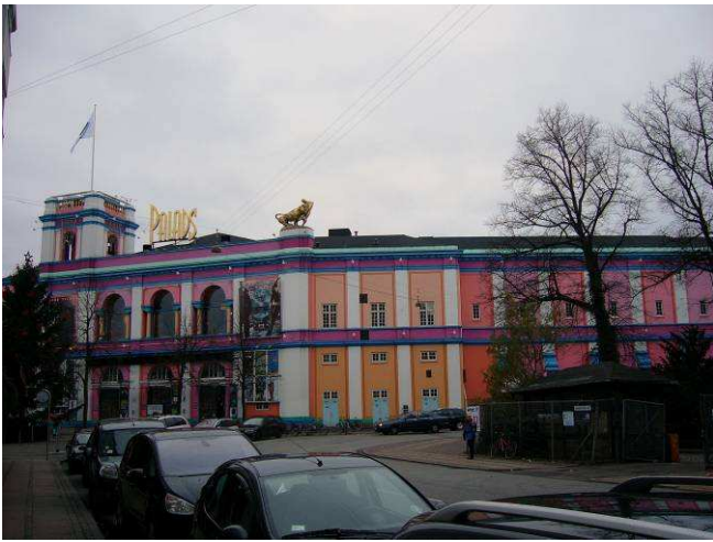
Then we went past a cinema with lot of colors