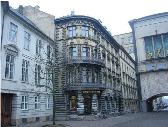
The ticket office for The Royal Theater lies in a nice old building