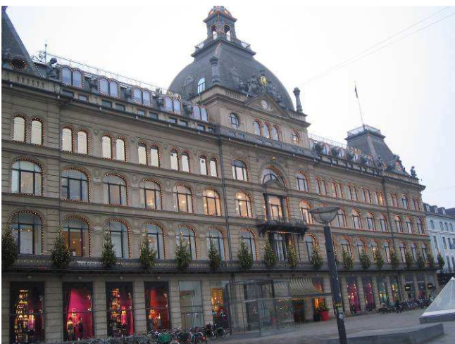
Here we have arrived at The King's New Market. Here lies a big shopping center, which is decorated for Christmas.