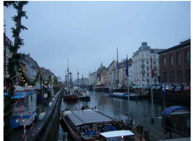
Here we are at Nyhavn (New Harbor) that also lies near The King's New Market