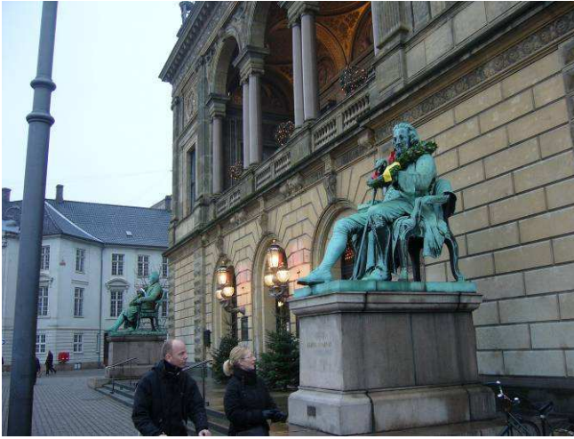
At The King's New Market also lies The Royal Theater from 1874. Here sits Ludvig Holberg outside.