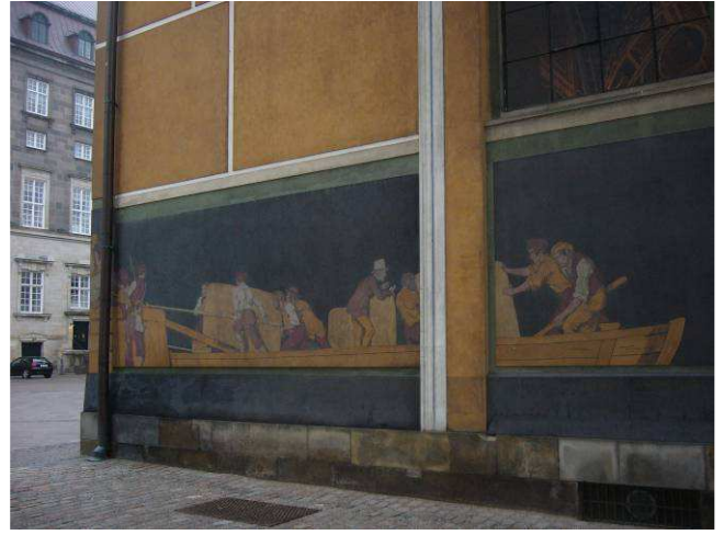
There are also Thorvaldsen pictures on the outside.