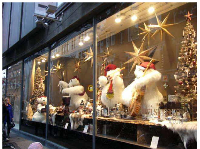
Here is a display window with bears playing instruments. Cute.