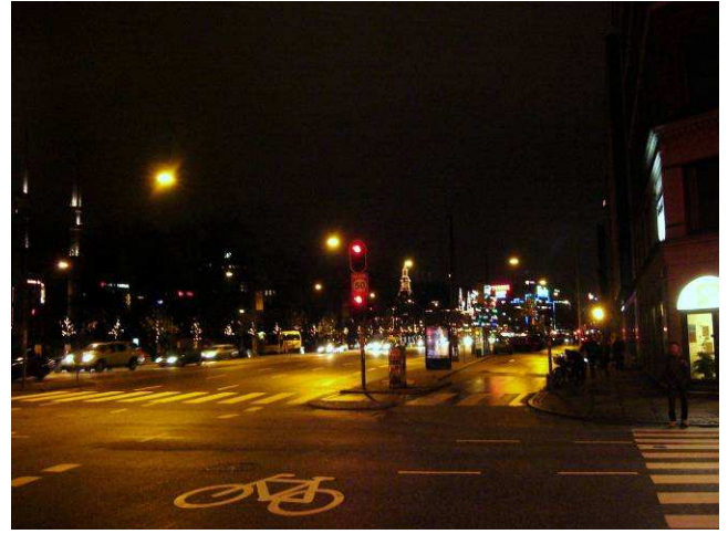
Evening on H.C.Andersens Boulevard