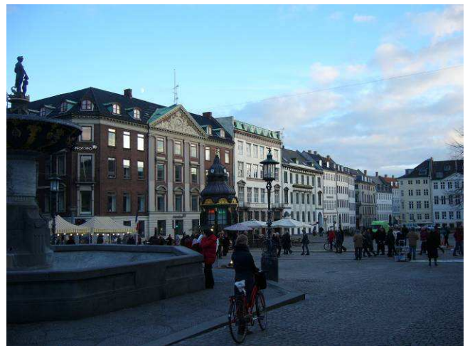
A picture from Gammeltorv / Nytorv (Old / New Market)