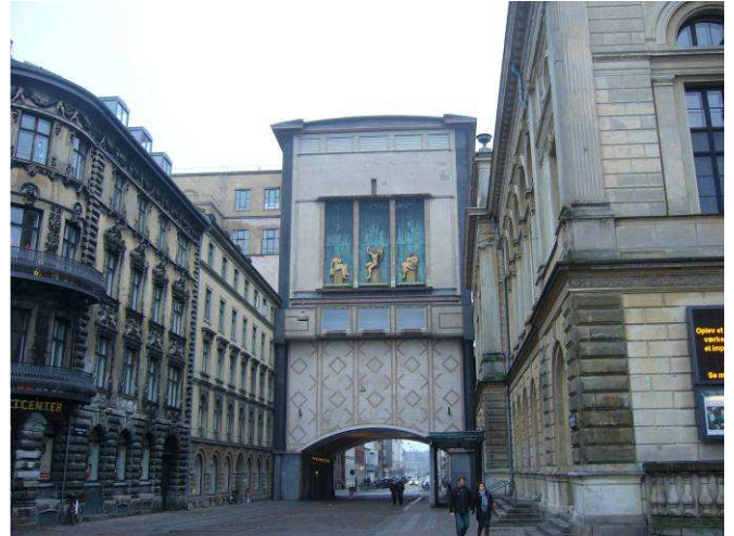
This is a nice archway