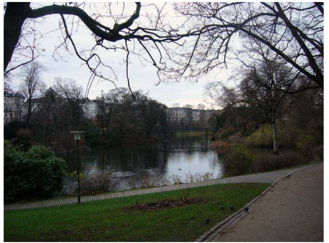
Here we are in Ørsteds Parken