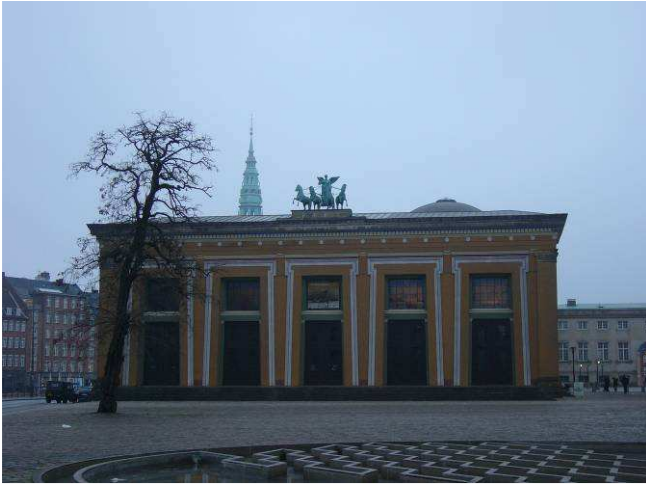
Just beside The Castle lies Thorvaldsen's Museum. Thorvaldsen is a famous Danish sculptor, who lived from 1770 to 1844.