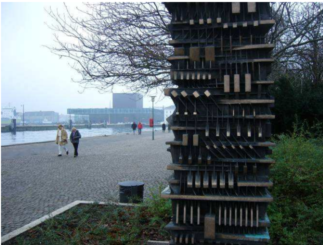
Fine carvings on the columns at the entrance