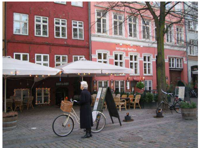
We had lunch at Jensens Bøfhus (Beafhouse)