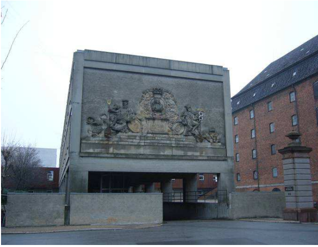
Here we are at Skatmuseum (Treasury Museum). This was a nice board.