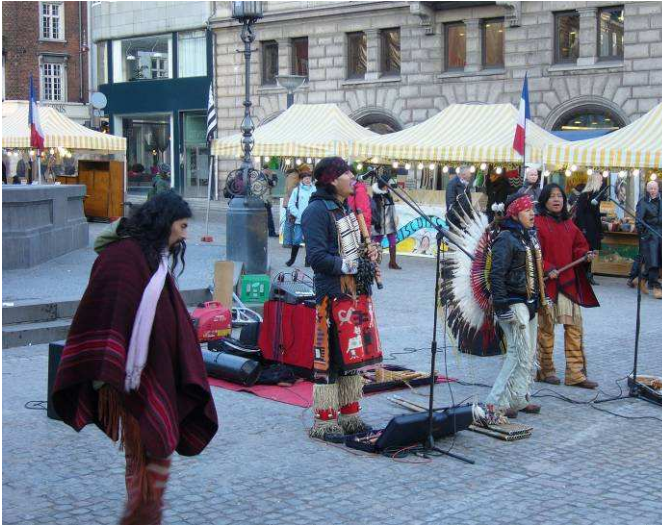
There were many groups playing Indian music