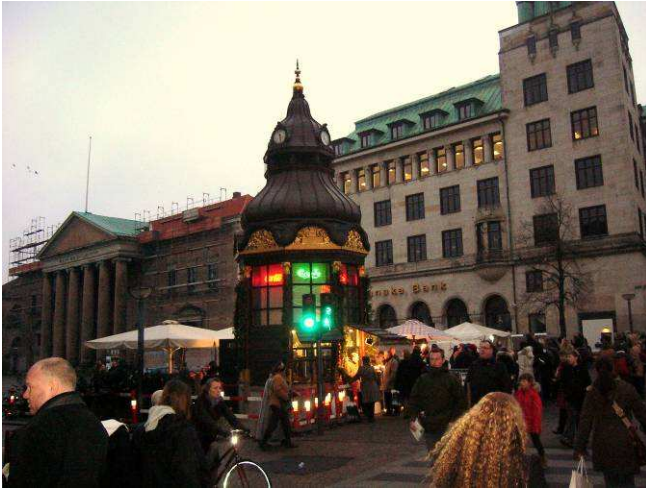
Here on Gammeltorv (Old Market) we sat for a while eating caramelized almonds