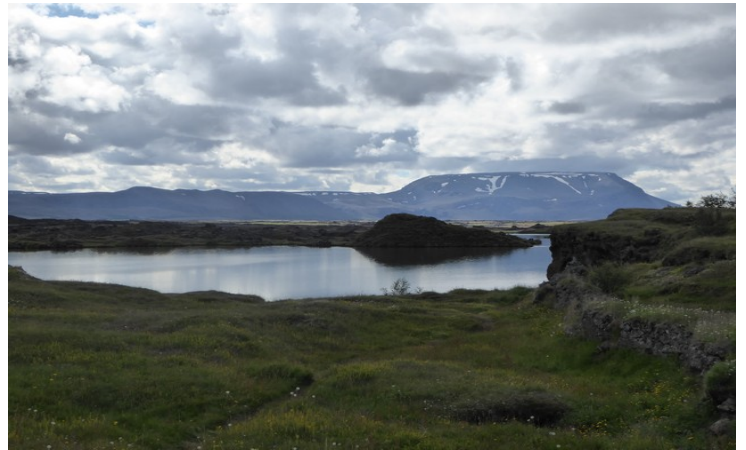
The first stage went around Mývatn .