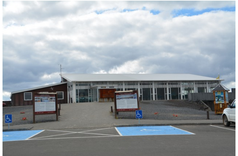
This is the house where one enters into the baths.