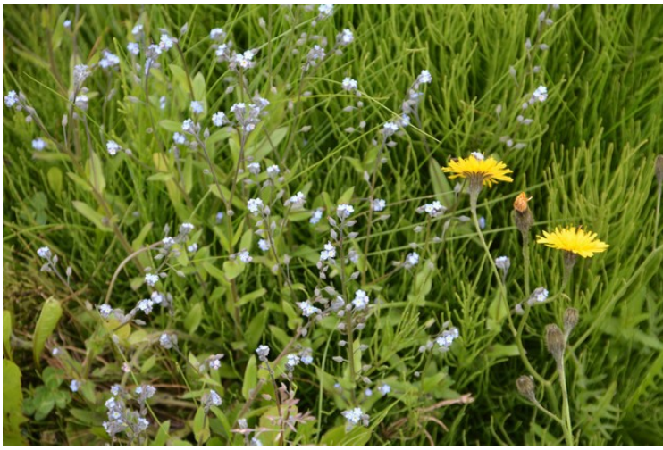
Then a flower picture