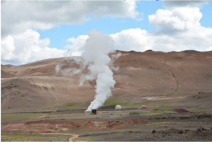
The area is very unstable and steam rising up in many places.