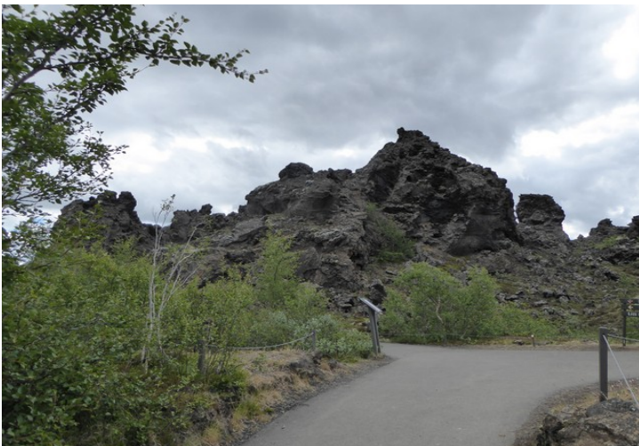
Very special lava formations.