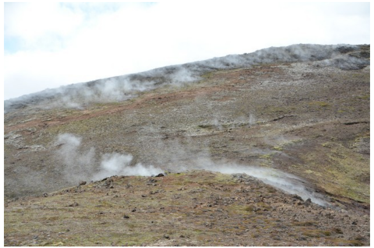
Then a detour to Myvatn Nature Baths or Jarðböðin nature baths .