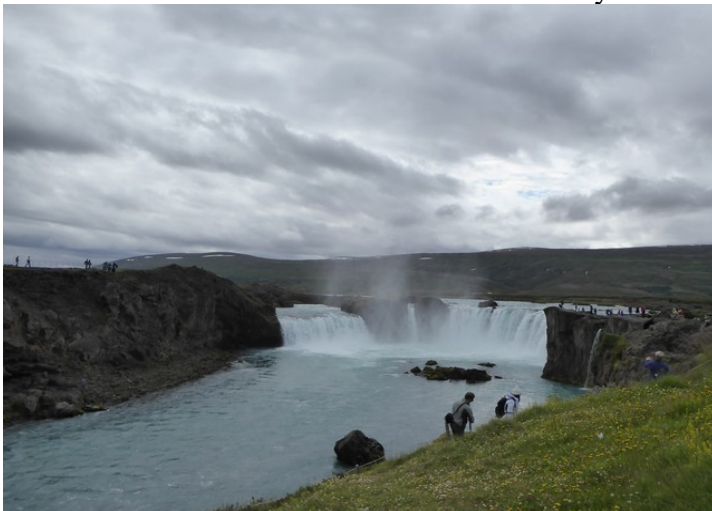
Next stop is at Goðafoss .