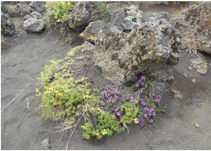
Vegetation at the waterfall.