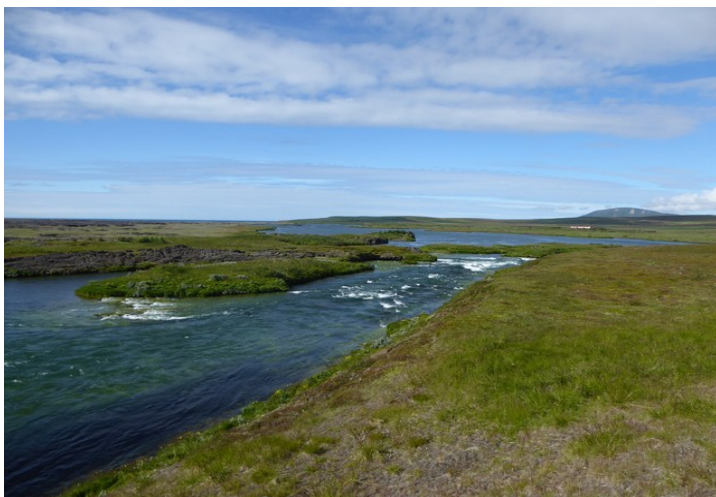
Looking towards Æðarfossar .