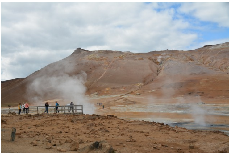
Sulfur-containing steam rising up everywhere.