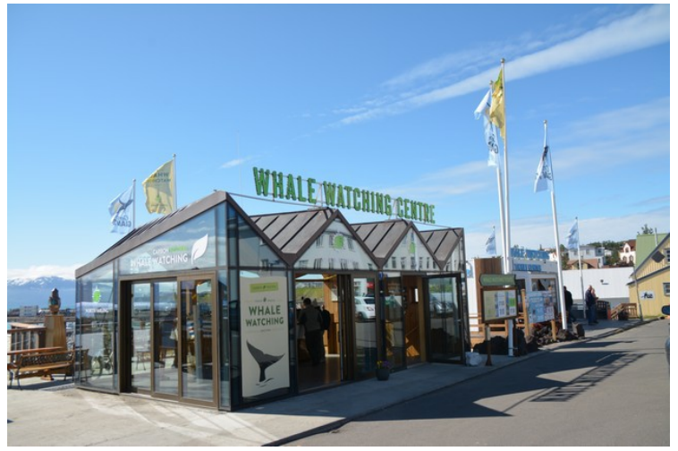
Here we are in Húsavík . It is popular with whale watching here.