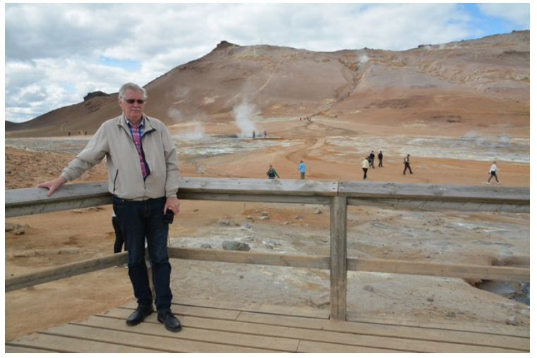
Finally pictures of us.