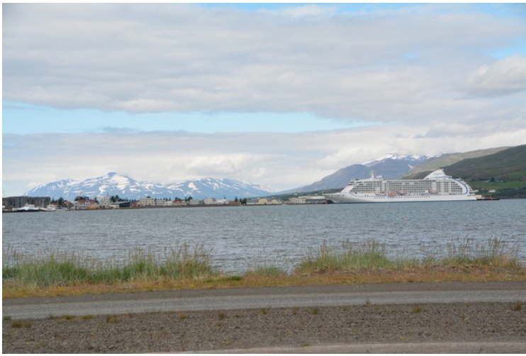
At the other side of Eyjafjörður , looking back to the town.