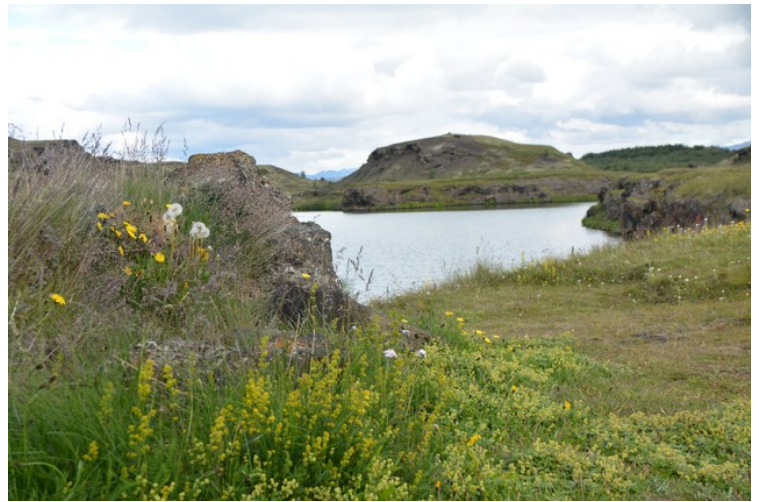
Some pictures from the trip around Mývatn.