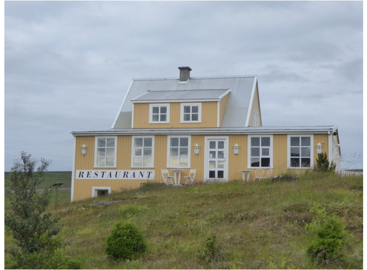
This is the main house.