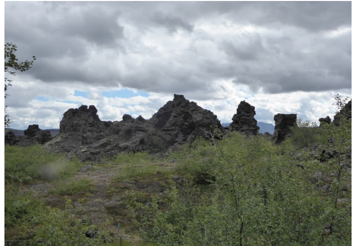
We made a detour to Dimmuborgir .