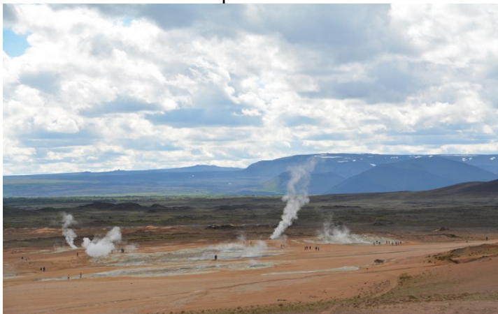
We drove on over Namafjall. On the other side lies Hverir or Hverarönd.