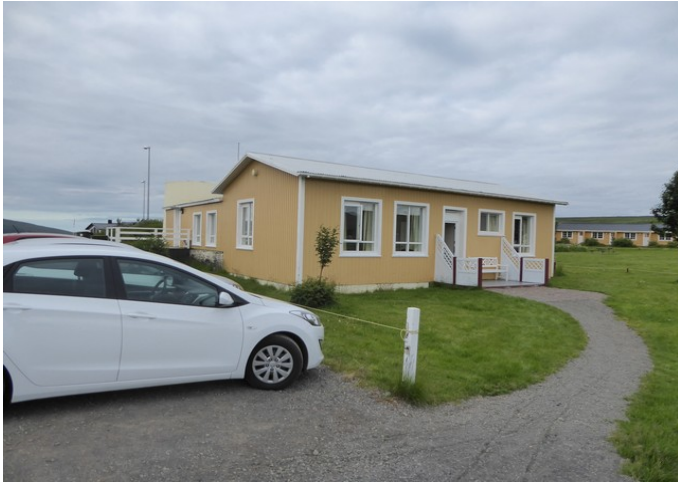
Next stop was at Fossholl Guesthouse , which is right next to Goðafoss. We stayed in the apartment on the right.