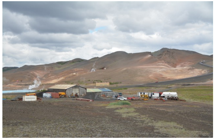
Down in the valley there is a heat power station, Bjarnarflag Power Station .