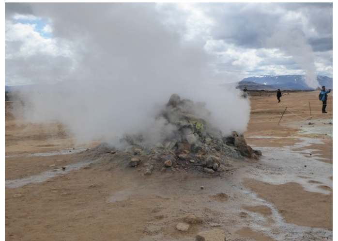
This is a large fumarole .