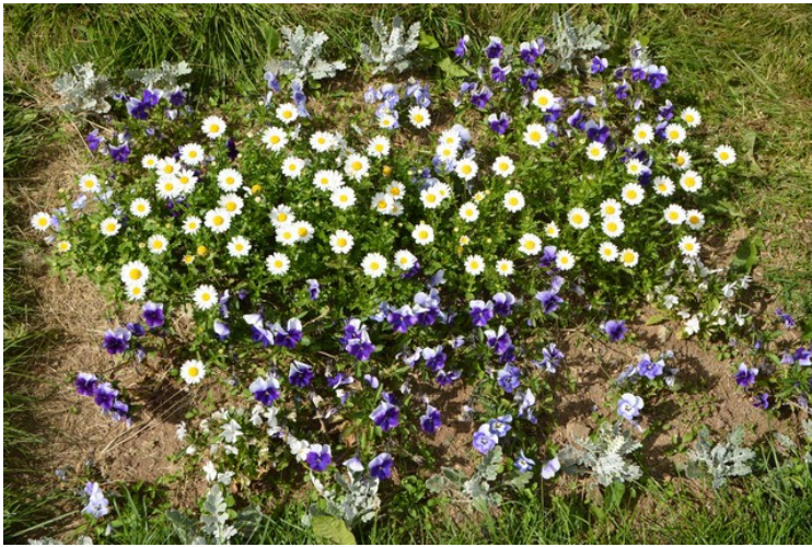
Flowers at the church.