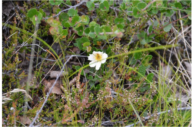
There was also great variation in the flora.