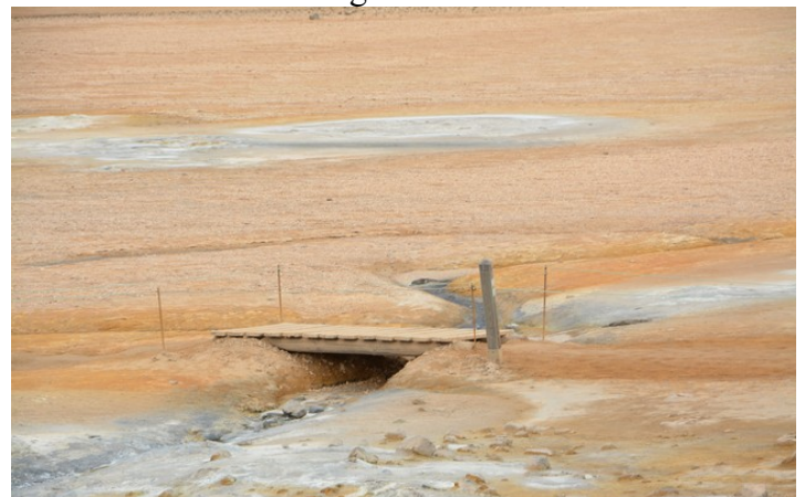
The steam and water is 80-100 degrees so it is marked up where it is safe to go.