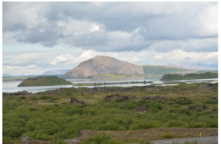
Then a last view of Mývatn before we depart.