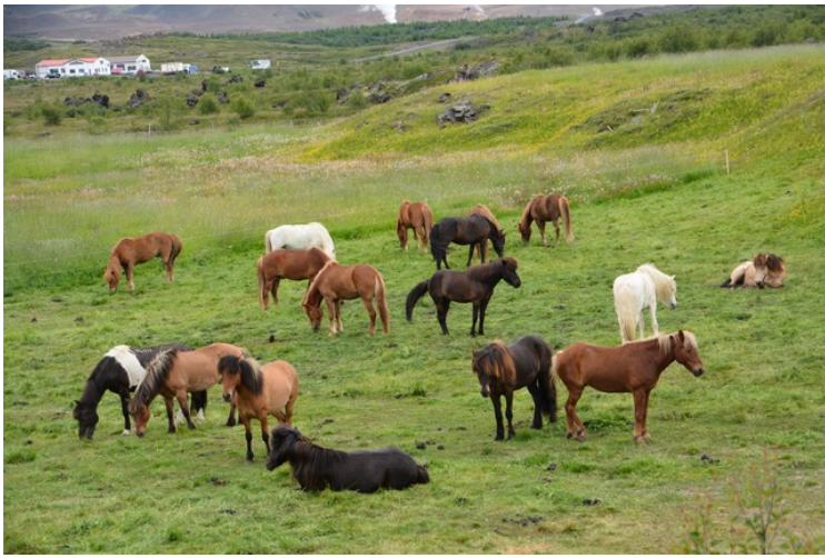
Further along the road we saw many horses.