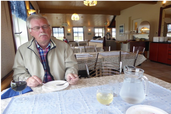
We ate dinner in the main house. Very good food. I had lamb chops and Anne Berit had wild trout from Svarta .