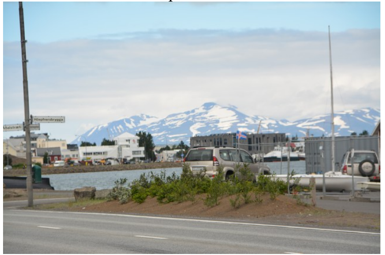
We drive south out of town.