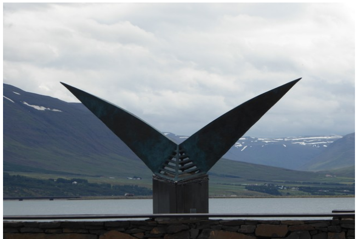
This whaling monument stands at the harbor.