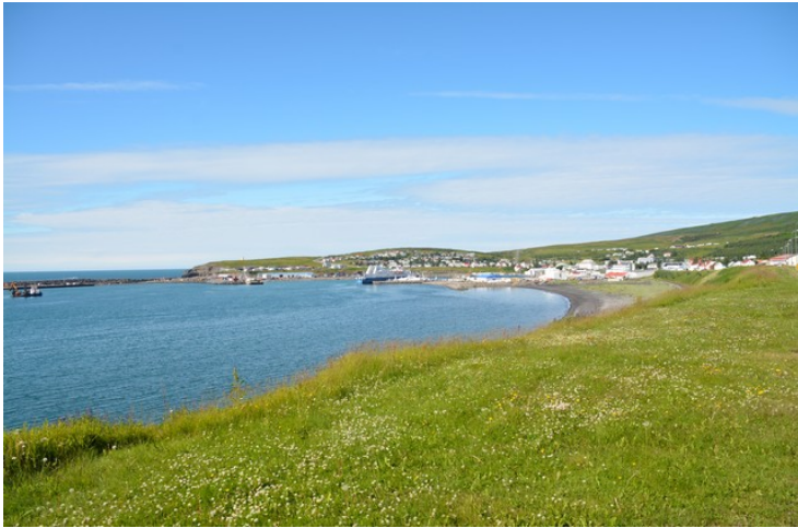
Then we drive south again.