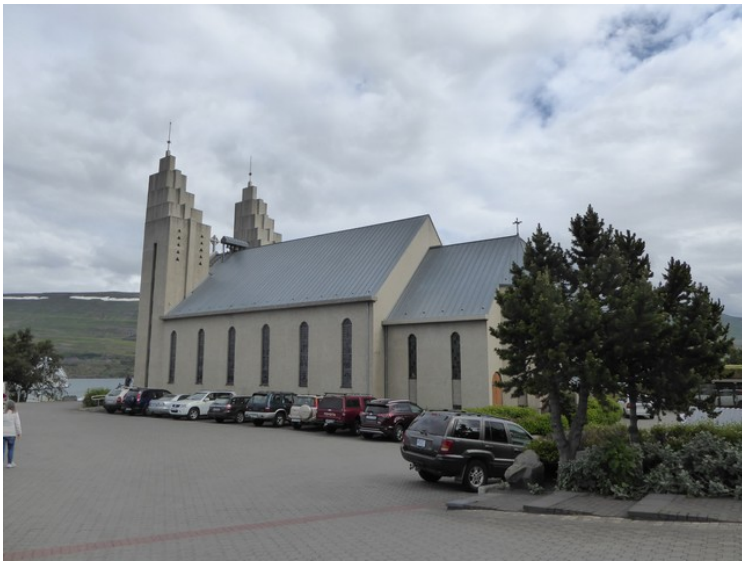
This is Akureyri church .