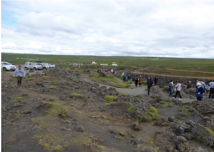
There were quite a few tourists at the waterfall.