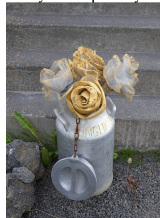
As we walked from the restaurant, we noticed this old milk can with artificial flowers.