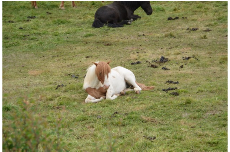
Then there was many horse photos.