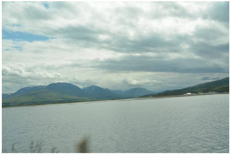
We head north on the east side of the bay.