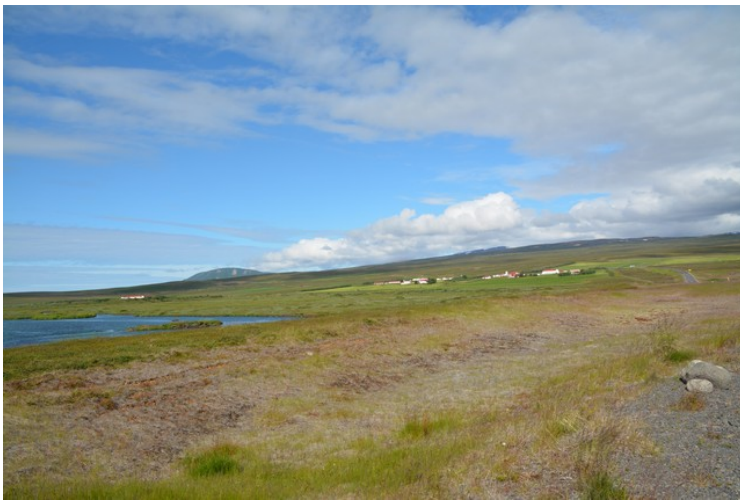
Some pictures from the area where Laxá flows into the sea.