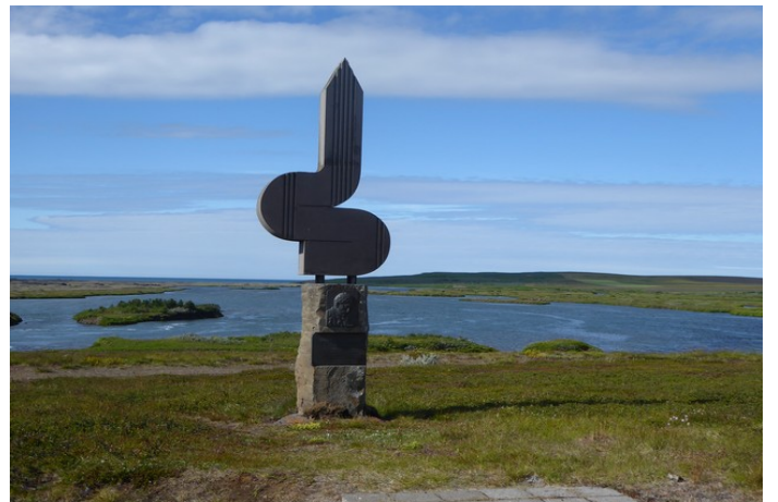
South of the town is a bay called Skjálfandi . Approximately where the river Laxá goes into the bay, this monument is standing.