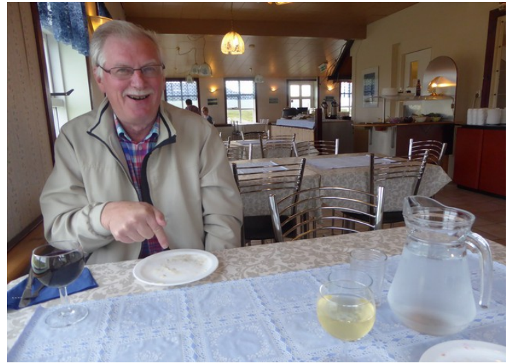
So funny. I ate up all my food.