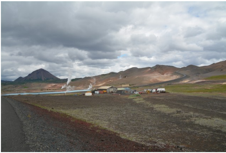
The area is called Bjarnarflag .