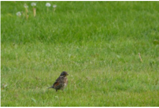
Later in the evening there were several birds that had an evening meal in the grass outside our apartment.