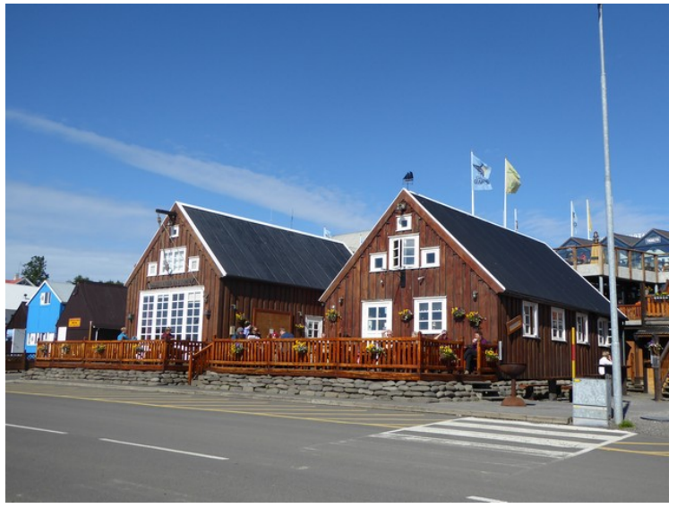
Gamli Baukur restaurant.