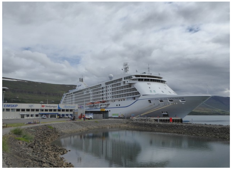
This is Akureyri . A cruise ship is in port.