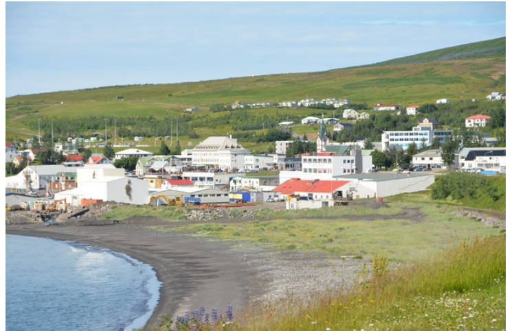
We took some pictures of the city from the south.