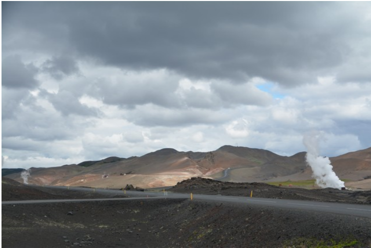
It is hot steam that rises in many places.