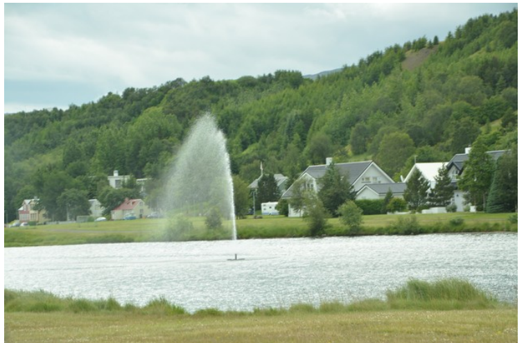
A fountain on the outskirts of town.