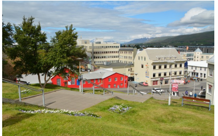
The church stands on top of a small hill with this view.