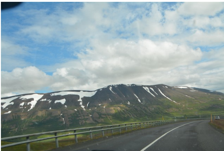
Then the road turn east into the country.