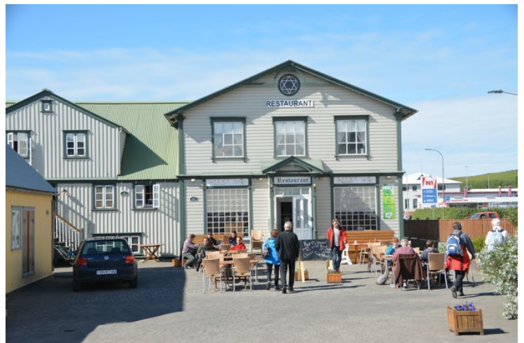
Salka restaurant .