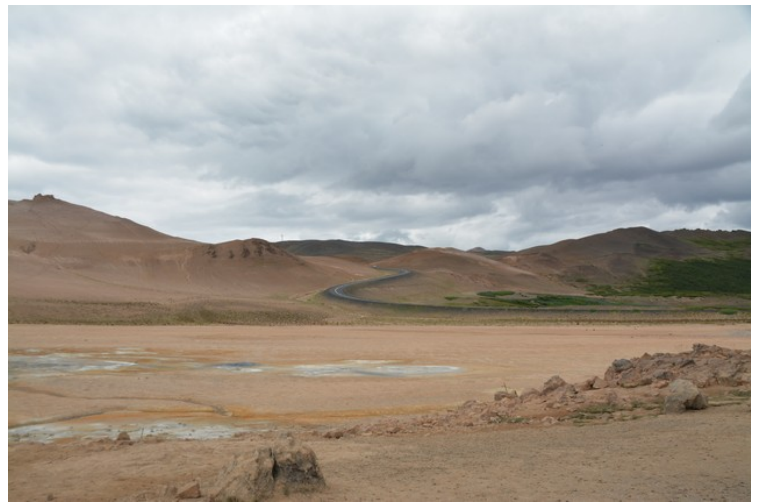
This is another geothermal active area.