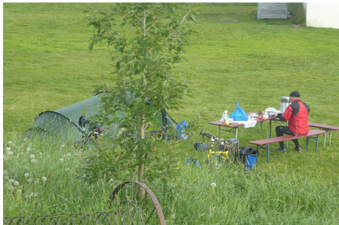
While we ate, we looked at those campers who pitched tents at the campsite.