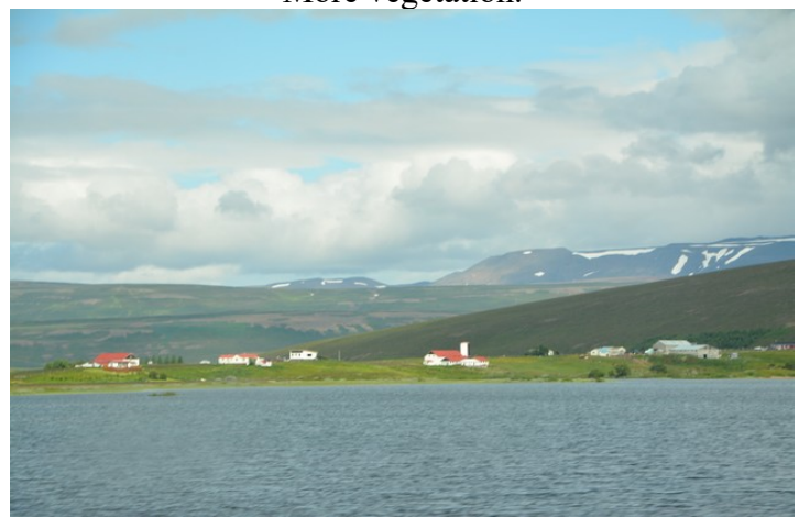
From Goðafoss we continued towards Húsavík .