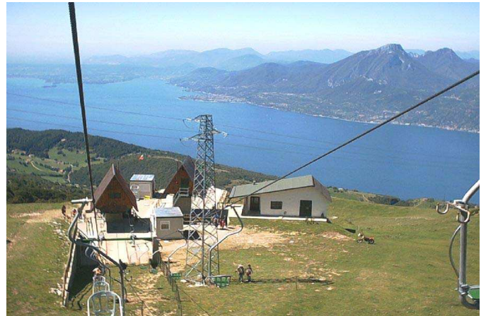
The last day we went for a walk up in the mountain to a place called Prada. There was a chair lift from Prada up to the top of Monte Baldo. It was so foggy up there that we didn't go up.