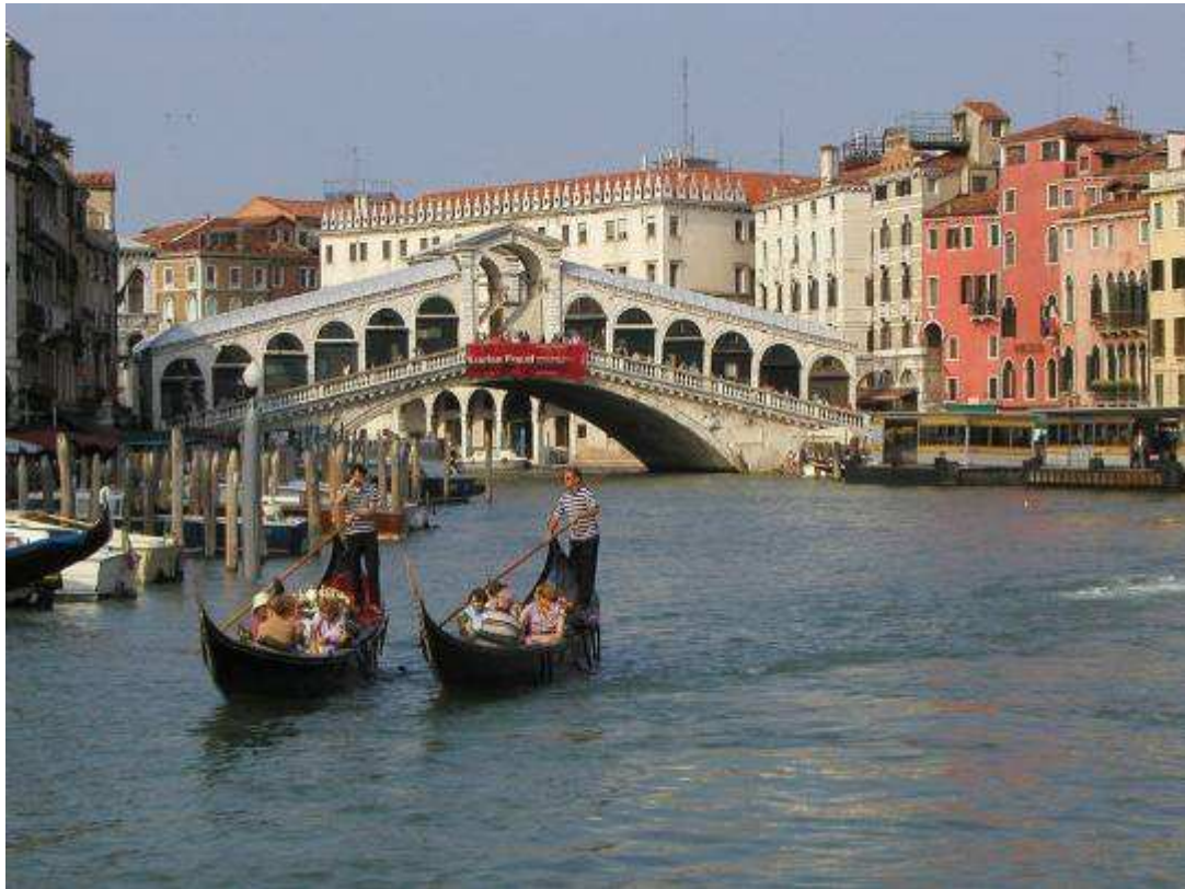
The biggest bridge is the Rialto Bridge