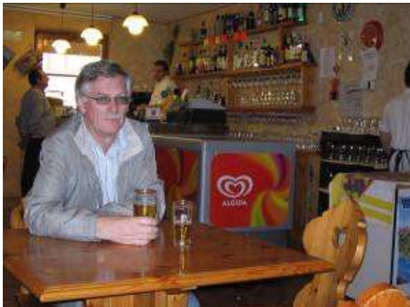
There was an open restaurant up there, where we had a beer before we went down again.