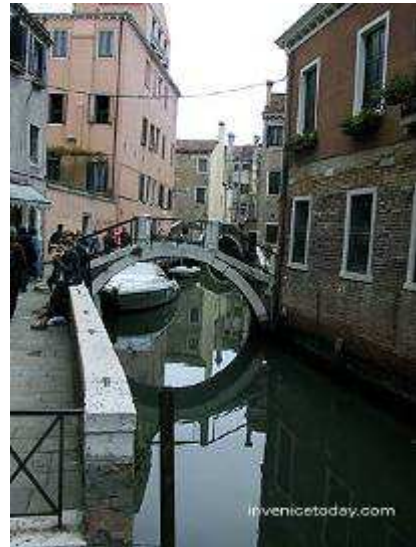
More channels and bridges