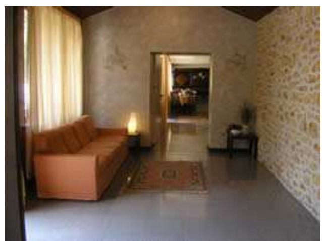
The reception seen from two different angles