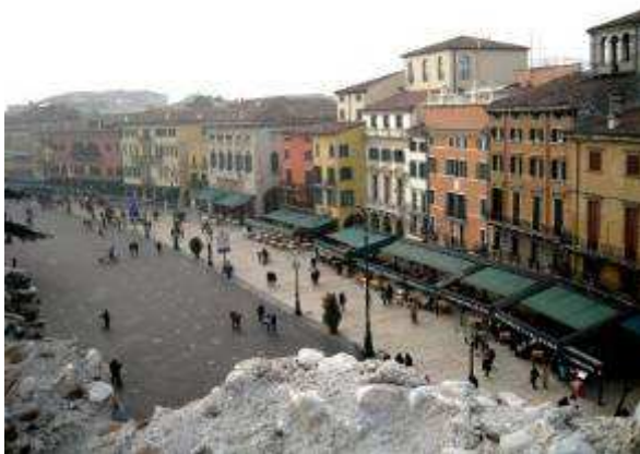
We ate at one of these restaurants

Then we were taken into the center of Verona where we got a free lunch on one of the restaurant lying right besides an old Roman arena, which is from year 30 and is the third largest in Italy.