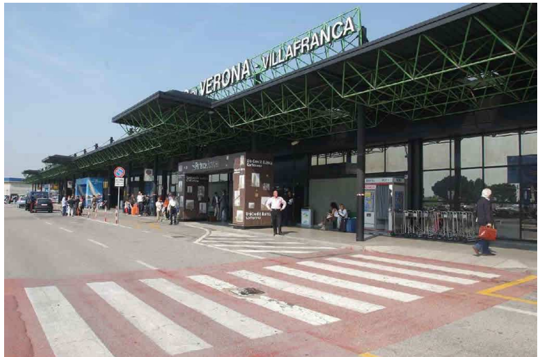
A picture from the airport in Verona

We went by a plane, which was chartered by Nytt&Nyttig. The trip took about 3 hours.