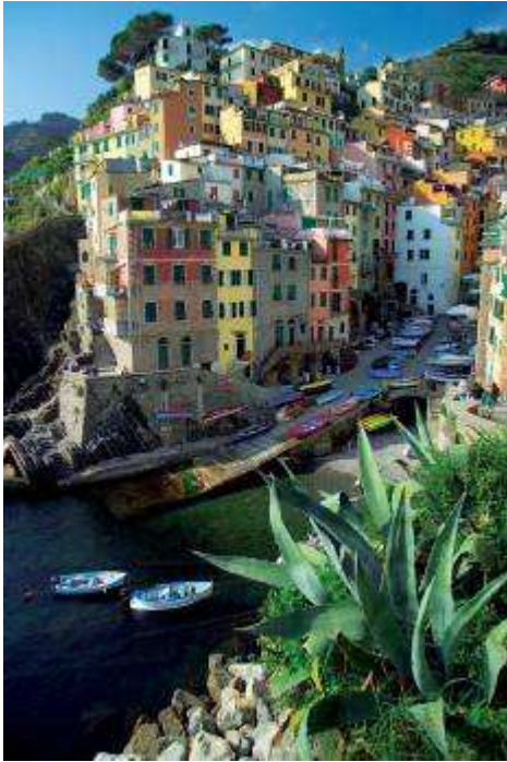
This is the southernmost city in Cinque Terre. Its name is Riomaggiore