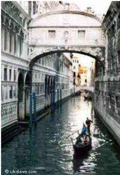
This is the Bridge of sighs