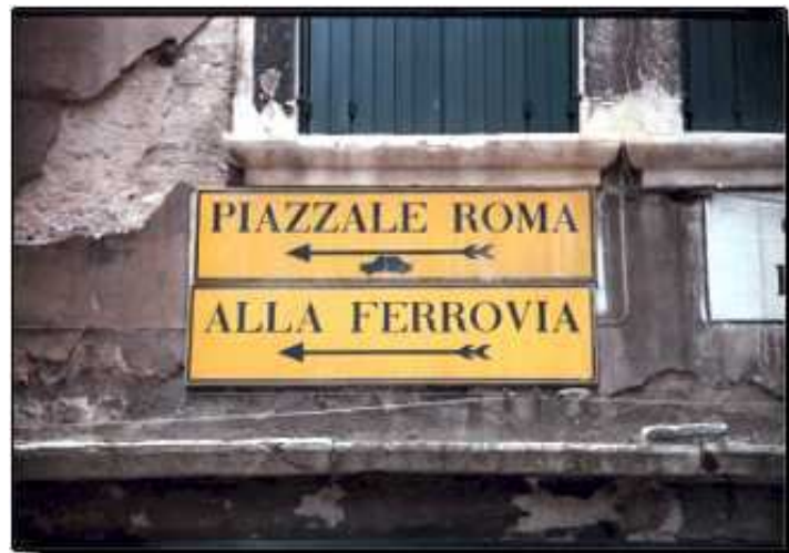
It was simple to find the way around. There were signs all over