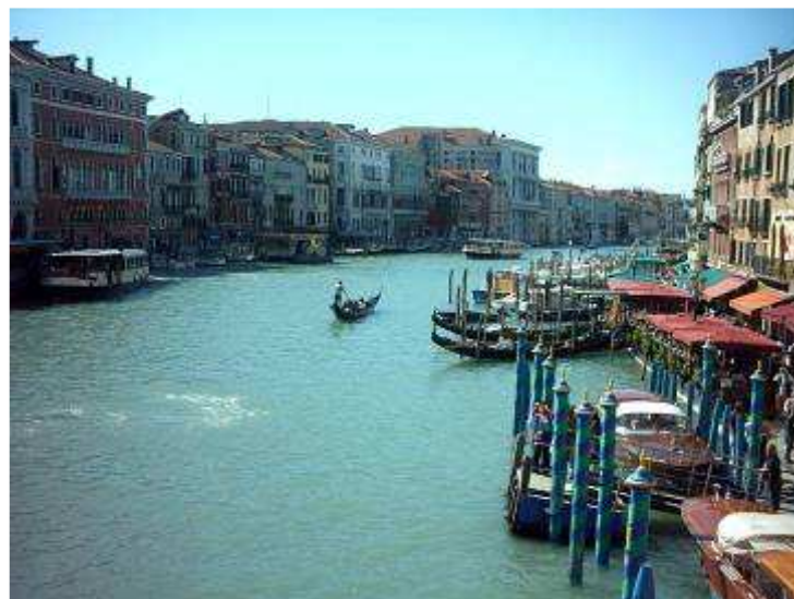
View from the Rialto Bridge along Canal Grande, the biggest and longest channel