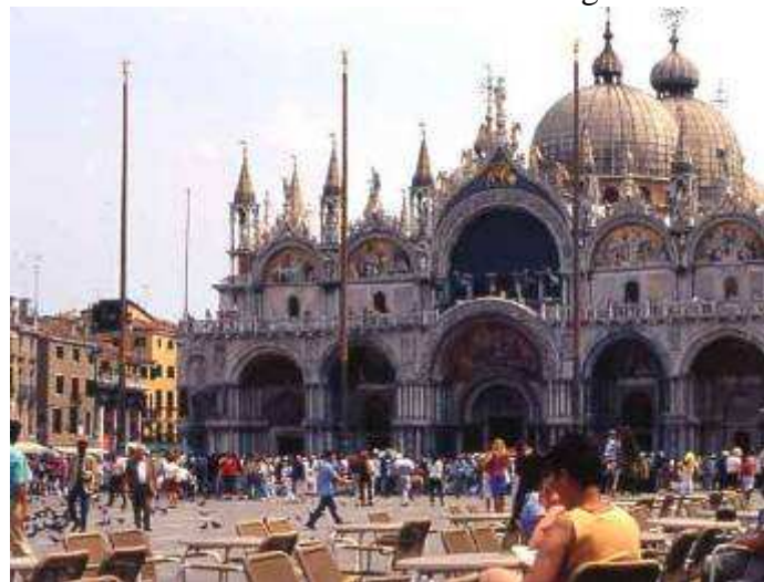
Here is one of the most known buildings in the center of the town, the San Marco cathedral.