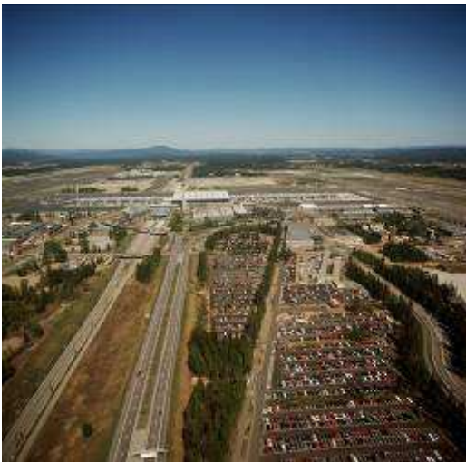
General view from Gardermoen

We went from Gardermoen and parked the car at Dalen Parking as usual.