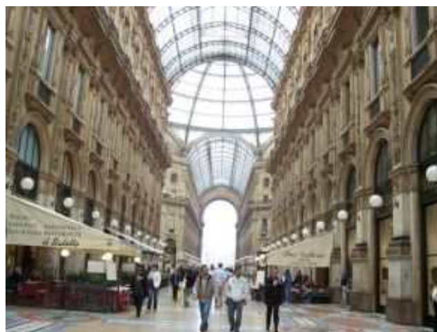
Inside the gallery

The next day we went to Venice. This is a special town, which lies on various island and the height over sea level is about. At high tide the streets are flooded. There are a lot of channels in between, 150 channels and 400 bridges.