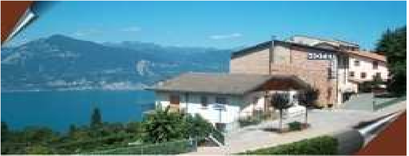
The hotel seen from outside