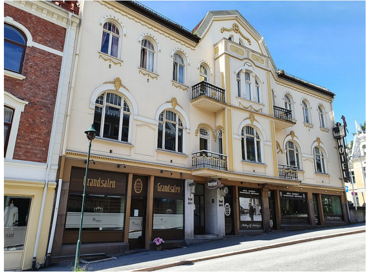
The Grand Hotel dates from 1809 when a small guesthouse was opened here. It was enlarged later and today it has a total of 50 rooms.