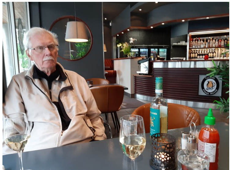
Here we have got white wine and wait for the starter.