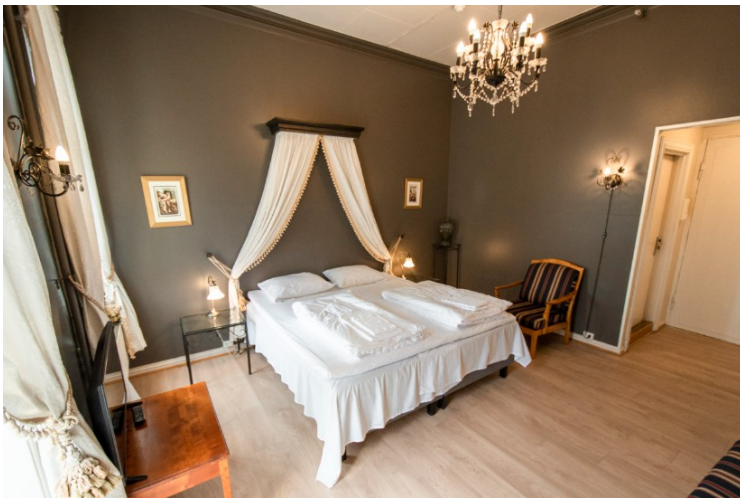
The room looked like this.