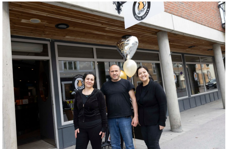
When we had checked into the hotel, we went straight down the street to have dinner at a restaurant called Turkish Steakhouse . This picture was in Ringerikes Blad when the restaurant opened.