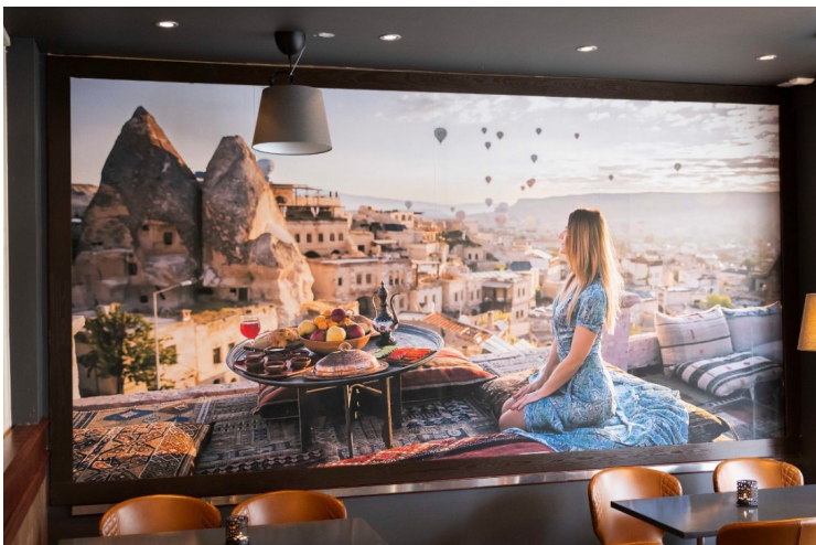
At the end wall of the restaurant there is a large mural with motifs from Turkey.