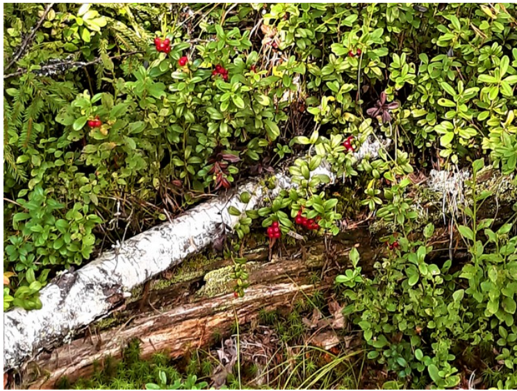
More cranberry heather.