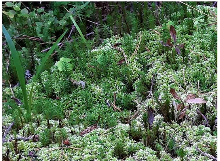
Moss and lichen.