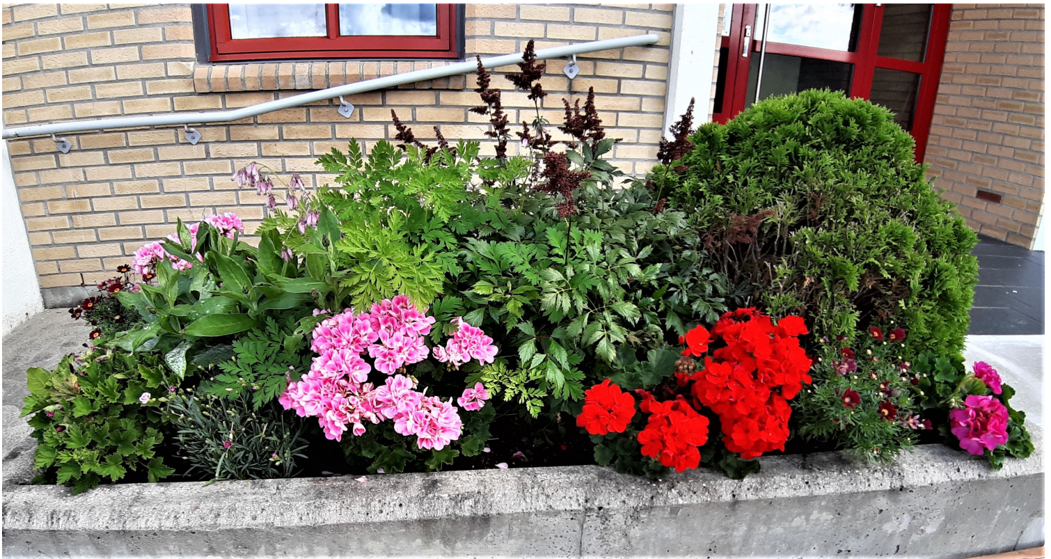
The flower box outside our entrance.