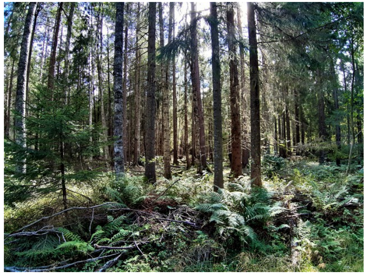
There should be mushrooms here.