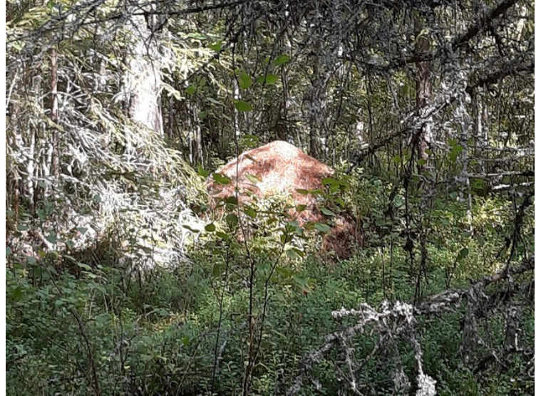
Old spruce forest.

We did not see terrain for mushrooms until we approached Holsætra. There we parked the car and walked some distance into the forest.